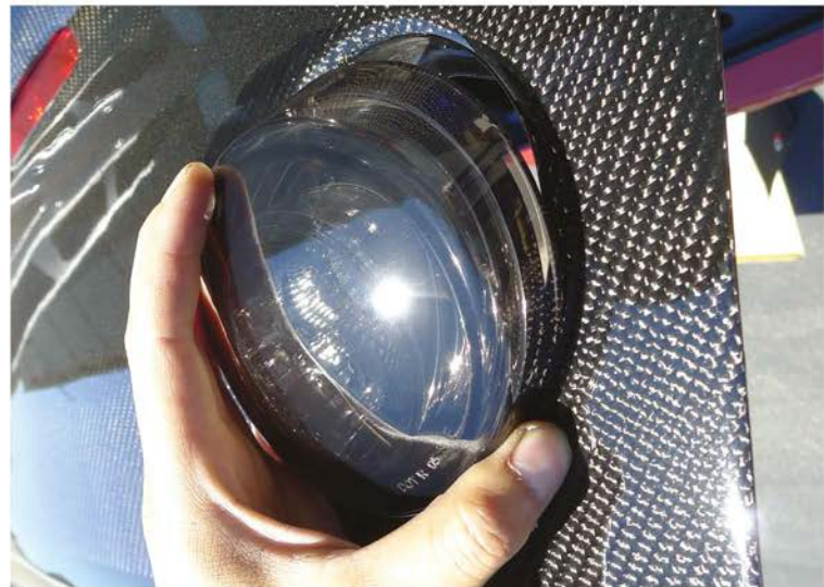
16. Place the new reverselight housing into the position