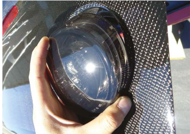
16. Place the new reverselight housing into the position