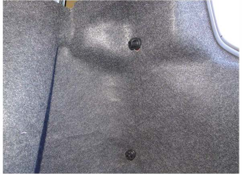
2. Thumb screws location