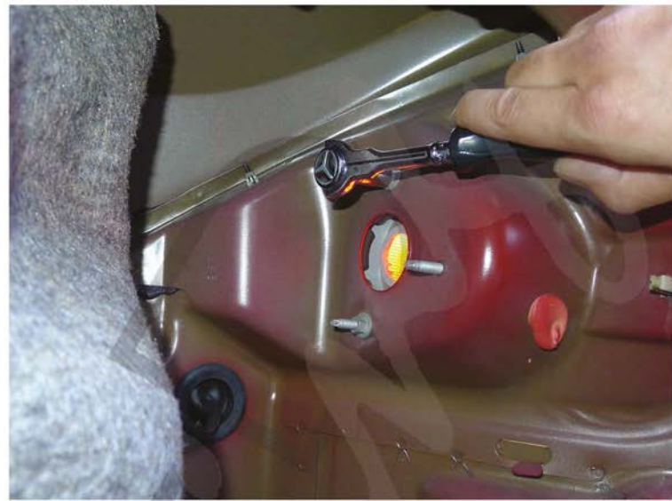
6. Remove the (3) 10mm nuts