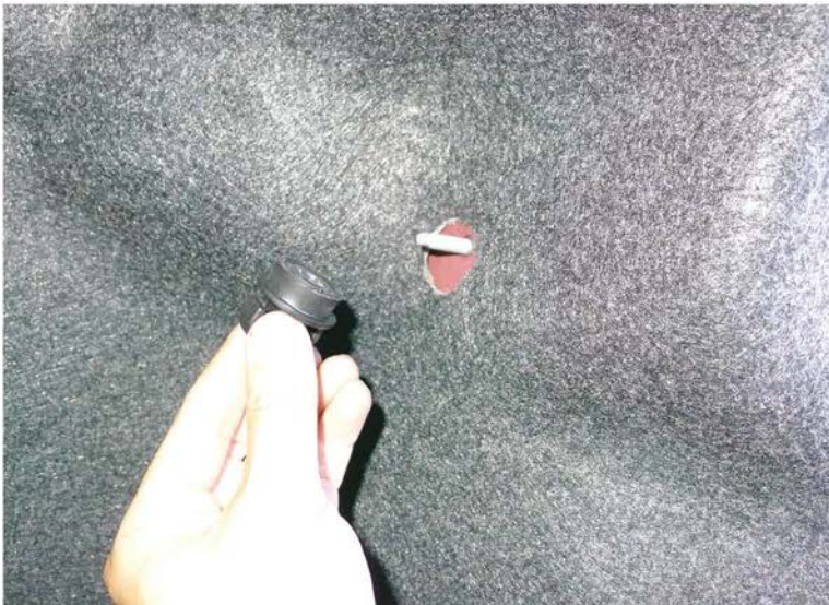
3. Remove the thumb screws