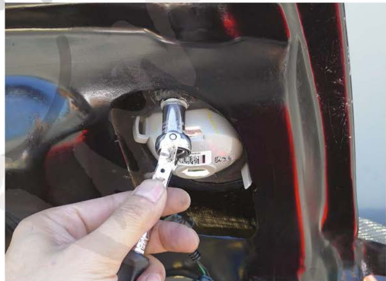
18. Remove the (2) 11mm nuts