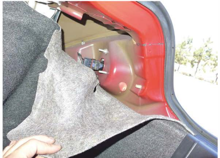
4. Peel back the trunk liner