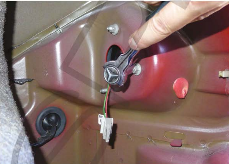
9. Tighten the (3) 10mm nuts