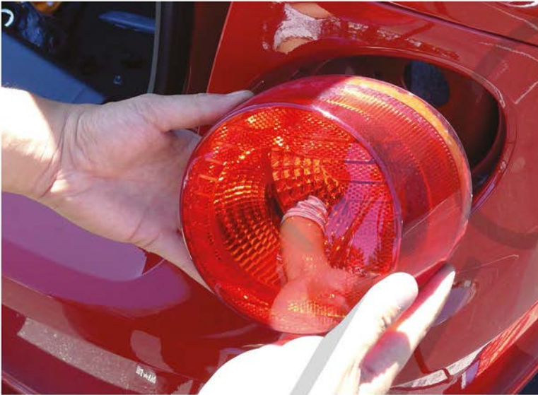
7. Remove the factory taillight