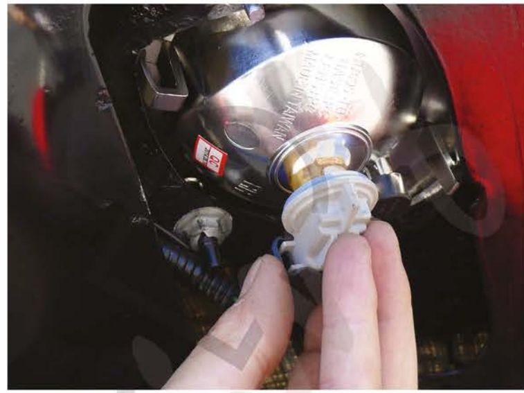
18. Install the reverse light socket Please repeat the steps from 1 to 18 for the opposite side