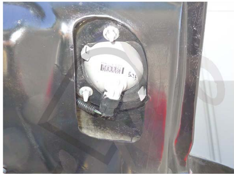
12. Reverse the light location