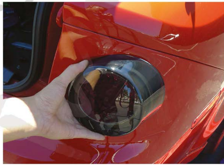
8. Place the LED taillight into position