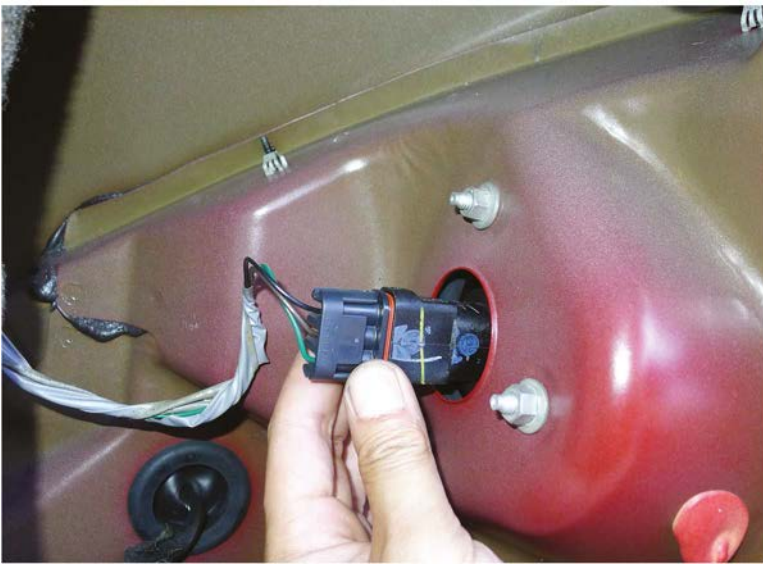
11. Install the taillight socket