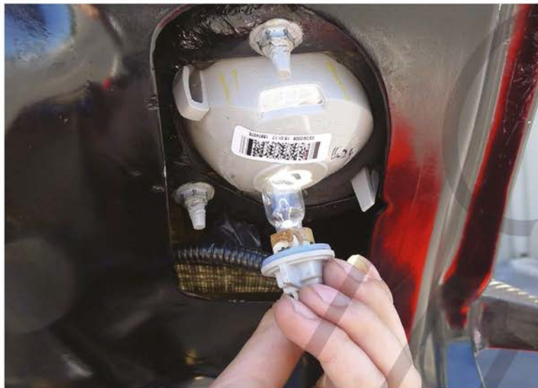
13. Remove the reverse light socket