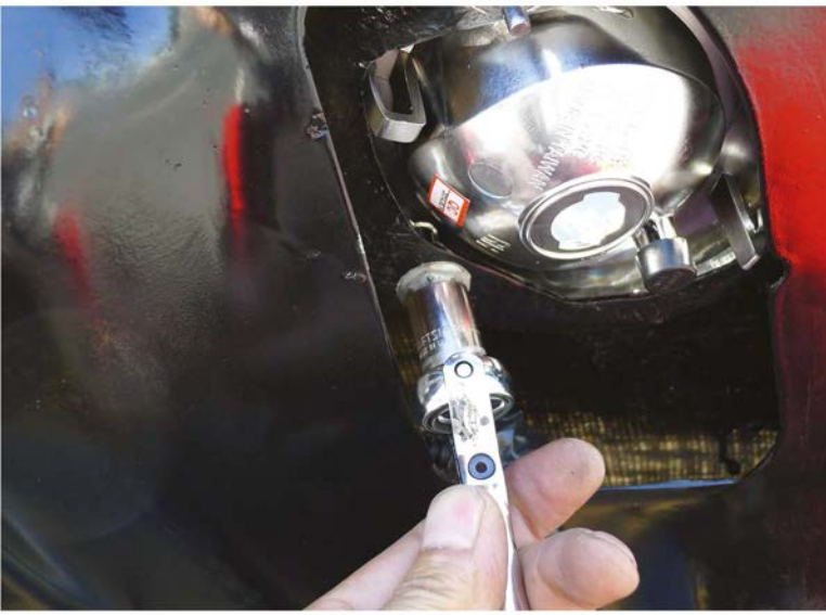
17. Tighten the (2) 11mm nuts