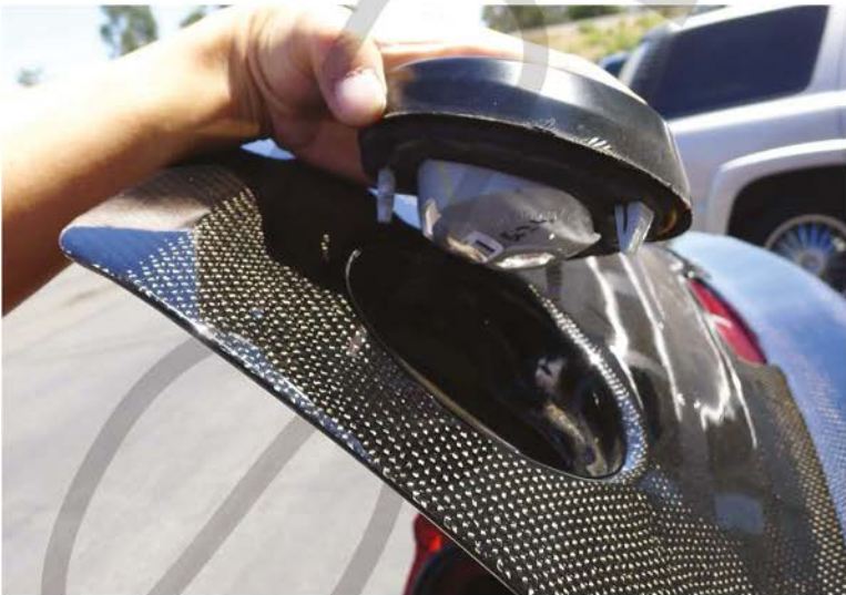
15. Remove the factory reverse light from the trunk lid