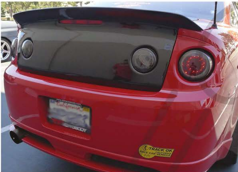
17. The installation now is complete