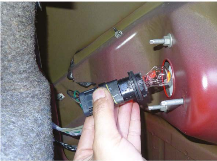
5. Remove the taillight socket