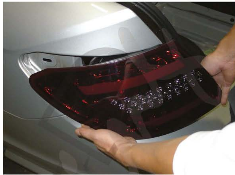
18. Place the LED taillight in the stock location