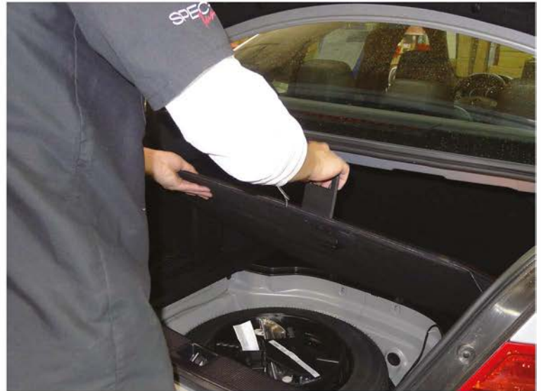
2. Lift trunk floor