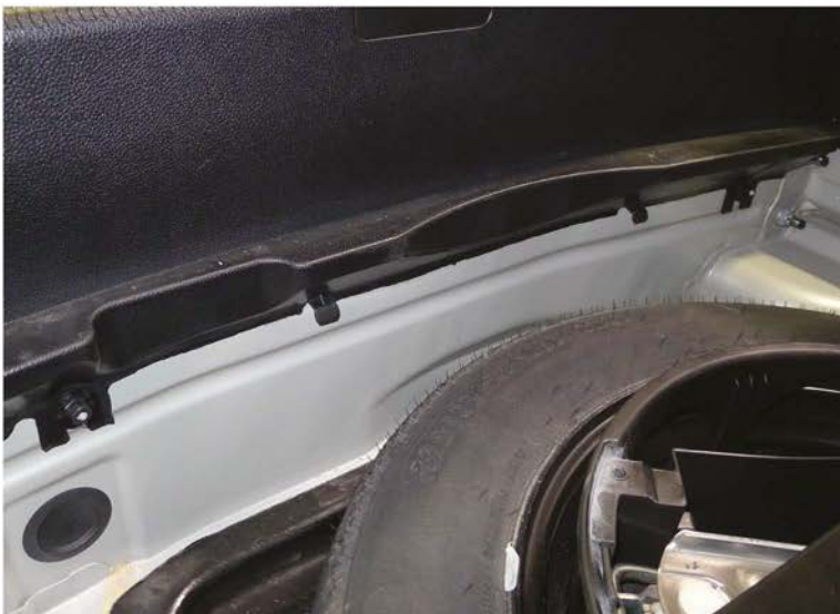
3. (2) 10mm plastic nut location