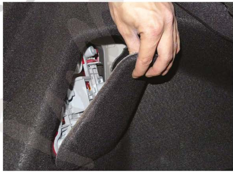
8. Remove the access hole over