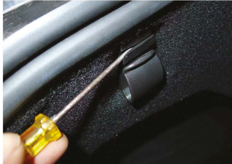
10. Remove the plastic hook retaining pin