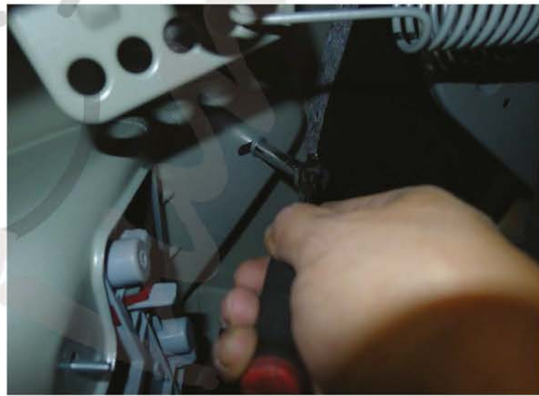
20. Tighten the (4) 8mm nuts