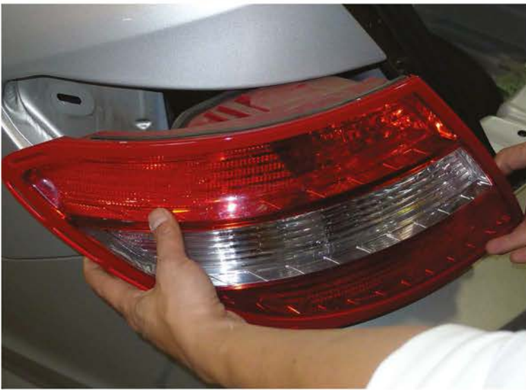
17. Remove the factory taillight