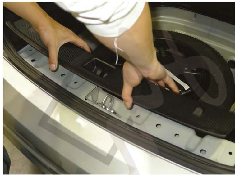
24. Replace the plastic trim