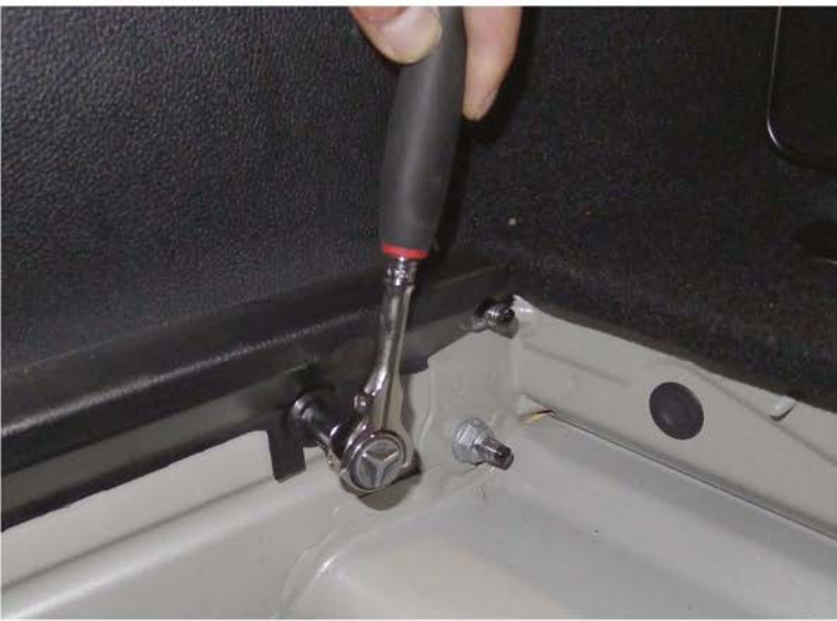
5. Remove the (2) 10mm plastic nuts