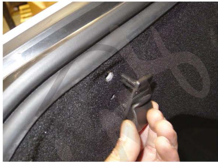
12. Remove the plastic hook