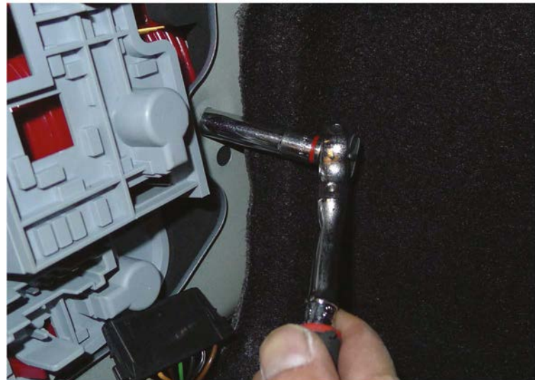
16. Remove the (3) 8mm nuts