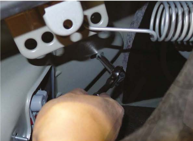
13. Remove the 8mm nut