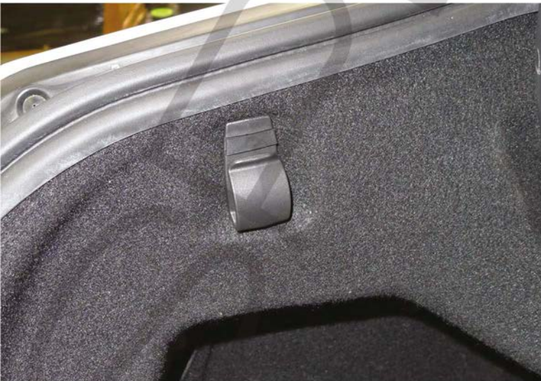
9. Plastic hook location