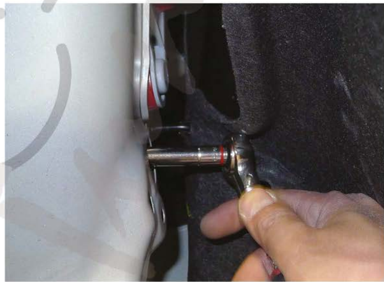
14. Remove the (3) 8mm nuts