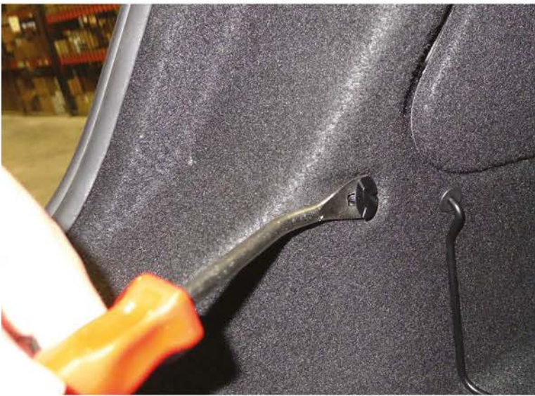
23. Replace the plastic clip