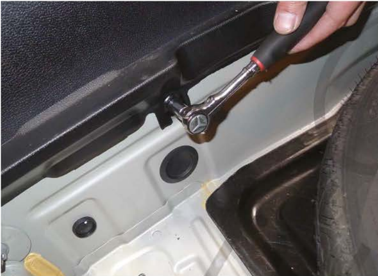
25. Tighten the (2) 10mm plastic nuts Please repeat the steps from 1 to 25 for the opposite side