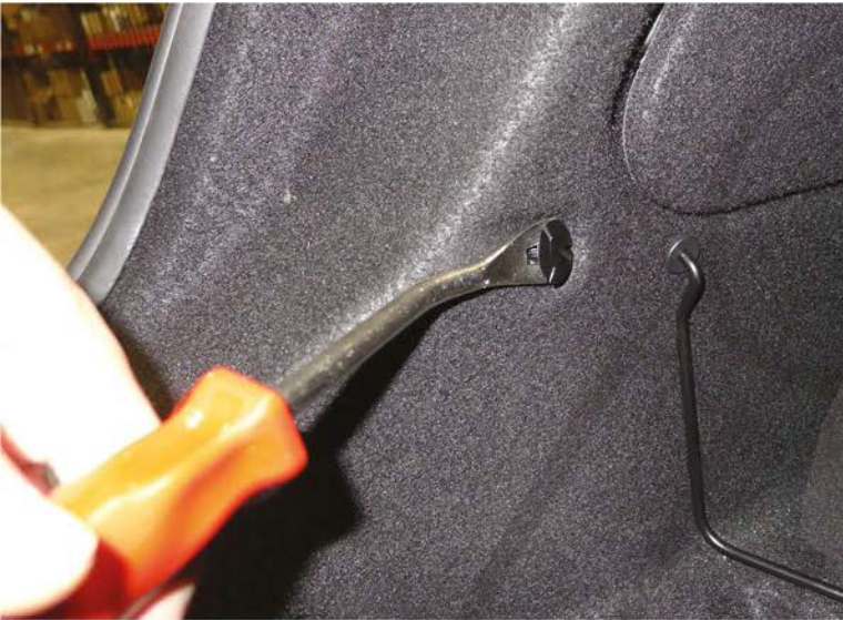
7. Remove the plastic clip