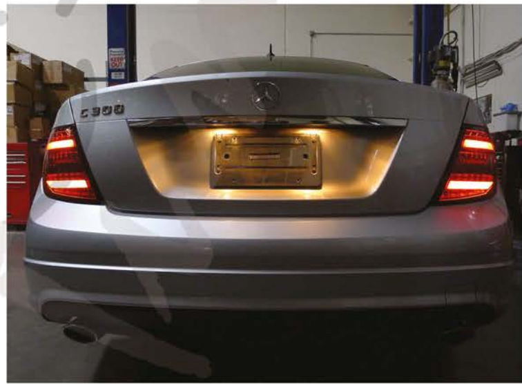
26. The installation now is complete