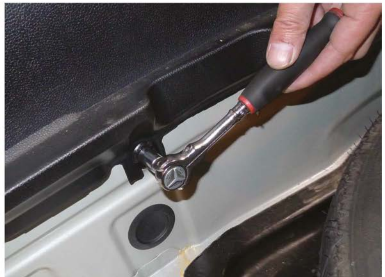
4. Remove (2) 10mm plastic nuts