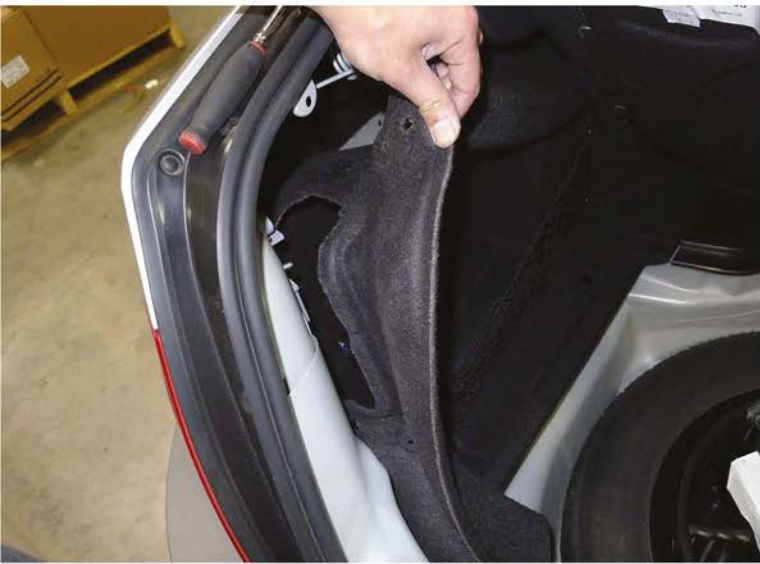
11. Pull the trunk liner aside