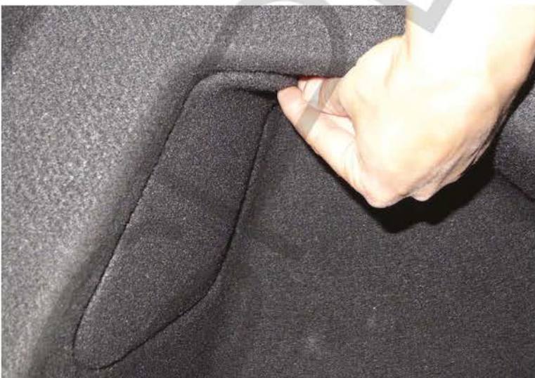
21. Replace the access hole cover