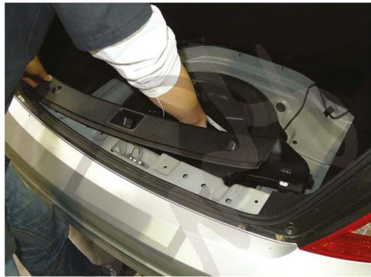
6. Pull up to remove the plastic trim