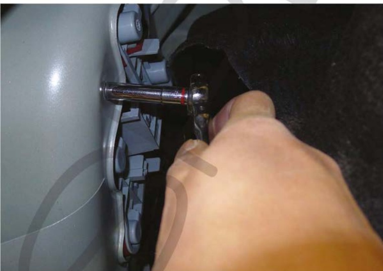
15. Remove the (3) 8mm nuts