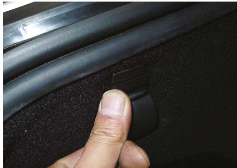
22. Replace the plastic hook and retaining pin