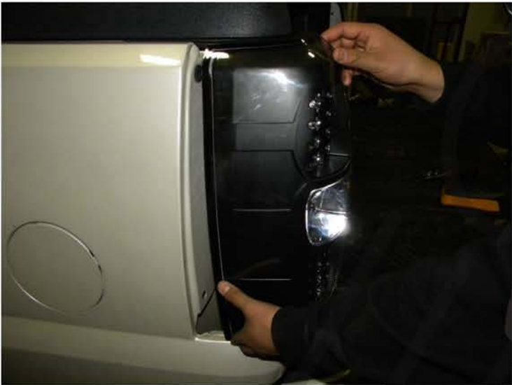
7. Place the LED tail light into stock location