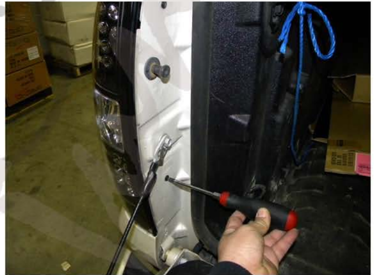
8. Tighten the (2) phillips head screws