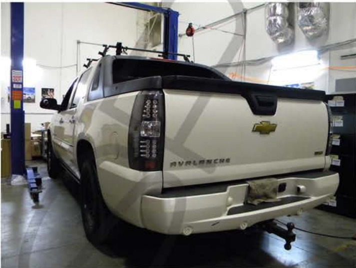
9. Please repeat the steps in order from 1 to 8 for the opposite side The installation is now complete