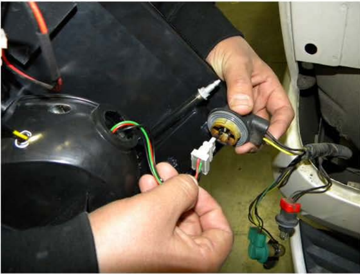
5. Plug in the LED tail light into the brake light socket please see the " L.E.D. tail lights installation instructions" If your tail lights don't have L.E.D. you can skip the installation instructions.