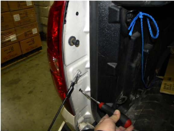
1. Remove the (2) phillips head screws

Do not make direct contact with the halogen bulbs or the wire assembly until the unit has cooled down after use.