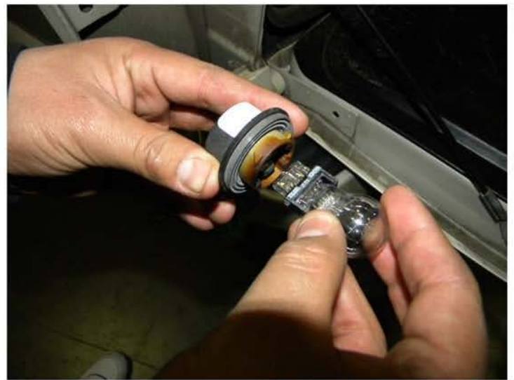
4. Remove the brake lightbulbs