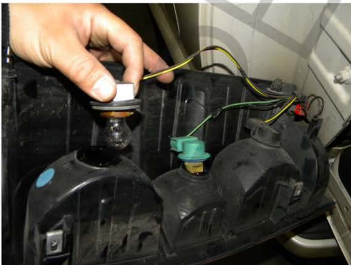
3. Remove the tail light sockets from the tail light