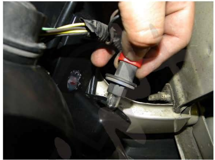
6. Plug in the tail light sockets into the LED tail light