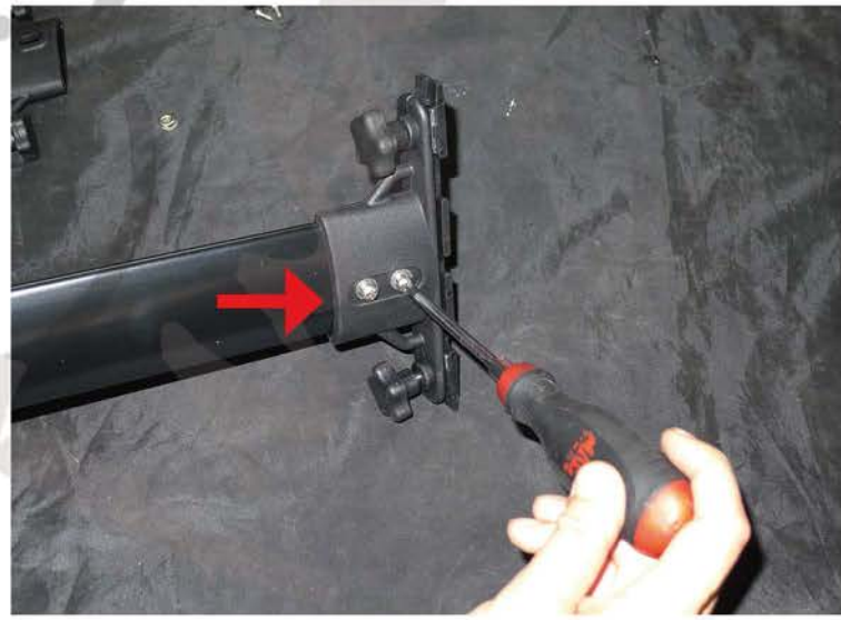
8. Secure the right side support with the (2) phillips screws