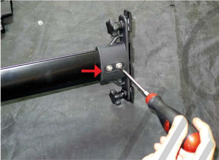
7. Secure the right side support with the (2) phillips screws