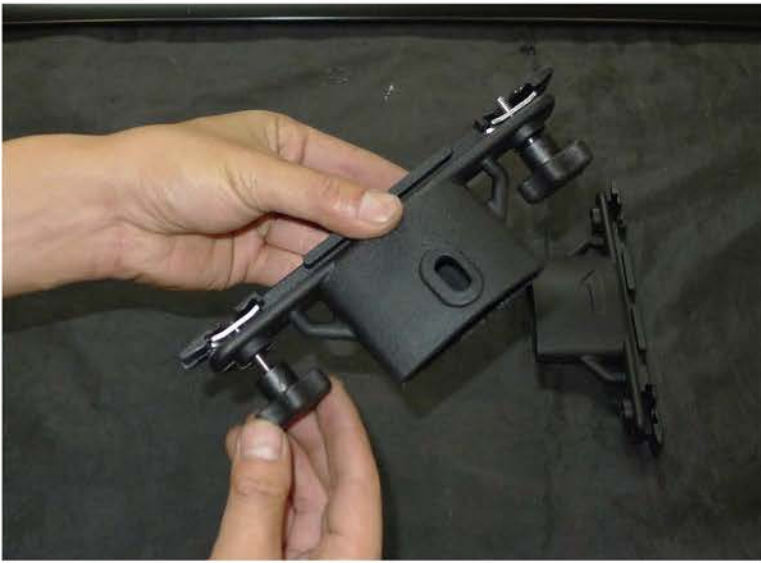
5. Install the thumb screws