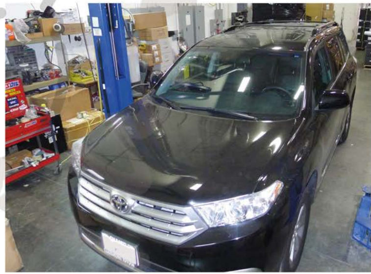
20. The installation now is complete