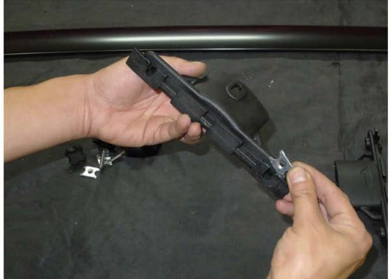
4. Place the nut into the crossrail support slot