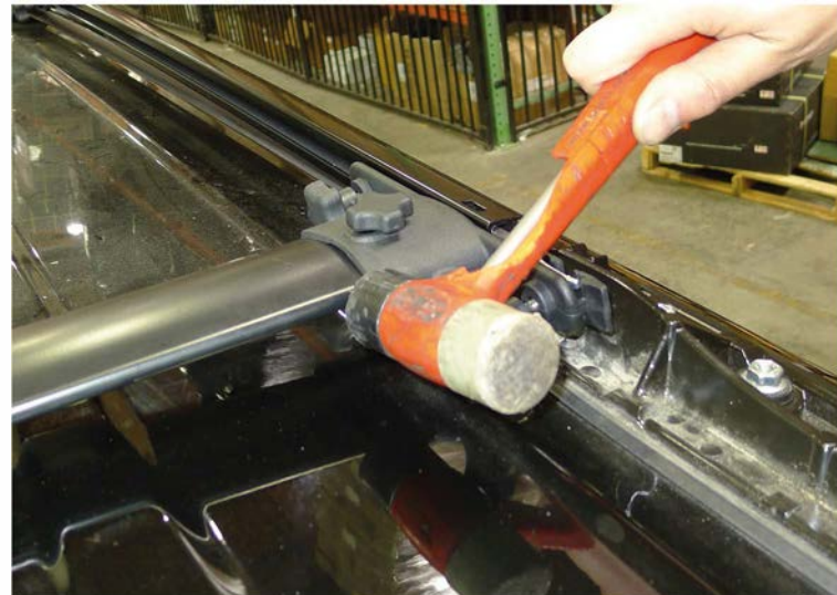
16. Tap crossrail into position with the mallet