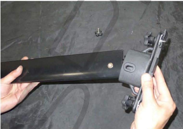
9. Place the left side support over rail