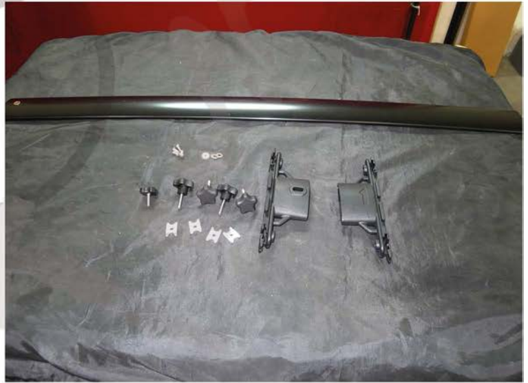
2. Assemble crossrail components