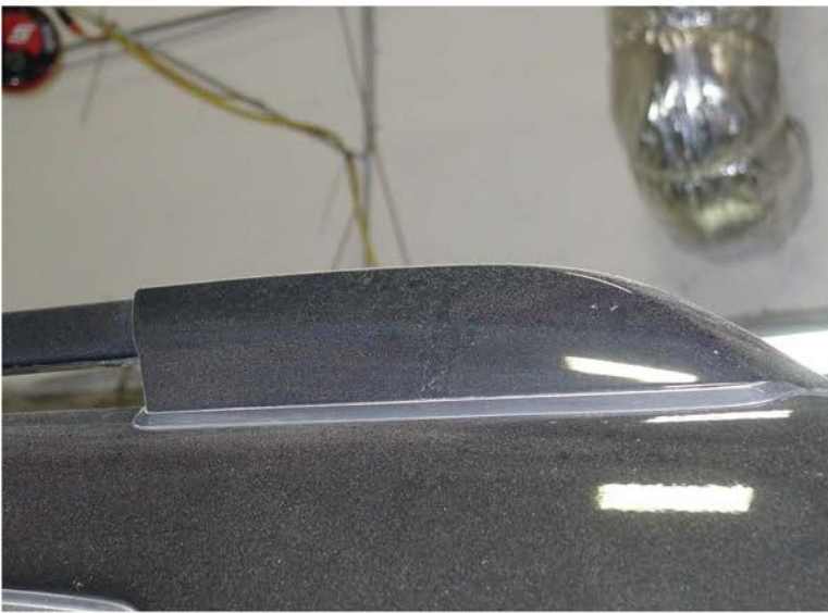
11. Roof rack support cover