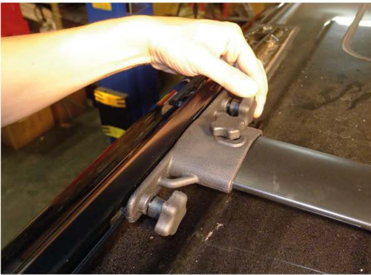
17. Tighten and secure with thumb screws