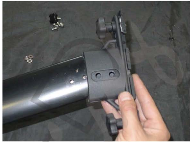
6. Slide the right side support over rail