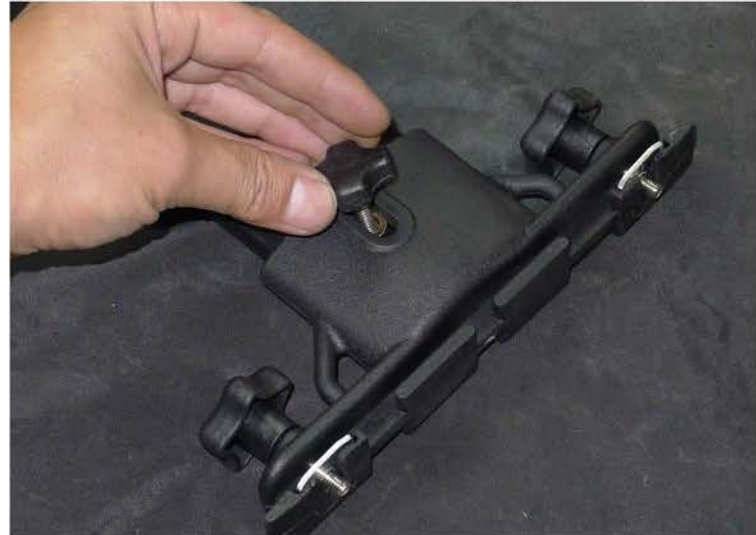
10. Secure the left support with the small thumb screw