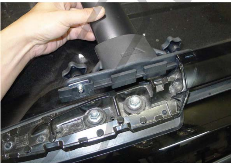
15. Slide cross rail supports into the roof rack