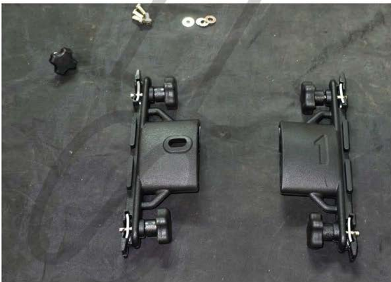
3. Right and left side support