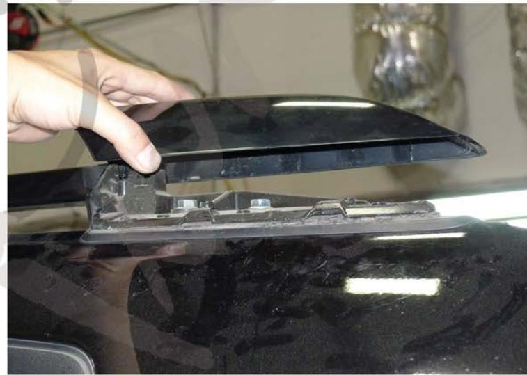
14. Remove the roof rack support cover