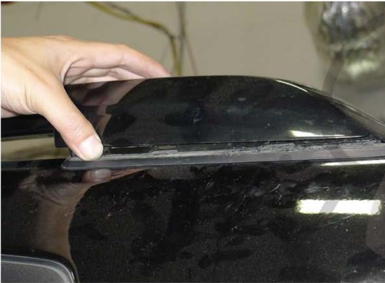
19. Replace the roof rack support covers