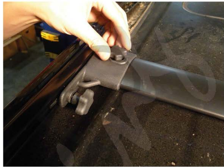
18. Tighten and secure with thumb screws