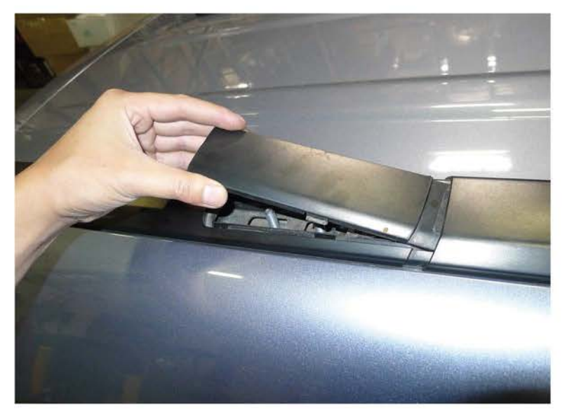
5. Pull back and remove the plastic cover