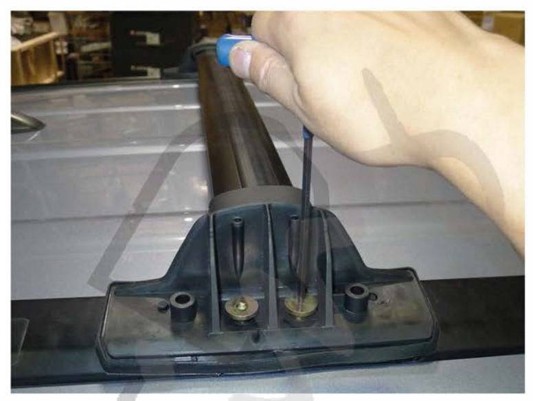
12. Line up the mounting holes then secure roof rack with the allen headed harndware