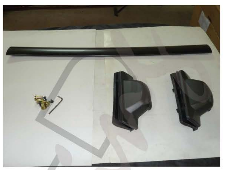
6. Roof rack parts