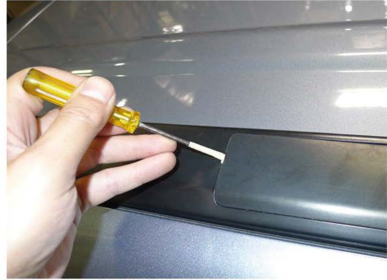
4. Remove the rear plastic cover