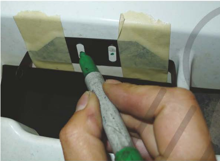
7. Mark the mounting hole location