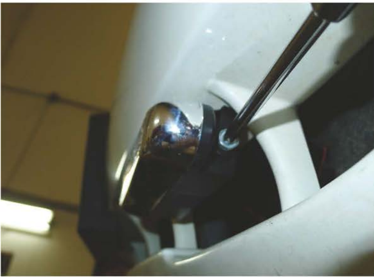
11. Secure the DLR to the mounting bracket