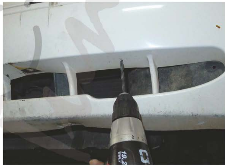
8. Drill mounting holes