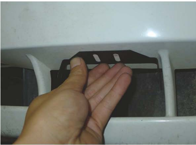
5. Place the mounting bracket onto the mounting surface