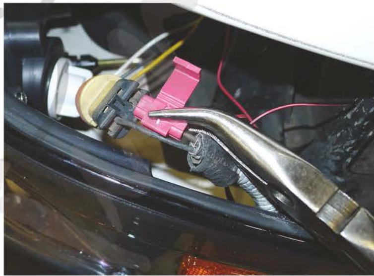
14. Connect the DRL wires to the 12v power wire