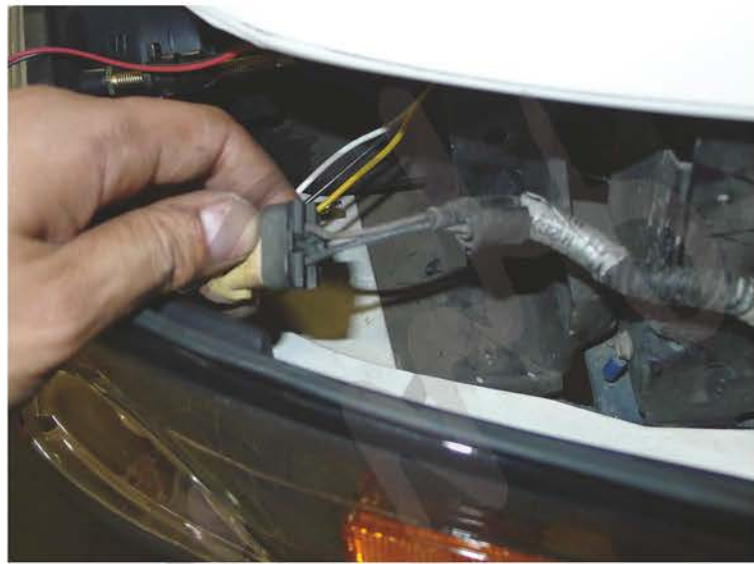
12. Locate suitable 12v power wire and negative wire