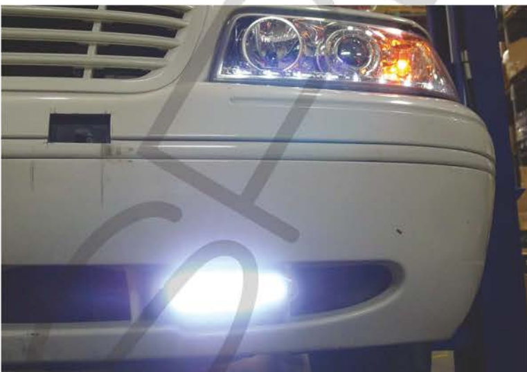
15. Check the DRL operation Please repeat the steps from 1 to 15 for the opposite side