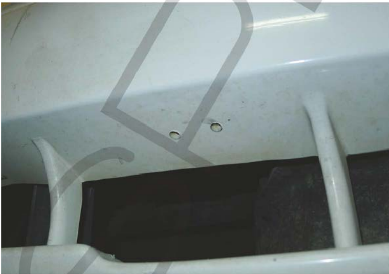
9. Mounting holes drilled