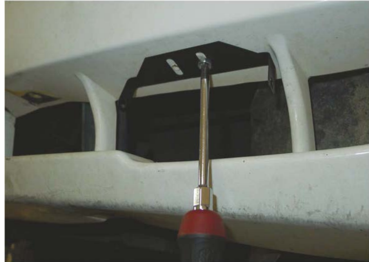
10. Secure the mounting bracket with the hardware