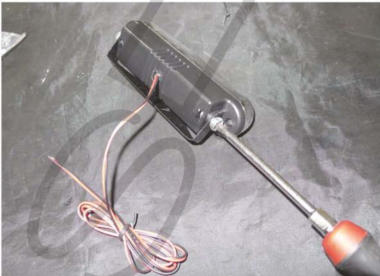
3. Remove the mounting bracket from the DRL assembly