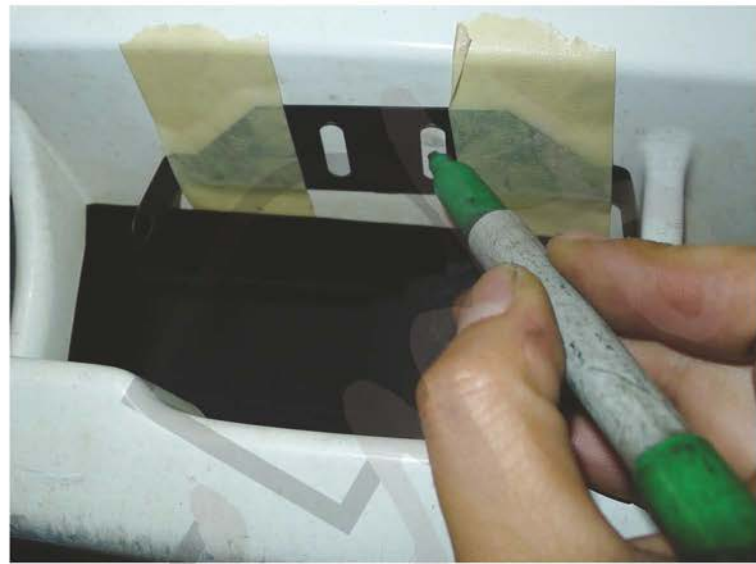
6. Mark the mounting hole location