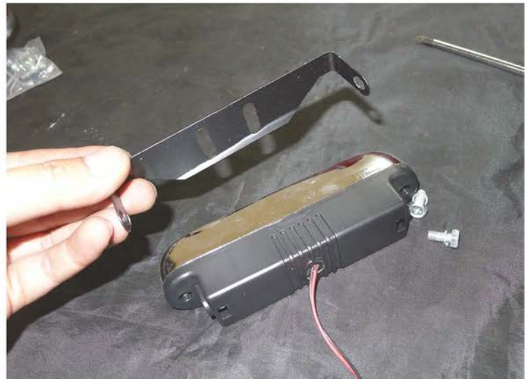
4. Remove the mounting bracket