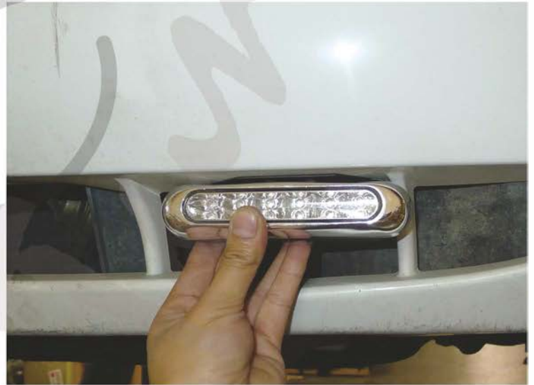
2. Locate suitable surface to the mount DRL