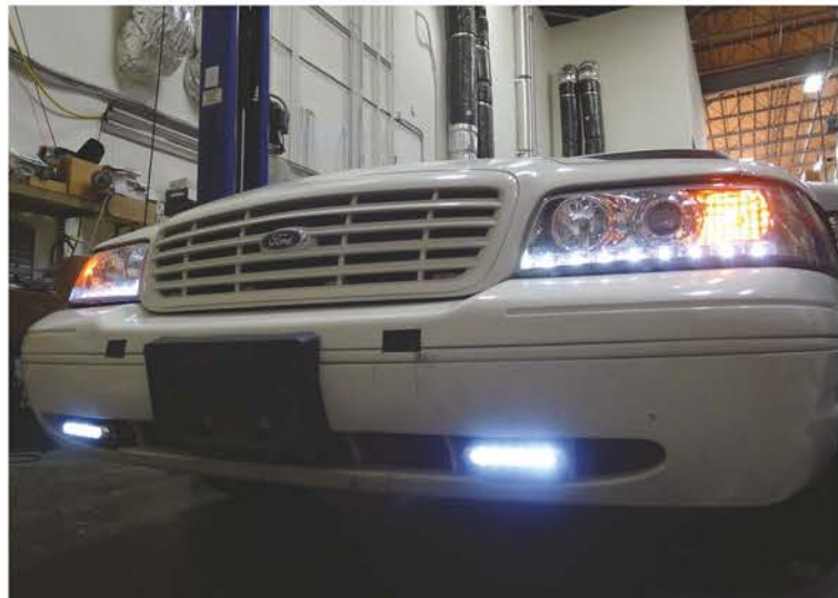
16 The Installation now is complete