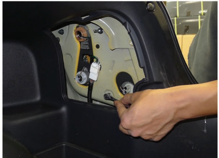
4. Remove the (3) 10mm nuts