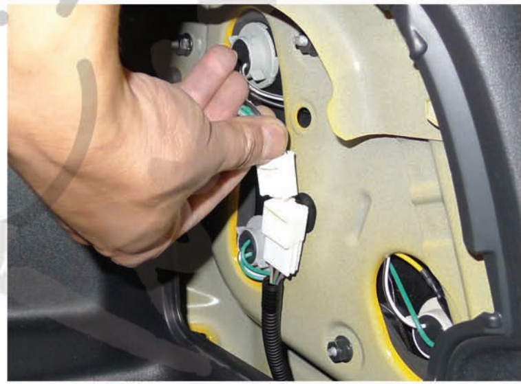
8. Connect the taillight harness

Please see the " L. E. D. tail lights installation instructions" If your tail lights don't have L. E. D. you can skip the installation instructions.