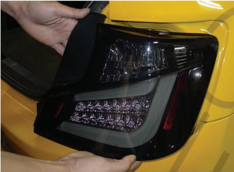
7. Place the LED taillight in the stock position