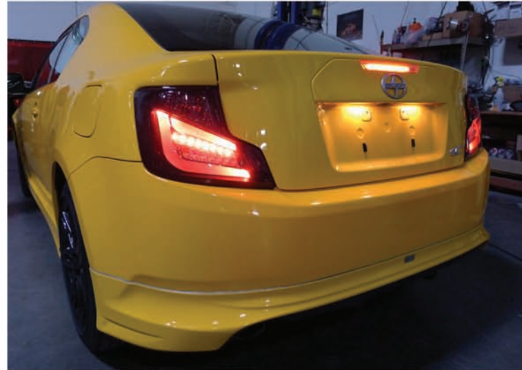
10. The installation now is complete Please repeat the steps in order from 1 to 9 for the opposite side.