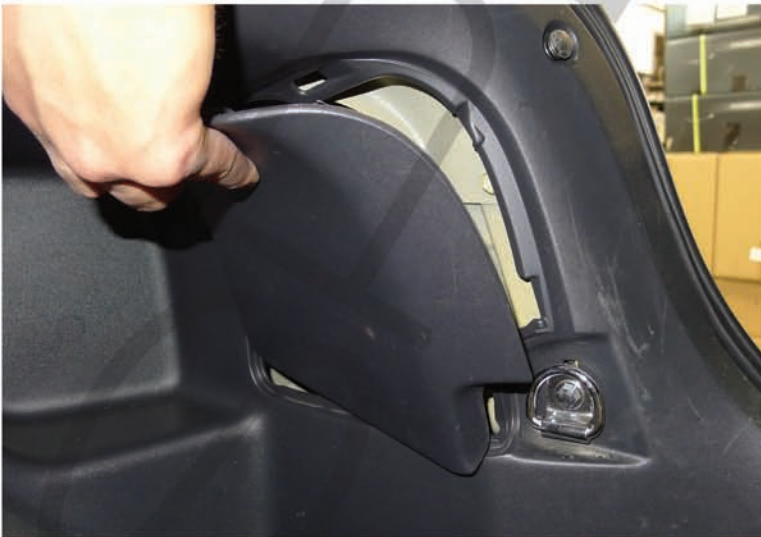
9. Replace the access hole cover.

Please see the " L. E. D. tail lights installation instructions" If your tail lights don't have L. E. D. you can skip the installation instructions.