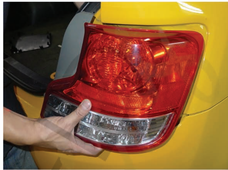
6 Remove the factory taillight