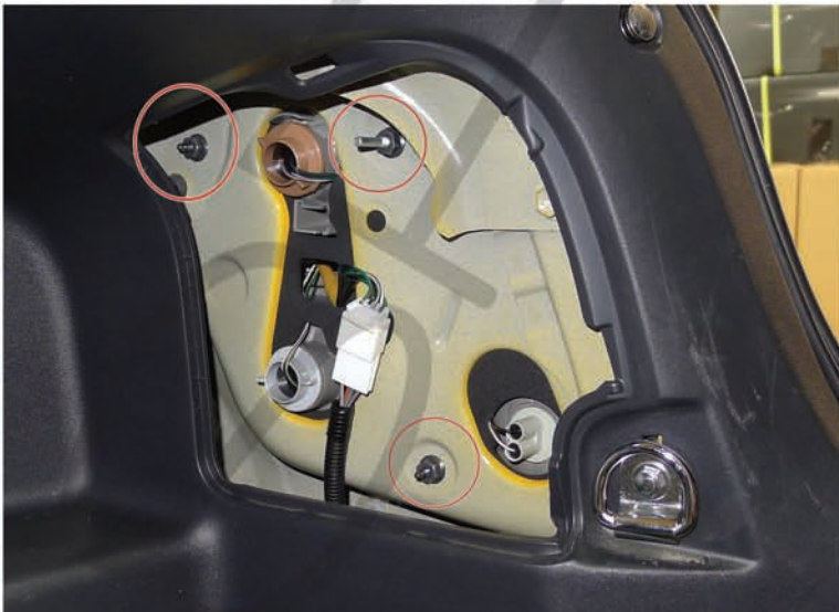
3. 10mm nuts location