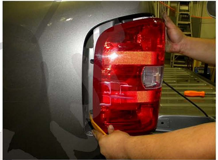
2. Remove the tail light