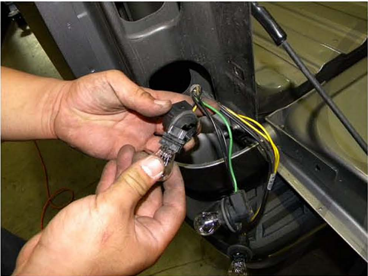
7. Remove (2) light bulbs from harness, brake, and signal lights