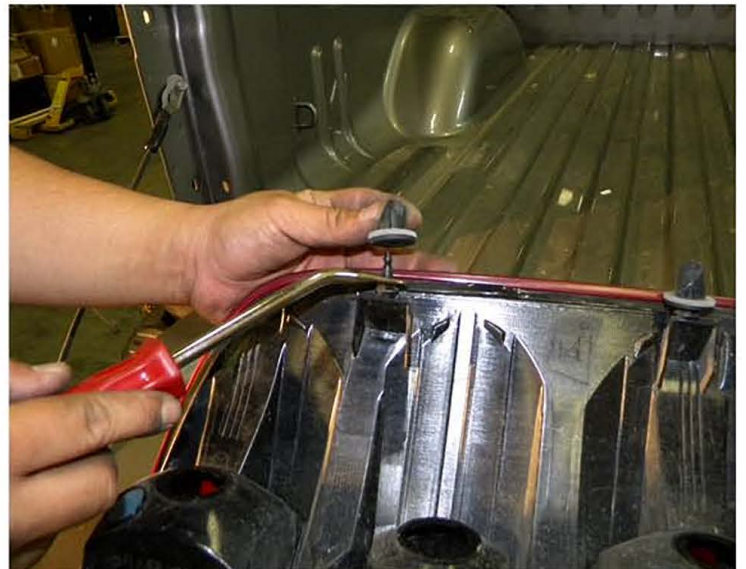
4. Remove the (2) plastic holders from the tail light