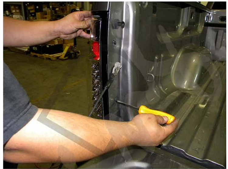
12. Replace the (2) phillips head screws