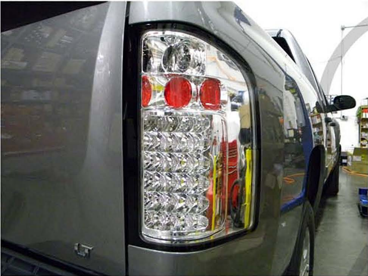
13. Please repeat the steps in order from 1 to 12 for the opposite side