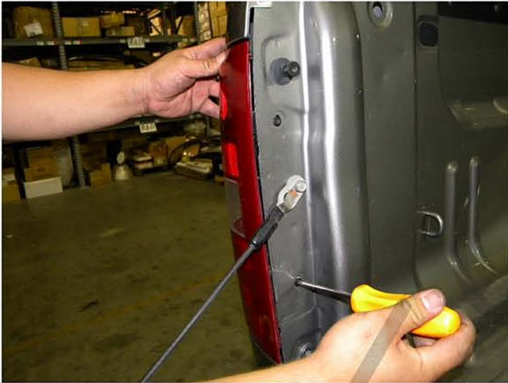
1. Remove the (2) Phillips head screws

Do not make direct contact with the halogen bulbs or the wire assembly until the unit has cooled down after use.