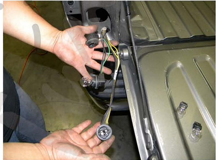
8. Tail light harness

please see the " L.E.D. tail lights installation instruction" If your tail lights don't have L.E.D. You can skip the installation instruction.