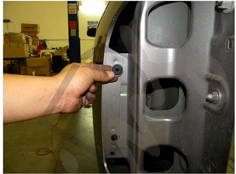
6. Replace the plastic holder onto the mounting holes