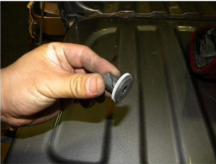
5. Plastic holder