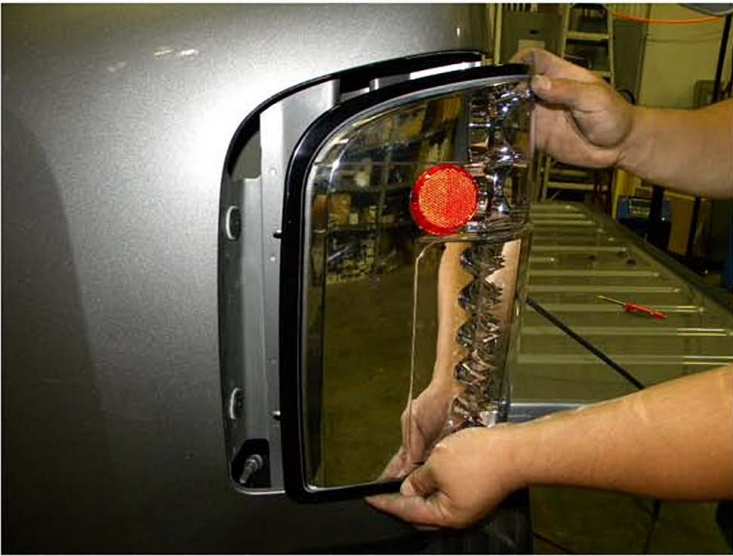
11. Place the LED tail light onto the vehicle