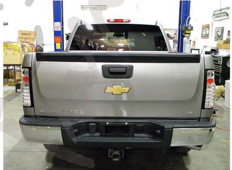
14. The installation is now complete