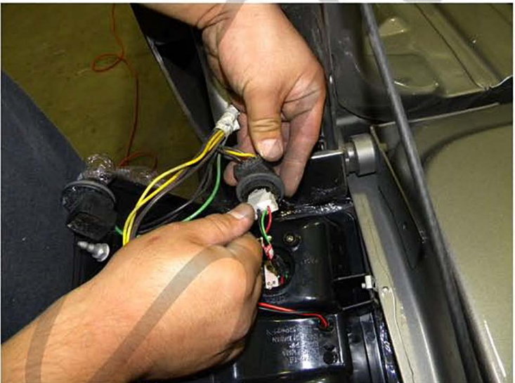
8. Connect the LED tail light connector into the tail light harness

please see the " L.E.D. tail lights installation instruction" If your tail lights don't have L.E.D. You can skip the installation instruction.