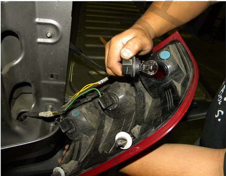
3. Remove the harness and bulbs from the tail light