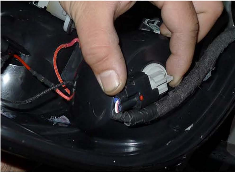
7. Connect the brake light harness to the LED taillight

please see the " L.E.D. tail lights installation instructions" If your tail lights don't have L.E.D. you can skip the installation instructions.