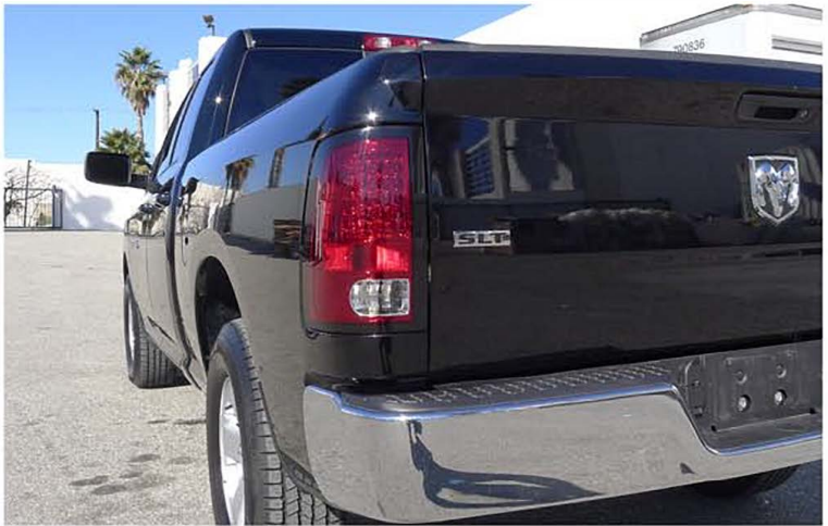
10. Please repeat the steps in order from 1 to 9 for the opposite side. The installation is now complete