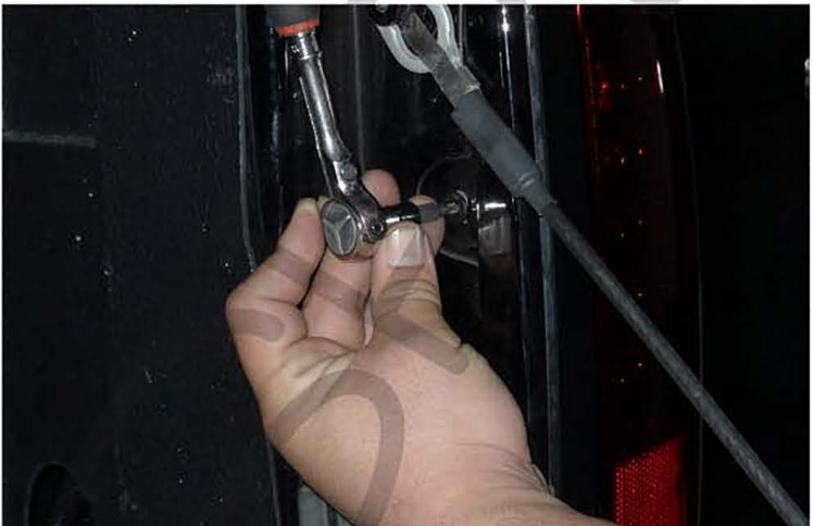
9. Tighten the (2) T15 screws