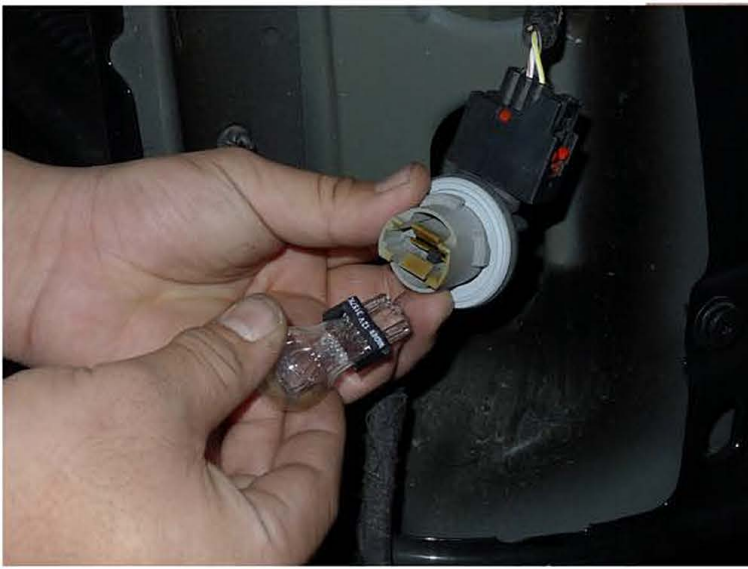
5. Remove thr brake light bulb