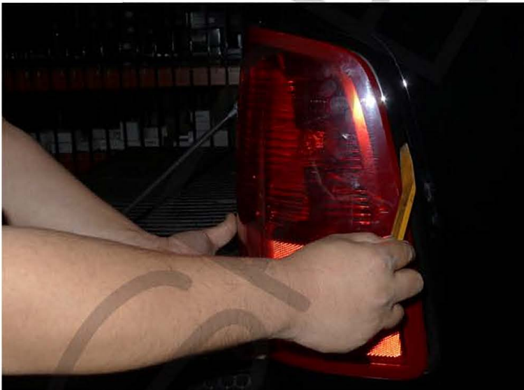
3. Remove the factory taillight