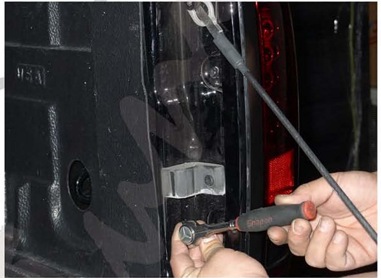
2. (2) T15 screw locations and remove the (2) T15 screw