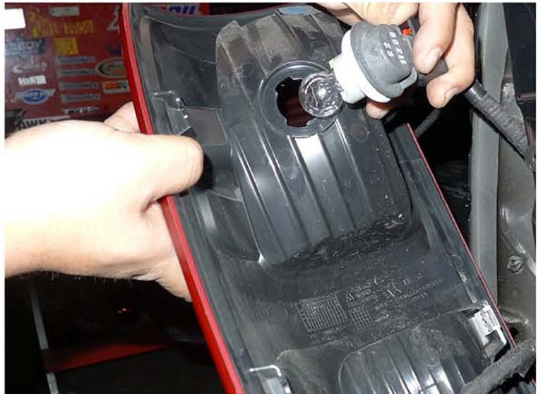
4. Remove the taillight sockets