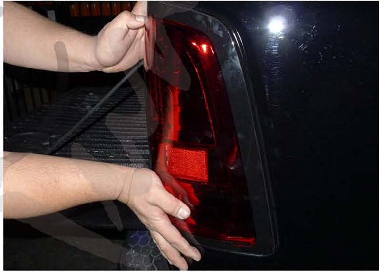
8. Place the LED taillight in the stock location