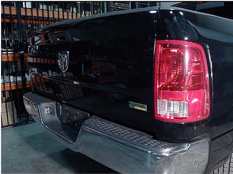
1. Stock light