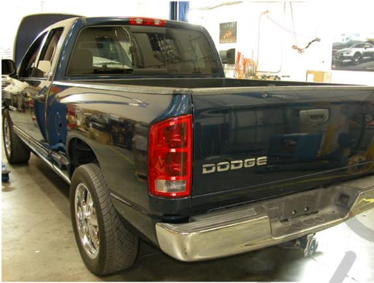
1. Open the tail gate

If you experience any difficulties that the instruction did not cover, Please seek local auto shop for advise. Please wear protection before you work on your vehicle. An assistant is helpful when removing the front bumper. Please be careful while working with the bumper or body part to avoid scratching. Do not make direct contact with the halogen bulb or the wire assembly until the unit has cooled down after use.