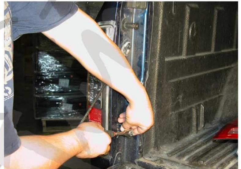
8. Please repeat the picture order from 1 to 8 for the opposite side