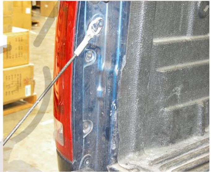
2. Remove two T20 bolts