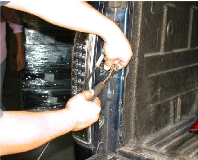
7. Install two T20 bolts