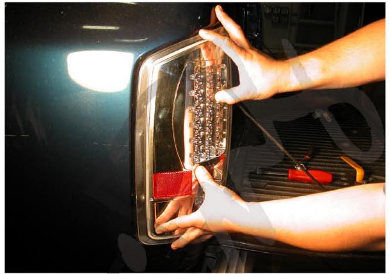
6. Install taillight