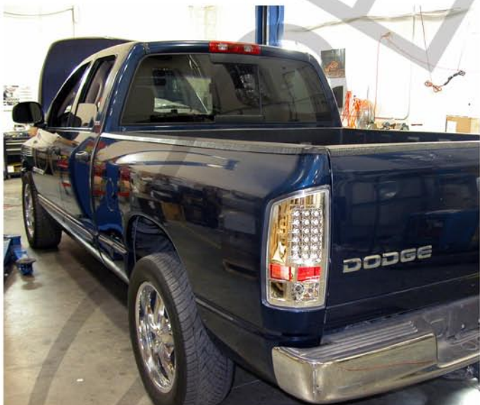
9. The installation is now complete