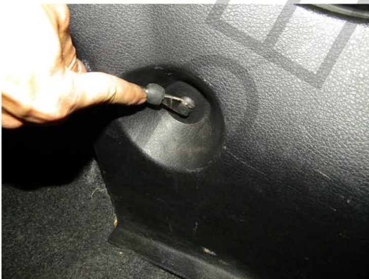
3. Remove the (6) plastic clips