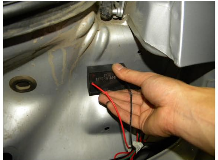
10. Secure the LED resistor block and harness to the body with double sided foam tape