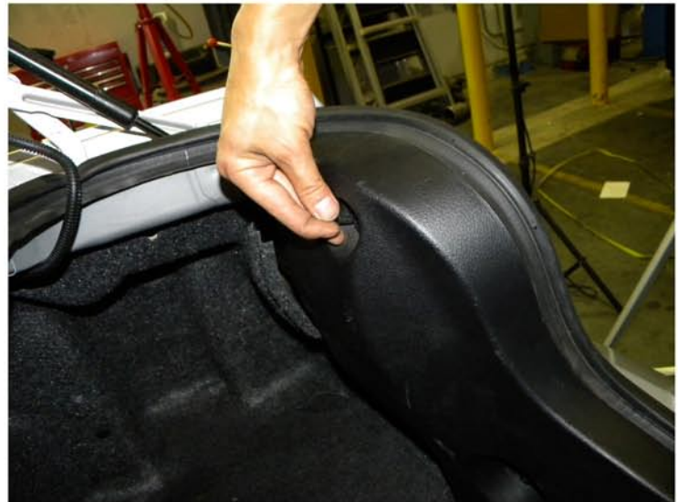
4. Remove the (6) plastic clips