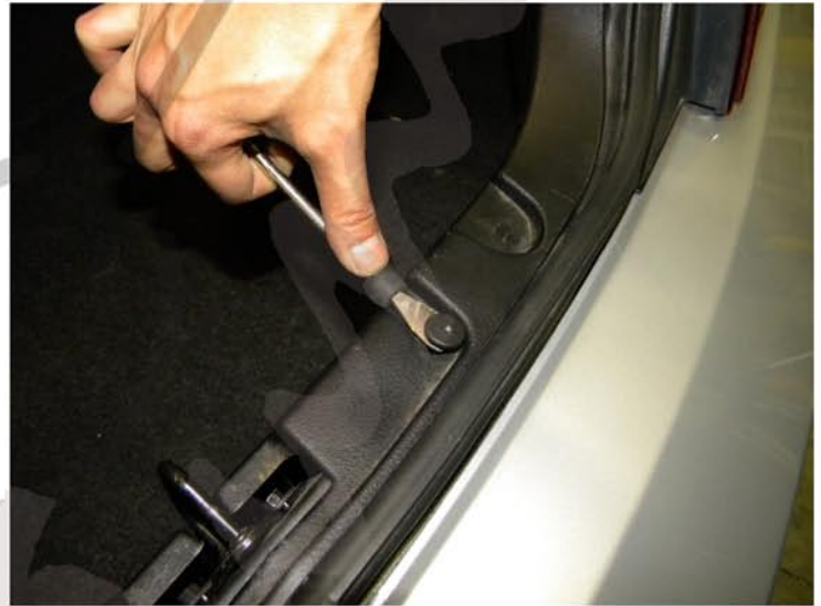
2. Remove the (6) plastic clips