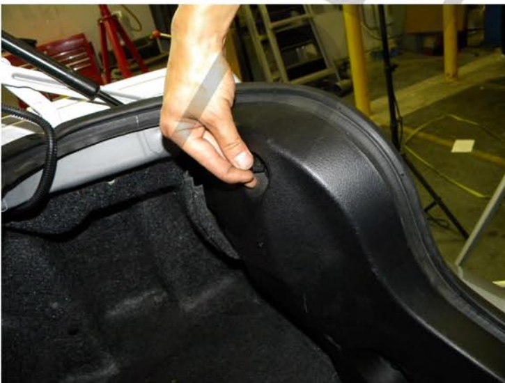
15. Replace (6) plastic clips