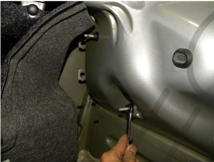
13. Tighten (3) 10mm bolts