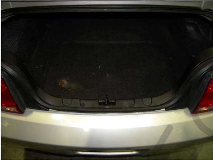
1. Open the trunk, to access the plastic trunk moulding

Do not make direct contact with the halogen bulbs or the wire assembly until the unit has cooled down after use.