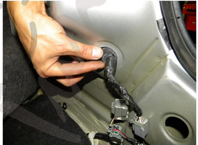
8. Push in the harness rubber seal