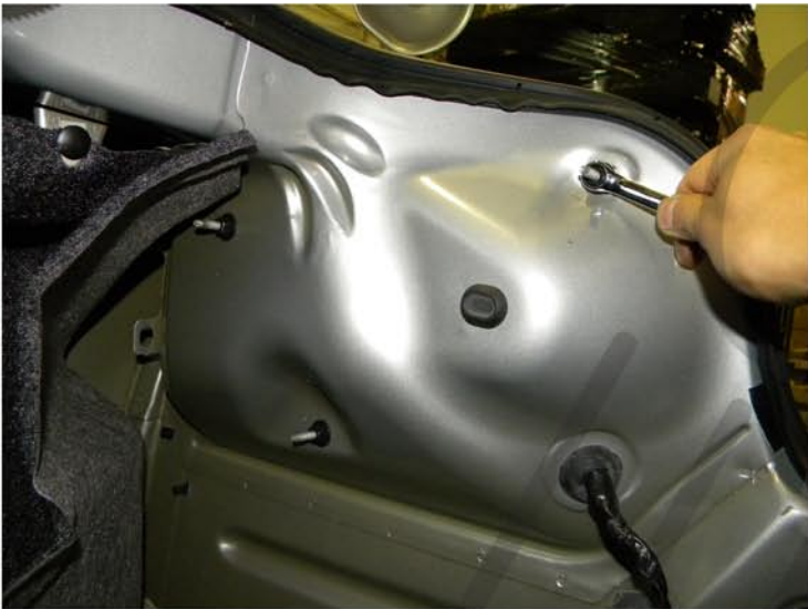
7. Remove the (3) 10mm nuts