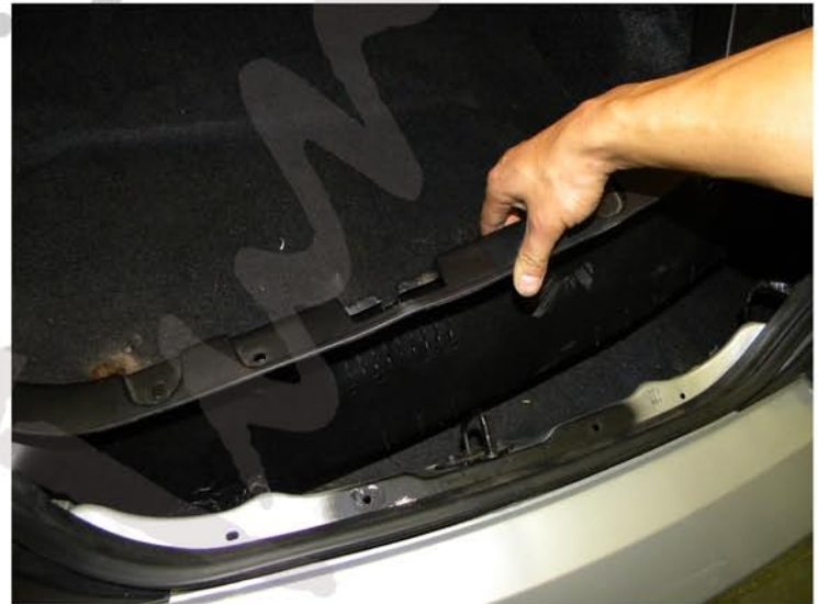
14. Replace Plastic trunk moulding