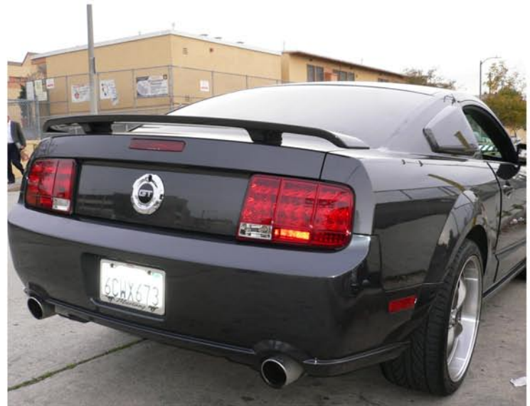
16. Please repeat the steps in order from 1 to 15 for the opposite side The installation is now complete