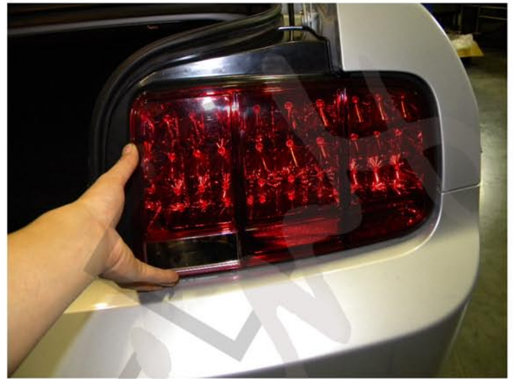
12. Place Sequential LED tail light into position

please see the " L.E.D. tail lights installation instruction" If your tail lights don't have L.E.D. You can skip the installation instruction.