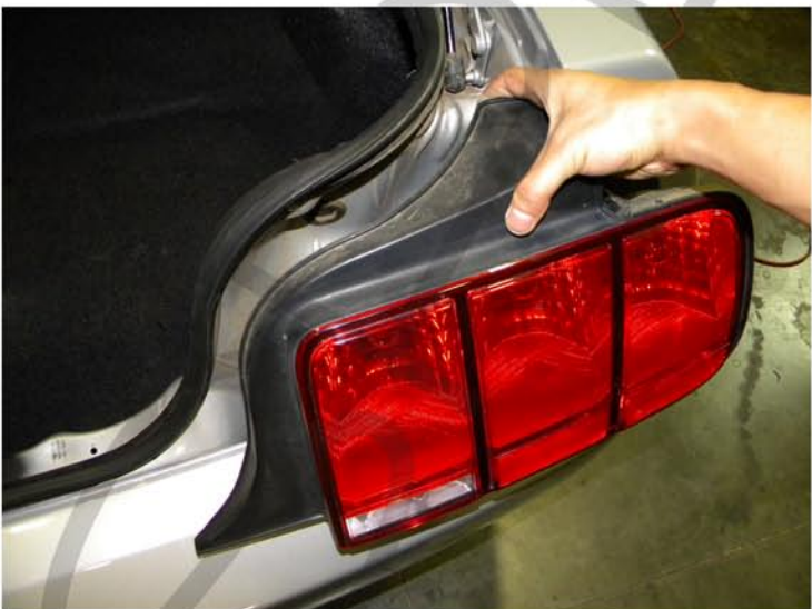
9. Remove the stock tail light