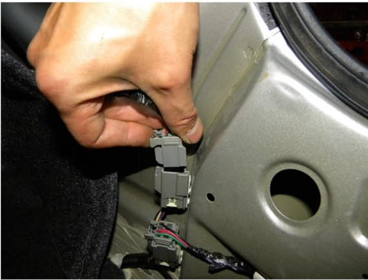
5. Unplug the taillight harness