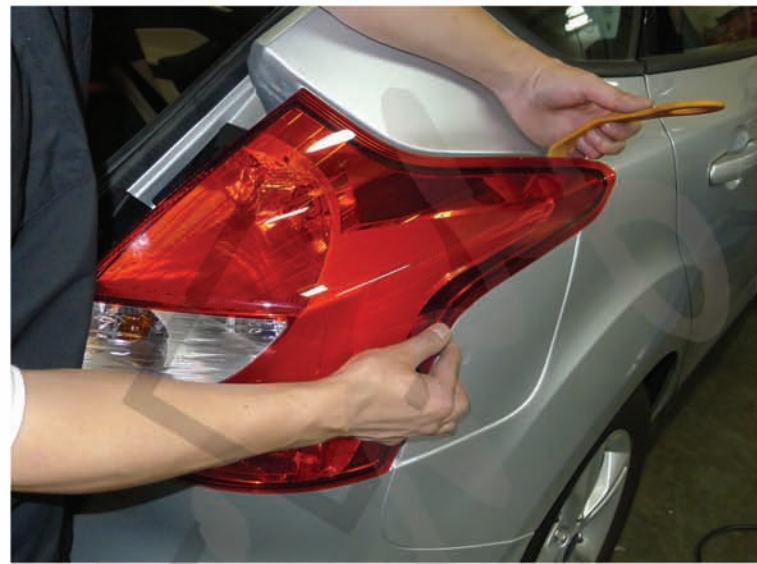
6. Remove the factory taillight