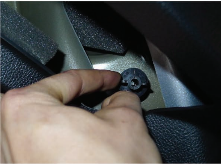
11. Replace the plastic wingnut Please repeat the steps in order from 1 to 11 for the opposite side.