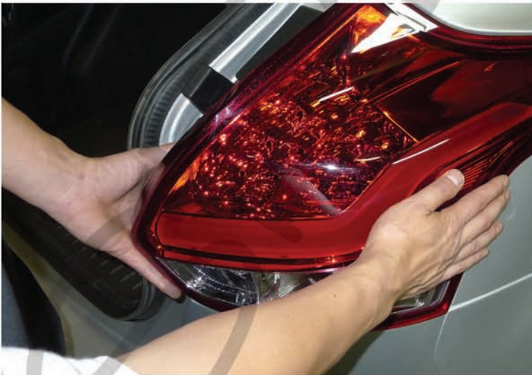
9. Place the LED taillight in the stock location