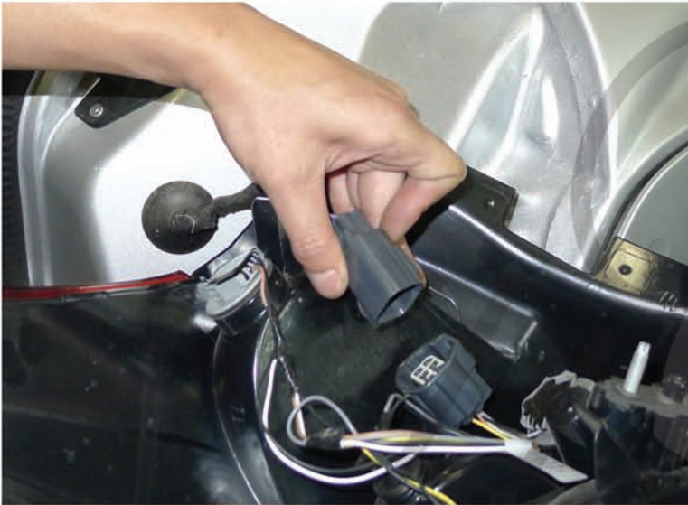
7. Disconnect the taillight harness