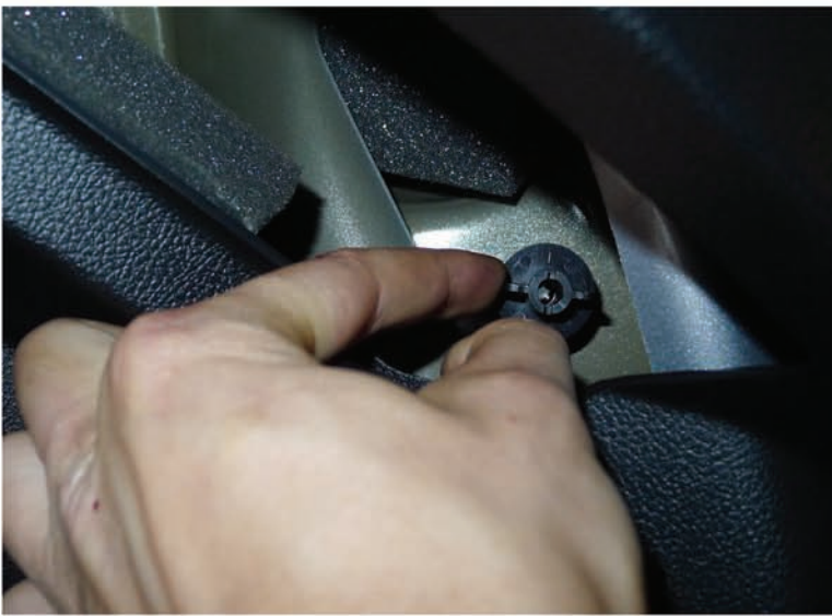
5. Remove the plastic wingnut