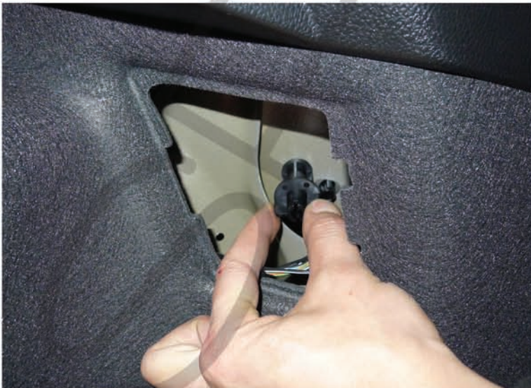
3. Remove the plastic wingnut