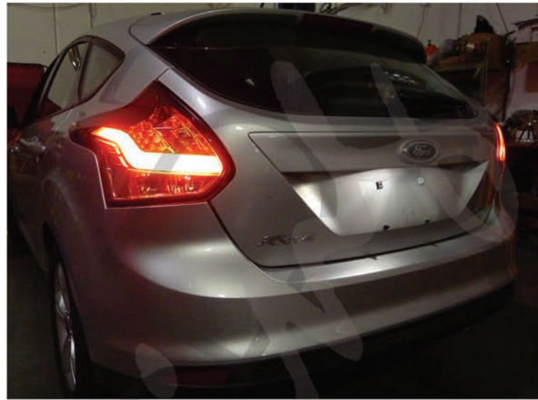
12. The installation is now complete.