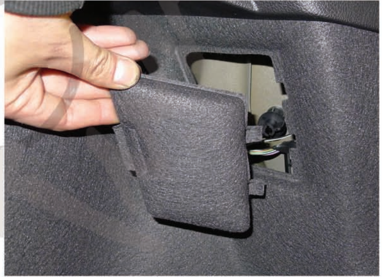
2. Remove the access hole cover