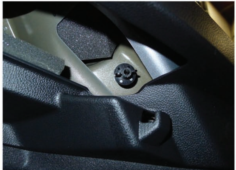
4. Wingnut location