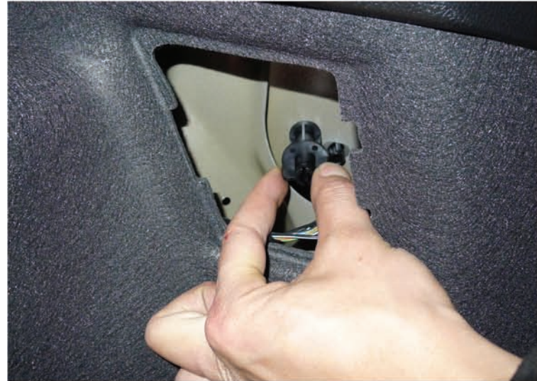
10. Replace the plastic wingnut