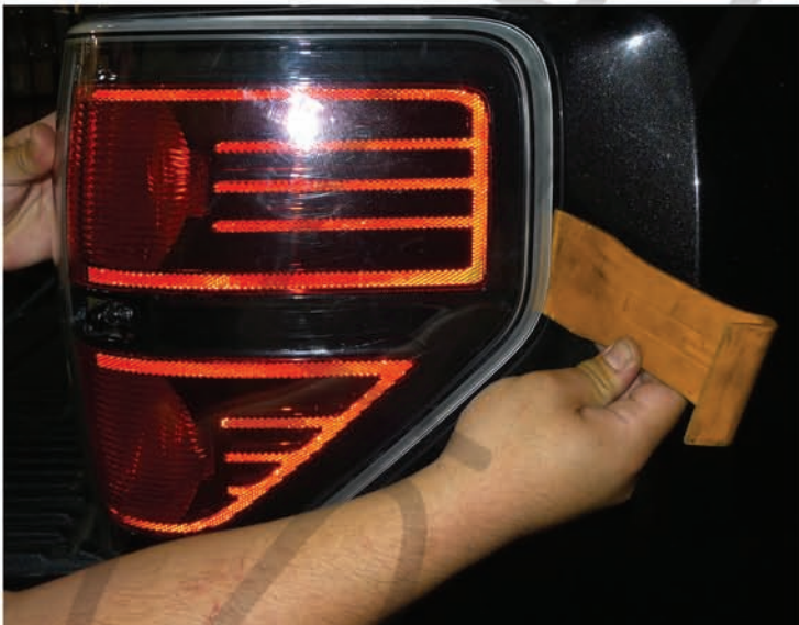
3. Remove the factory tail light