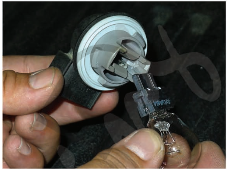
6. Remove the brake and signal light bulb from the socket