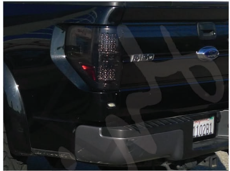
12. Please repeat the steps in order from 1 to 11 for the opposite side.