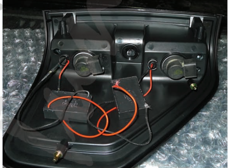
8. Please see the "L.E.D. tail lights installation instructions" If your tail lights don't have L.E.D. You can skip the installation instructions.