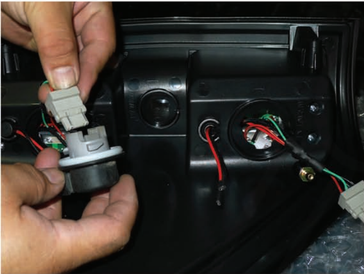
7. Connect the brake and signal light socket to the LED tail light