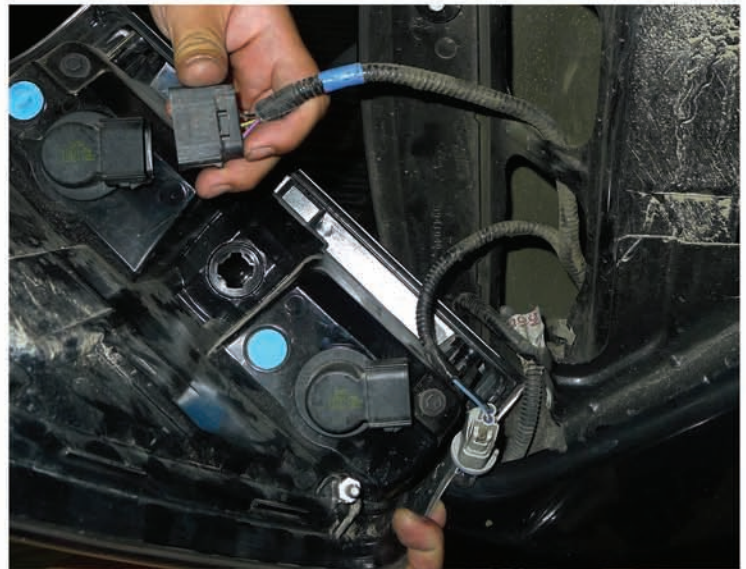
4. Disconnect the wire harness