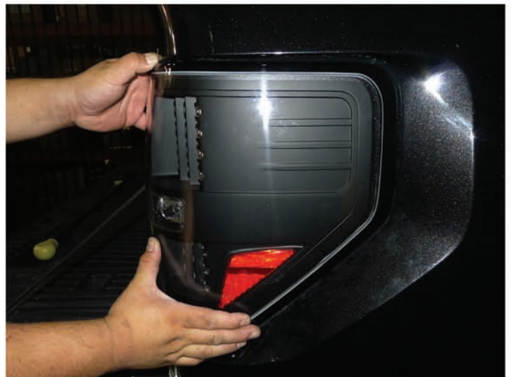
10. Place the LED tail light in the stock location