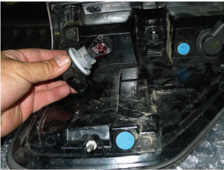
5. Remove the brake and signal light socket