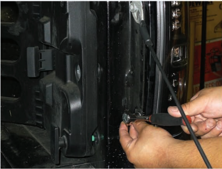
11. Tighten the (2) 8mm bolts