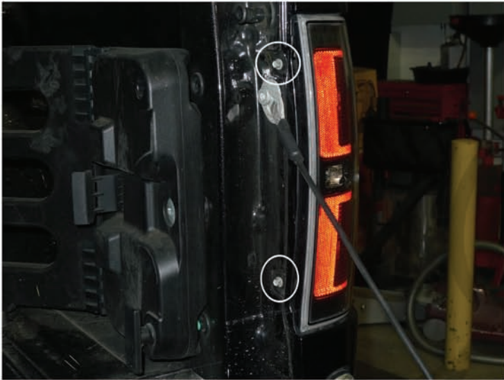
1. (2) 8mm bolt locations

Do not make direct contact with the halogen bulbs or the wire assembly until the unit has cooled down after use.