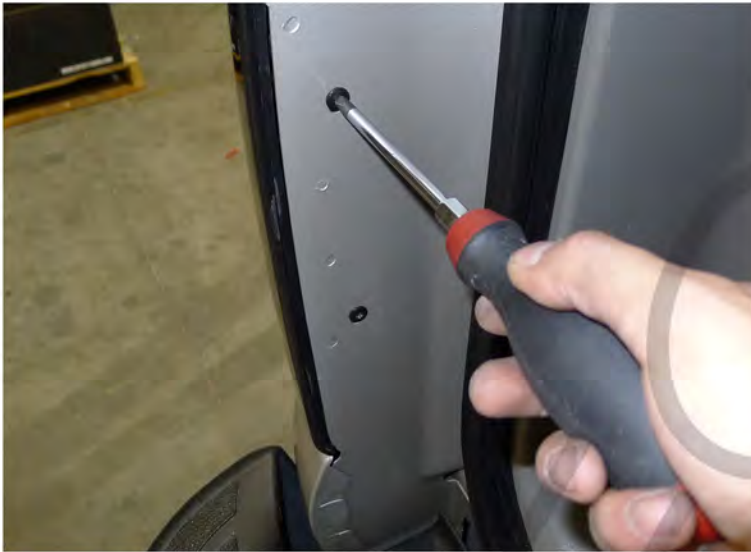
1. Remove the (2) phillips head screws

Do not make direct contact with the halogen bulbs or the wire assembly until the unit has cooled down after use.