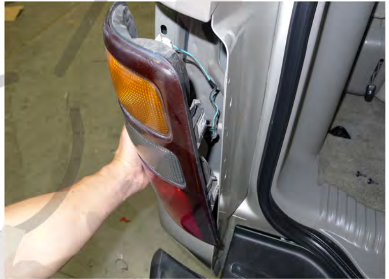
2. Remove the tail light