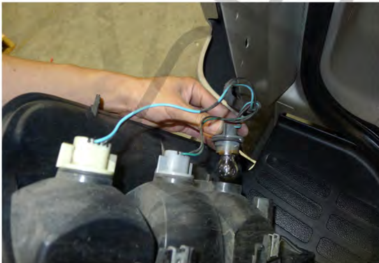
3. Remove the tail light sockets from the tail light