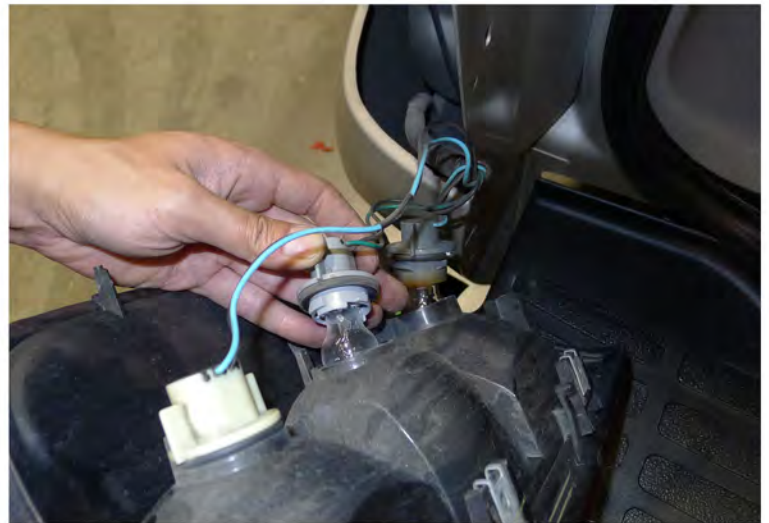
4. Remove the brake light bulbs