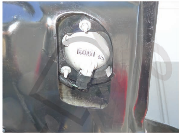
12. Reverse the light location