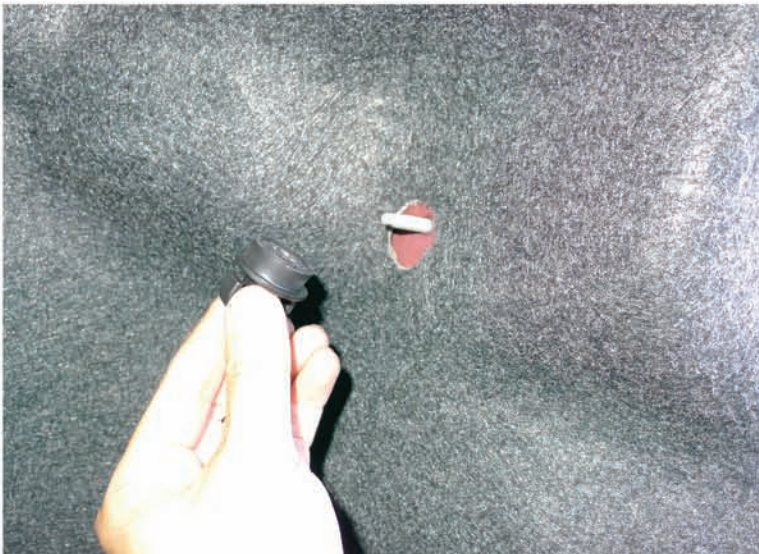
3. Remove the thumb screws