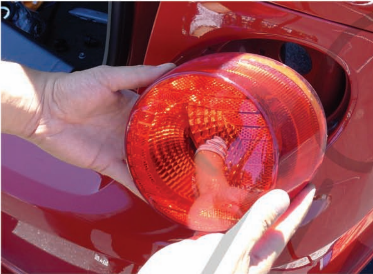
7. Remove the factory taillight