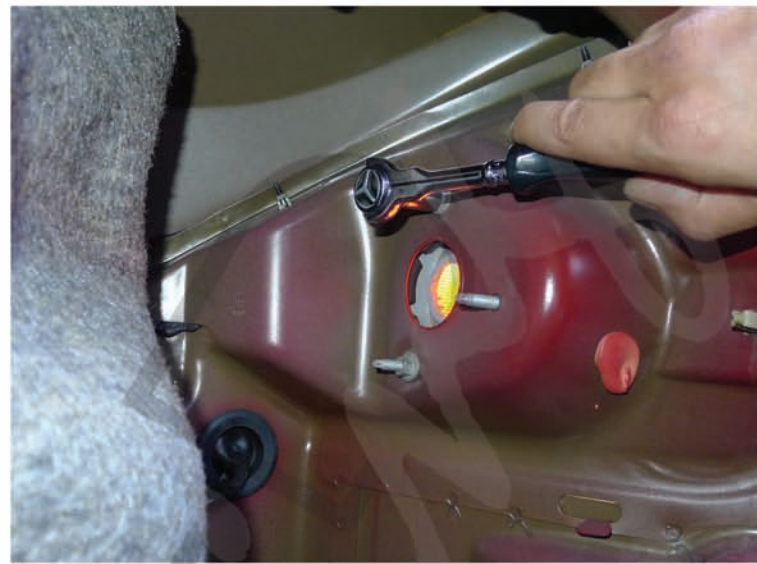
6. Remove the (3) 10mm nuts