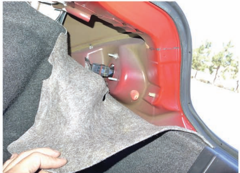
4. Peel back the trunk liner