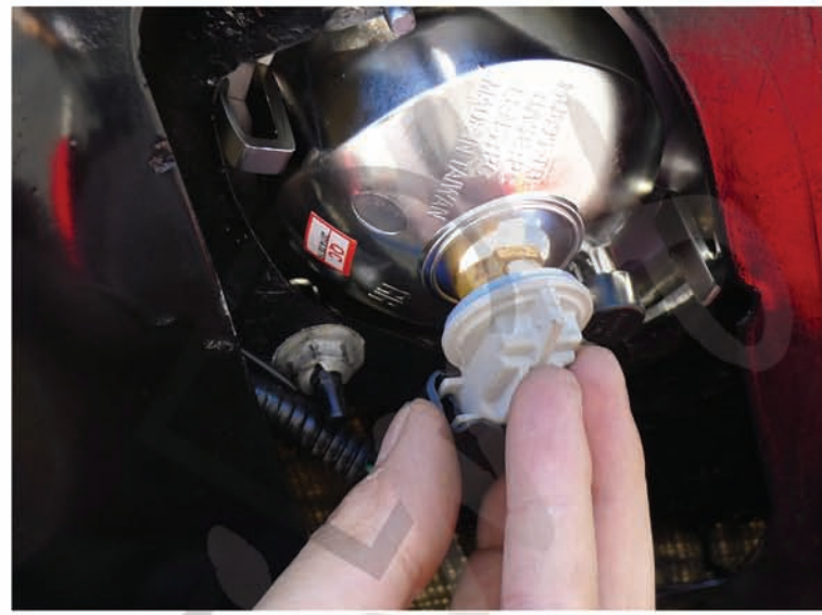
18. Install the reverse light socket Please repeat the steps from 1 to 18 for the opposite side