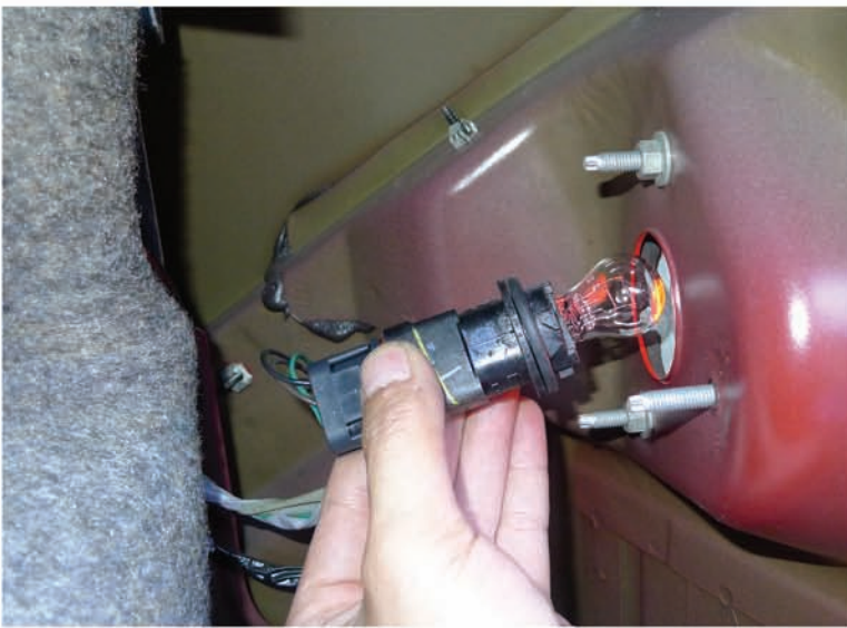
5. Remove the taillight socket