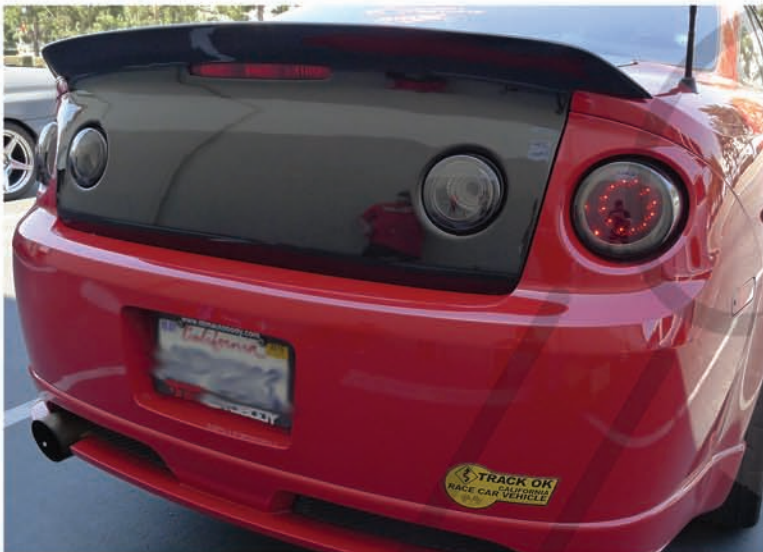
17. The installation now is complete