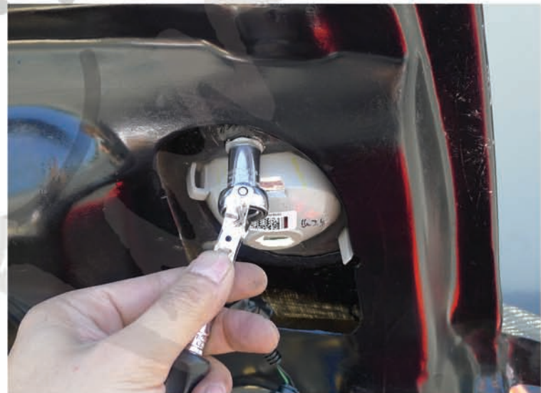
18. Remove the (2) 11mm nuts