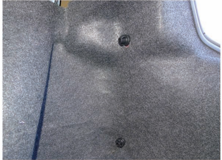
2. Thumb screws location