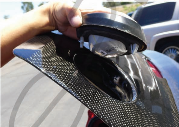
15. Remove the factory reverse light from the trunk lid