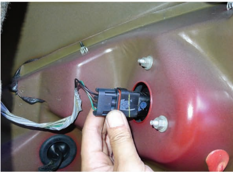
11. Install the taillight socket