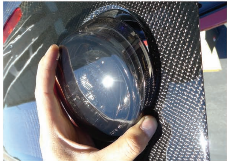
16. Place the new reverselight housing into the position