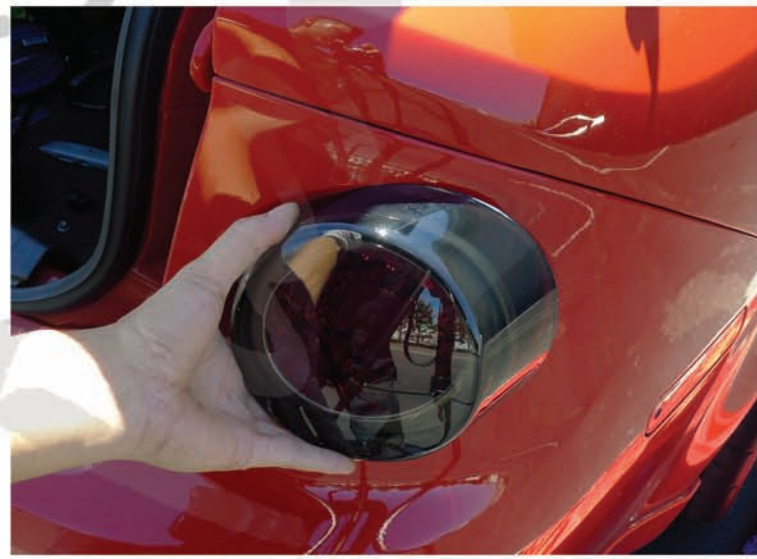
8. Place the LED taillight into position