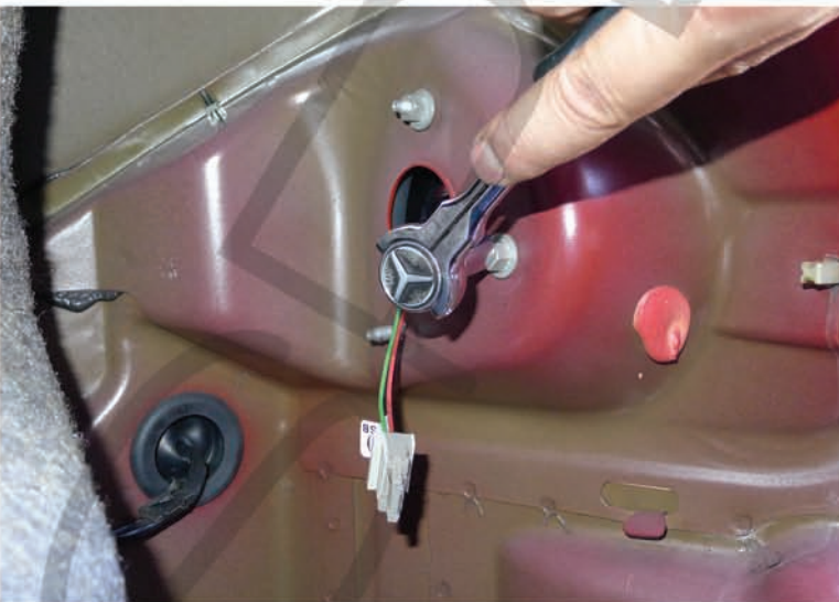
9. Tighten the (3) 10mm nuts