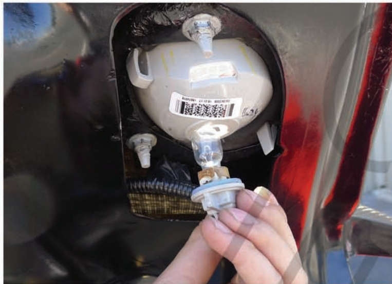
13. Remove the reverse light socket