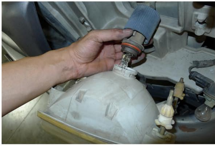
10. Unplug the headlight bulb