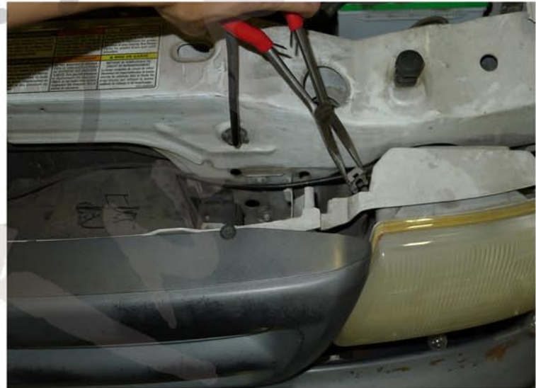
8. Remove the (2) retainer clips