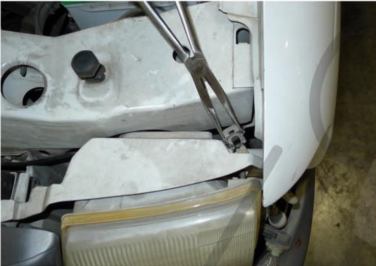
7. Remove the (2) retainer clips