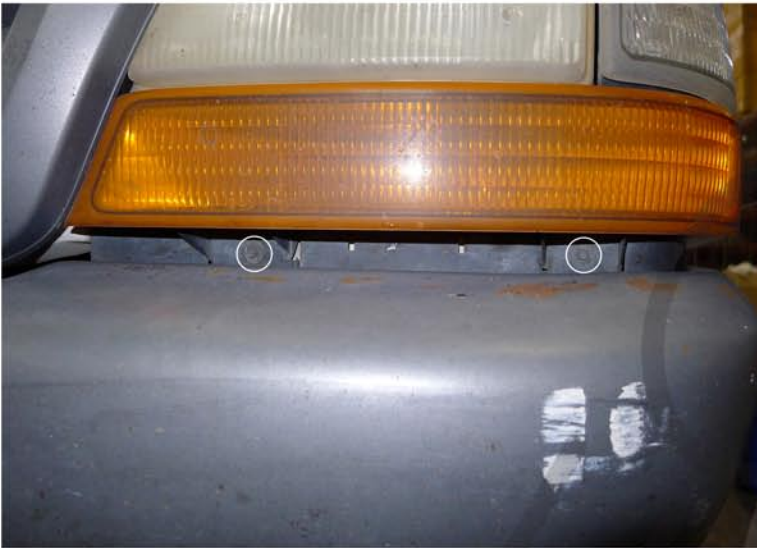
1. (2) .25 in. screws location

Do not make direct contact with the halogen bulbs or the wire assembly until the unit has cooled down after use.