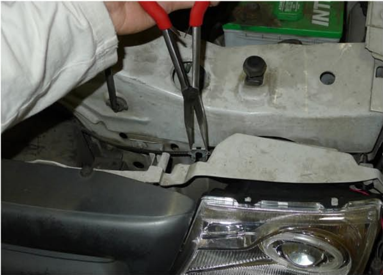
13. Replace the (2) retainer clips