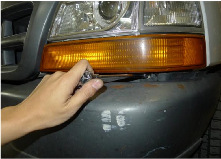
17. Tighten the (2) .25 in screws