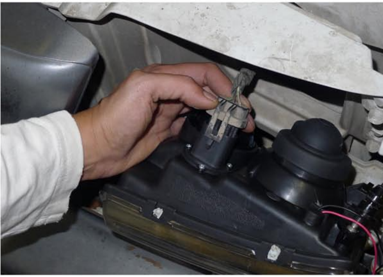
11. Connect the headlight harness to the projector headlight Please see the " L. E. D. tail lights installation instructions" If your tail lights don't have L. E. D. You can skip the installation instructions.