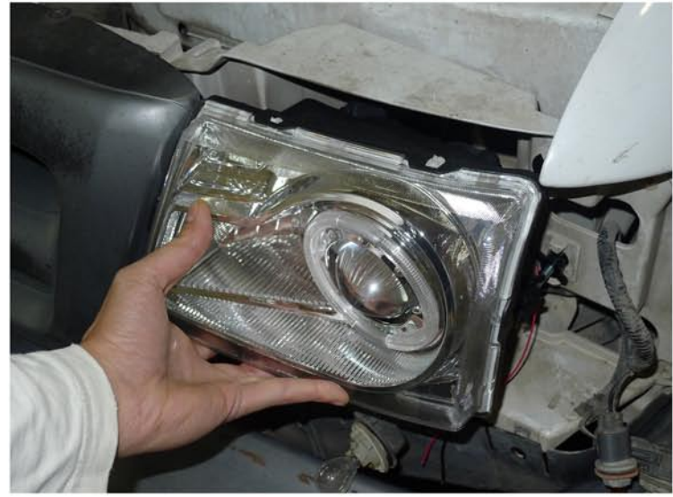
12. Place the projector headlight in the stock location