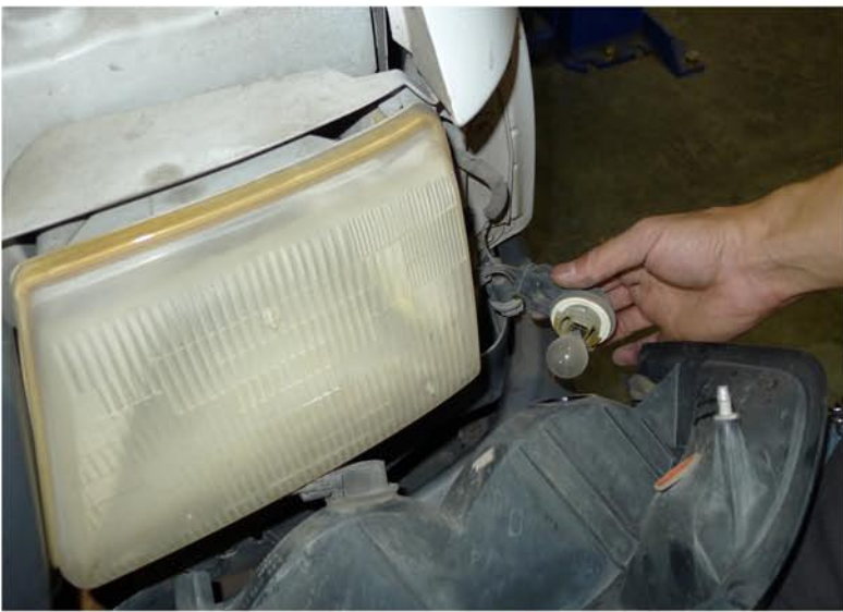
5. Disconnect the light sockets