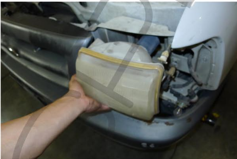
9. Remove the stock headlight