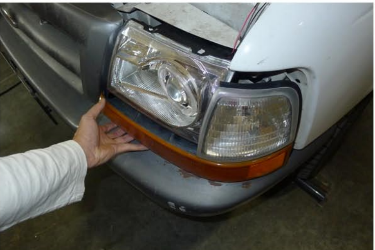
15. Replace the corner-bumper light in the original location