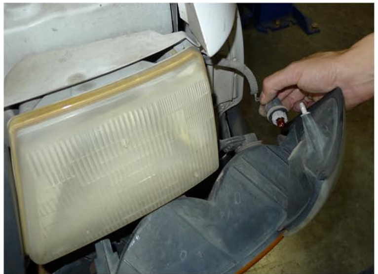
4. Disconnect the light sockets