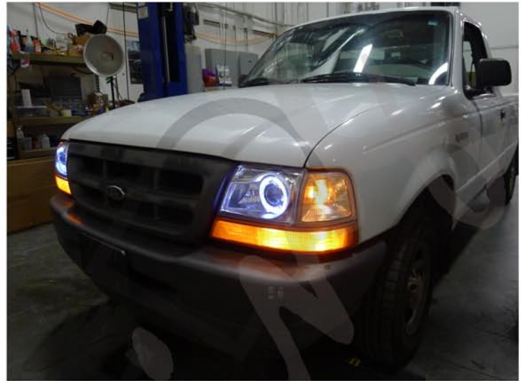
18. Please repeat the steps in order from 1 to 18 for the opposite side