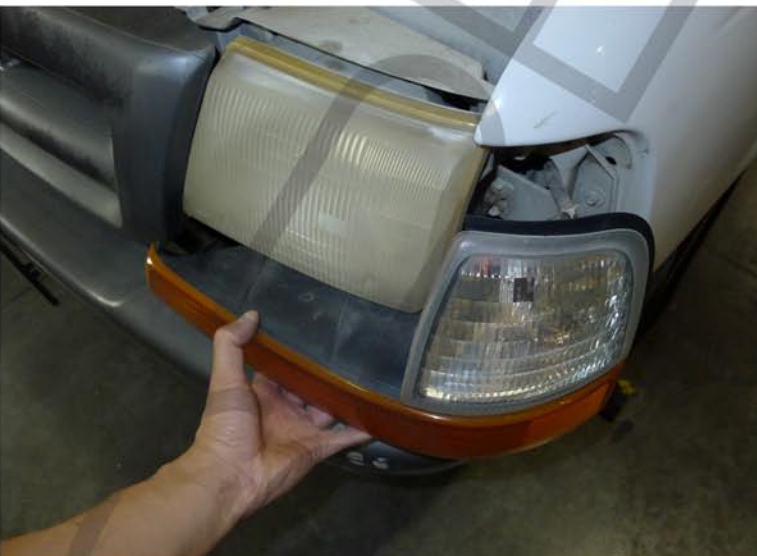
3. Remove the corner-bumper light