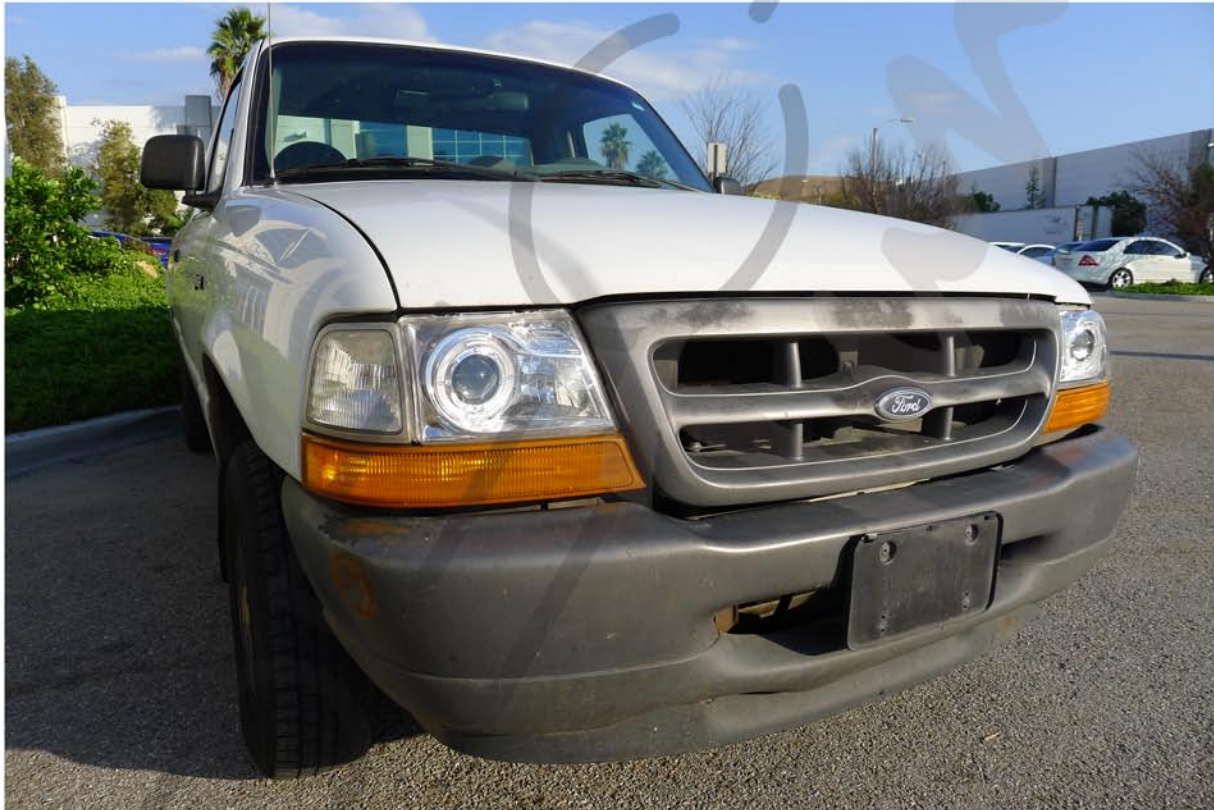
19. The installation is now complete