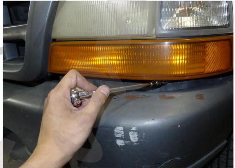
2. Remove the (2) .25 in. screws