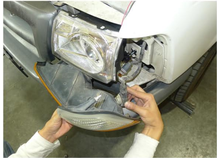
14. Replace the light sockets into the bumper light