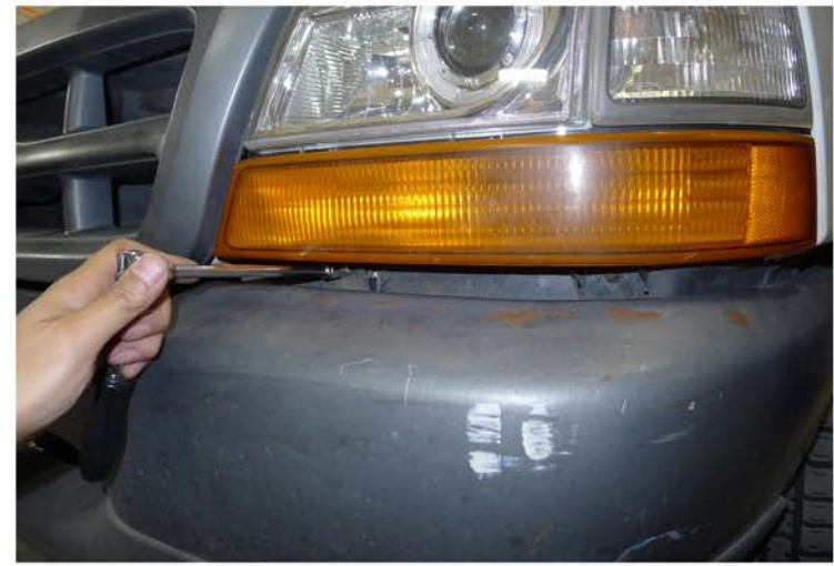
16. Tighten the (2) .25 in. screws