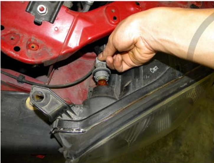
13. Remove light bulb and harness