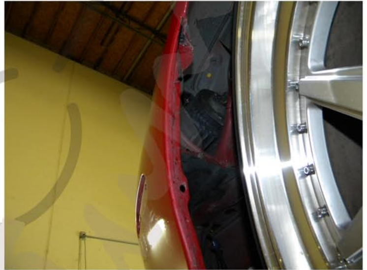
2. Plastic clips location