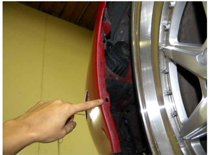
4. Remove the clips that may be in these locations