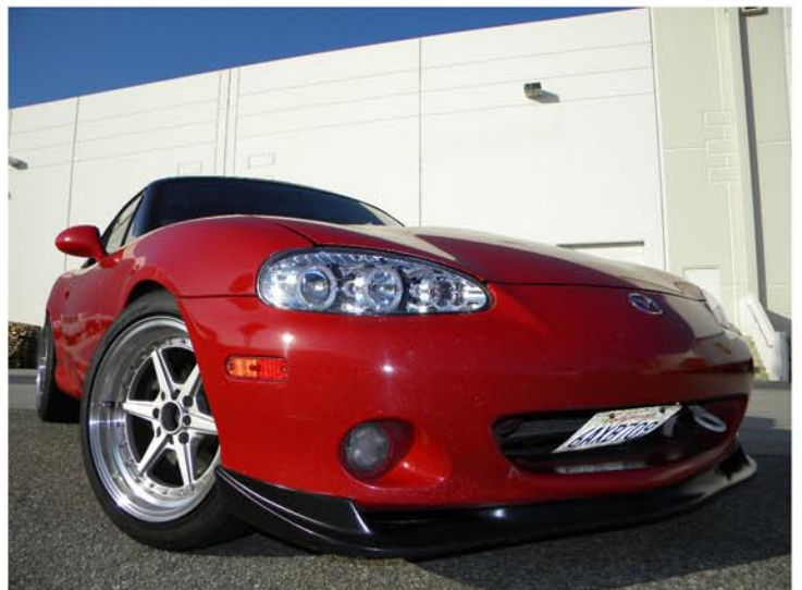
28. The installation is now complete