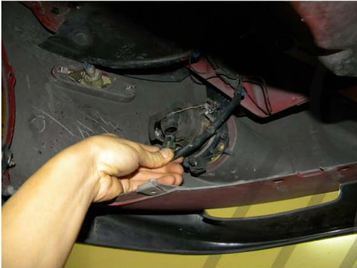
7. Disconnect the fog light