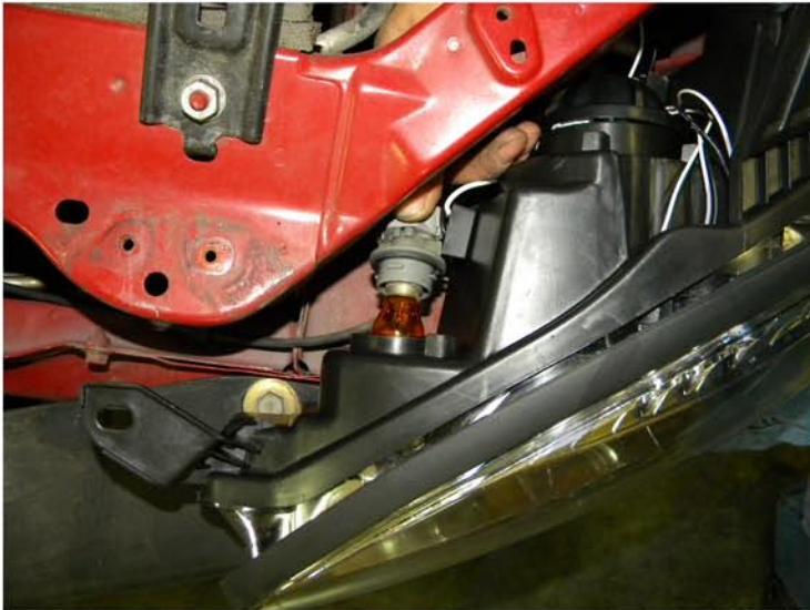
19. Connect driving light bulb

Please see the Halo and L.E.D installation instruction If your headlights don't have HALO or L.E.D. You can skip it