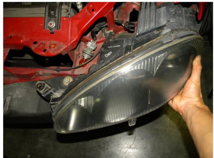
16. Remove the hadlight