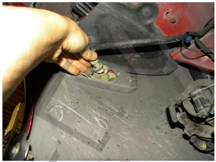
6. Unplug the bumper light