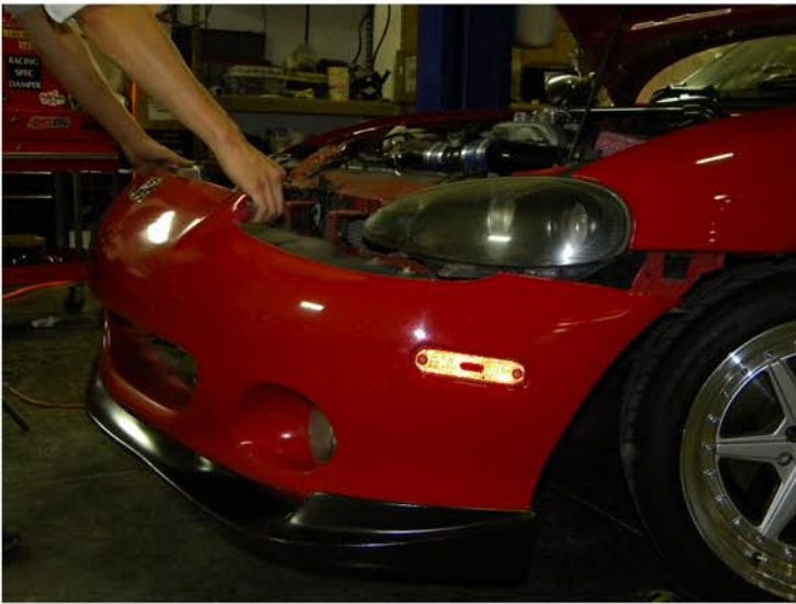
11. Remove front bumper