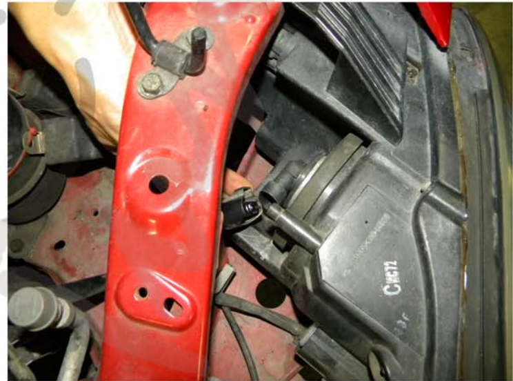
14. Unplug headlight harness