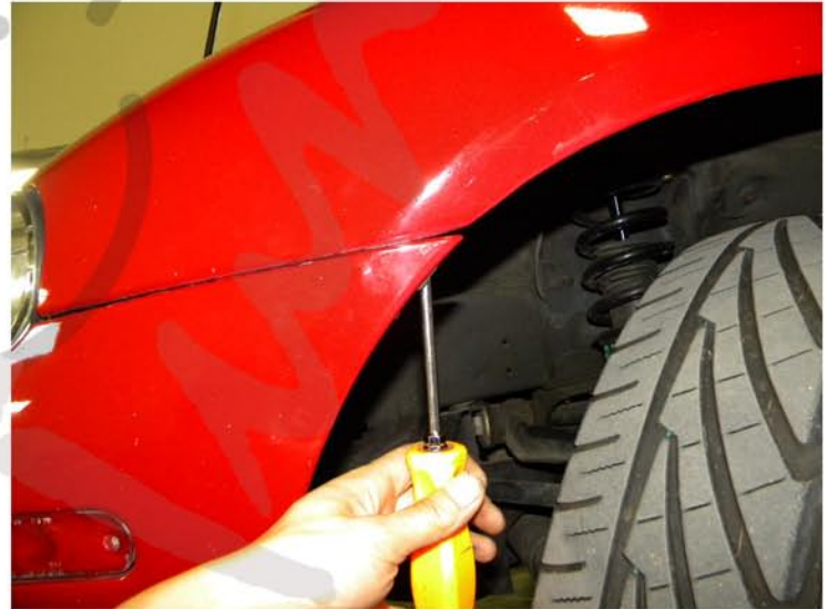
26. Tighten phillips head screw