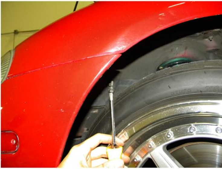
5. Remove the phillips head screw