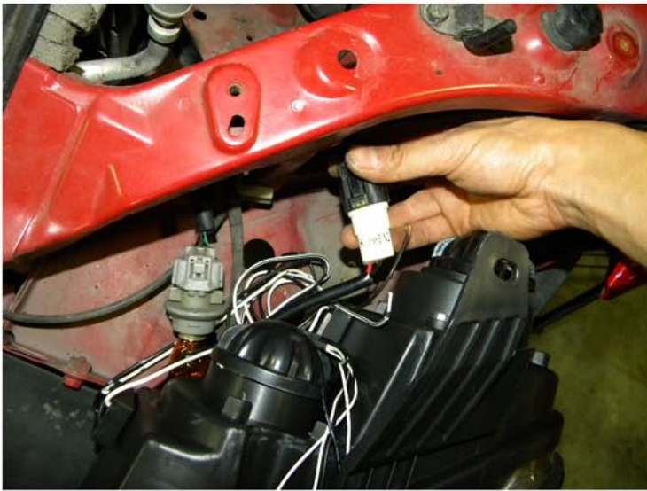
17. Plug in new headlight to headlight harness