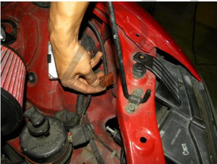
15. Unplug headlight harness