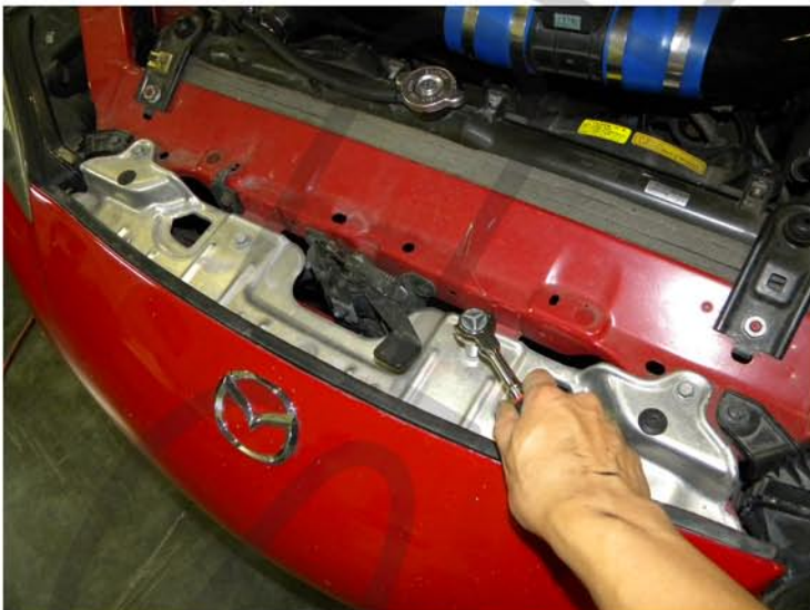
9. Remove the (4) 10mm bolts