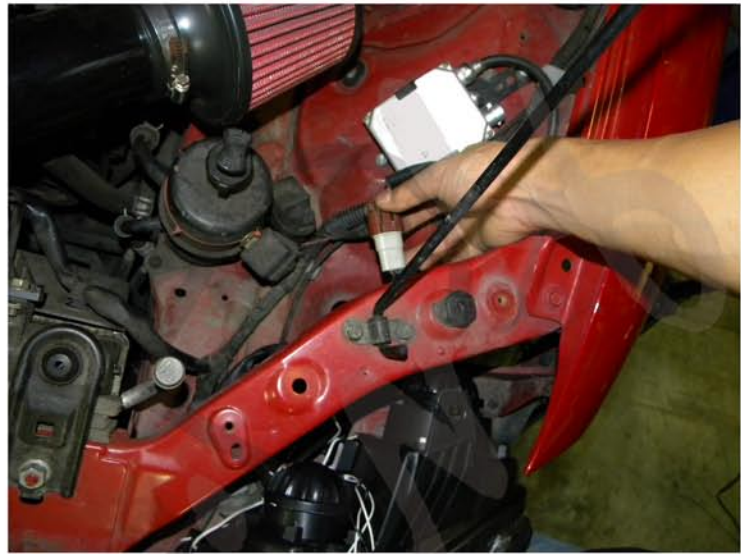
18. Connect New headlight to harness

Please see the Halo and L.E.D installation instruction If your headlights don't have HALO or L.E.D. You can skip it