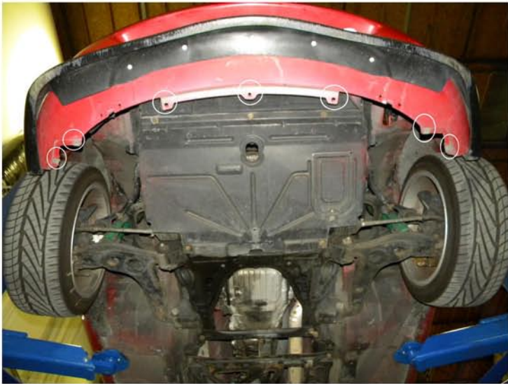
1. Clips and bolts locations

Do not make direct contact with the halogen bulbs or the wire assembly until the unit has cooled down after use.