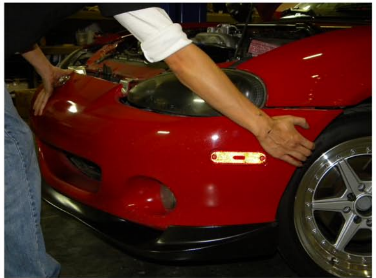
10. Tug on the side of the front bumper to unclip