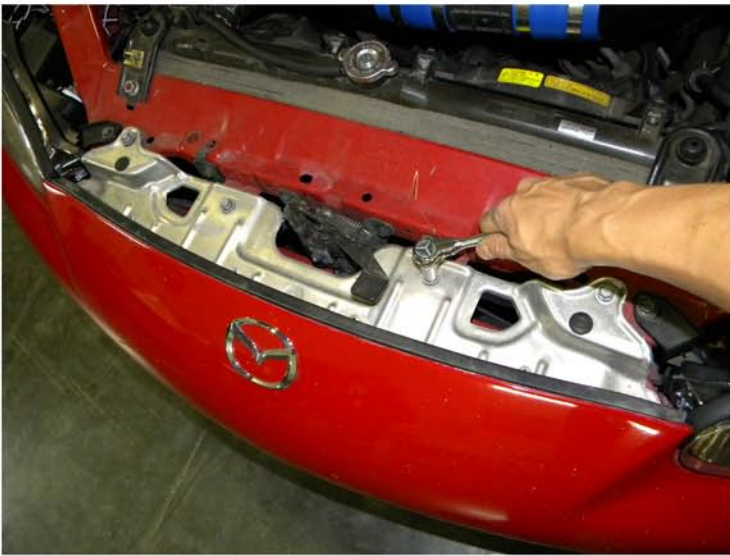
23. Tighten (4) 10mm bolts