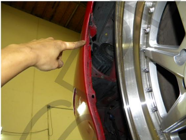
3. Remove the clips that may be in these locations