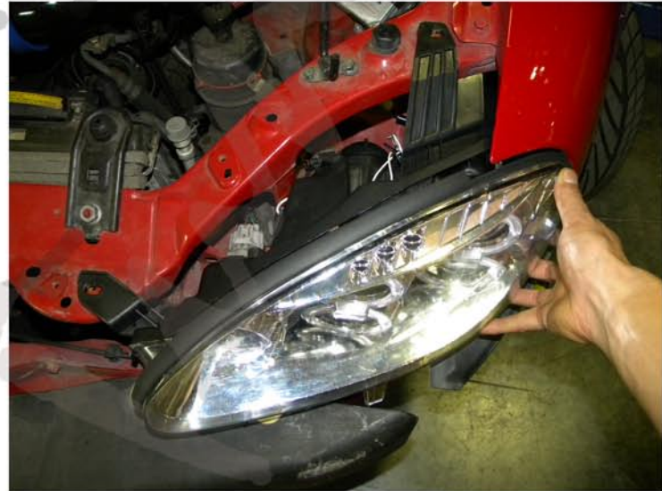
20. Place New projector headlight