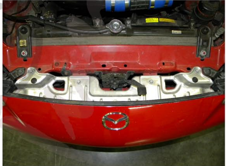
8. (4) 10mm bolts location