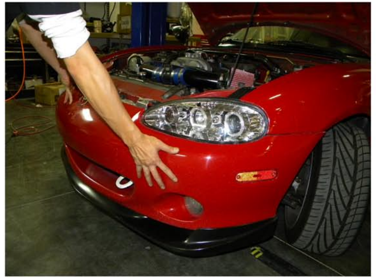
22. Replace front bumper