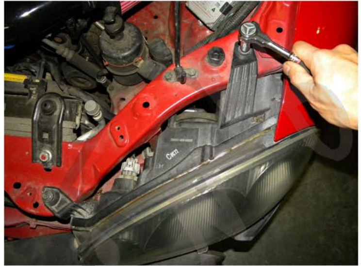
12. Remove (2) 10mm bolts