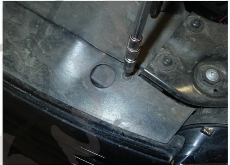
2. Remove the (4) T25 screws