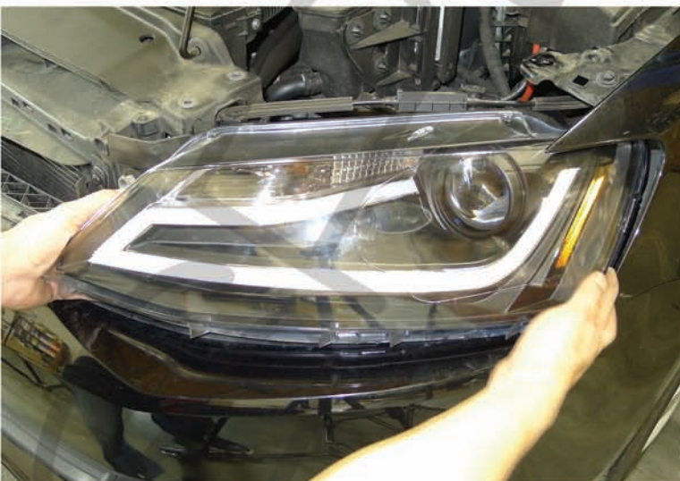
21. Place the new headlight in the stock location Please see the "Halo and L.E.D installation instructions"