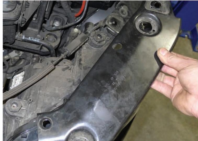
10. Remove the metal bracket