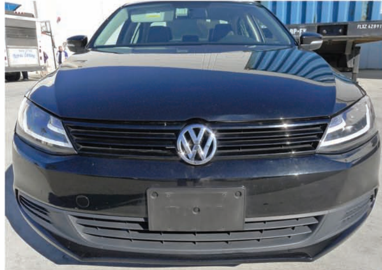
28. The installation now is complete