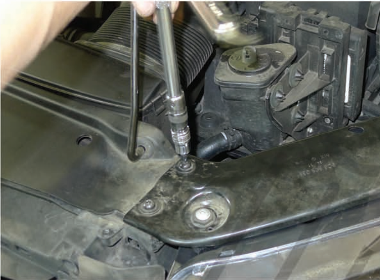
25. Tighten the (5) T30 bolts