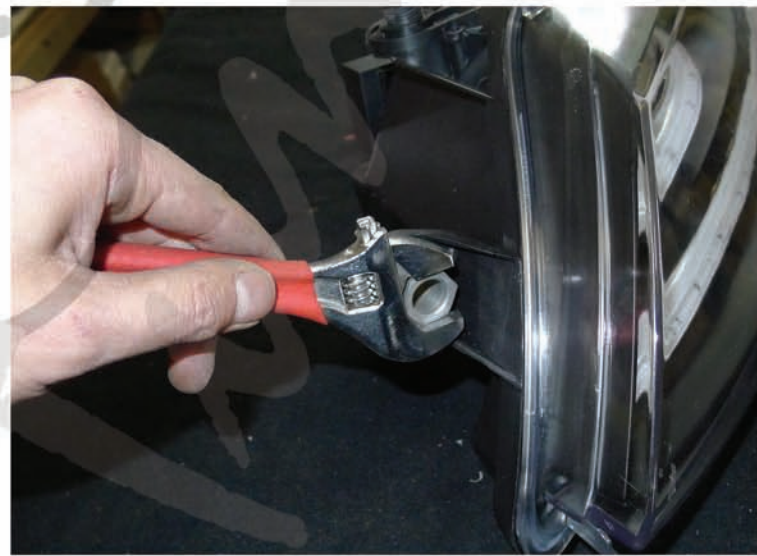
20. Install the 19mm mounting bolts on the new headlight