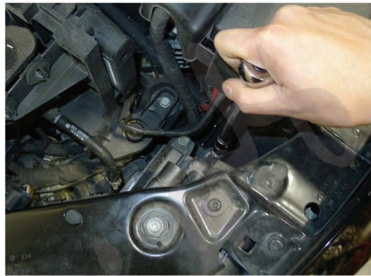
6. Remove the T30 bolt