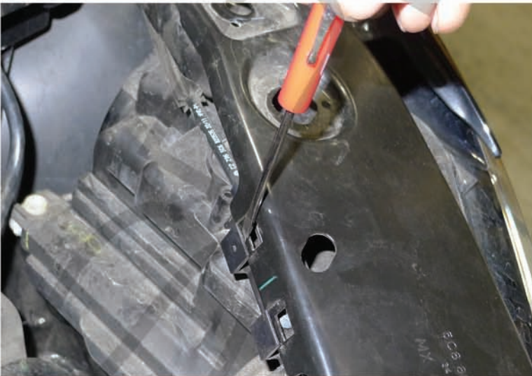
9. Detach the hood release cable from the metal bracket