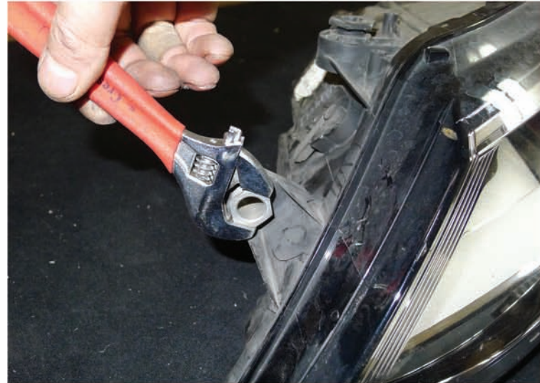
16. Remove the 19mm mounting bolt