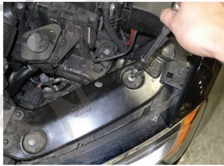
8. Remove the (5) T30 bolts