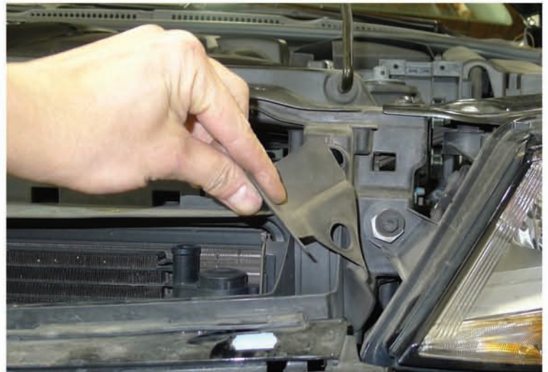
4. Moved the rubber flap aside