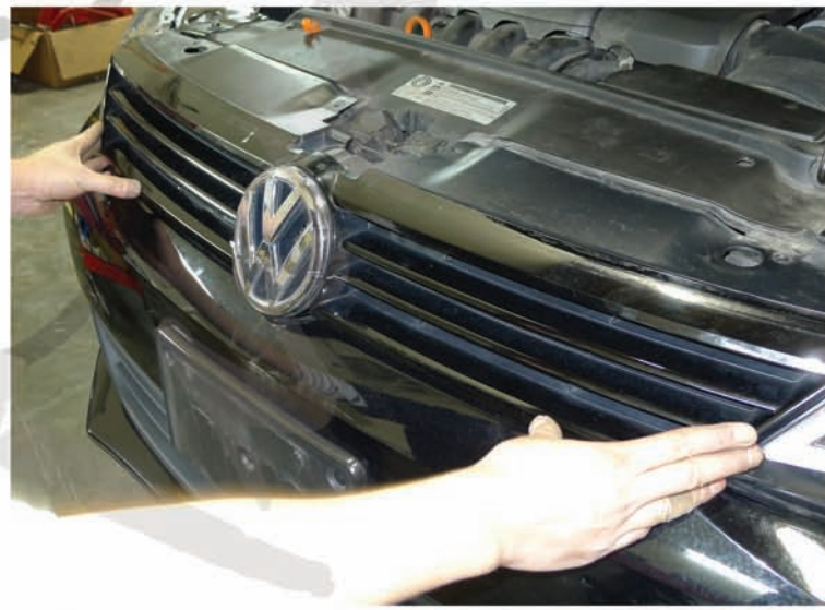
26. Replace the front grill