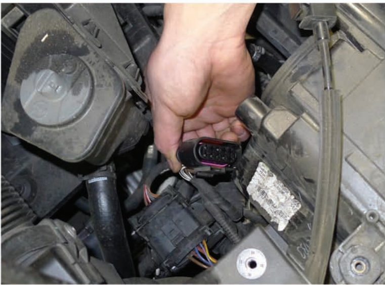
11. Disconnect the fog light harness