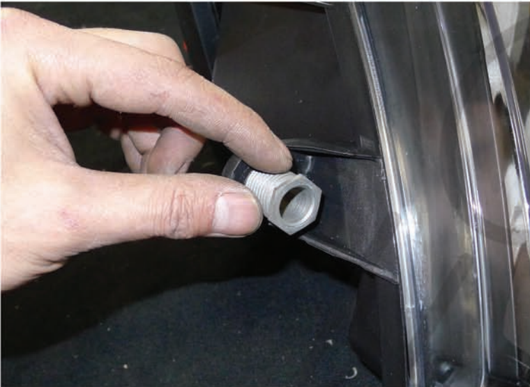
19. Install the 19mm mounting bolts on the new headlight