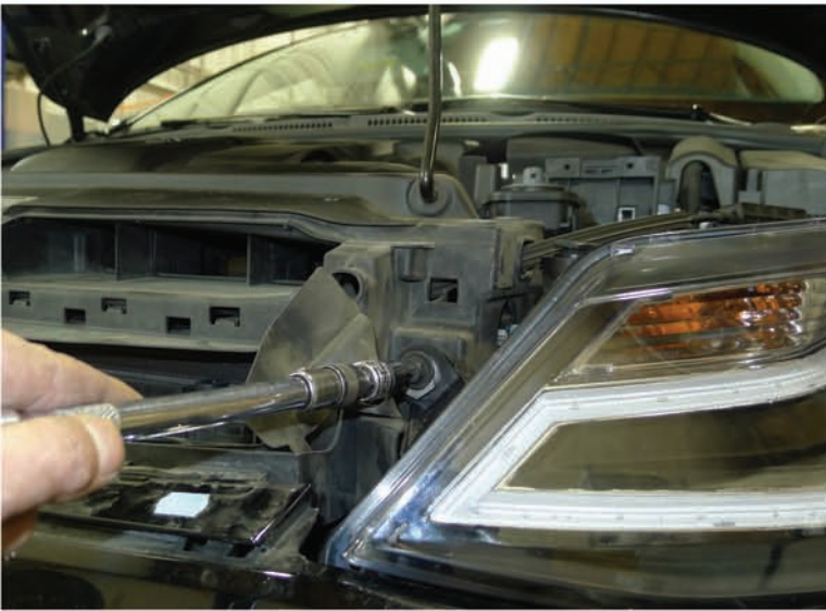
23. Tighten the T30 bolt