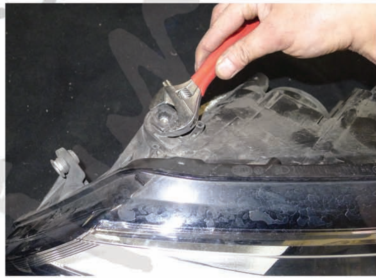
14. Remove the 19mm mounting bolt