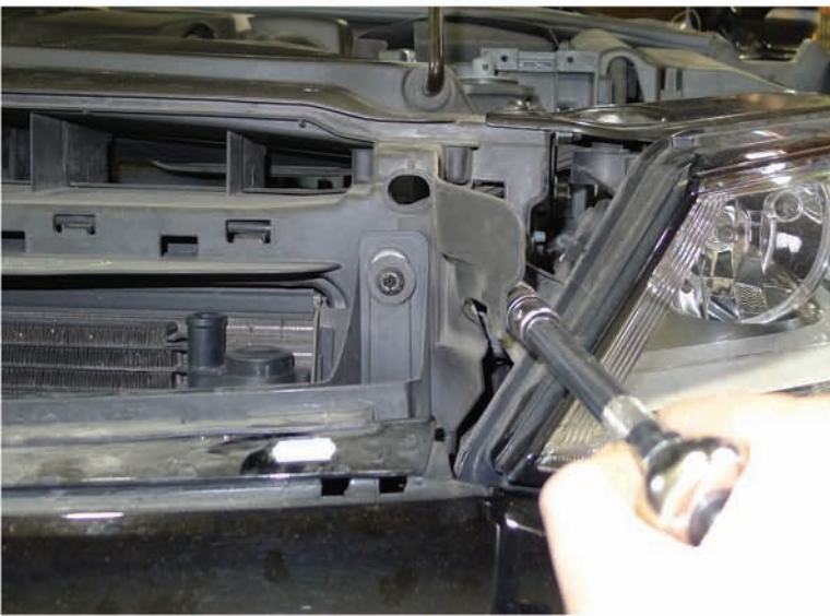
5. Remove the T30 screws