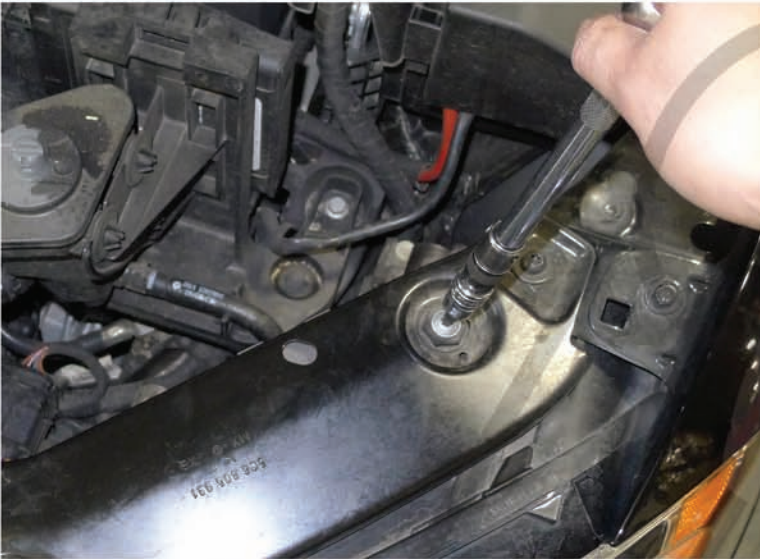
7. Remove the (5) T30 bolts