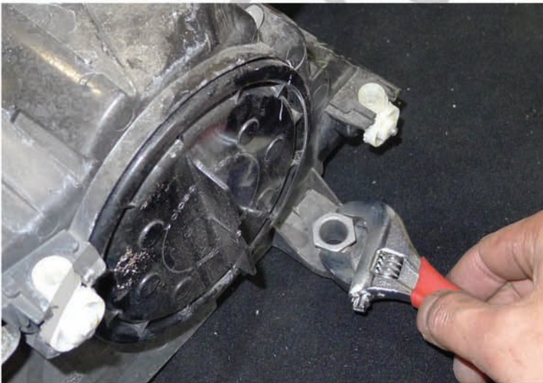
15. Remove the 19mm mounting bolt