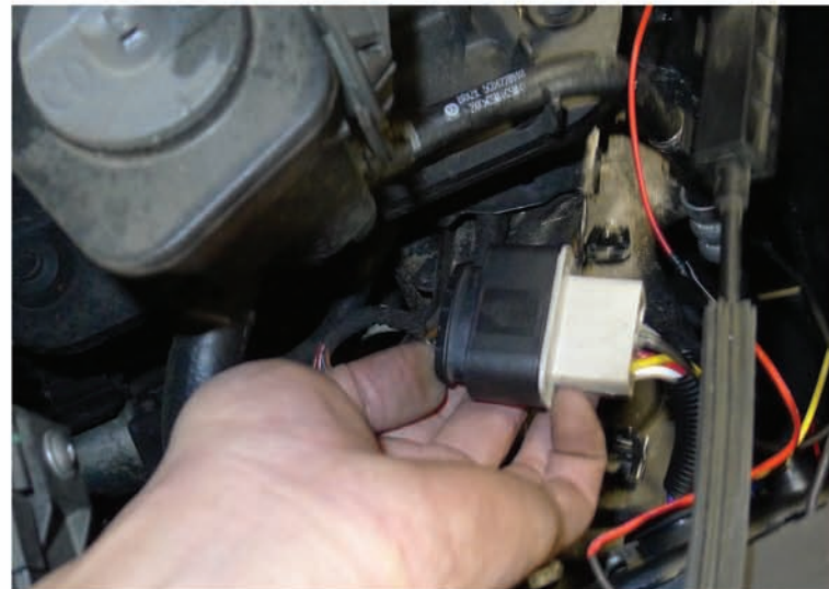
34. Connect the headlight harness If your headlights don't have HALO or L.E.D. you can skip it