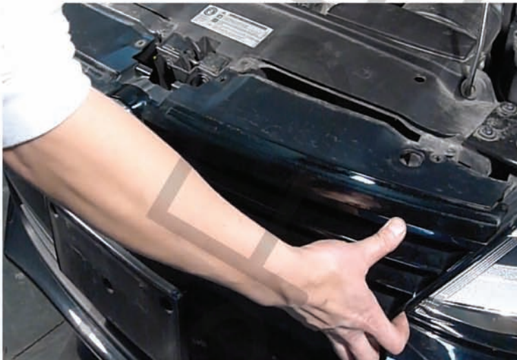
3. Remove the front grill