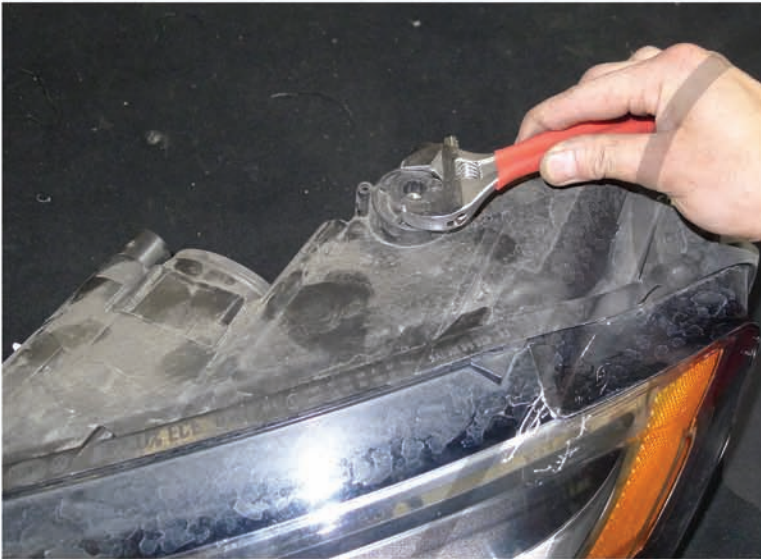
13. Remove the 24mm plastic mounting bolt