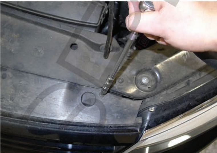
27. Tighten the (4) T25 screws Please repeat the steps in order from 1 to 27 for the opposite side.