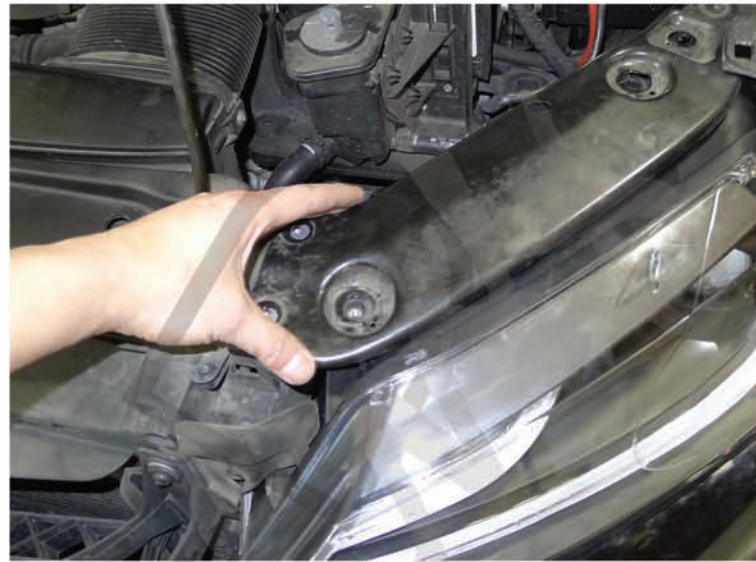
24. Replace the metal bracket