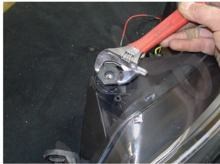
18. Install the 24mm mounting bolts on the new headlight