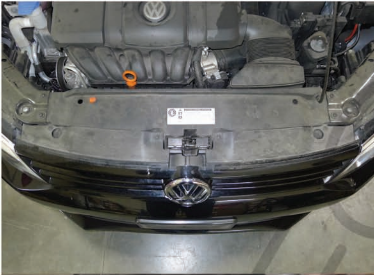
1. (4) T25 screws location

Do not make direct contact with the halogen bulbs or the wire assembly until the unit has cooled down after use.