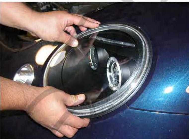
9. Install the headlights