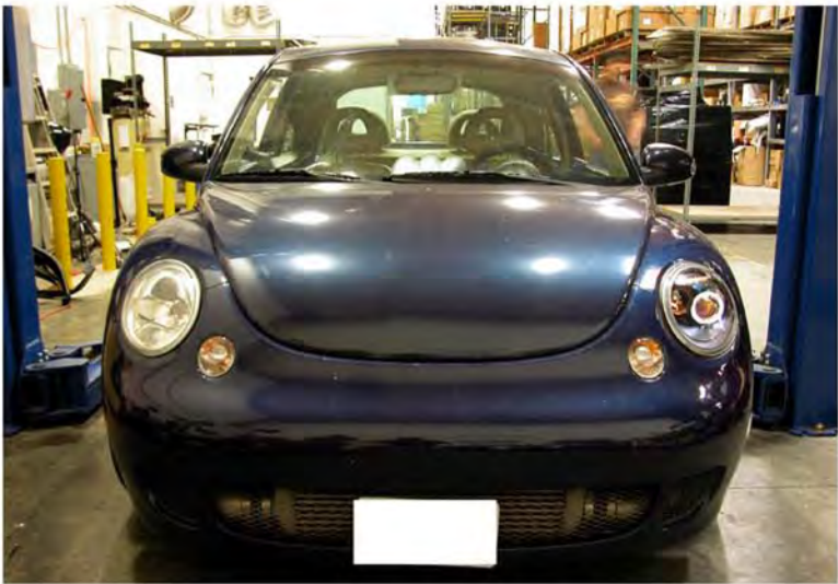
11. Please repeat the picture order from 1 to 11 for the opposite side