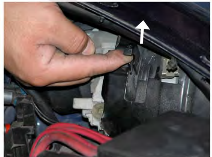
4. Pull the latch to unlock the headlight