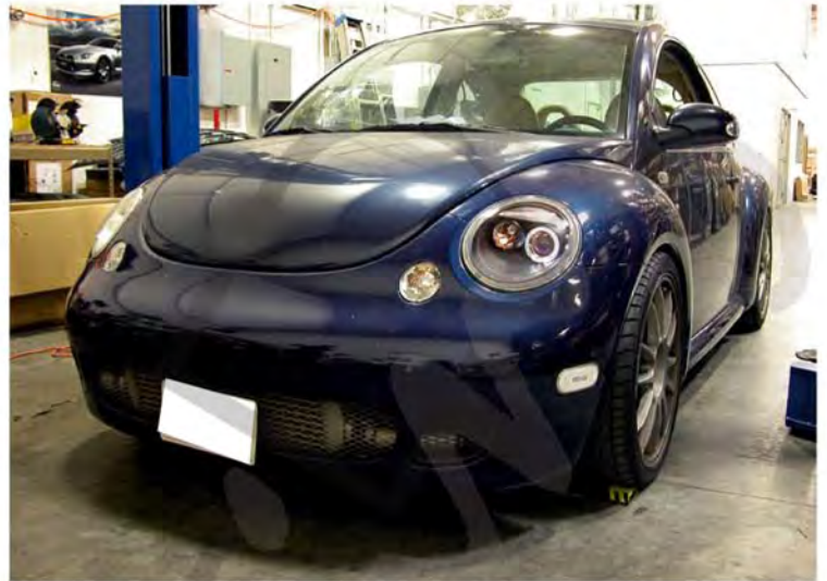
12. The installation now is complete