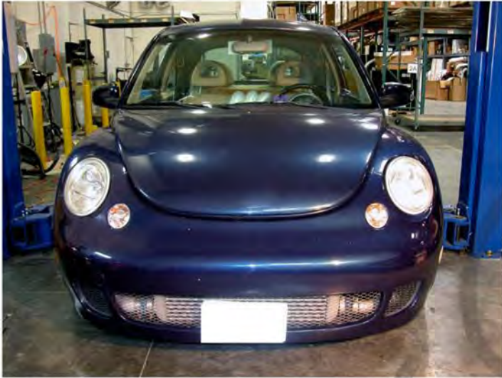
1. Open the hood