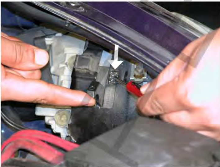
3. Use a flat tip screwdriver to push down the button