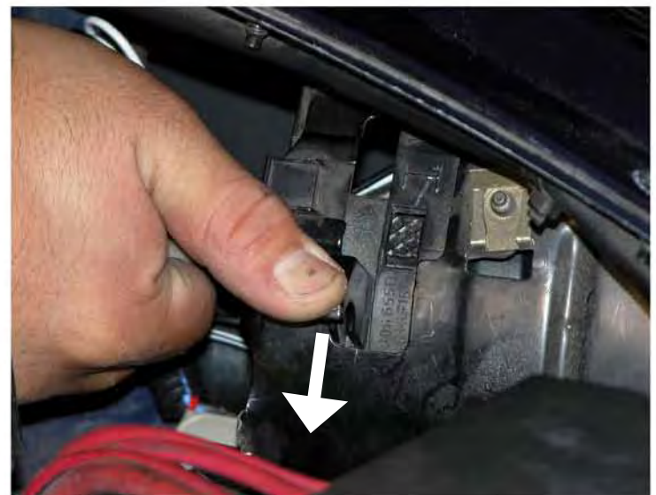
10. Push the latch back to the original spot to lock the headlight