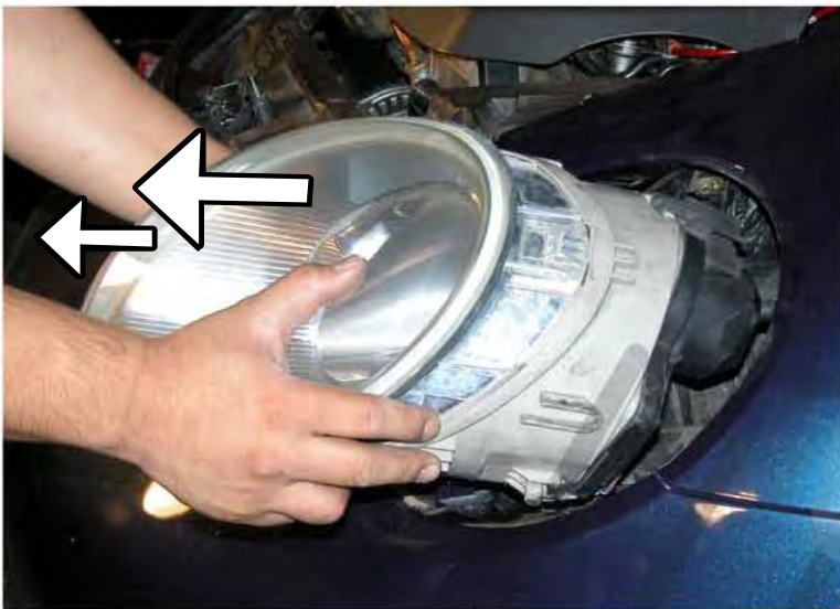
7. Remove the headlight