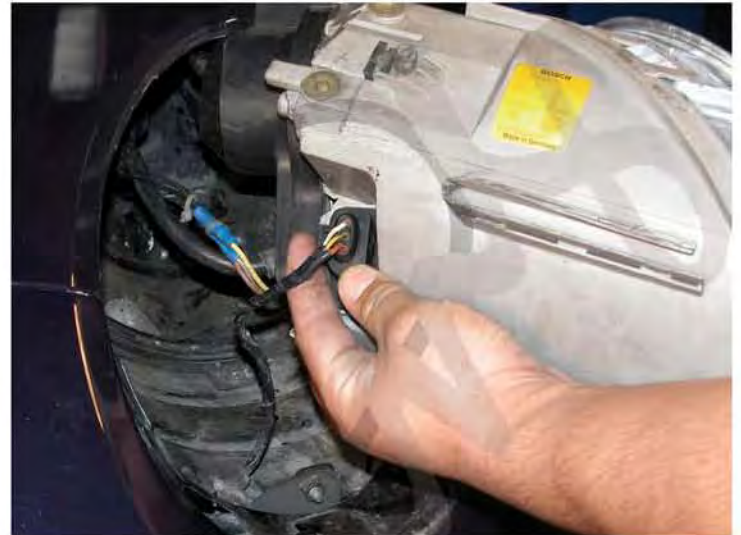
6. Remove the connectors from the headlight