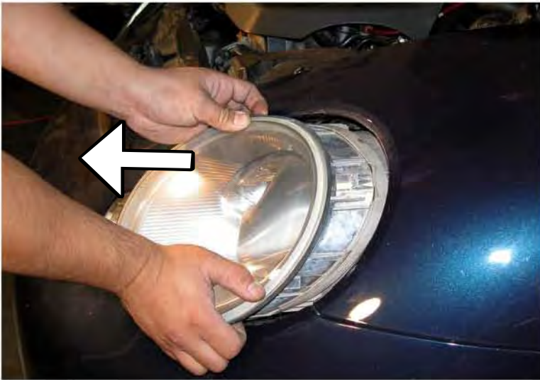
5. Pull out the headlight slightly, just enough to see the back of the headlight