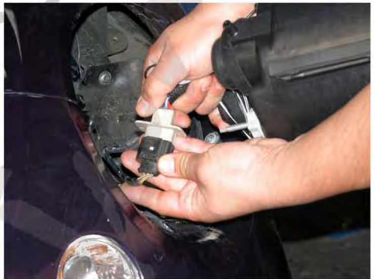
8. Bring the projector headlights to the vehicle and connect the headlight connector