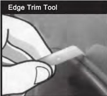
Edge Trim Tool

Fully tighten all the screws starting with the newly installed screws in the upper two hole locations while pressing in on the flare to ensure it is snug against the sheet metal