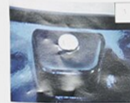
Place a Bot Washer (WA1-0012) over the end of each Bolt (B01-0007) and tighten using a 1/2" wrench for the Bolt and the supplied Torx Bit (T01-0002) for the Bolt. Repeat for remaining pockets.