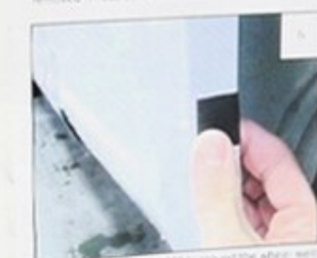
Wrap a Foam Tab (MT1-0014) around the wheel well sheet metal, centered over the mark made in Step 5. Use steel nails, centered over the mark made in Step 5.