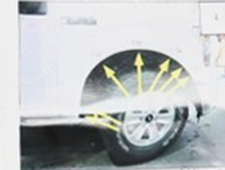
Remove the factory screws with a 7/32" socket wrench. Remove two rear most factory screws with 9/32" socket wrench. Save screws for reinstallation. Note: For Platinum Edition, there are additional screws to be removed. These screws will be used for reinstallation.