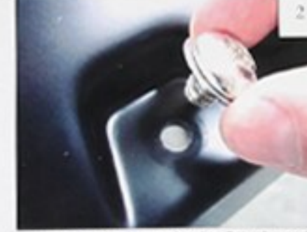
Put each Bot Washer combination through a pocket hole in the flare. Bot head and Washer on the outside.