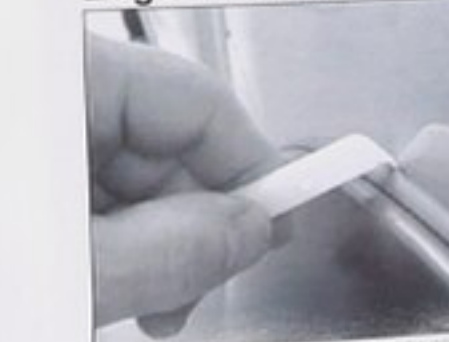
Using supplied Edge Trim Tool (ET1-0002), seal edge trim against vehicle by hooking curved end under edge trim at one end of flare. "S" clip (CL1-0005) placed around outer edge of flare to the other end.