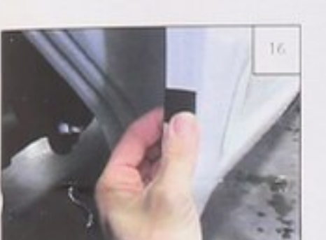
Wrap a Foam Tab (MT1-0014) around the wheel well sheet metal, centered over each of the upper four marks made in Step 15. Place a Mylar Tab (MT1-0014) at the mark made on the lower front of the wheel well.