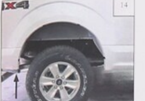
Remove factory listener from rear of wheel well. Thoroughly clean the vehicle sheet metal and inner fender prior to installation.