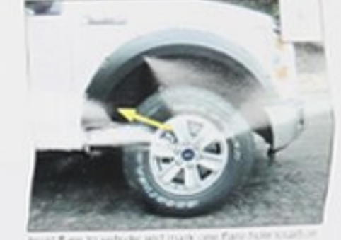
Hold flare to vehicle and mark one flare hole location with a grease pencil.