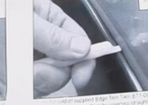
Fit end of supplied Edge Trim Tool (ET1-0002) under edge trim against flare by inserting straight end between edge trim and flare at one end. Next, slide around outer edge of flare to the other end.