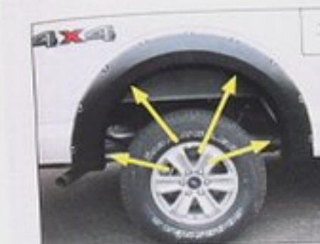
While holding flare to vehicle, start supplied screws (SW1-0058) through the four topmost mounting holes in flare and into the clips installed in Step 18.