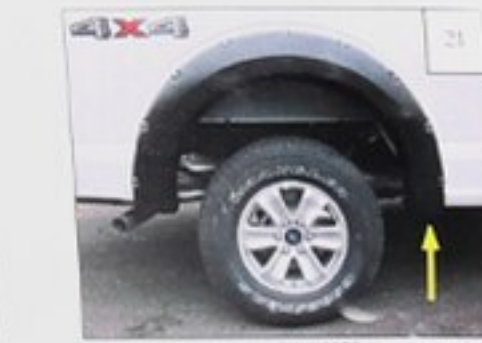
Start a supplied screw (SW1-0058) through the flare into the clip, installed in Step 18. Tighten all screws.