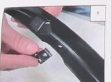
Attach 3 'U' clips (CL1-0022) to the inner bracket as shown.