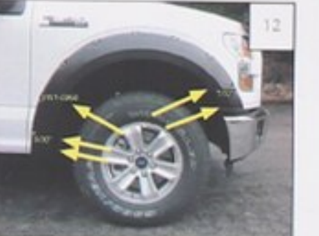
Still holding flare to fender, re-install remaining factory screws removed in Step 4 using 7/32" and 9/32" sockets and wrench. Using a phillips screwdriver, install supplied screw (SW1-0058) into Clip (CL1-0009). Tighten all screws.