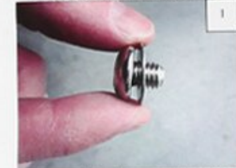
Put a Washer (WA1-0012) on each Bolt (B01-0007).