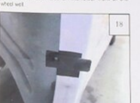
Install a Clip (CL1-0009) over each of the four Tabs (MT1-0014) placed over the upper 4 marks made in Step 16.