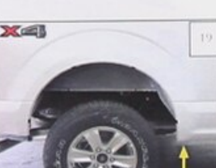
Install a supplied "S" clip (CL1-0005) over the mylar tab installed at the lower front of the rear wheel well.