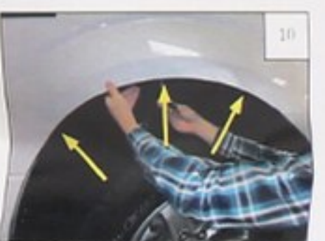
Using a 7/32" socket wrench, re-install the factory screws through the inner piece.