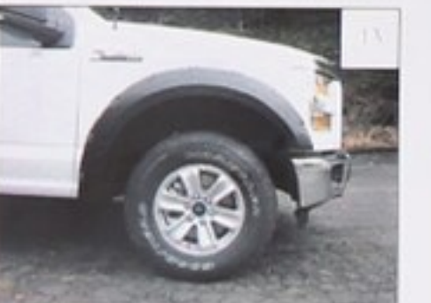
Completed front flare installation.