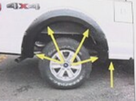
Hold flare to vehicle and mark five flare hole locations with a grease pencil.