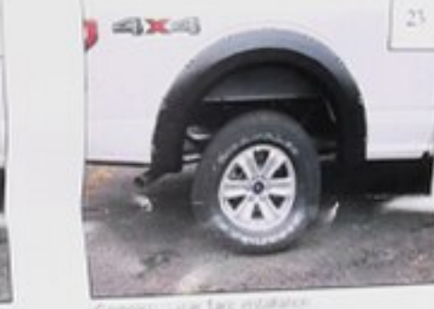
Completed rear flare installation.