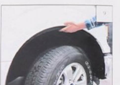
Line up the holes in the inner piece with the three uppermost factory holes. NOTE: Driver's side inner piece is marked with an "LR" and passenger's side inner piece is marked with an "RR".