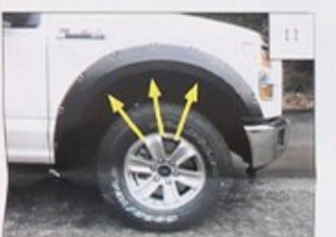
Position flare on fender, pressing inward on the flare. Line up the flare mounting holes with the mounting clips on the inner piece. Install 3 Phillips Truss Screws (SW1-0058) through the flare and into the clips on the inner piece. Do not tighten. (3 locations).