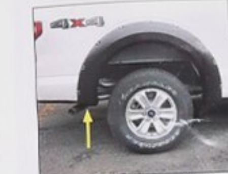
Install supplied push retainer (RV1-P0006) into flare and through factory hole at rear of wheel well.