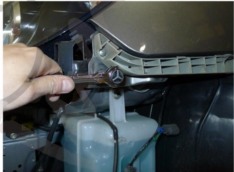
14. Remove the 10mm bolt