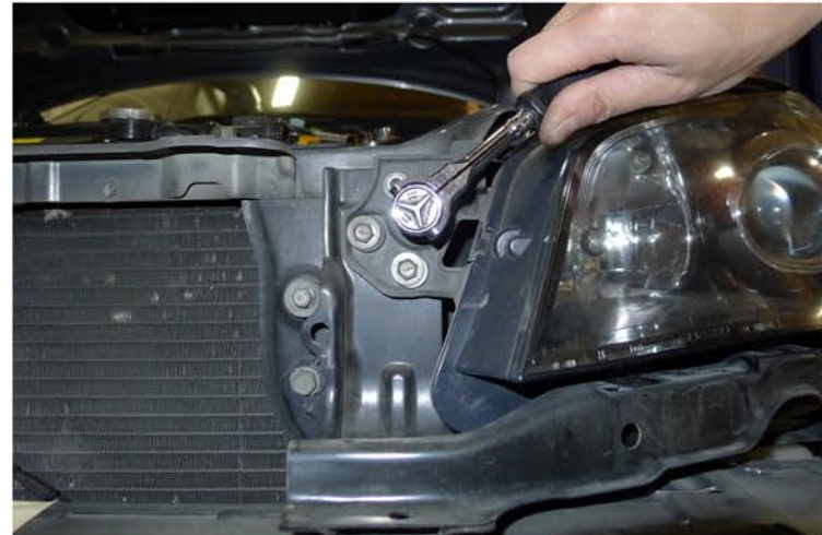
16. Remove the (2) 10mm nuts and the (2) 10mm bolts