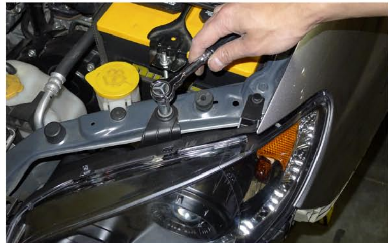
28. Tighten the 10mm bolt