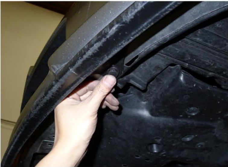
37. Replace the (7) plastic clips