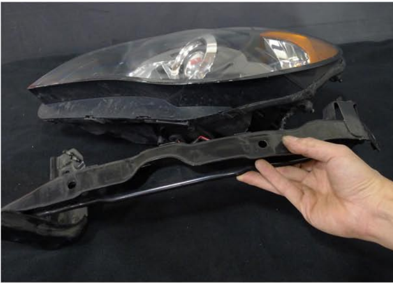
23. Remove the metal bracket