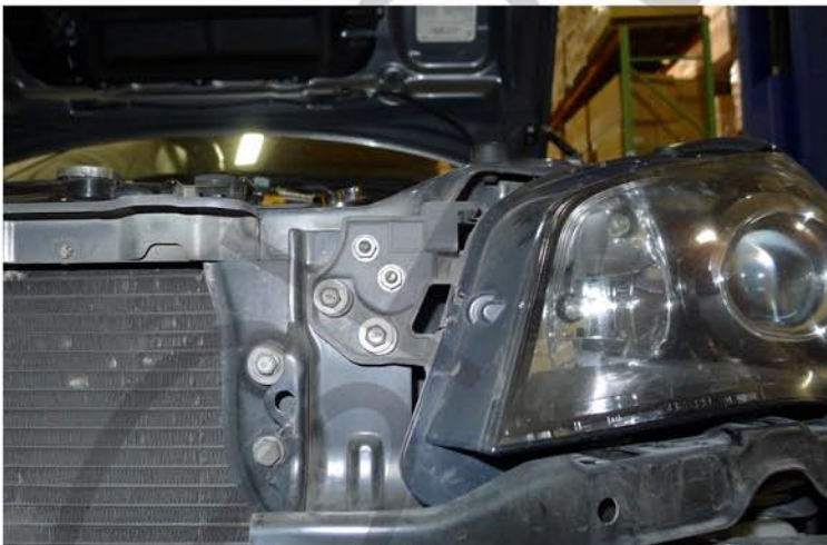
15. (2) 10mm nut and the (2) 10mm bolts location