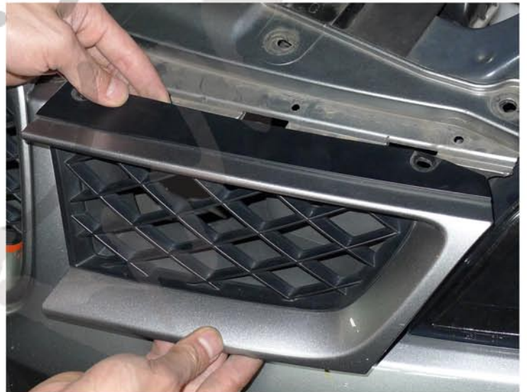
8. Remove the grill