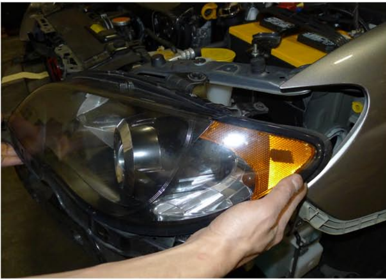
17. 10mm bolt and the plastic clip location