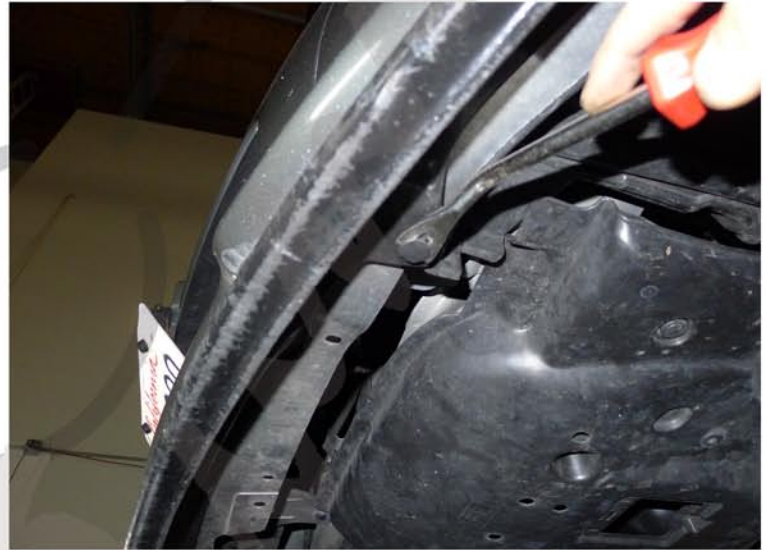
2. Remove the (7) plastic clips