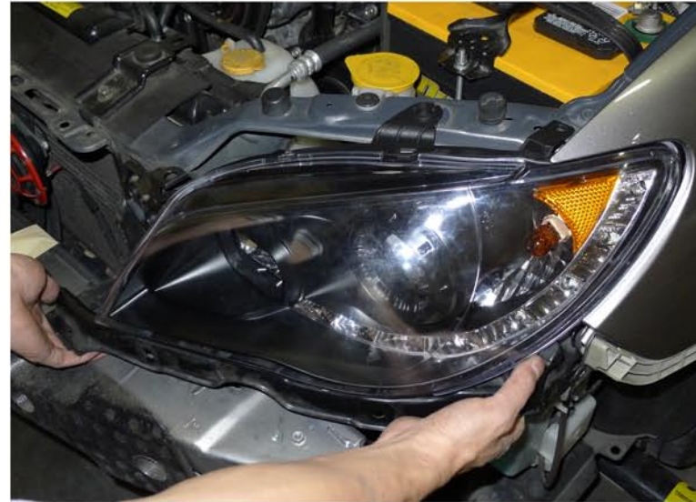
26. Place the new headlight in the stock location