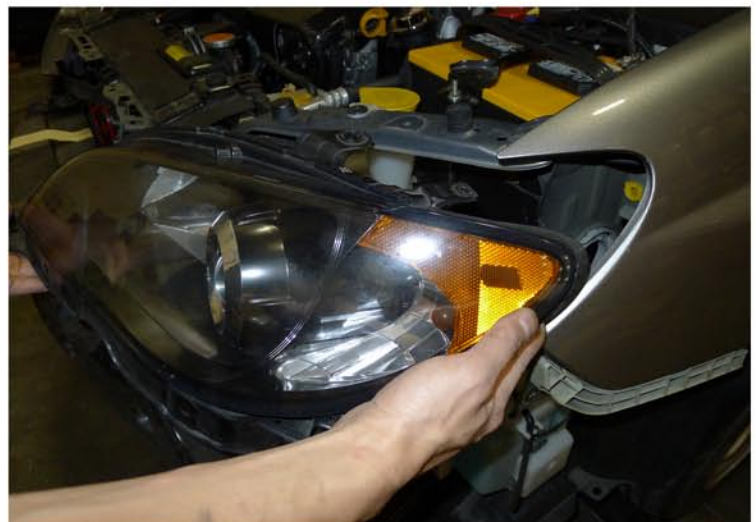
22. Remove the headlight