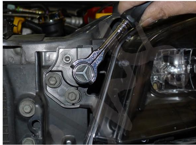
30. Tighten the (2) 10mm nuts and the (2) 10mm bolts