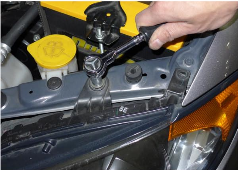
19. Remove the 10mm bolt