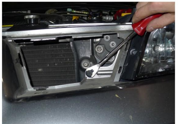
10. Remove the plastic clip