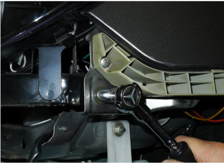
29. Tighten the 10mm bolt