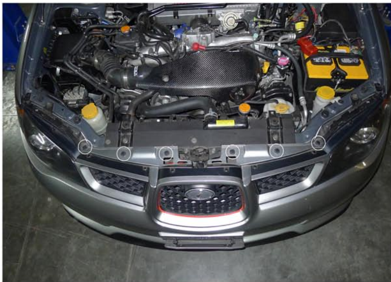
5. Location of the (6) plastic clips