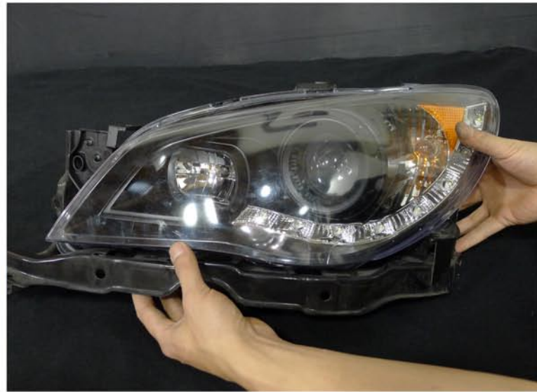
24. Place the metal bracket on the new headlight