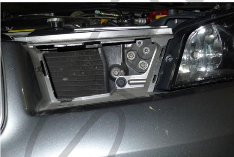
9. Plastic clip location