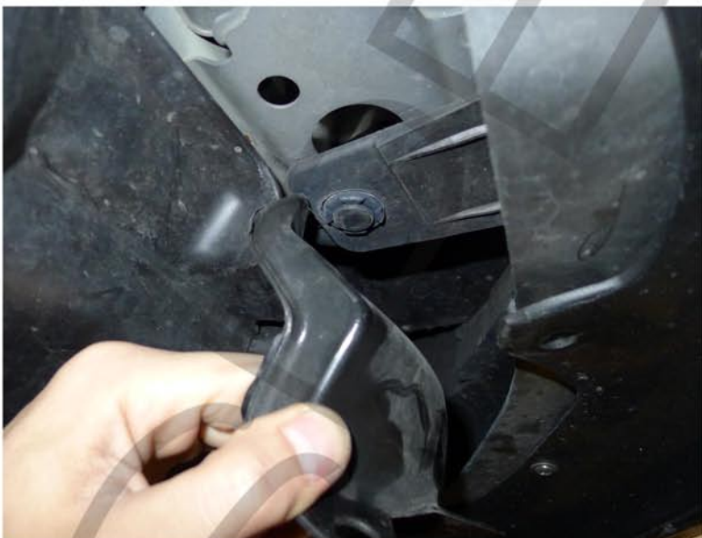
3. Plastic clip location