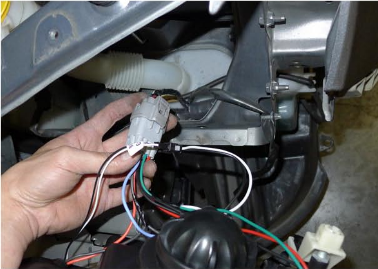
25. Connect the headlight harness to the new headlight