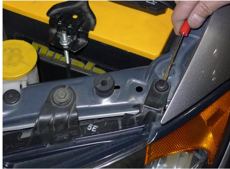
18. Remove the plastic clip