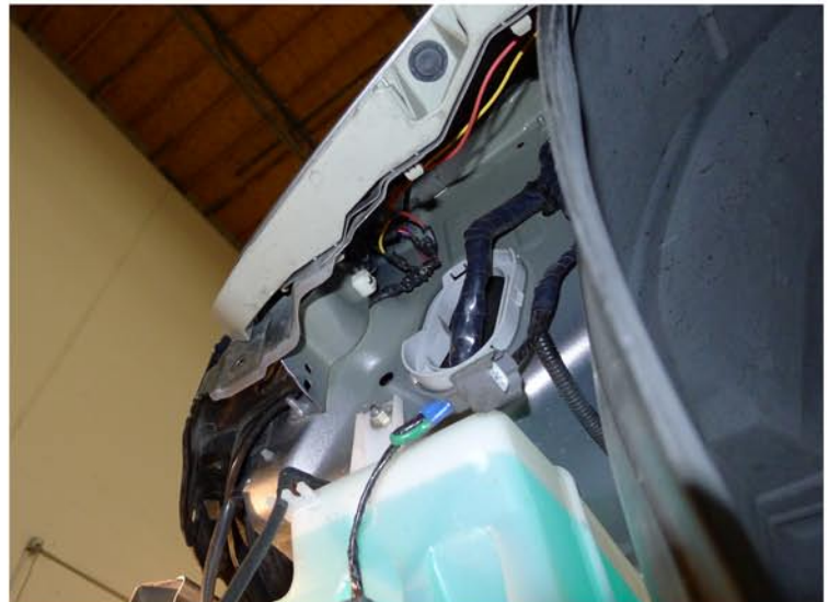
20. Undo the plastic retainer