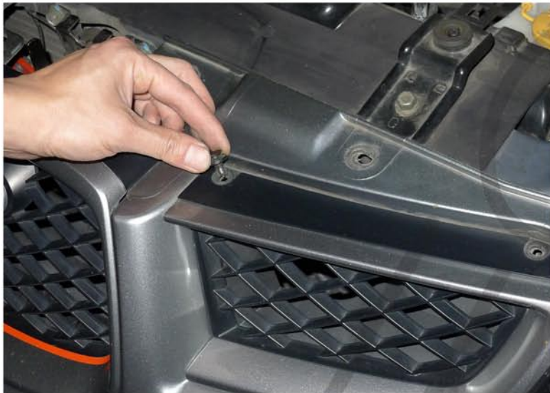
7. Remove the (2) plastic clips