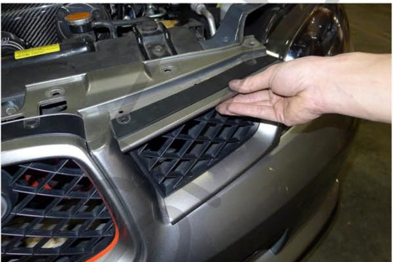
33. Replace the grill