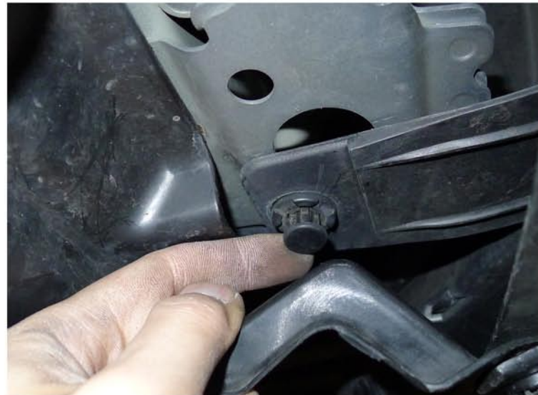
36. Replace the plastic clip located under the splash guard