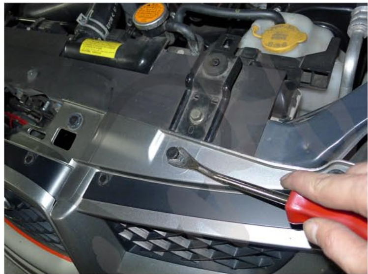
6. Remove the (6) plastic clips