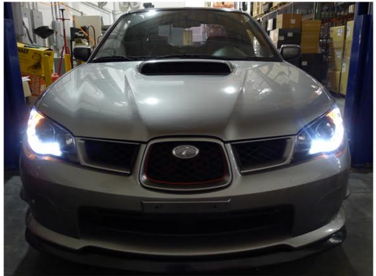
38. The installation is now complete