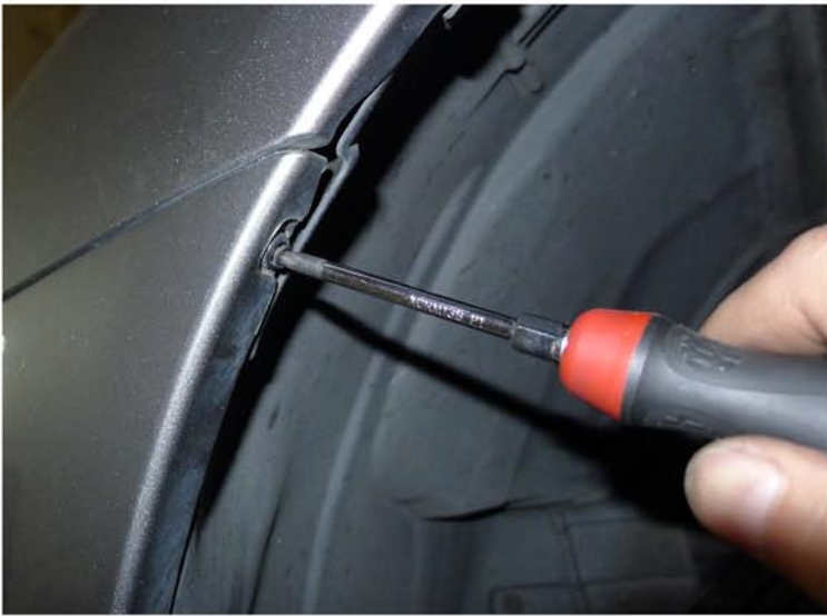
11. Remove the plastic clip