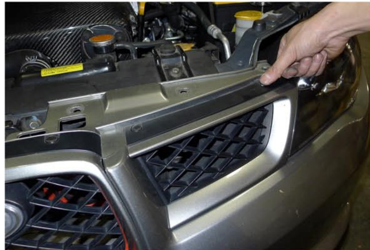
34. Replace the (10) plastic clips on the top side of the bumper