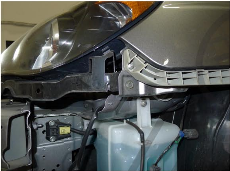
13. 10mm bolt location