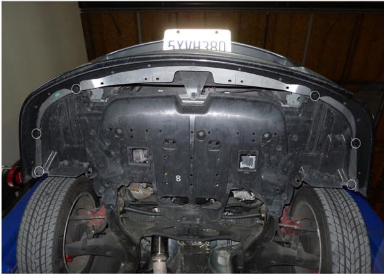
1. (7) Plastic clips location

Do not make direct contact with the halogen bulbs or the wire assembly until the unit has cooled down after use.