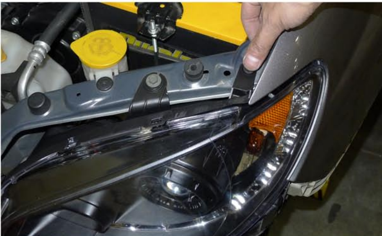
27. Replace the plastic clip