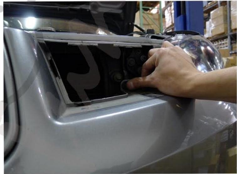
32. Replace the plastic clip