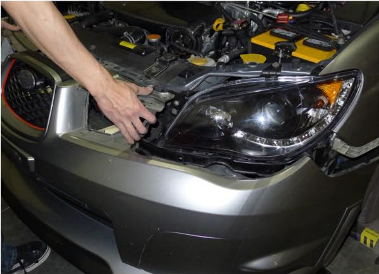
31. Replace the front bumper