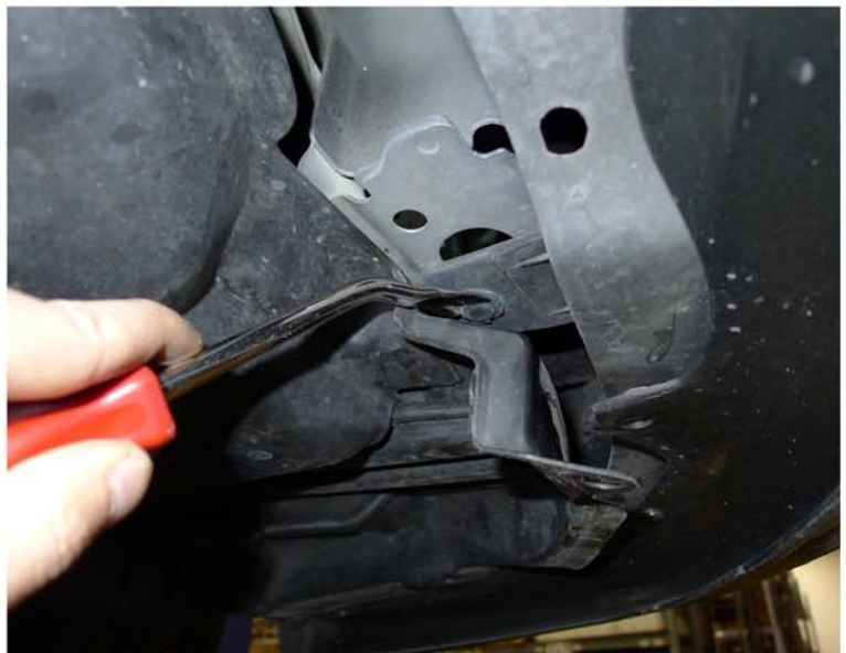
4. Remove the plastic clip located under the splash guard