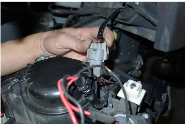
21. Disconnect the headlight harness Please see the "Halo and L.E.D installation instructions" If your headlights don't have HALO or L.E.D. You can skip this step