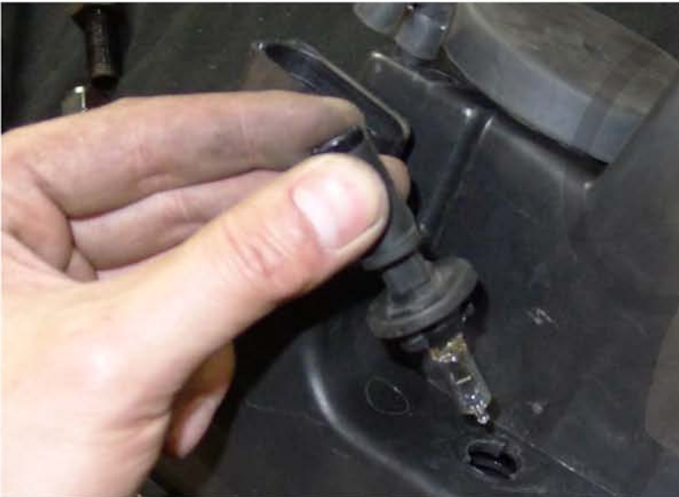
25. Place the turn signal bulb into the new headlight