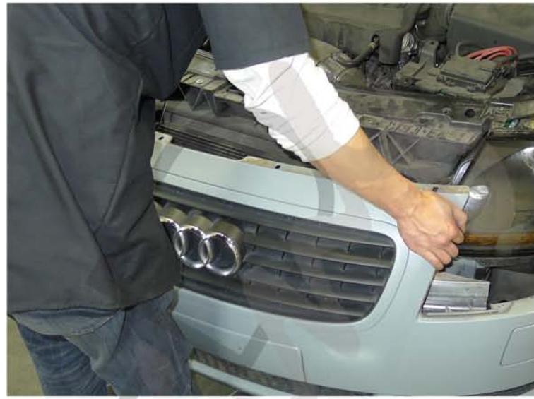
18. Remove and set aside front bumper