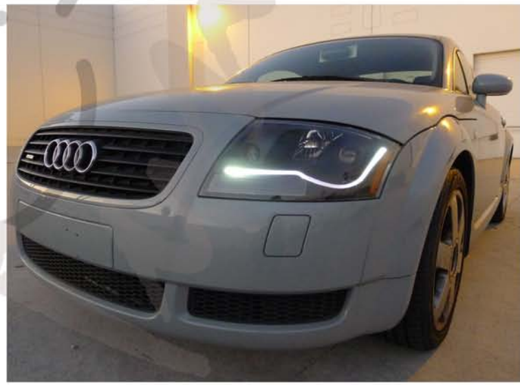
32. The installation is now complete