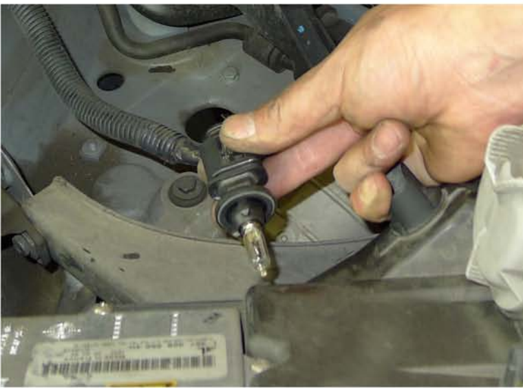
23. Disconnect the turn signal socket