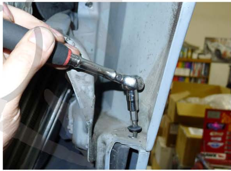
8. Remove the T25 screw