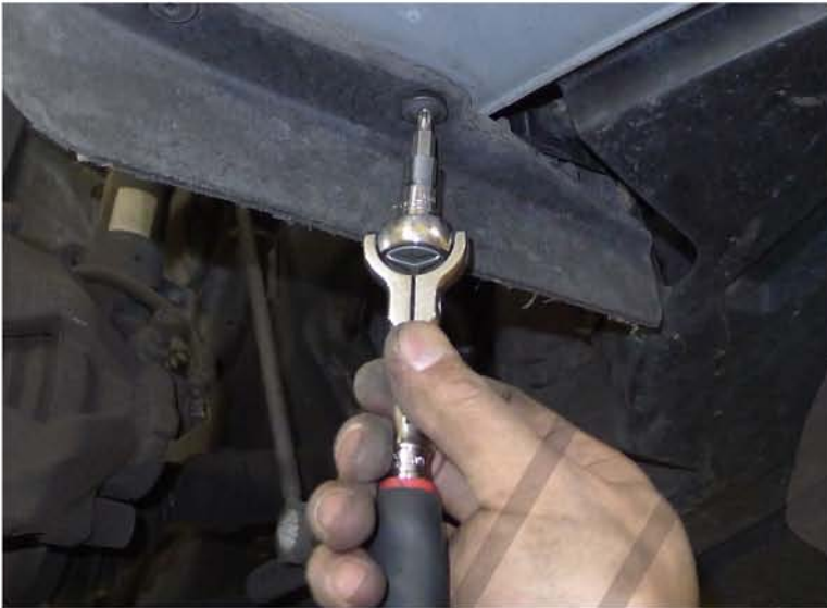
31. Tighten (4) T25 screws Please repeat the steps from 1 to 31 for the opposite side