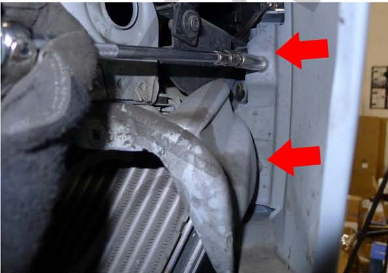
33. Tighten (2) 10mm nuts