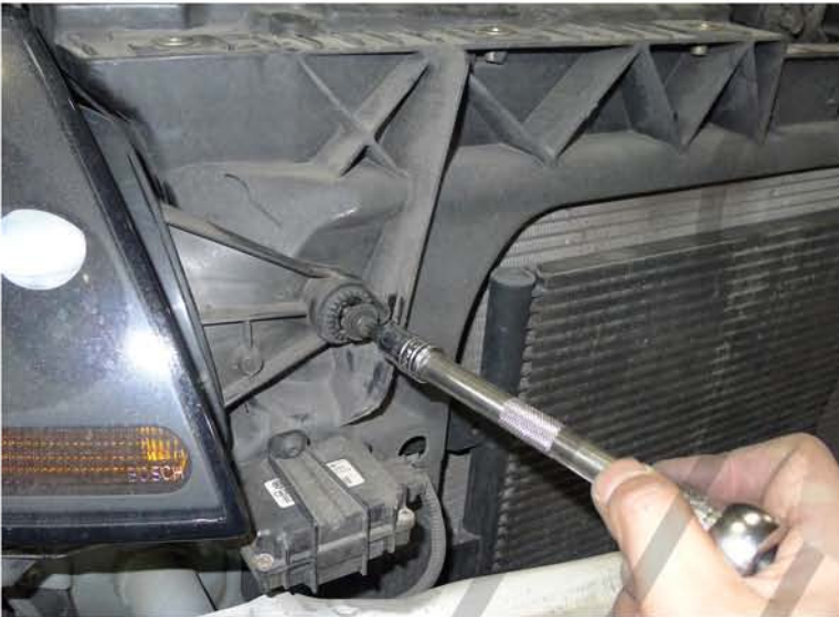
19. Remove the plastic clip