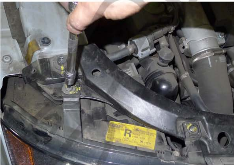
21. Remove (2) T30 bolt