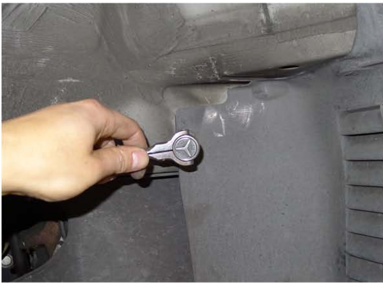
5. Remove (5) T25 screws