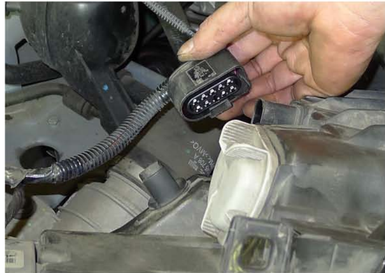
22. Remove the headlight and disconnect the headlight harness