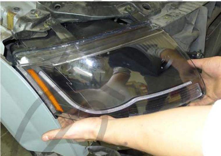
27. Place the headlight in the stock location