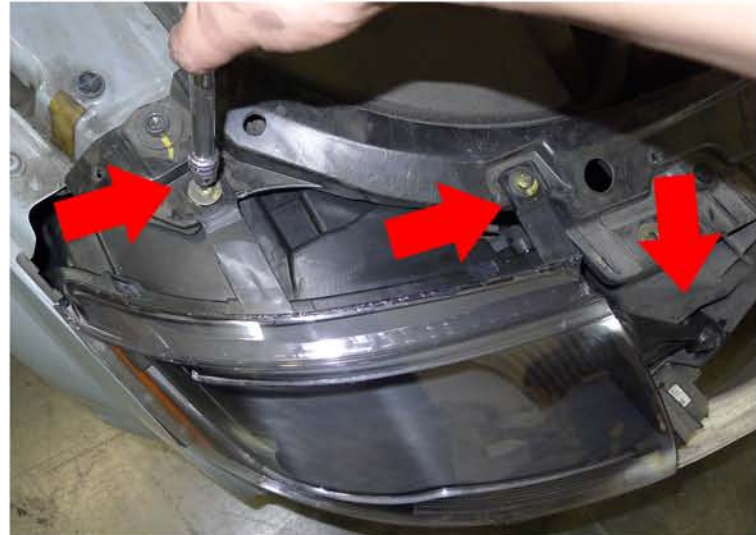
28. Tighten the T30 bolt