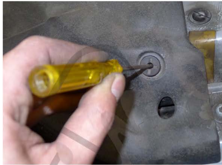
12. Press down the center button of the plastic clips