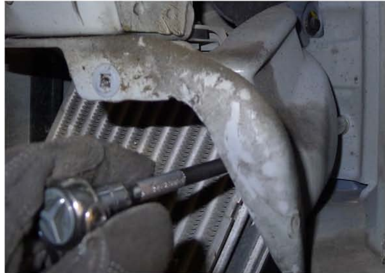
10. Remove (2) 10mm nuts