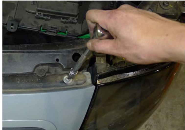
16. Remove (6) plastic bolts