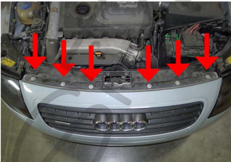
15. (6) T30 bolts location