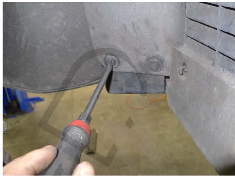
6. Release (2) plastic clips