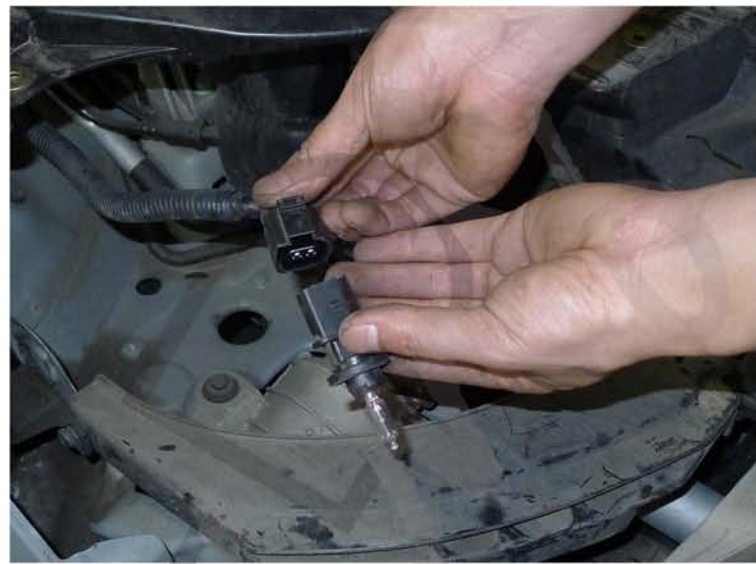
24. Remove the turn signal bulb