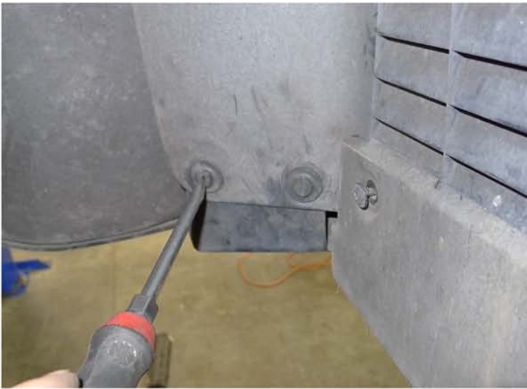
29. Lock (2) plastic clips