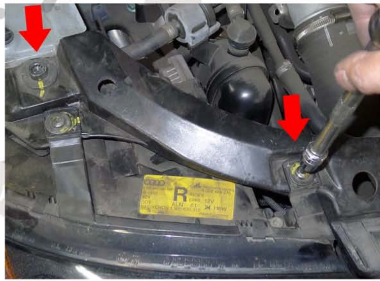
20. Remove (2) T30 bolt