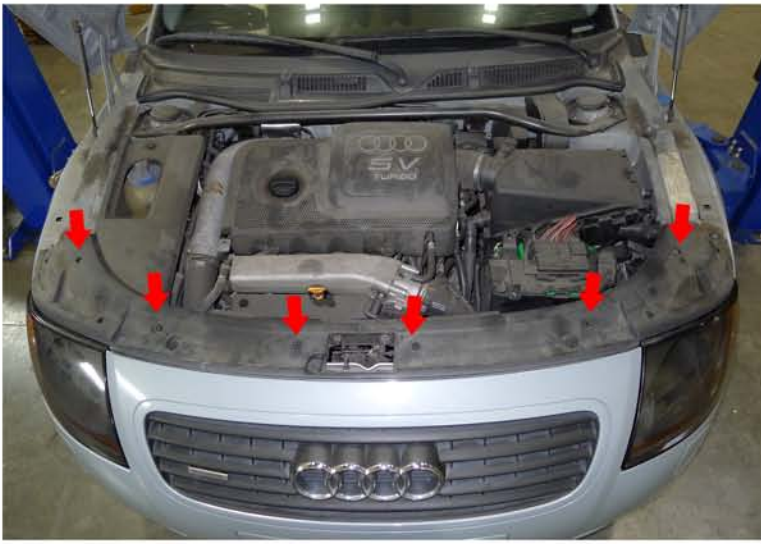
11. (6) Plastic clips location