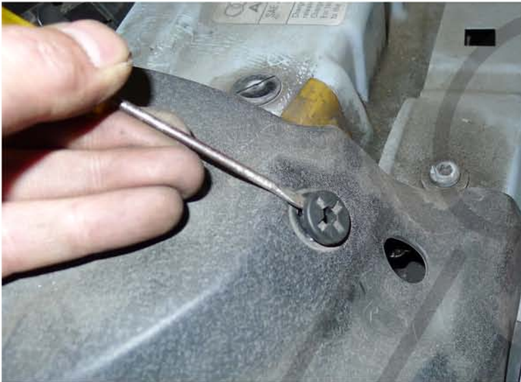
13. Remove (6) plastic clips