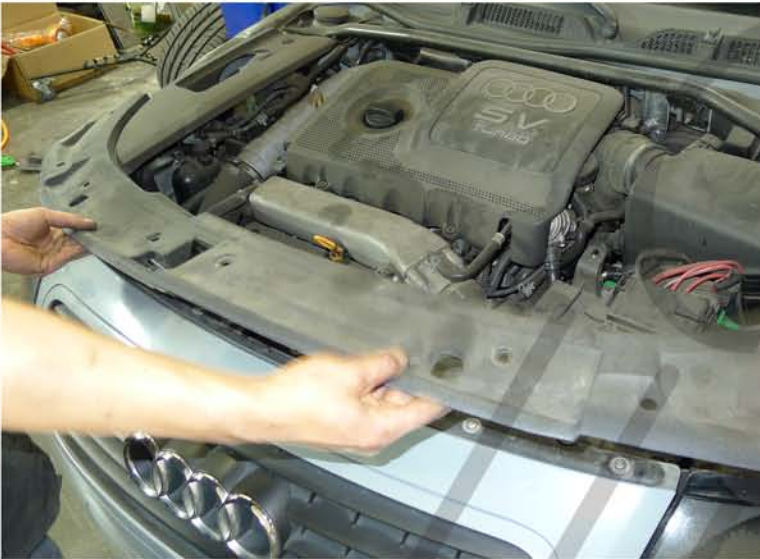
31. Replace the plastic cover