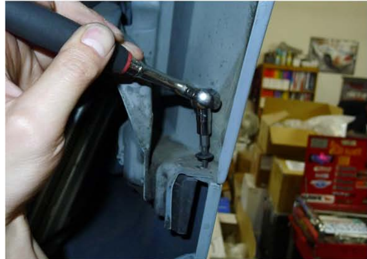
34. Tighten the T25 screw