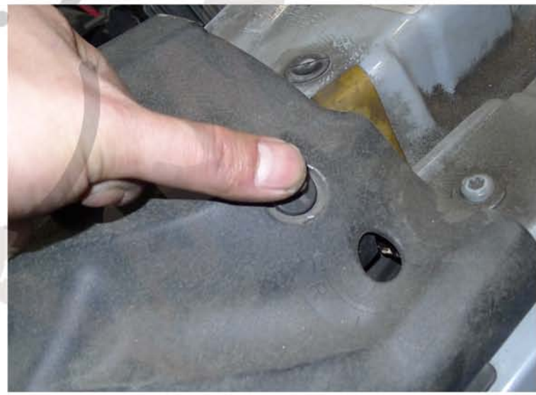
32. Replace (6) plastic clips