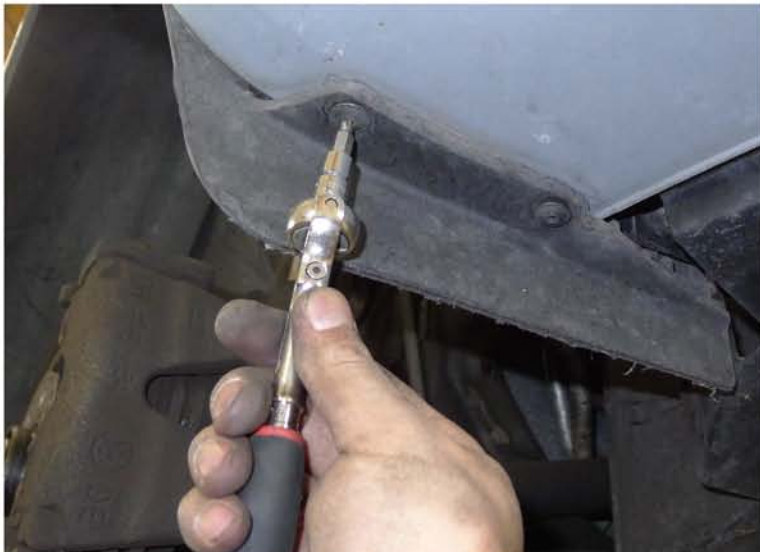
3. Remove (4) T25 screws