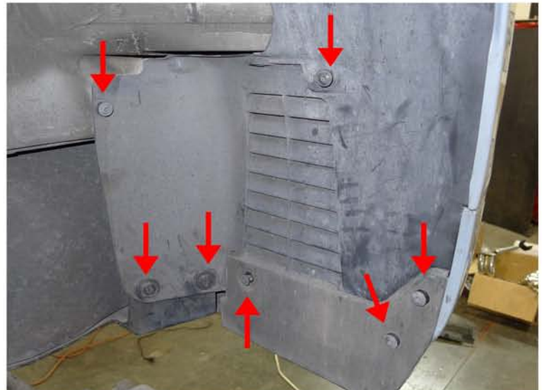
4. (5) T25 screws and (2) plastic clips location