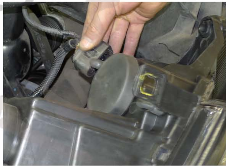
26. Connect the headlight harness to the new headlight Please see the " L. E. D. head lights installation instructions" If your head lights don't have L.E.D. You can skip the installation instruction.