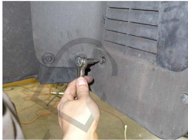
30. Tighten (5) T25 screws