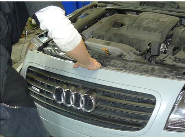
29. Replace the front bumper