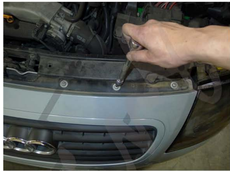
30. Tighten (6) T30 bolts