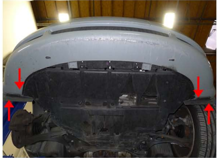
2. (4) T25 screws location