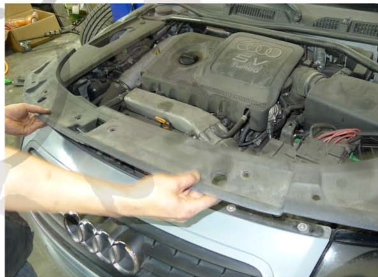
14. Remove the plastic cover