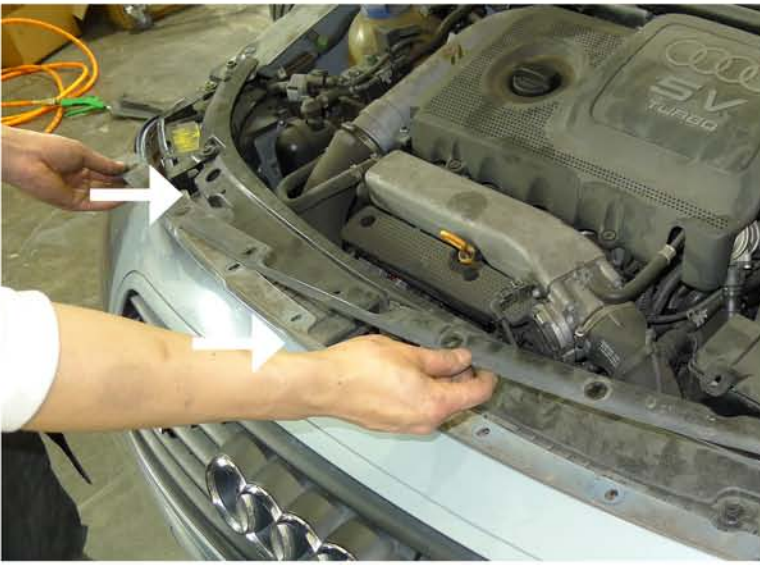
17. Remove the metal bracket