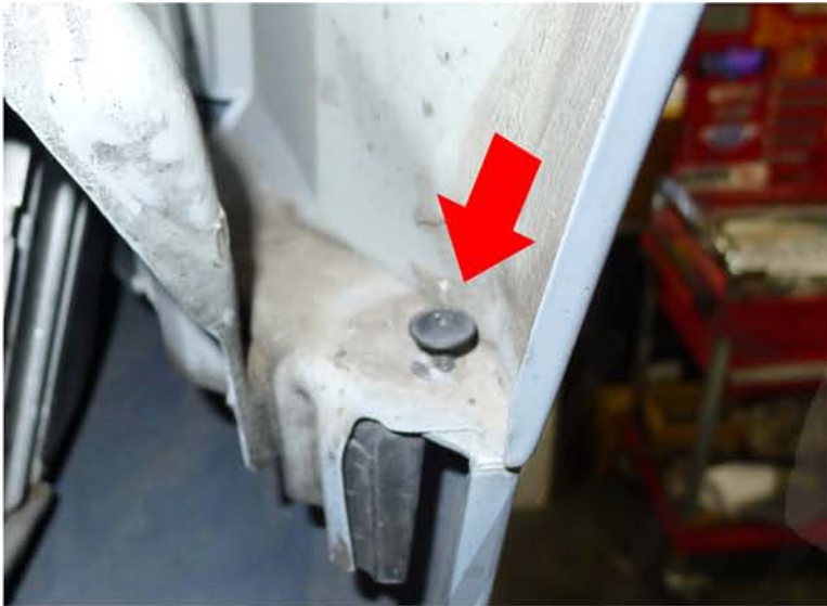
7. T25 screw location