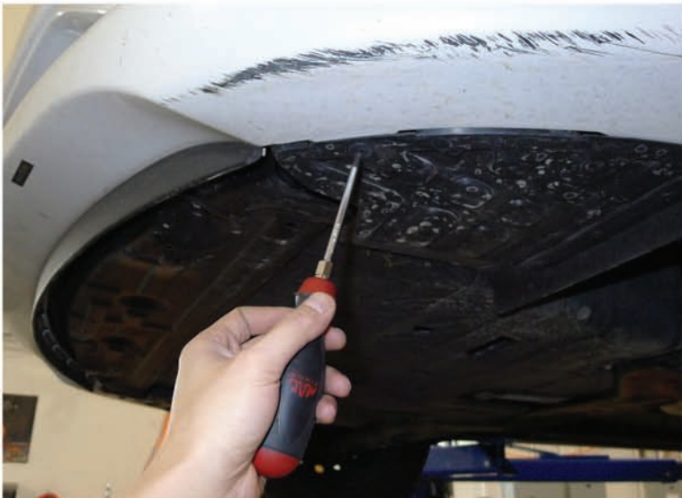
3. Remove the (4) plastic clips