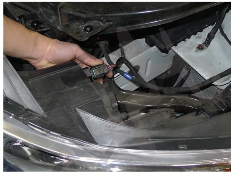
12. Disconnect the headlight harness