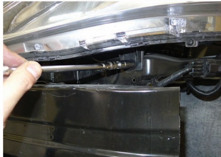
16. Tighten the 10mm bolt