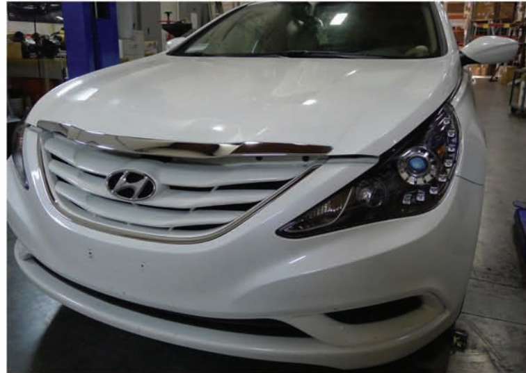
22. The installation now is complete