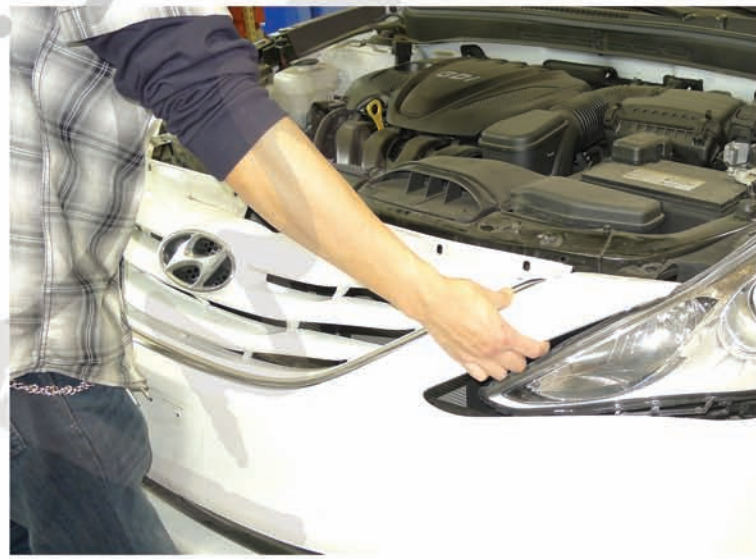
8. Remove the front bumper