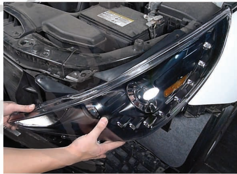
14. Place the headlight in the stock location

Please see the " L. E. D. headlights installation instructions" If your headlights don't have L.E.D. You can skip the installation instruction.