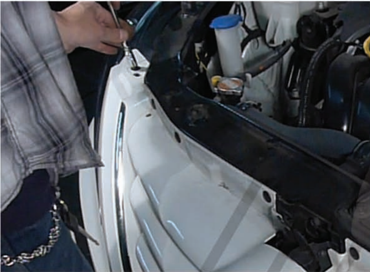
19. Tighten the (2) 10mm bolts