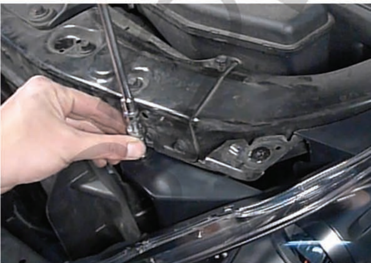
15. Tighten the (2) 10mm bolts