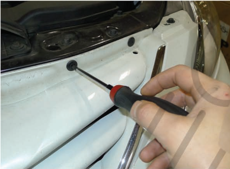
7. Remove the (6) plastic clips