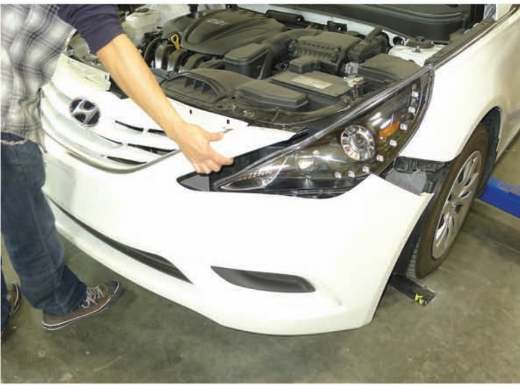
17. Replace the front bumper