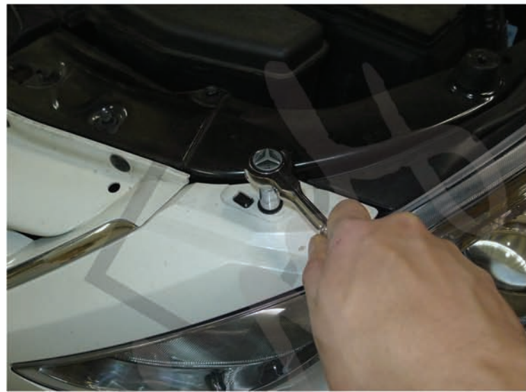
6. Remove the (2) 10mm bolts