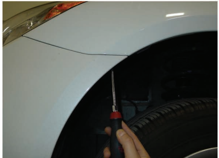
4. Remove the phillips head screw