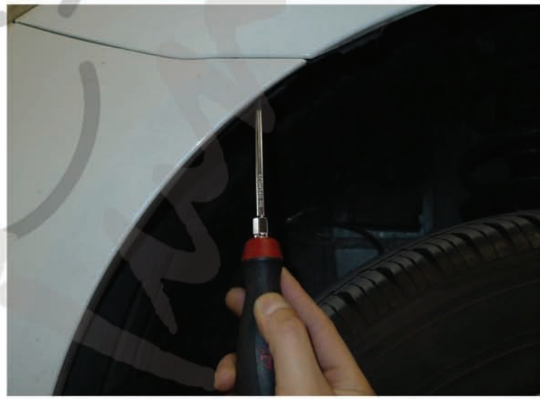
20. Tighten the phillips head screw