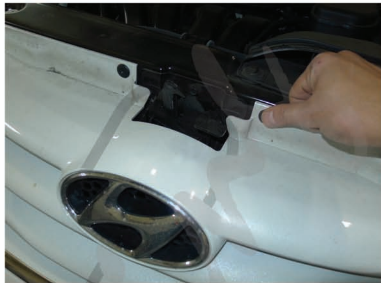
18. Replace the (6) plastic clips