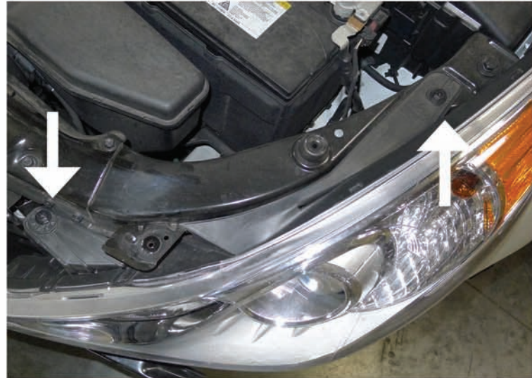
10.. 2 10mm bolts location