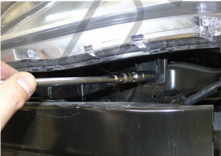
9. Remove the 10mm bolt