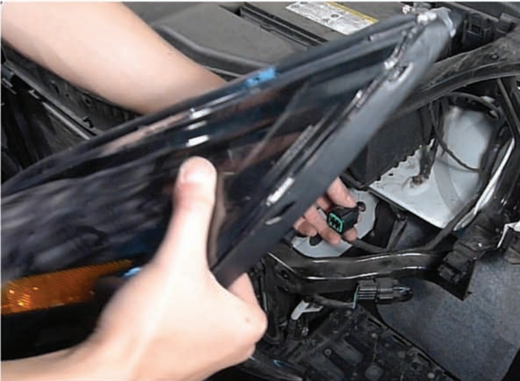
13. Connect the headlight harness to the new headlight

Please see the " L. E. D. headlights installation instructions" If your headlights don't have L.E.D. You can skip the installation instruction.