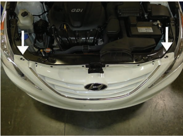
5. (2) 10mm bolts and (6) plastic clips location