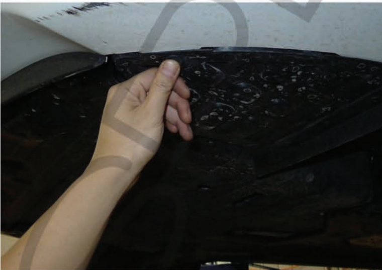
21. Replace the (4) plastic clips Please repeat the steps from 1 to 21 for the opposite side