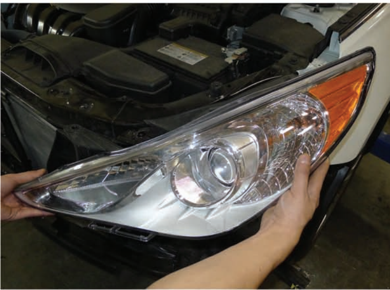
11. Remove the headlight