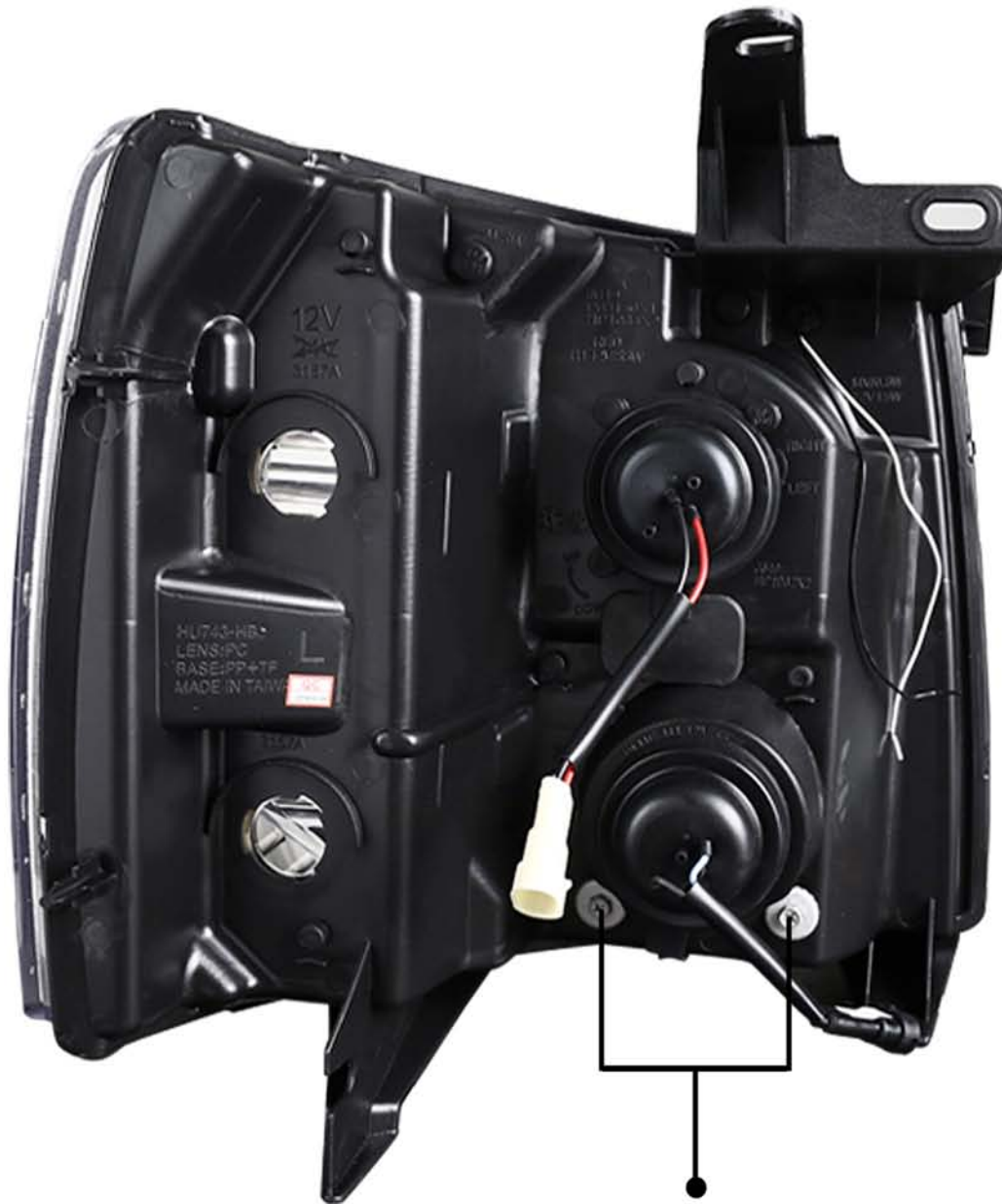
LOW BEAM ADJUSTMENT SCREWS