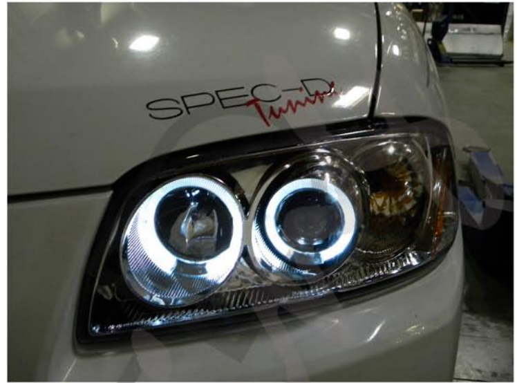
12. The installation is now complete