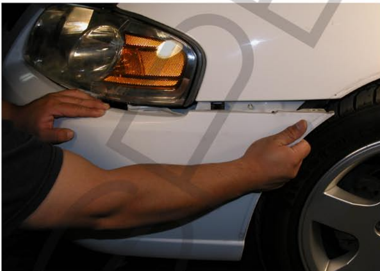
3. Pull out the bumper