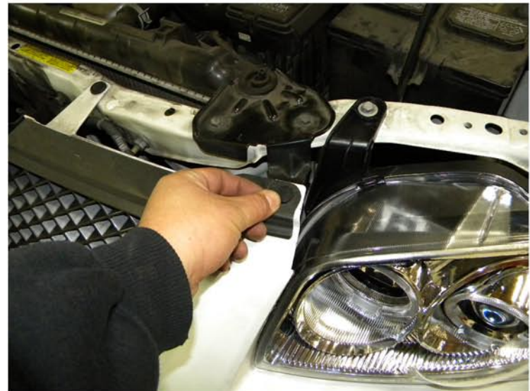
10. Install four clips