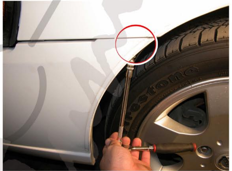
2. Remove first 10mm bolt at side of bumper