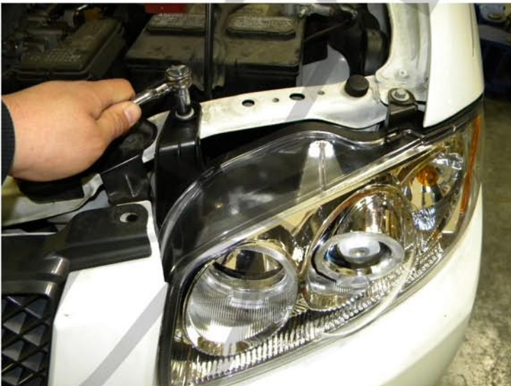
9. Install two 10mm headlight bolts