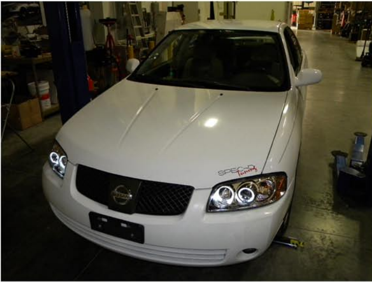
11. Please repeat the steps from 1 to 10 for opposite side