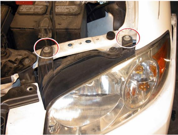
5. Remove two 10mm headlight bolts