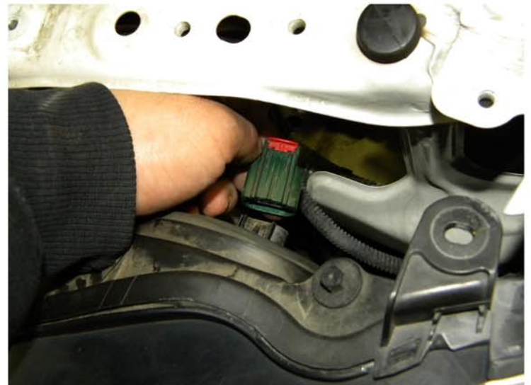
4. Disconnect headlight harness