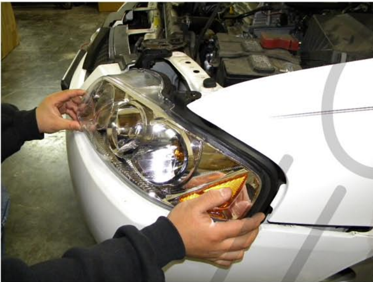
7. Install new projector headlight