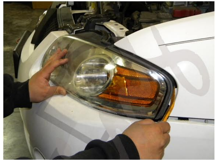
6. Remove headlight