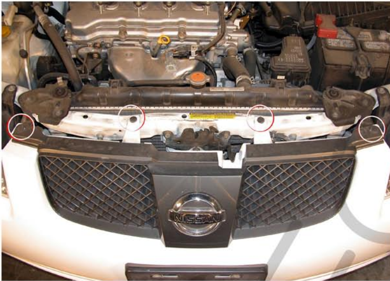
1. Remove four clips

If you experience any difficulties that the instruction did not cover, Please seek local auto shop for advise. Please wear protection before you work on your vehicle. An assistant is helpful when removing the front bumper. Please be careful while working with the bumper or body part to avoid scratching. Do not make direct contact with the halogen bulb or the wire assembly until the unit has cooled down after use.