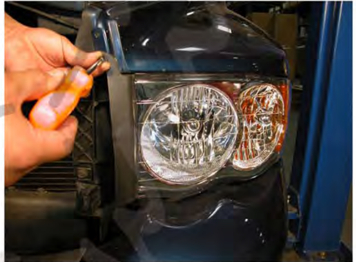
2. Remove the clip first