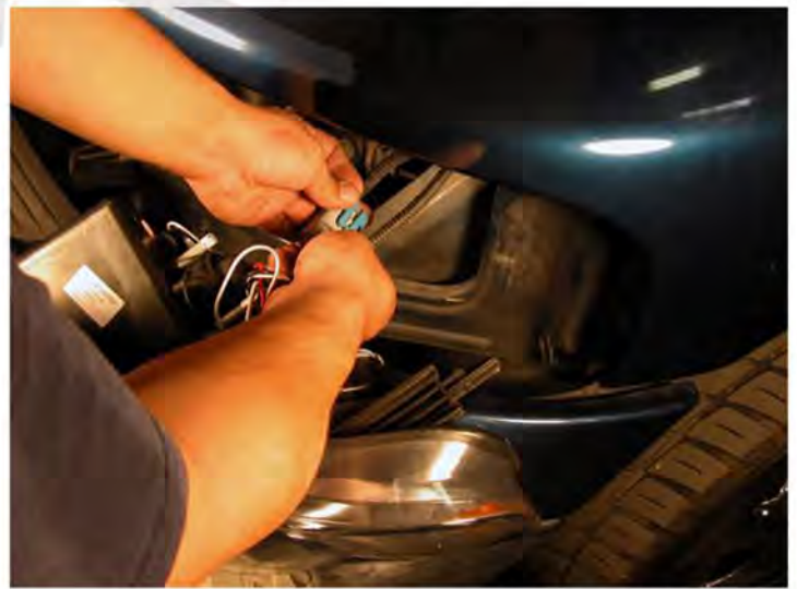
4. Gently pull the headlight out slightly enough to see the back of the headlight and disconnect all the connectors from the headlight. After disconnected, then remove the headlight