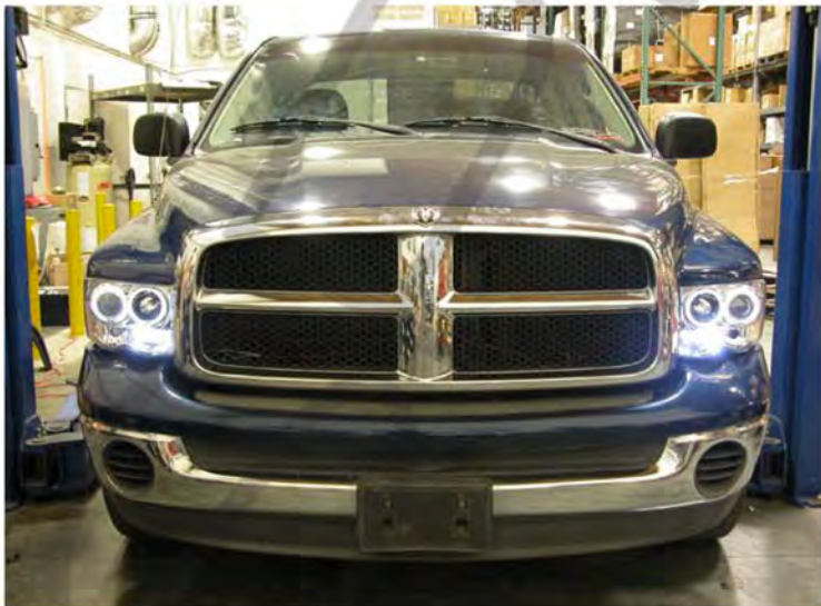
9. The installation is now complete