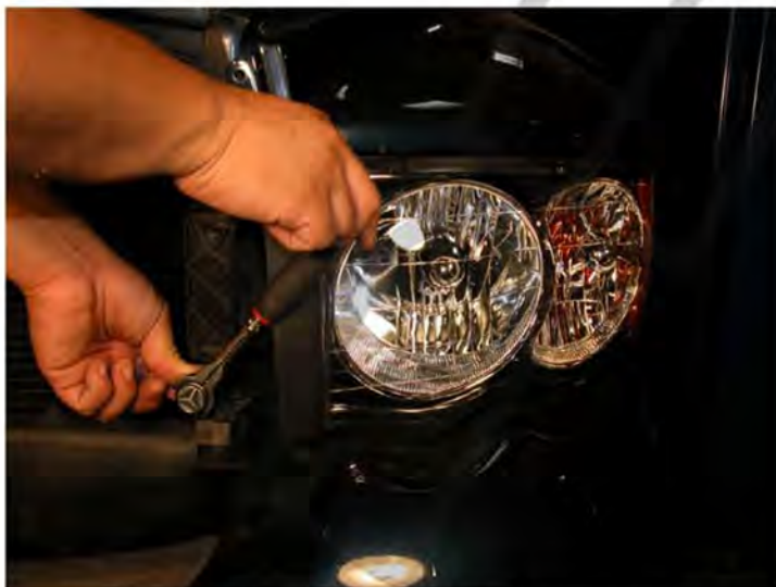
3. Then remove the two 10 mm bolts from the headlight