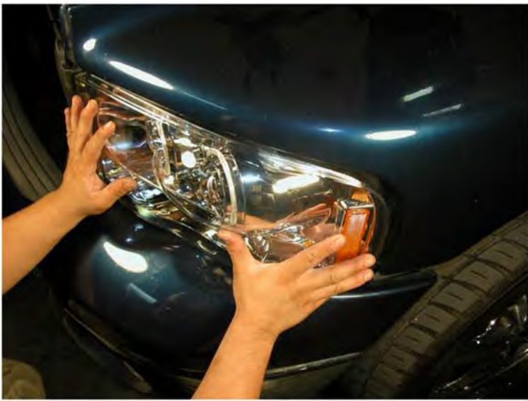
5. Connect all the connectors before you install the headlight Please see the "Halo and L.E.D installation instructions" If your headlights don't have HALO or L.E.D. You can skip that step