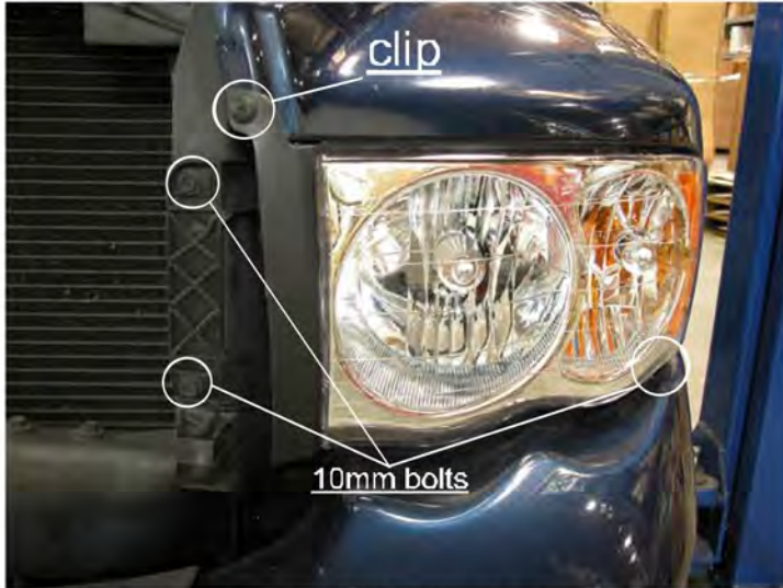
1. There are three 10 mm bolts and a clip that needs to be remove

If you experience any difficulties that the instruction did not cover, Please seek local auto shop for advise. Please wear protection before you work on your vehicle. An assistant is helpful when removing the front bumper. Please be careful while working with the bumper or body part to avoid scratching. Do not make direct contact with the halogen bulb or the wire assembly until the unit has cooled down after use.