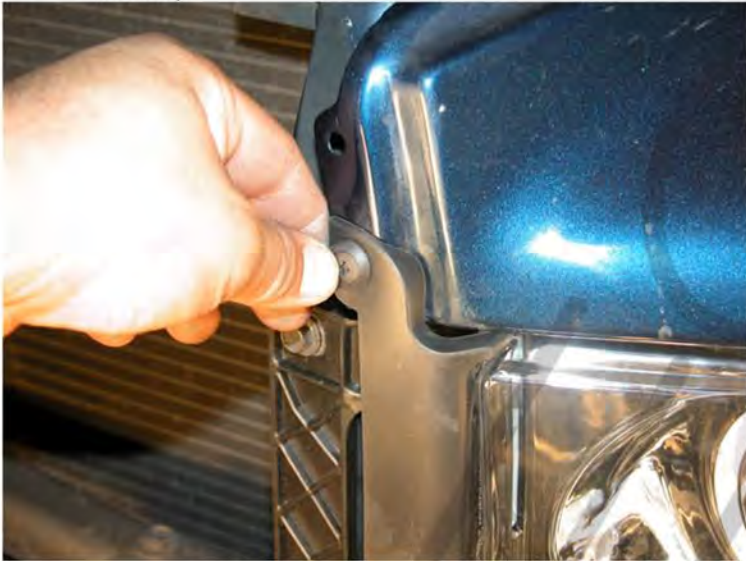
7. Install the clip to fasten the headlight