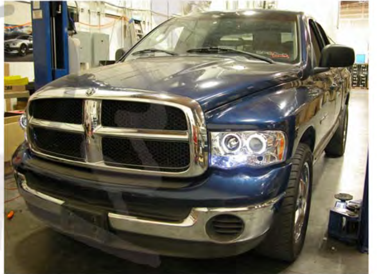
8. Please repeat the picture order from 1 to 7 for the opposite side