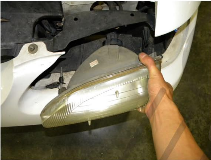
7. Remove the headlight housing