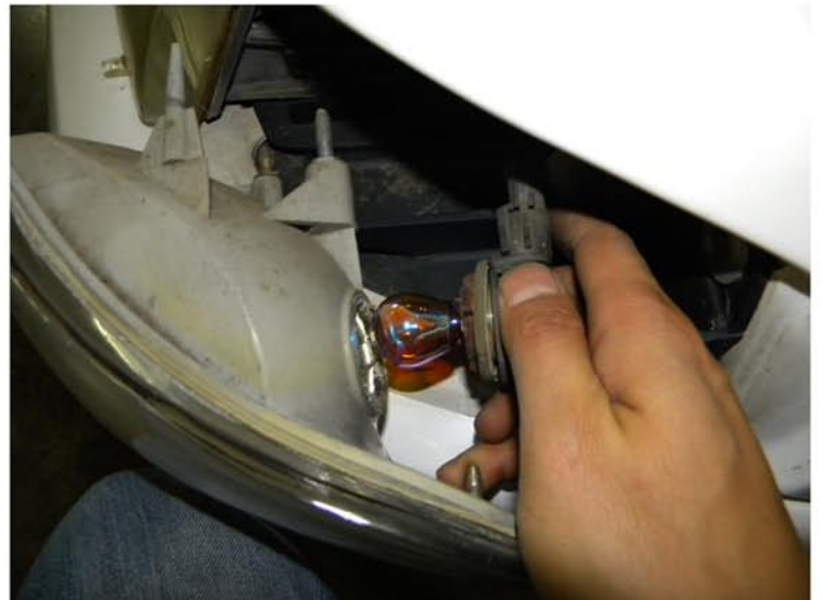
4. Remove the light bulb socket