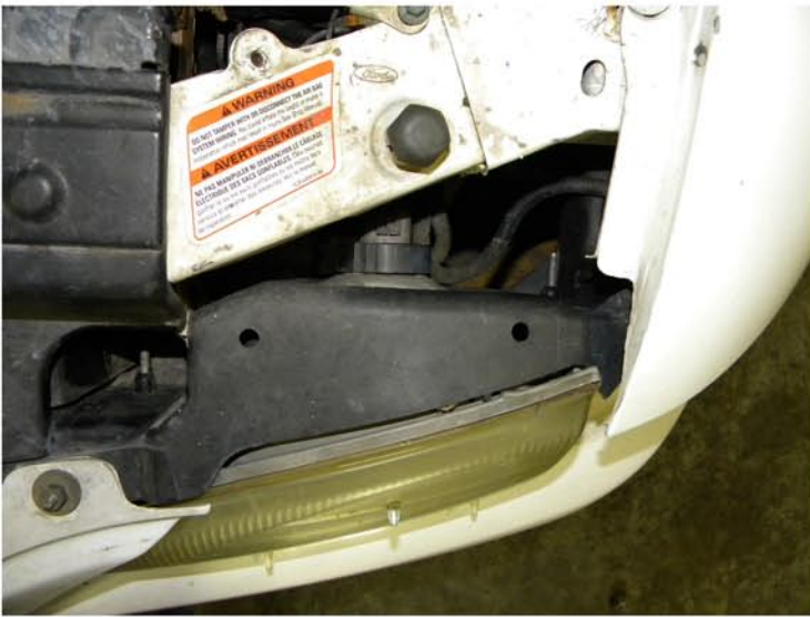
5. Mounting clips location