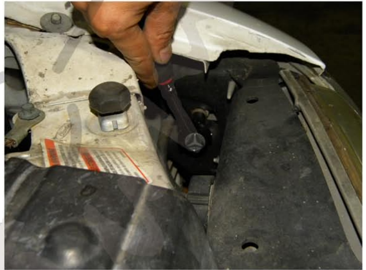
2. Remove the 10mm nut