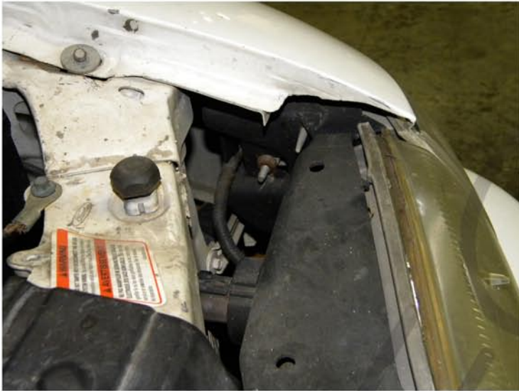
1. 10mm nut location

If you experience any difficulties that the instruction did not cover, Please seek local auto shop for advise. Please wear protection before you work on your vehicle. An assistant is helpful when removing the front bumper. Please be careful while working with the bumper or body part to avoid scratching. Do not make direct contact with the halogen bulb or the wire assembly until the unit has cooled down after use.