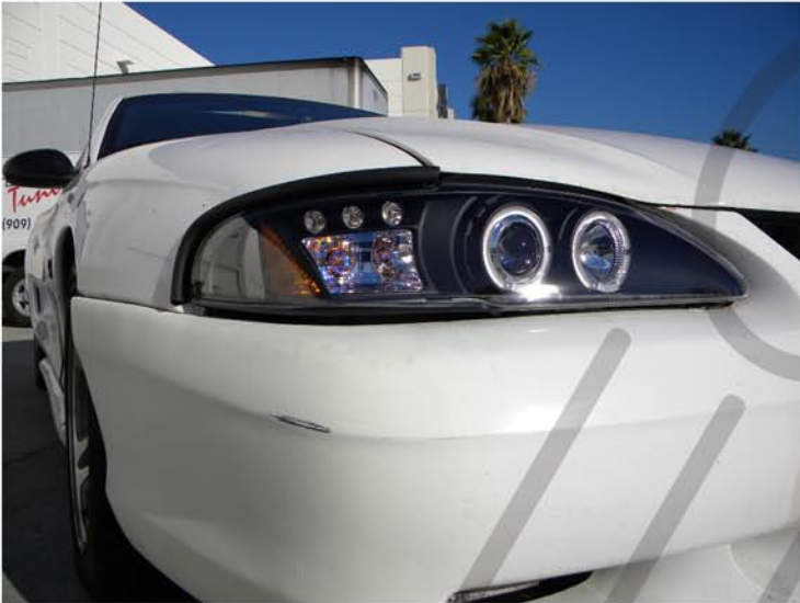
13. The installation is now complete