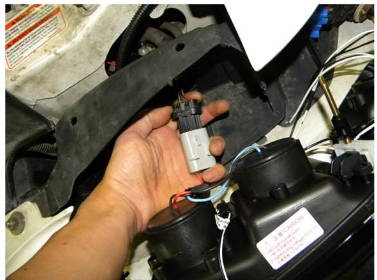
10. Connect the projector headlights into the headlight harness