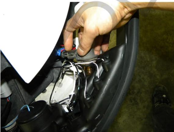
9. Install the corner light into the projector headlight please see the "Halo and L.E.D installation instruction" If your headlights don't have HALO or L.E.D. You can skip the installation instruction.