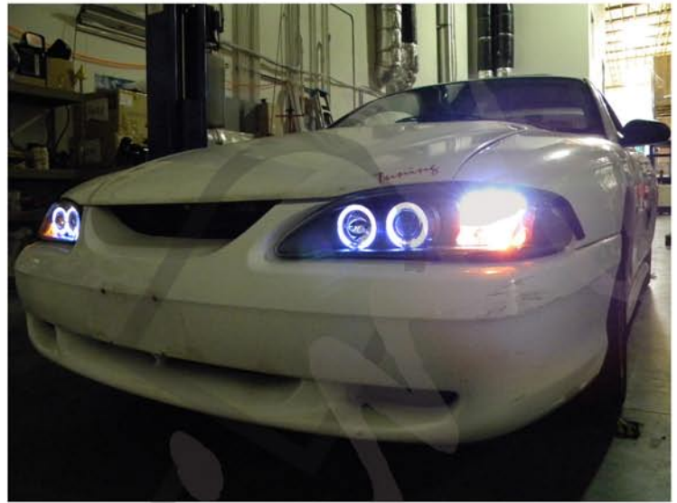
12. Please repeat the steps in order from 1 to 11 for the opposite side