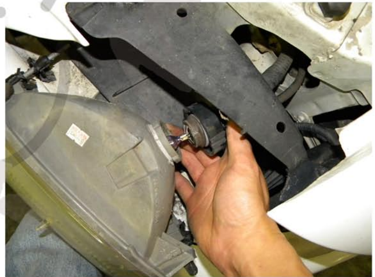
8. Remove the headlight bulb and harness