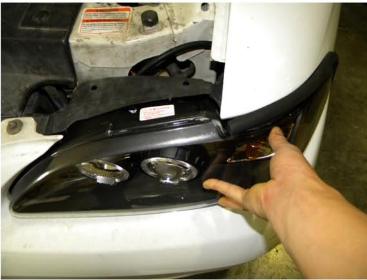
11. Press firmly to snap the headlight into position