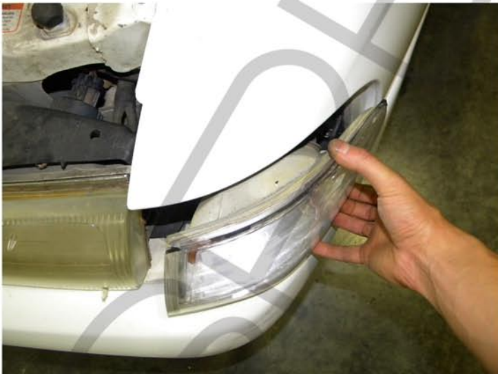
3. Remove the corner light