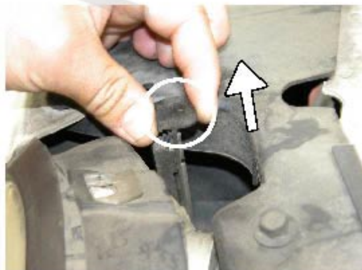
4. Pull out the outer clip