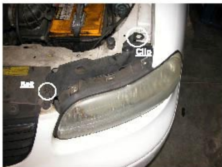
1. Remove the bolt and pull out the clip from the top of the headlight

*Do not make direct contact with the halogen bulb or the wire assembly until the unit has cooled down after use.