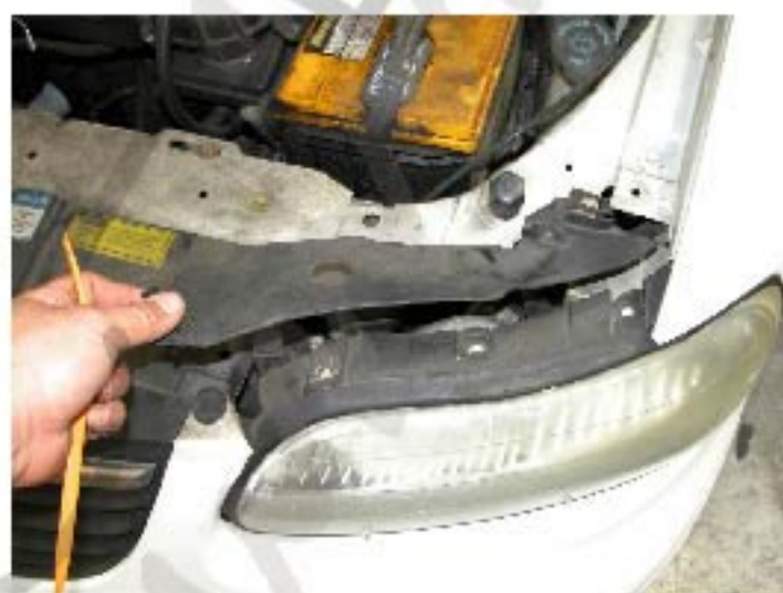
2. Remove the plastic from top of the headlight shielding