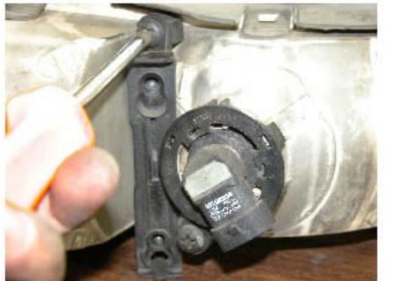
10. Then remove the bolts from the other side