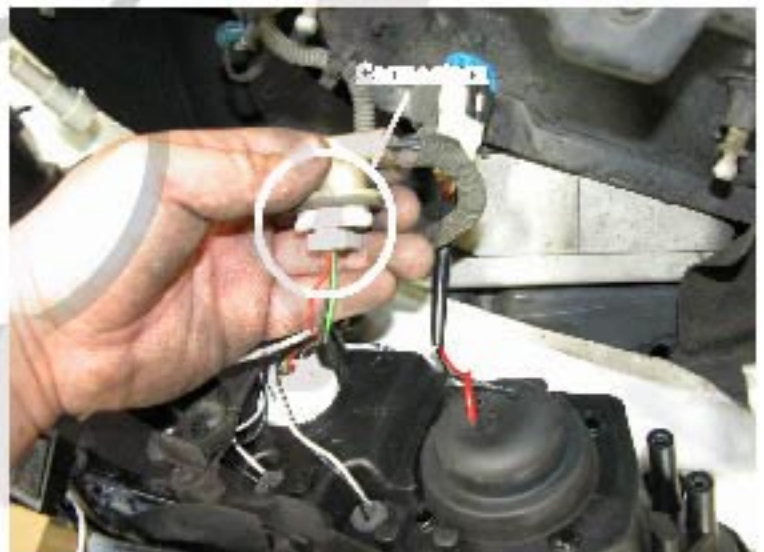
14. Plug the the connector into the socket from the vehicle