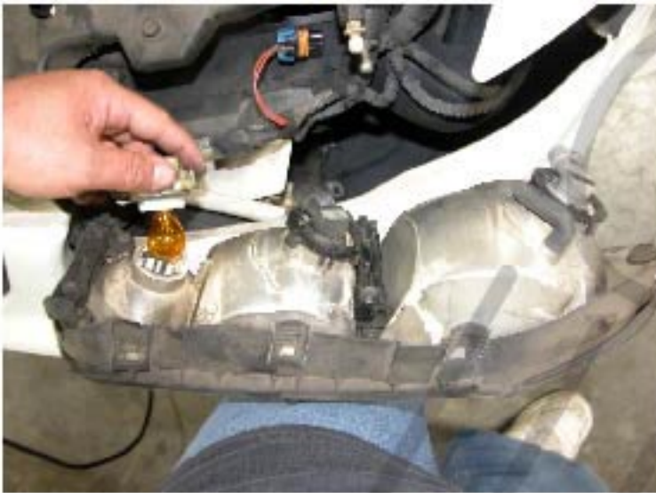
7. Disconnect all the connector and remove all the socket from OEM headlight