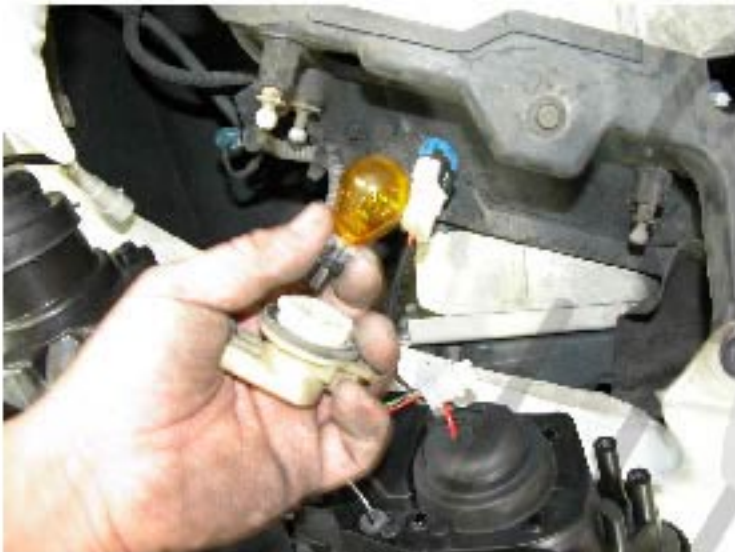
13. Remove the light bulb from the socket