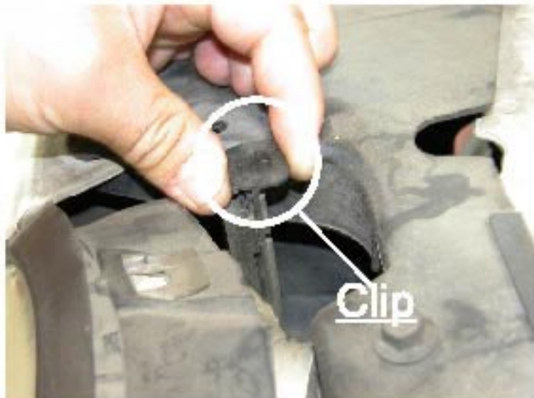
17. Push all the clips back to fasten the headlight (Please repeat the picture order from 1 to 17 for the opposite side)