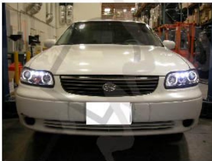
18. The installation is now complete