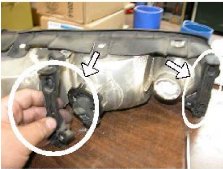
11. Take out the brackets from headlight