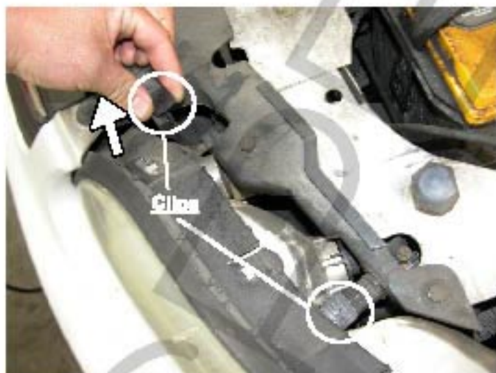
3. There are two clips that need to be pulled out