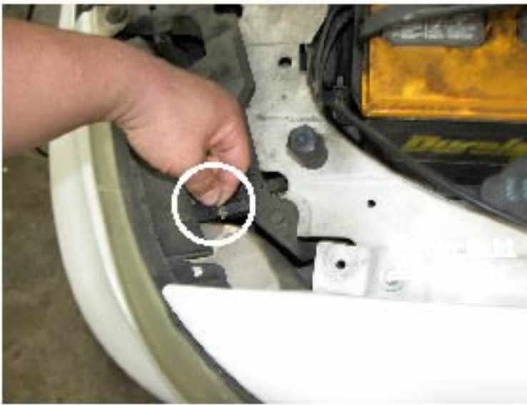
5. Then pull out the inner clip