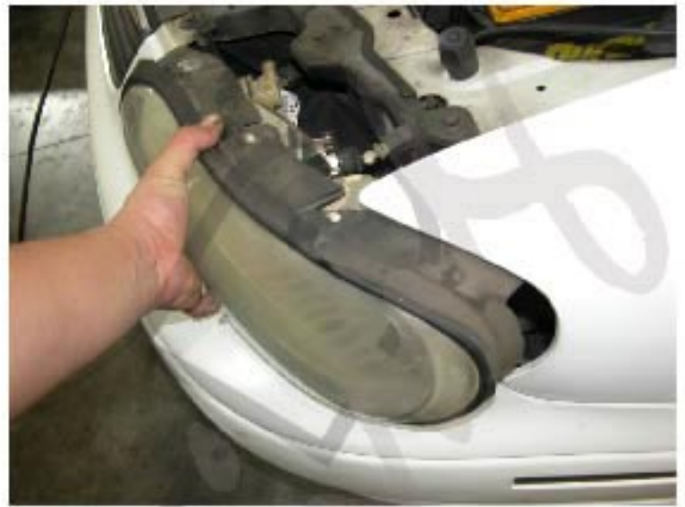
6. Gently pull out the OEM headlight slightly, just enough to see the back of the light