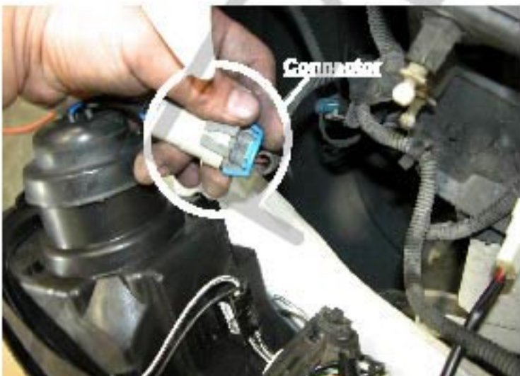
15. Connect the connector from the vehicle please see the "Halo and L.E.D. installation instructions" if your headlights don't have HALO or L.E.D. You can skip the installation instructions.