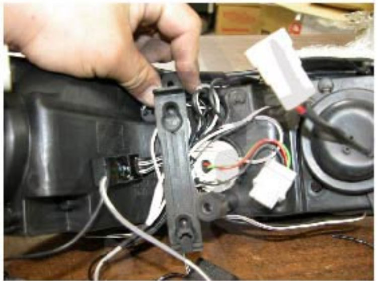
12. Install the brackets on the new headlight