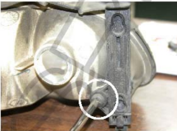
9. Remove the bolts from one side