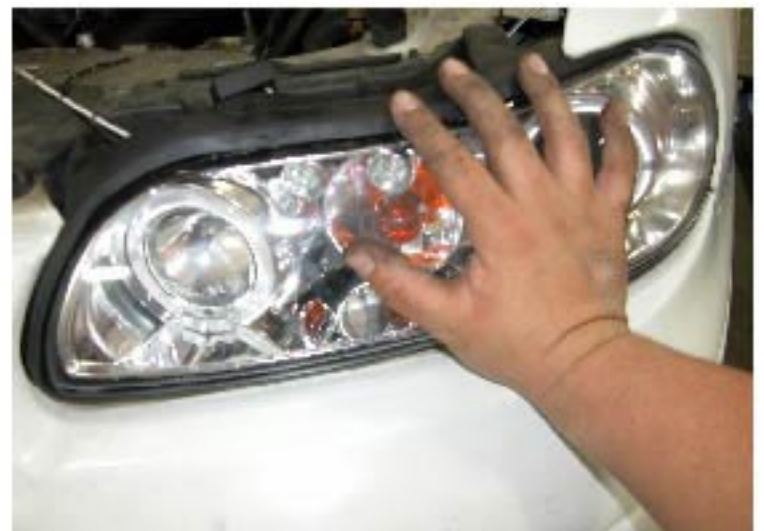
16. Gently install the projector headlight to its original spot