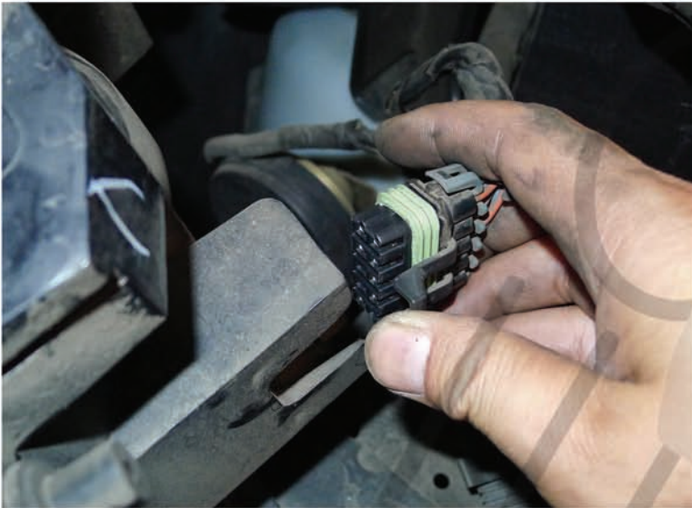
7. Disconnect the headlight harness