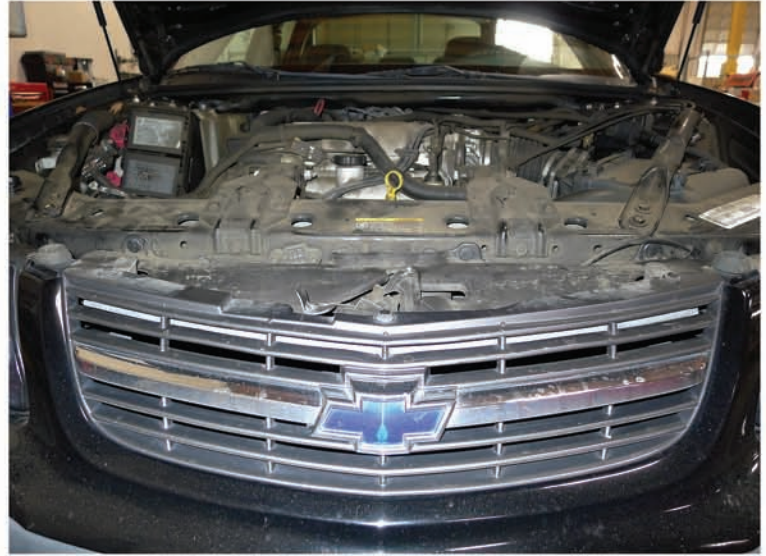
2. (3) plastic clips location