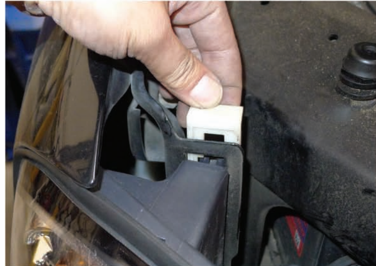
10. Lock the new headlight in place with the (2) headlight retainers