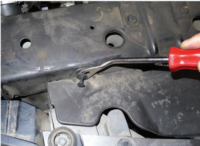
3. Remove the (3) plastic clips