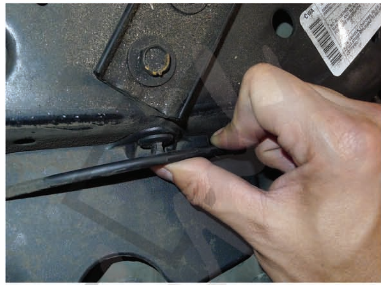
12. Replace the (3) plastic clips Please repeat the steps from 1 to 12 for the opposite side