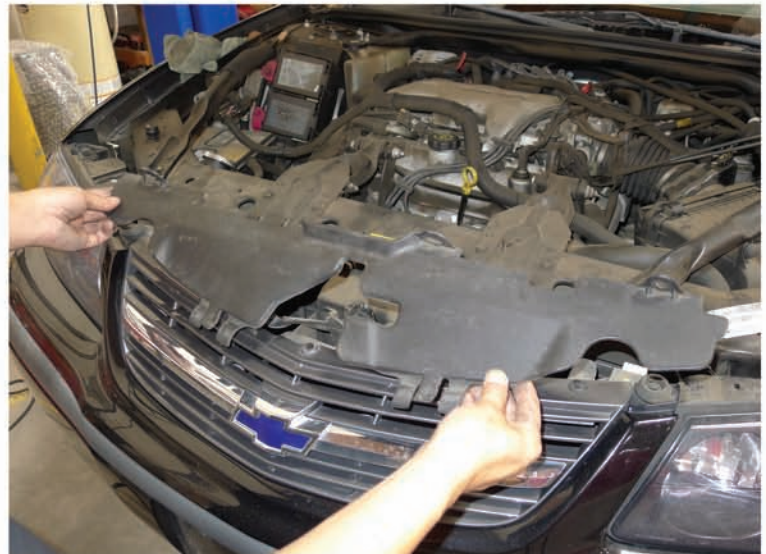
4. Remove the plastic cover