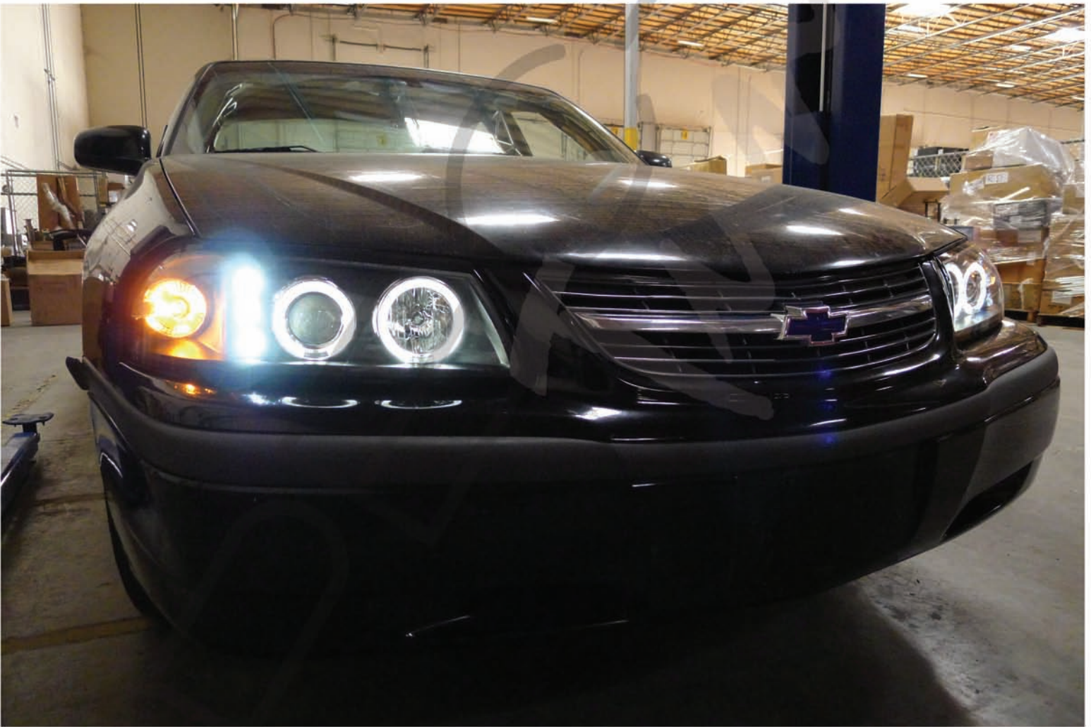
13. The installation now is complete