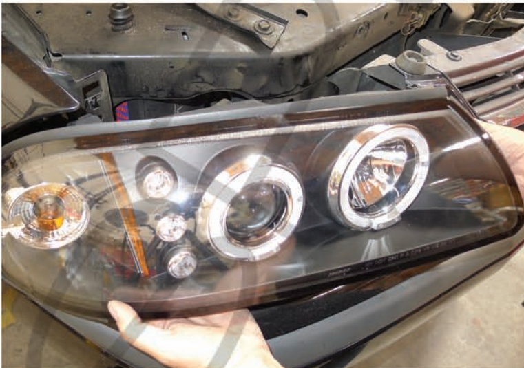
9. Place the new headlight in the factory location

Please see the "L. E. D. and Halo head lights installation instructions" If your head lights don't have L.E.D. and halo You can skip the installation instruction.