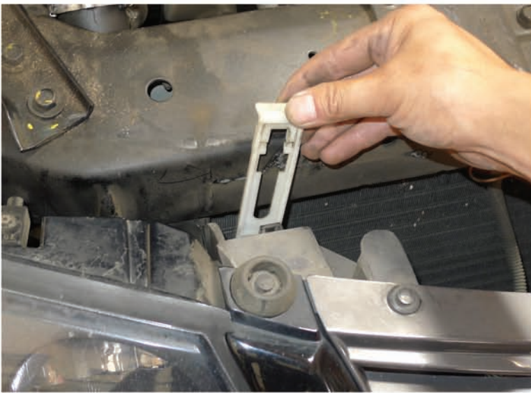
5. Remove the (2) headlight retainers