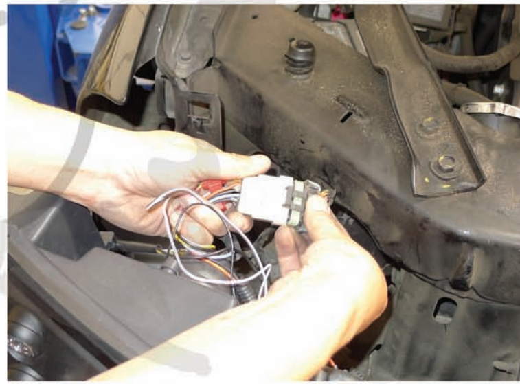
8. Connect the headlight harness to the new headlight

Please see the "L. E. D. and Halo head lights installation instructions" If your head lights don't have L.E.D. and halo You can skip the installation instruction.