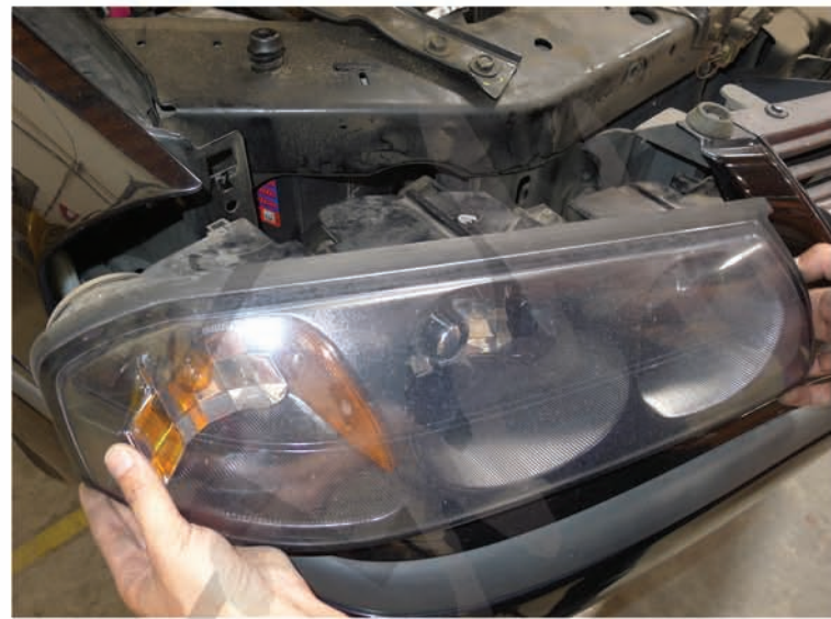
6. Remove the factory headlight