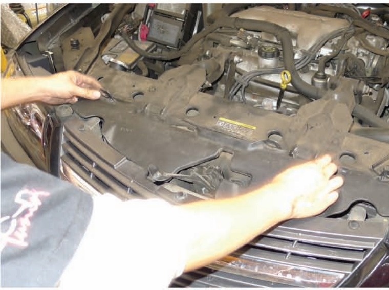
11. Replace the plastic cover