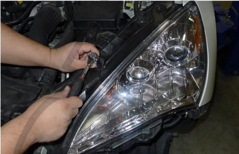
15. Tighten the (2) 10mm bolts