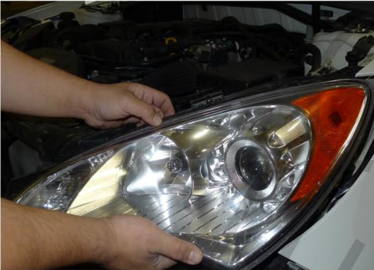
13. Remove the stock headlight and disconnect the headlight harness