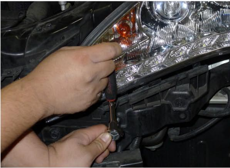
17. Tighten the (2) 10mm bolts