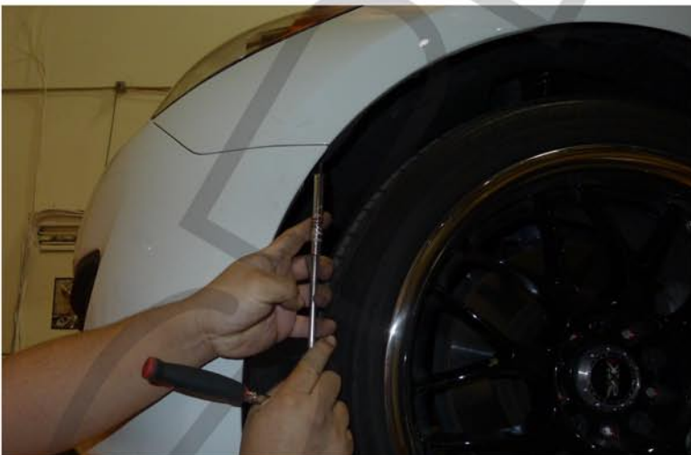
21. Tighten the 8mm screw