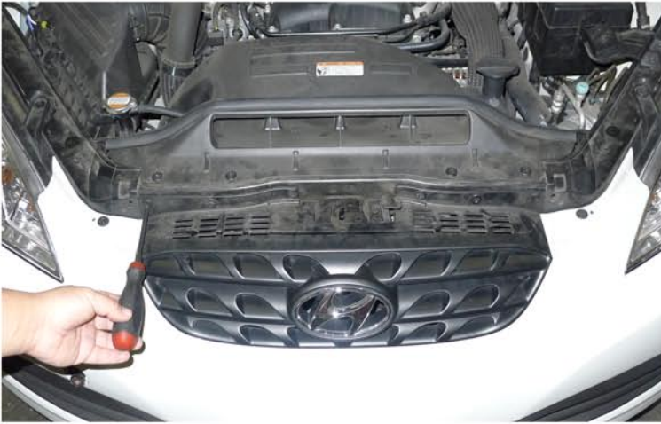
5. Remove the (8) plastic clips