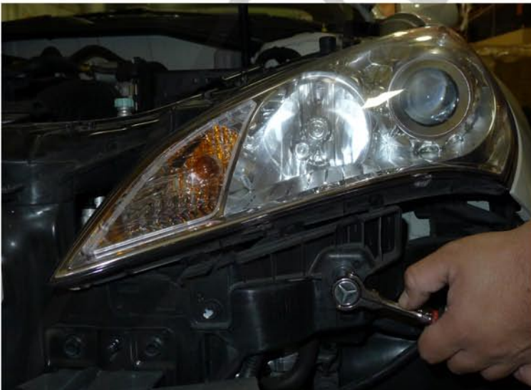
10. Remove the (2) 10mm bolts