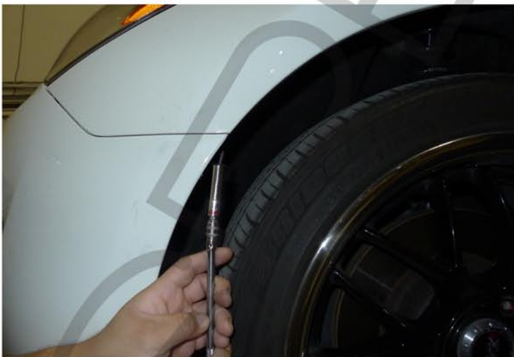
3. Remove the 8mm screw