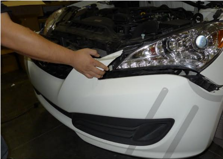
19. Replace the front bumper