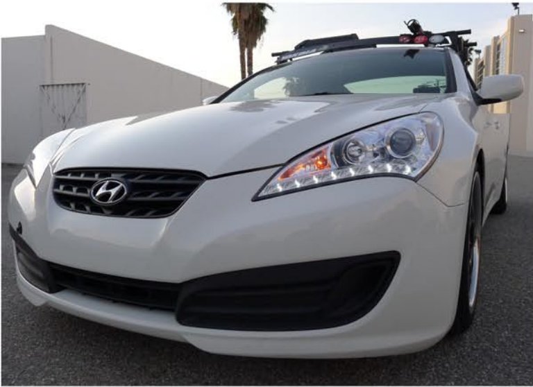
23. Please repeat the steps in order from 1 to 22 for the opposite side