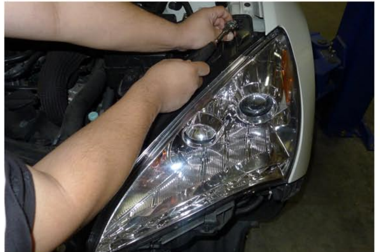
16. Tighten the (2) 10mm bolts