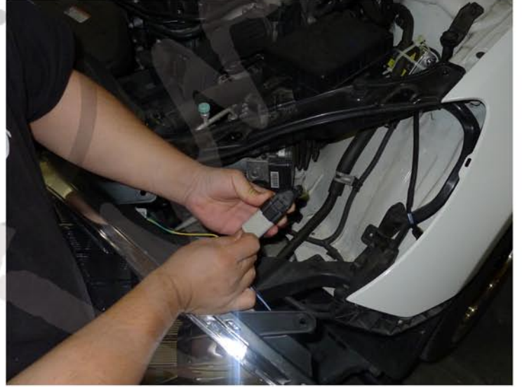
14. Connect the headlight harness to the new headlight Please see the Halo and L.E.D installation instruction If your headlights don't have HALO or L.E.D. You can skip it