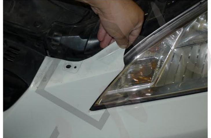
6. Remove the front bumper