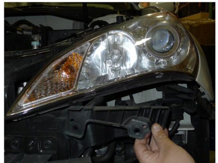
11. Remove the plastic bracket