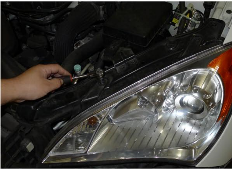
11. Remove the (2) 10mm bolts