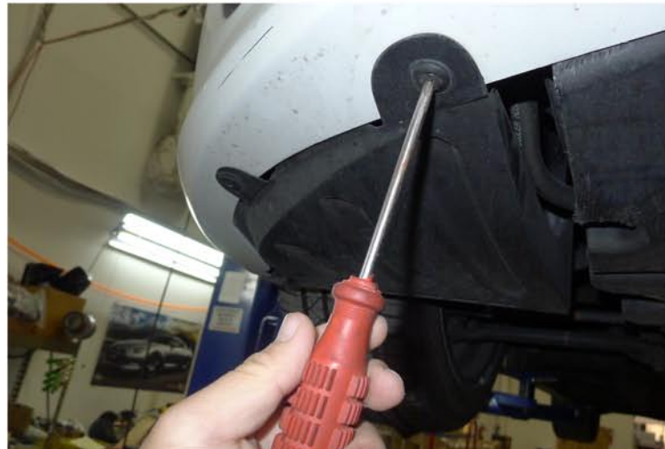
22. Replace the (4) plastic clips