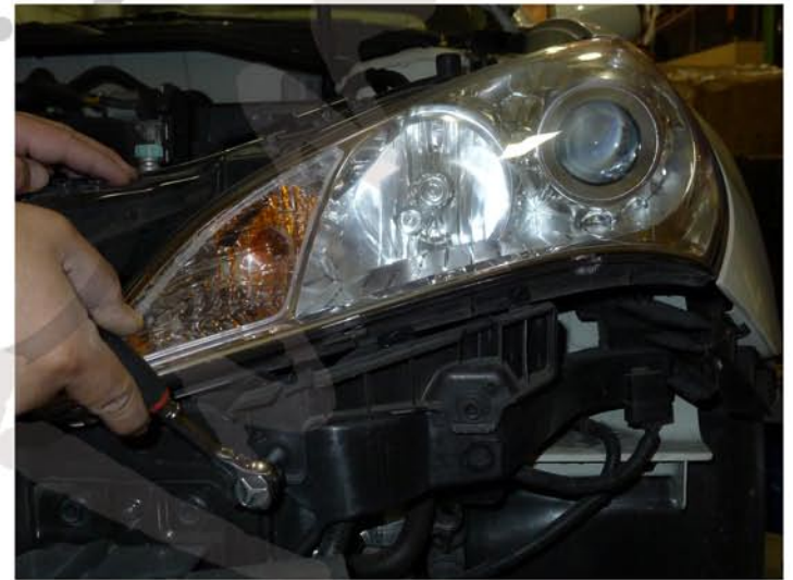
8. Remove the (2) 10mm bolts