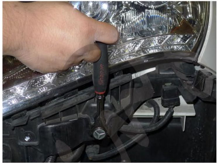
18. Tighten the (2) 10mm bolts