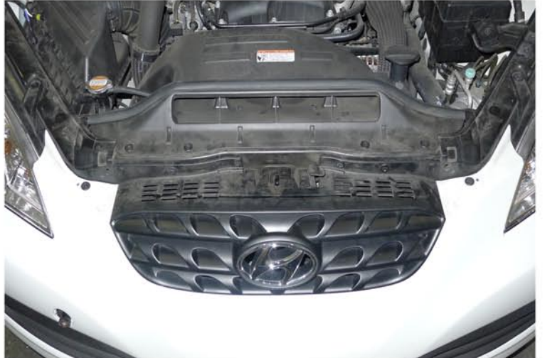
4. (8) plastic clips location