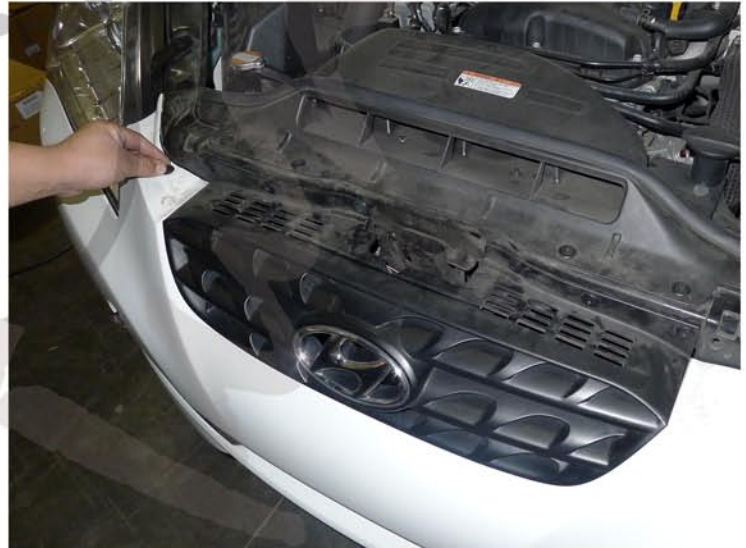
20. Replace the (8) plastic clips