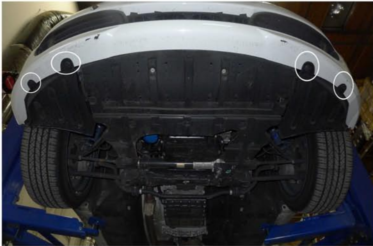
1. (4) plastic clips location

Do not make direct contact with the halogen bulbs or the wire assembly until the unit has cooled down after use.