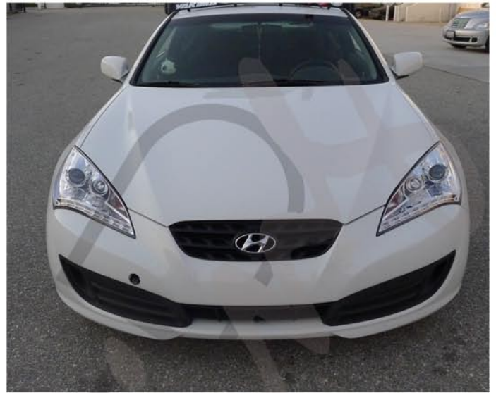
24. The installation is now complete