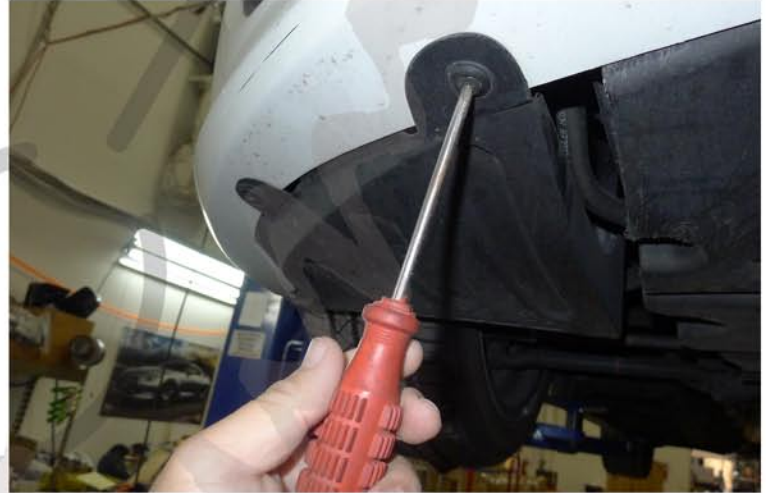
2. Remove the (4) plastic clips