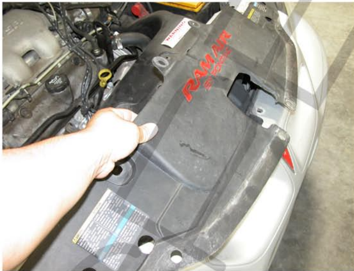
3. Then remove the plastic cover