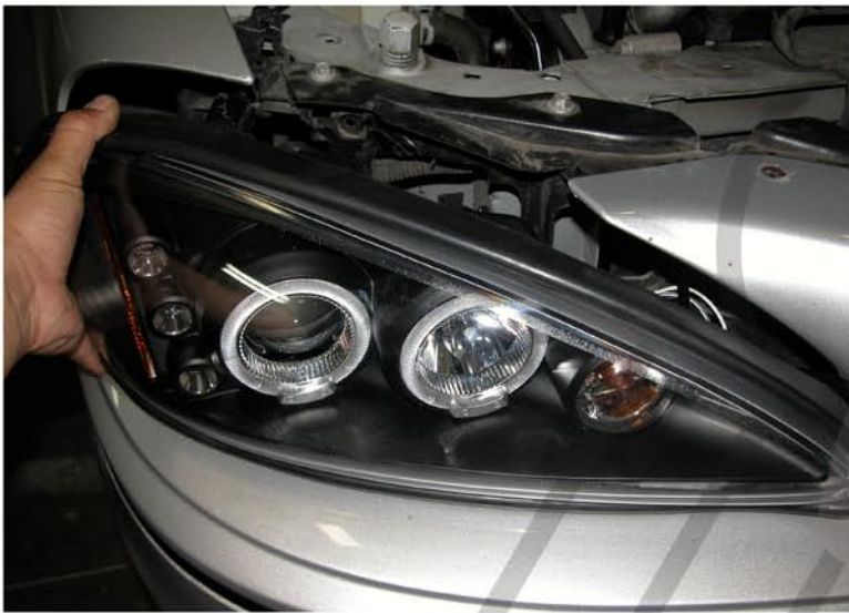
19. Gently install the headlight to its original spot