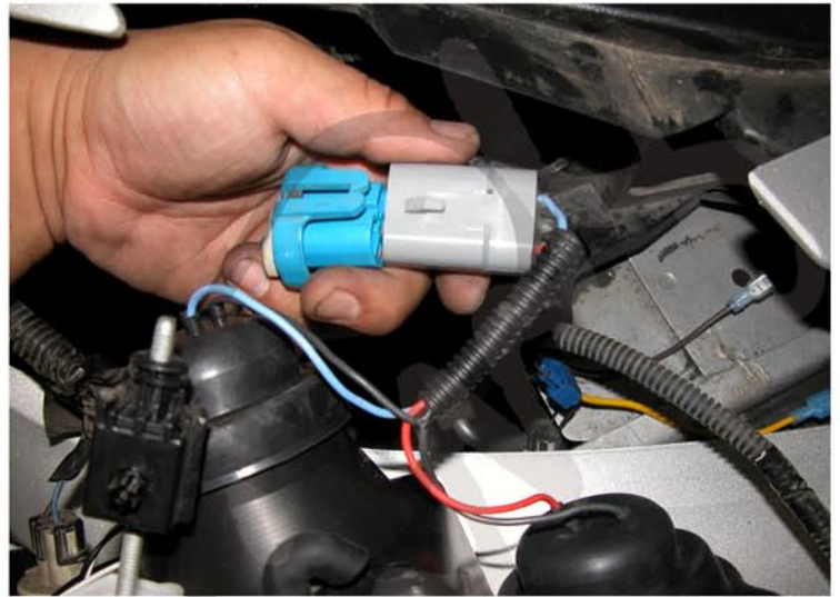
18. Connect the harness from the headlight please see the "Halo and L.E.D. installation instructions" If your headlights don't have HALO or L.E.D. You can skip the installation instructions.