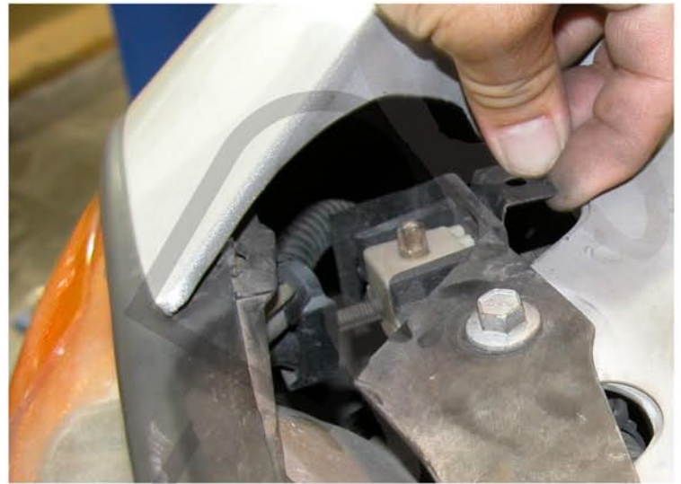
6. Then pull the outer latch up