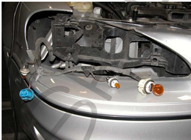
9. After you remove the headlight, it should look the same as the picture shown above