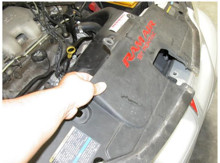
22. Gently put the plastic back ( Please repeat the picture order from 1 to 22 for the opposite side)