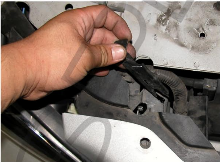
21. Then push the inner latch back into place