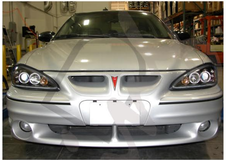
23. The installation is now complete