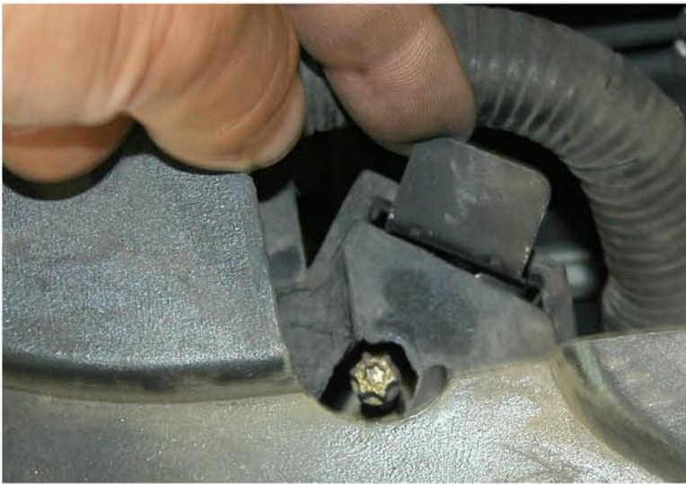
5. Pull the inner latch out first