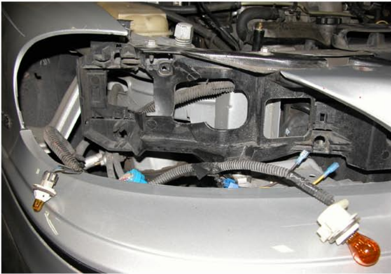
17. After you modify the area, it should look same as the picture shown above