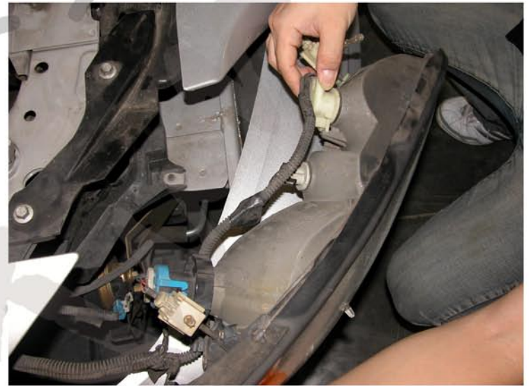
8. Disconnect all the connectors and remove the headlight