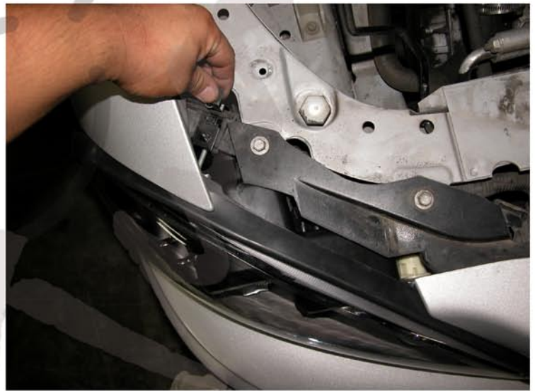
20. Push the outer latch back into place