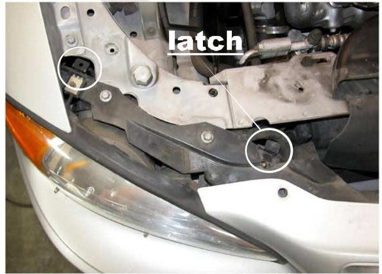
4. There are two latches