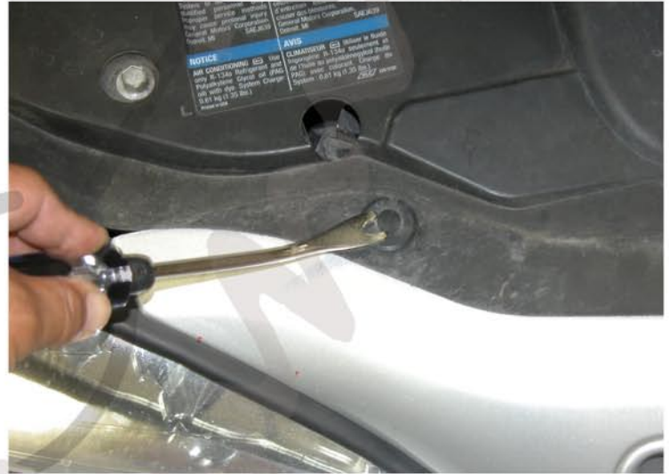
2. Remove the clips