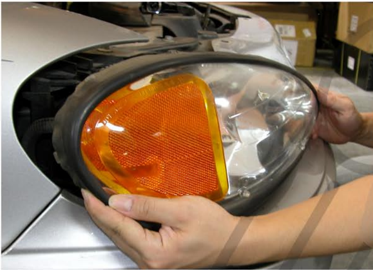
7. Gently pull out the headlight slightly, just enough to see the back of the light