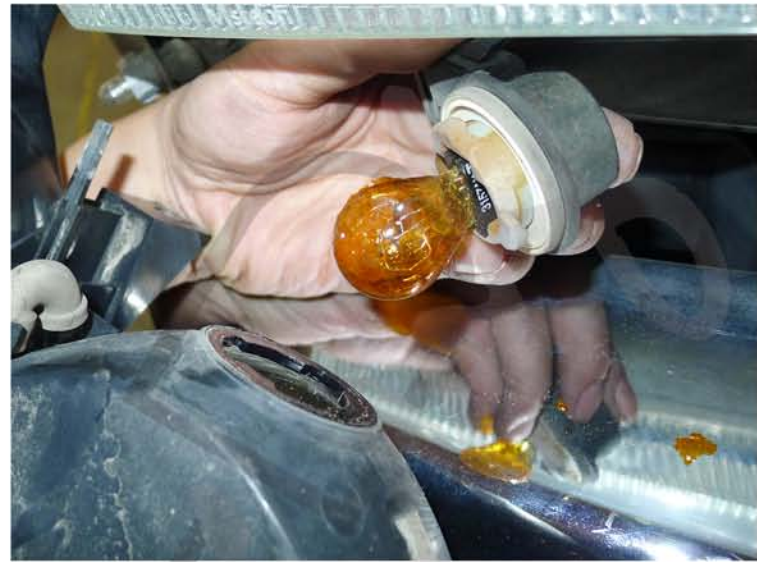
6. Remove the light socket