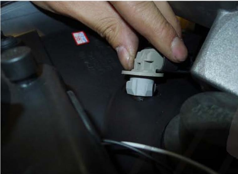
13. Install the light sockets