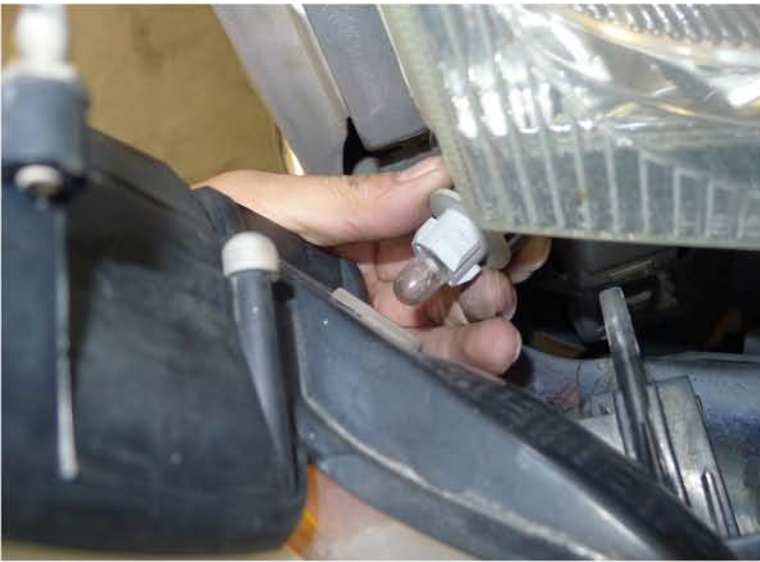
5. Remove the light socket