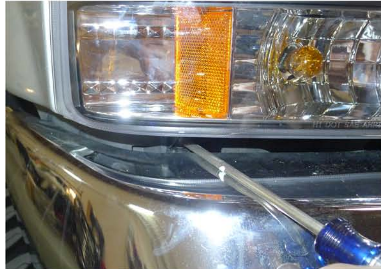
16. Tighten the (2) phillips head screws