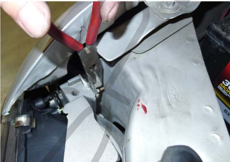
15. Install the metal retaining clip