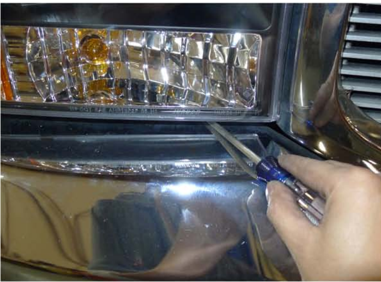
17. Tighten the (2) phillips head screws Please repeat the steps from 1 to 17 for the opposite side