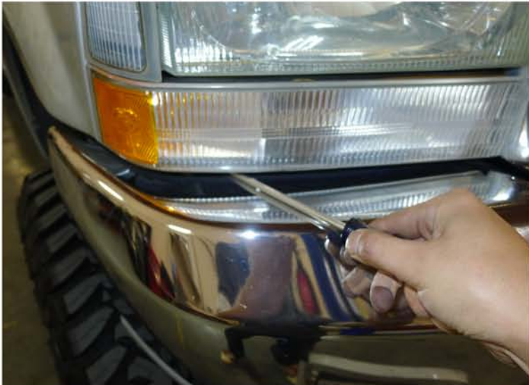
3. Remove the (2) phillips head screws