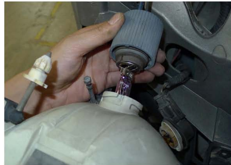
10. Remove the headlight bulb and harness