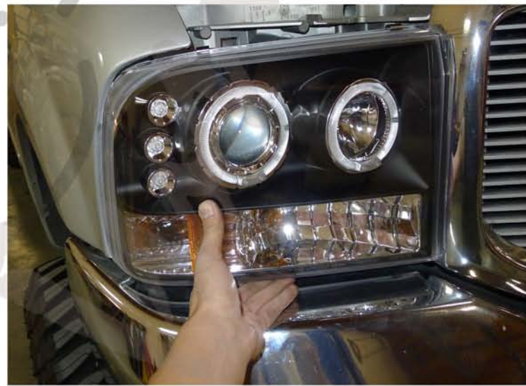
14. Place the new headlight in the stock location