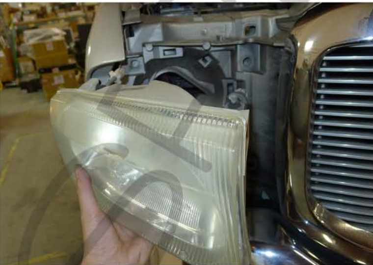
10. Remove the headlight