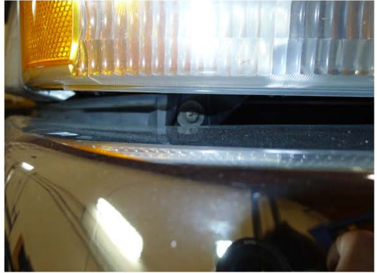
2. Phillips head screw location