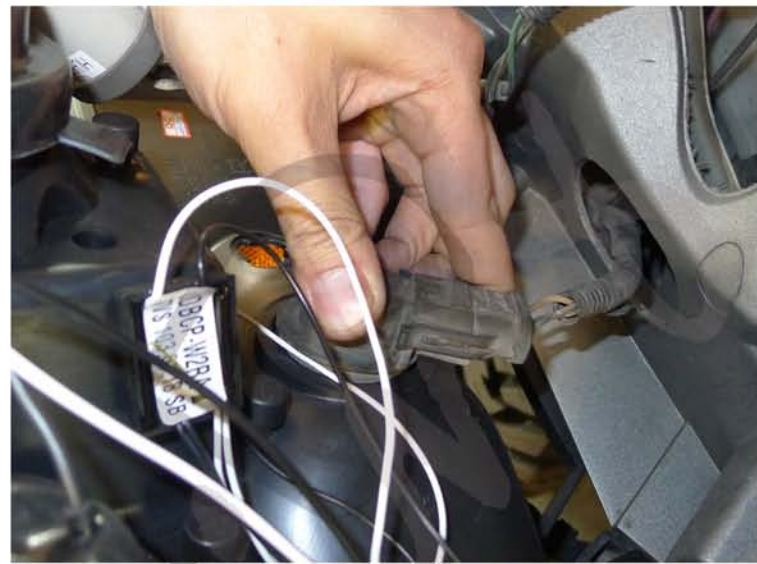
12. Install the light socket

Please see the " HALO and L. E. D. head lights installation instructions" If your head lights don't have HALO and L.E.D. You can skip the installation instruction.