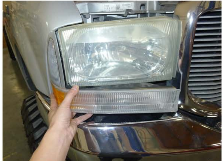
4. Remove the bumper corner light