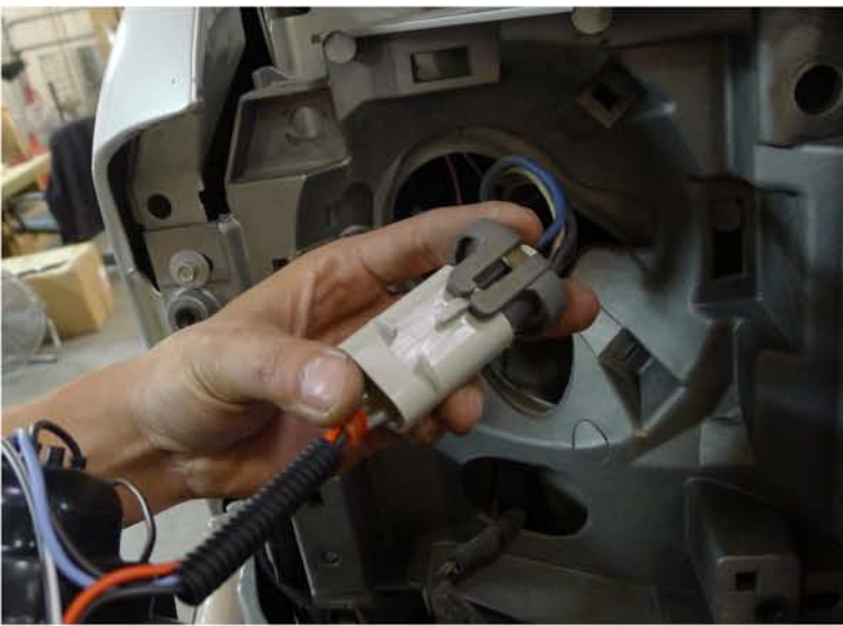
11. Connect the headlight harness to the new headlight

Please see the " HALO and L. E. D. head lights installation instructions" If your head lights don't have HALO and L.E.D. You can skip the installation instruction.