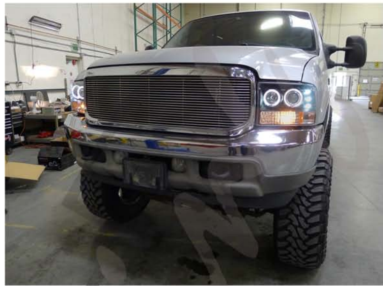
18. The installation is now complete