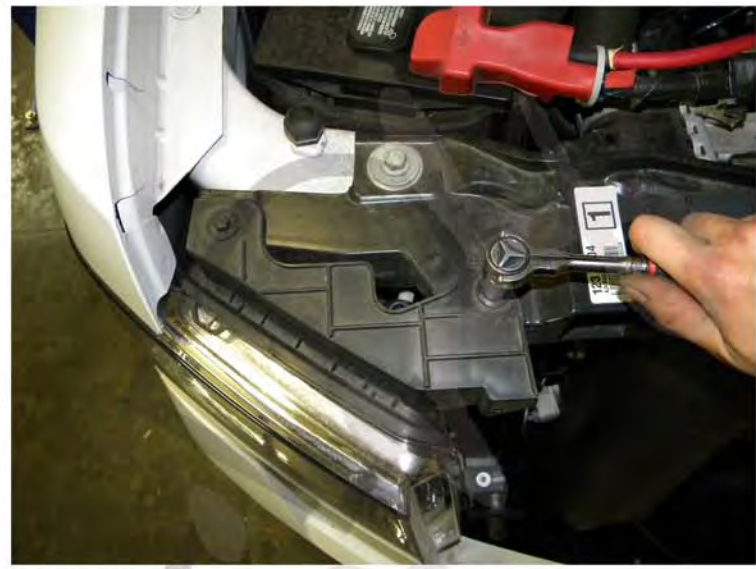
6. Remove the (2) 10mm bolts