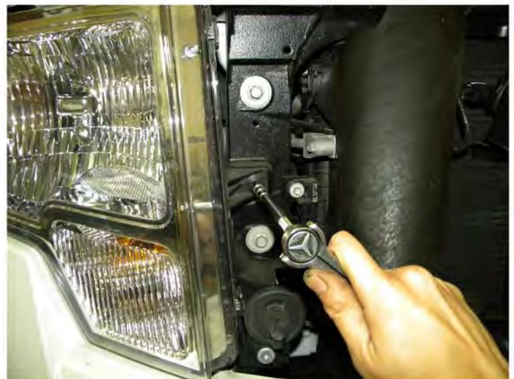
4. Remove the 10mm bolt