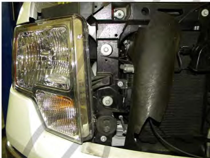
3. 10mm bolt location