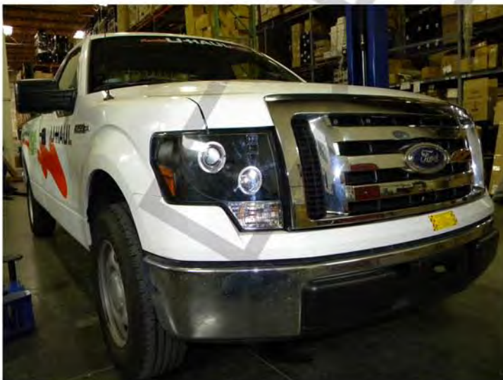
15. Remove the headlight Please repeat the steps in order from 1 to 14 for the opposite side