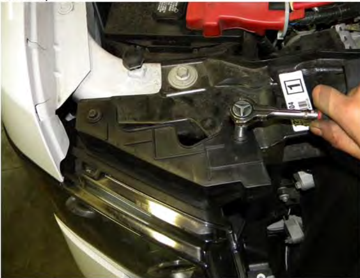
13. Tighten the (2) 10mm bolts