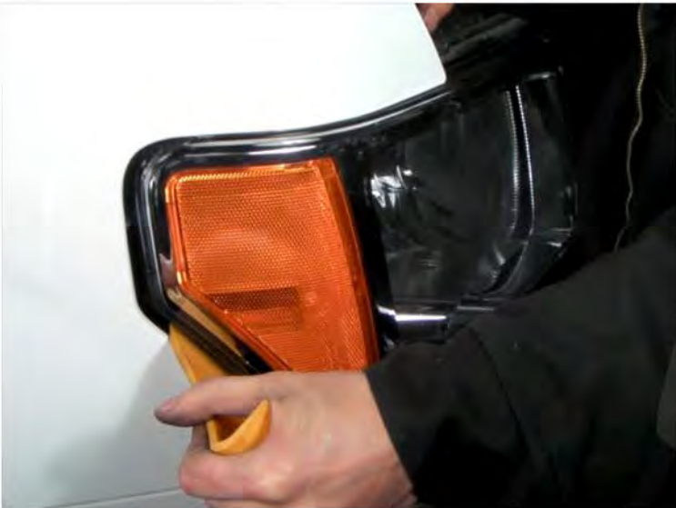
7. Remove the headlight