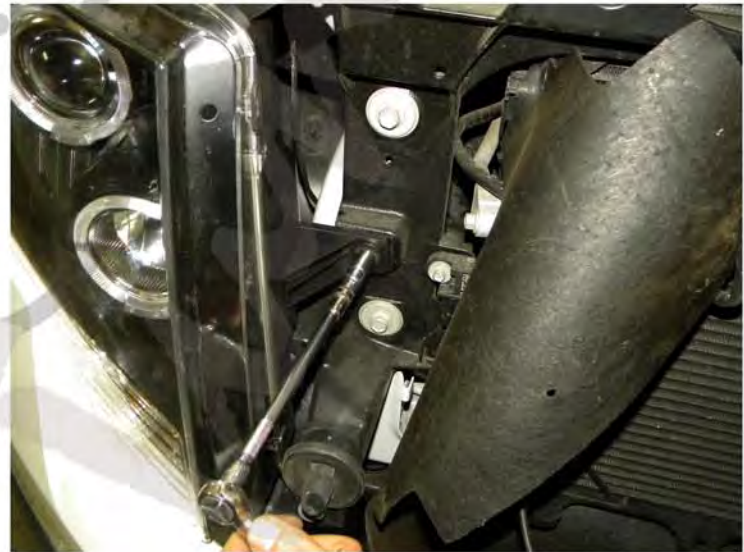
14. Tighten the 10mm bolt