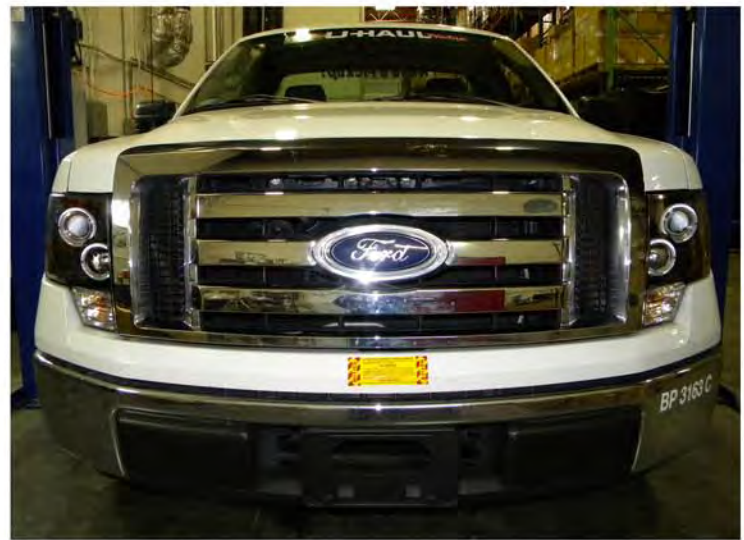
16. The installation is now complete