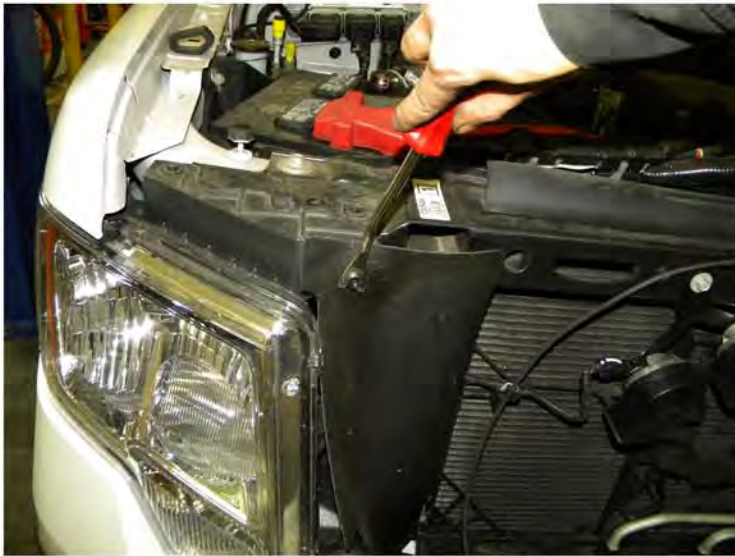
1. Remove the plastic lip

Do not make direct contact with the halogen bulbs or the wire assembly until the unit has cooled down after use.