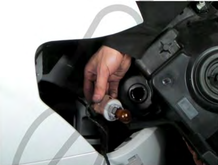
9. Disconnect the headlight harness