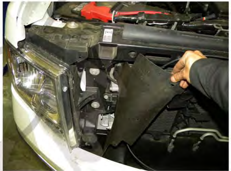
2. Pull the rubber shield to the side