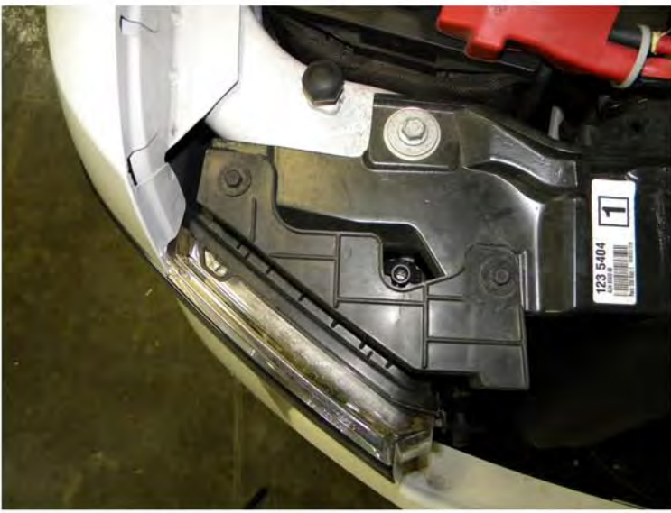
5. (2) 10mm bolts location