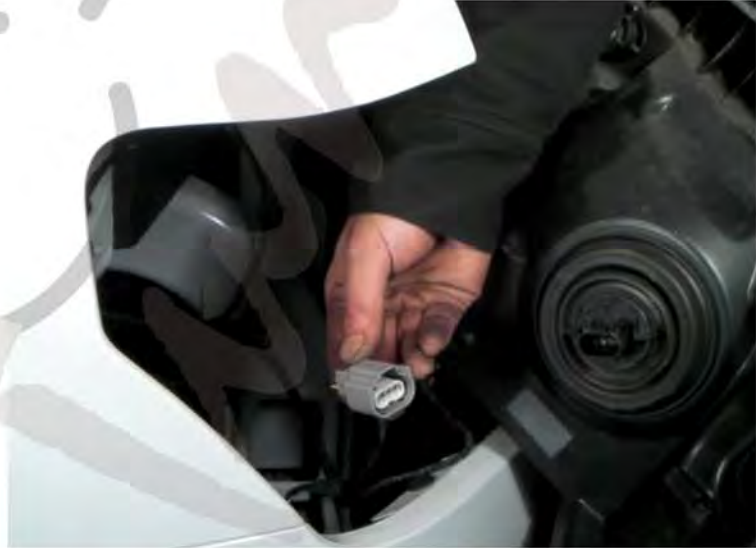
8. Disconnect the headlight harness