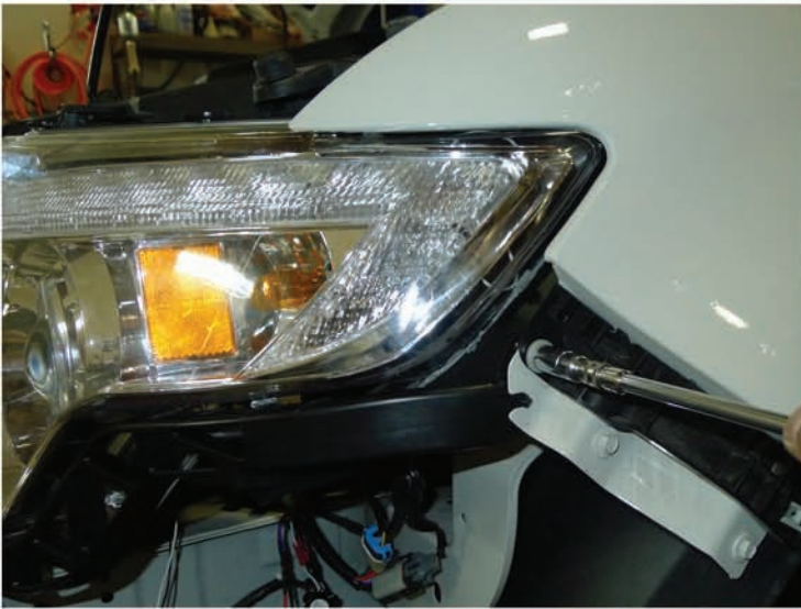
23. Tighten the 10mm bolt