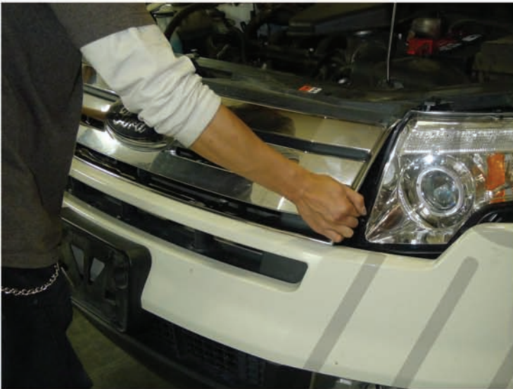
25. Replace the front bumper