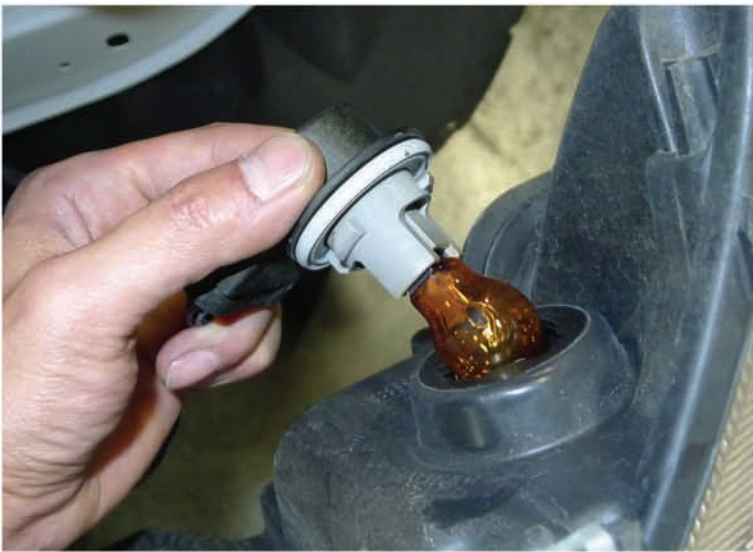
17. Remove the turn signal light bulb socket