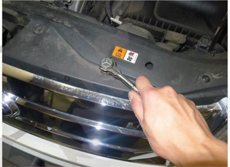
2. Remove the (2) 7-32in bolts