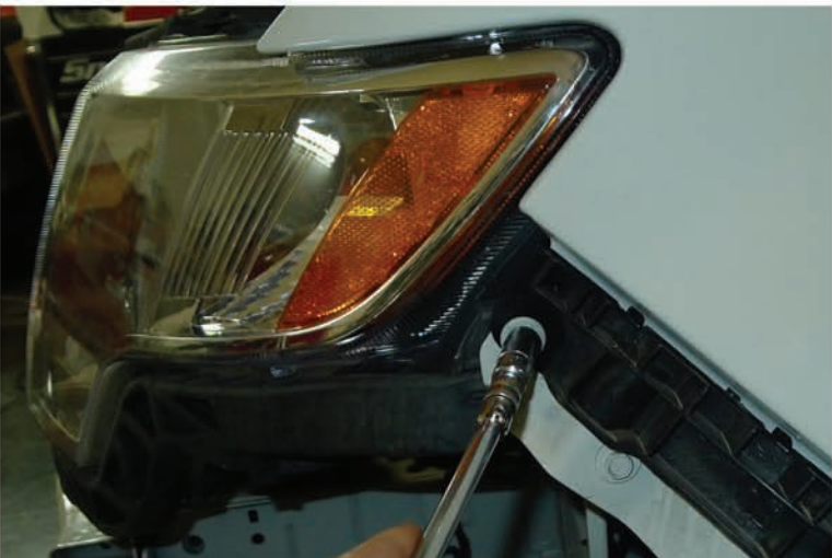
15. Remove the 10mm bolt