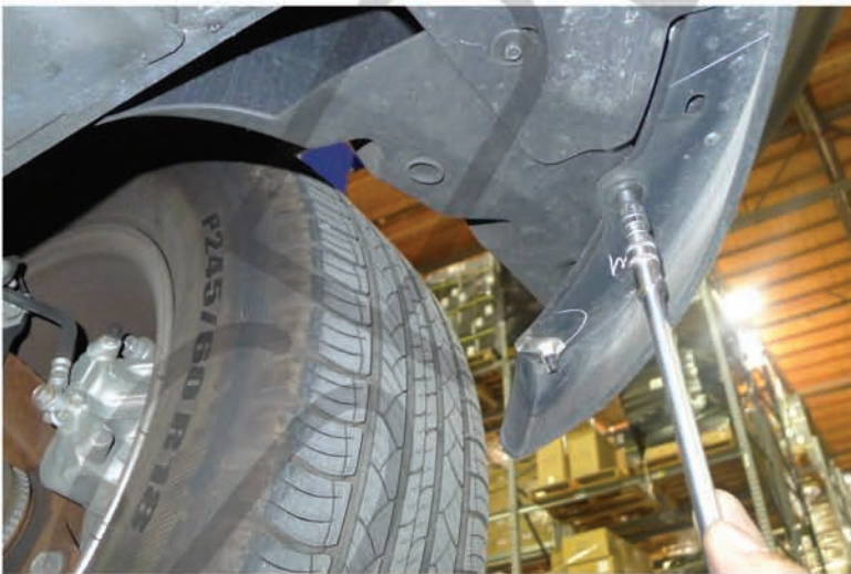
9. Remove the (4) 7-32in bolts