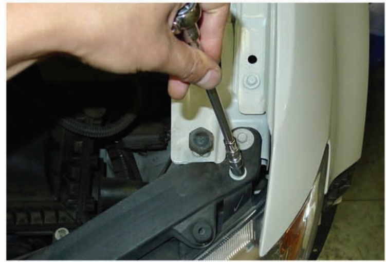
16. Remove the 10mm bolt