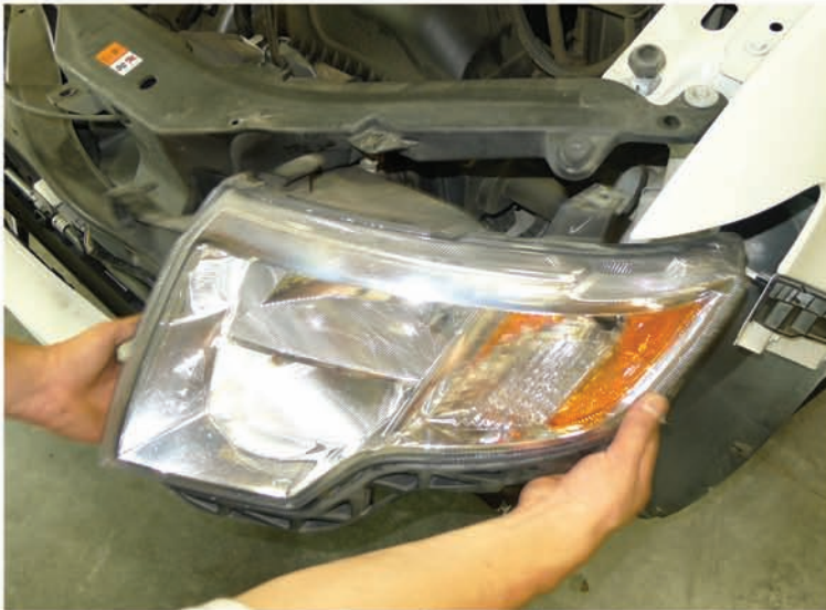
19. Remove the headlight