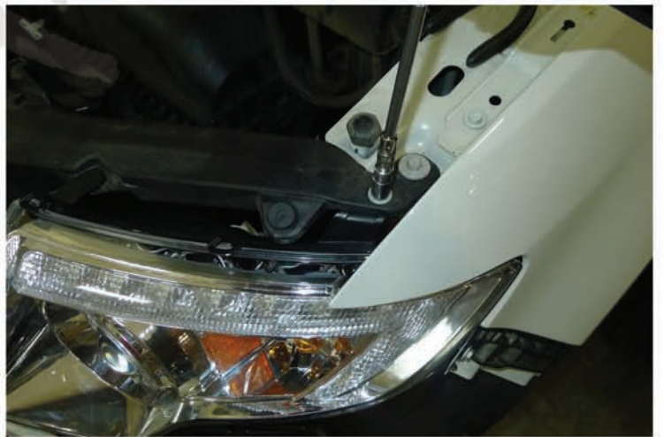
22. Tighten the 10mm bolt