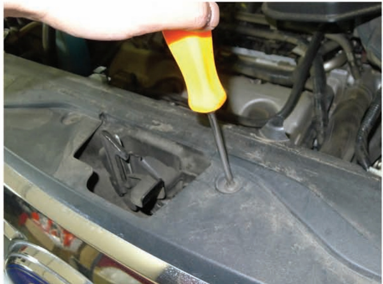
4. Remove the (4) plastic clips