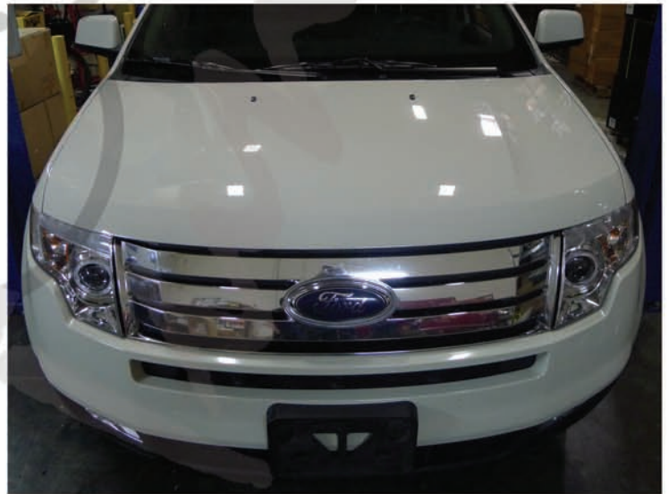
32. Please repeat the steps in order from 1 to 31 for the opposite side. The installation is now complete