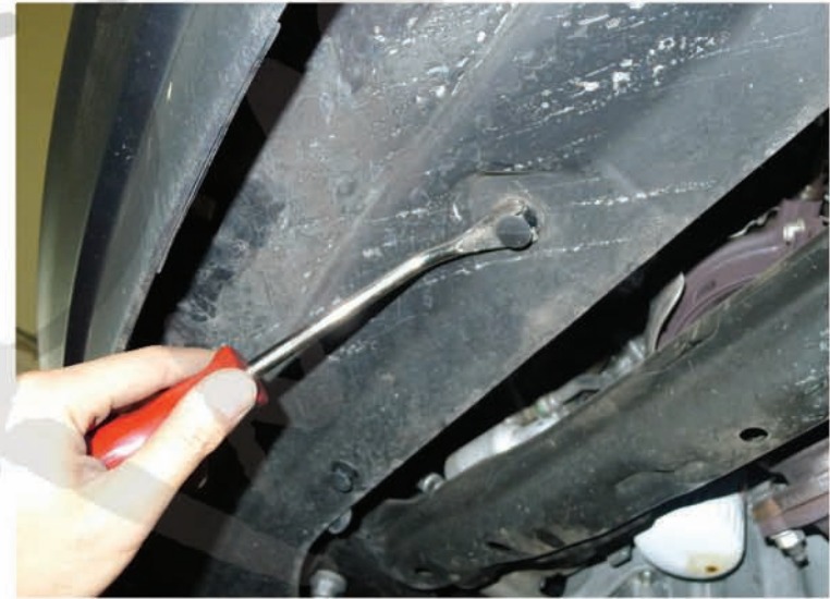
8. Remove the (3) Plastic clips