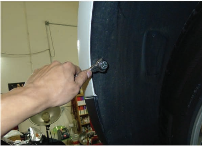
11. Remove the (3) 7-32in bolts