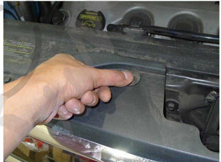
26. Replace the (4) plastic clips