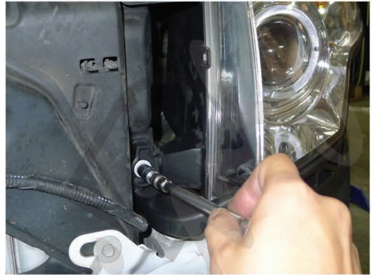
24. Tighten the (2) 10mm bolts