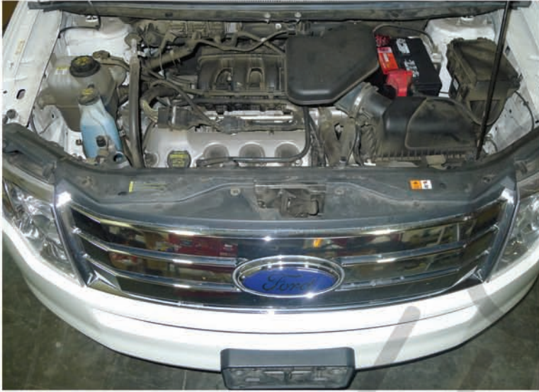
1. (4) plastic clips and (2) 7-36in bolts location

Do not make direct contact with the halogen bulbs or the wire assembly until the unit has cooled down after use.