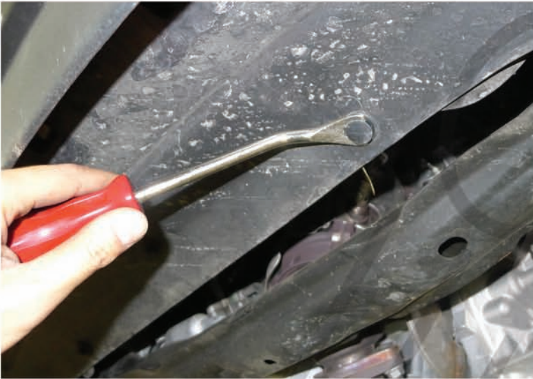
7. Remove the (3) plastic clips