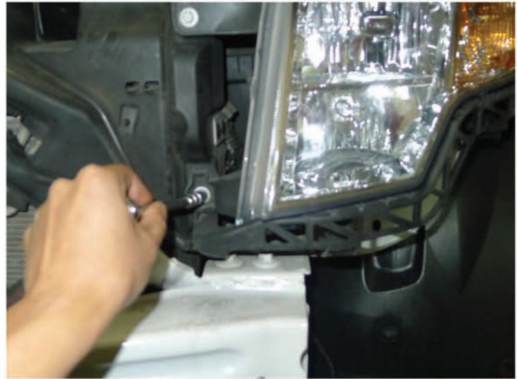
14. Remove the (2) 10mm bolts