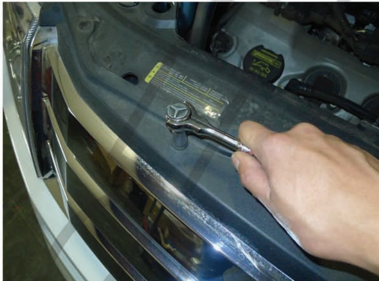
3. Remove the (2) 7-36in bolts