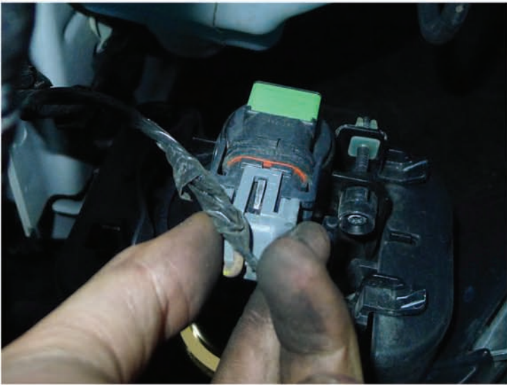
29. Reconnect the fog light harness