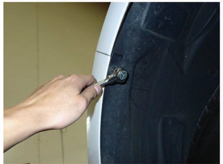
28. Tighten the (3) 7-32in bolts