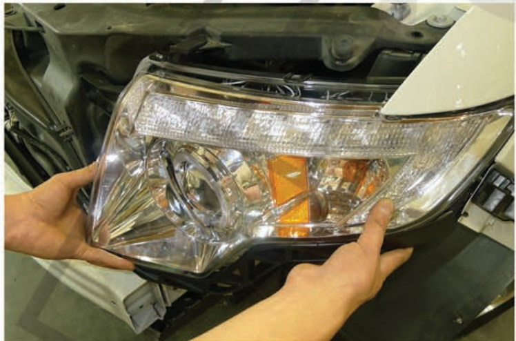
21. Place the projector headlight in the stock location