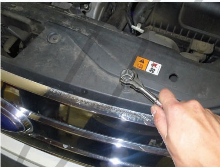
27. Tighten the (2) 7-32in bolts