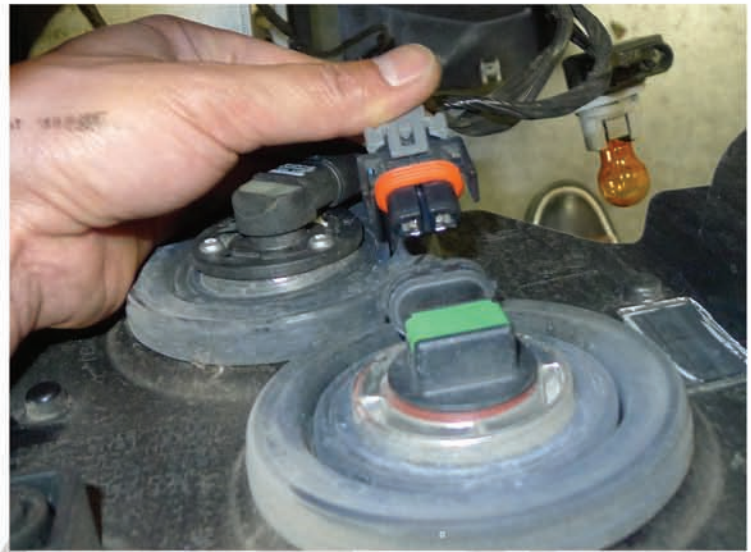
18 Disconnect the headlight harness