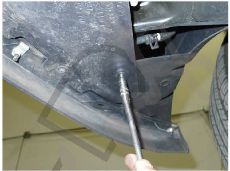
30. Tighten the (4) 7-36in bolts