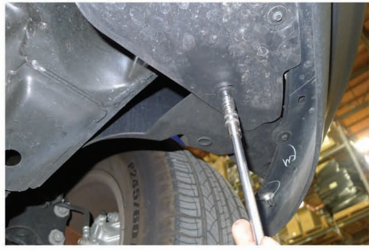
10. Remove the (4) 7-32in bolts