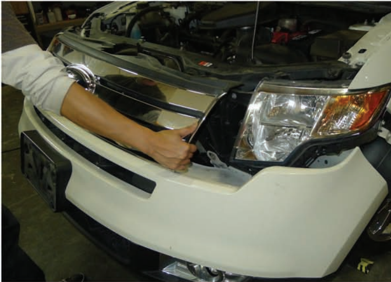
13. Remove the front bumper