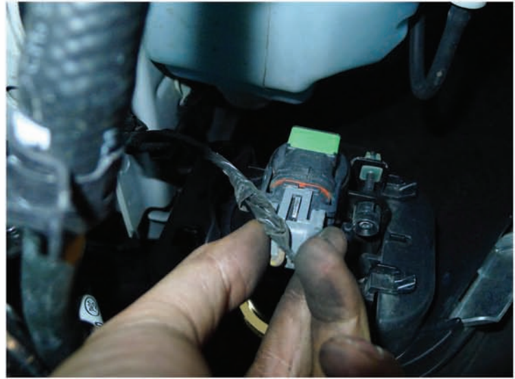
12. Unplug the fog light harness