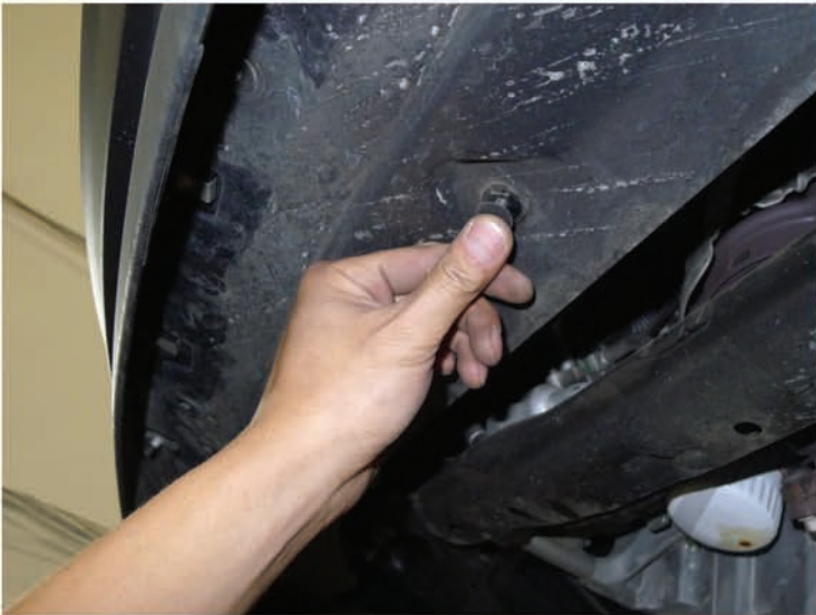
31. Replace the (3) plastic clips