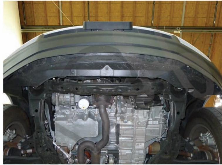
6. (3) plastic clips and (4) 6-32in bolts location