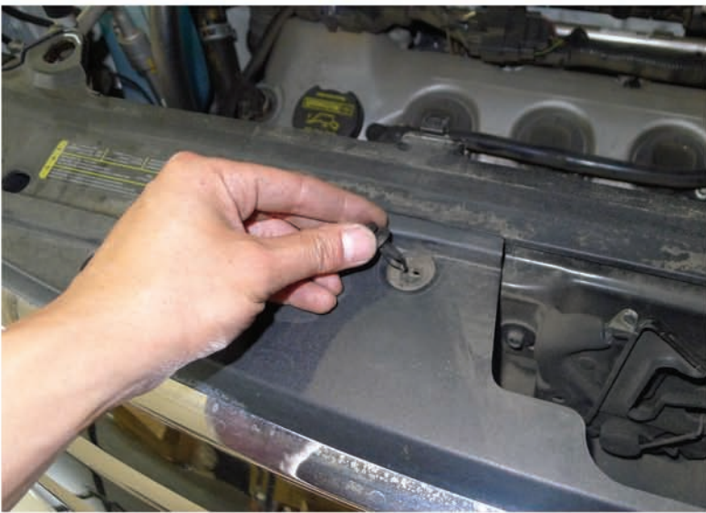
5. Remove the (4) plastic clips