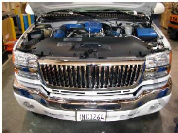
1. Open the hood

Model: Sierra, Sierra Denali, Yukon, Yukon Denali, Yukon Denali XL, Yukon XL