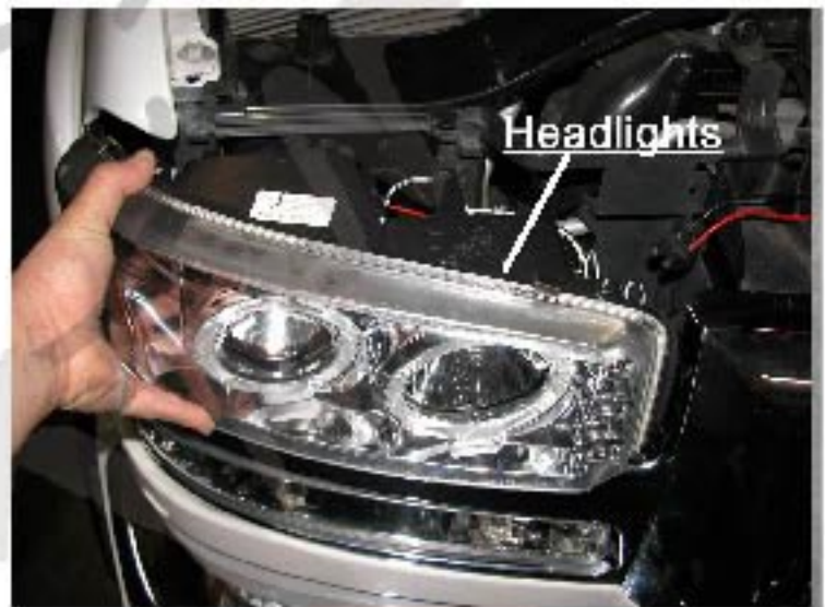
8. Install the headlight gently please see the "Halo and L.E.D.Installation Instructions" if your headlights don't have HALO or L.E.D. You can skip the the Installation Instructions.