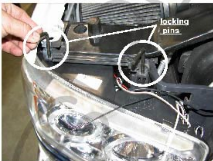
9. Install the two locking pins (Please repeat the picture order from 1 to 10 on opposite side)