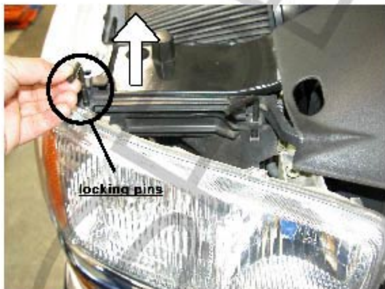
3. Gently pull the first pin up and remove the pin