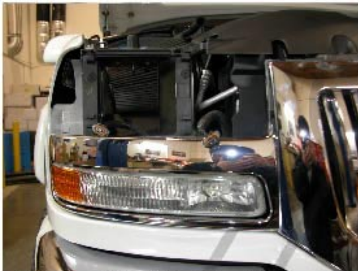
7. After remove the headlight, you will see like this. Before Install the headlight, please connect the connectors