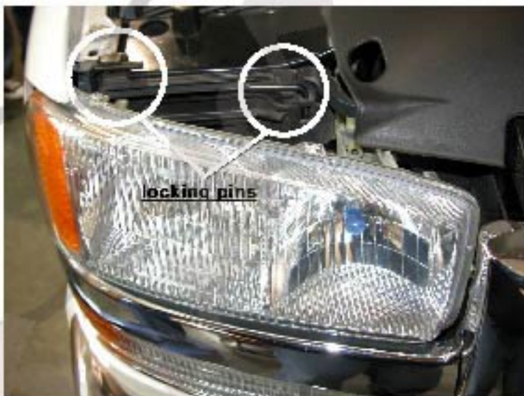
2. There are two locking pins