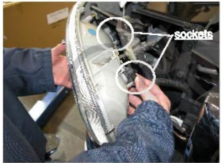
6. Remove the two light bulb sockets on the back of the headlight