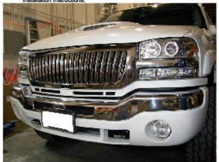
10. The installation now is complete