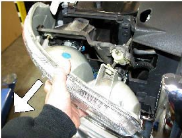
5. pull out the headlight slightly