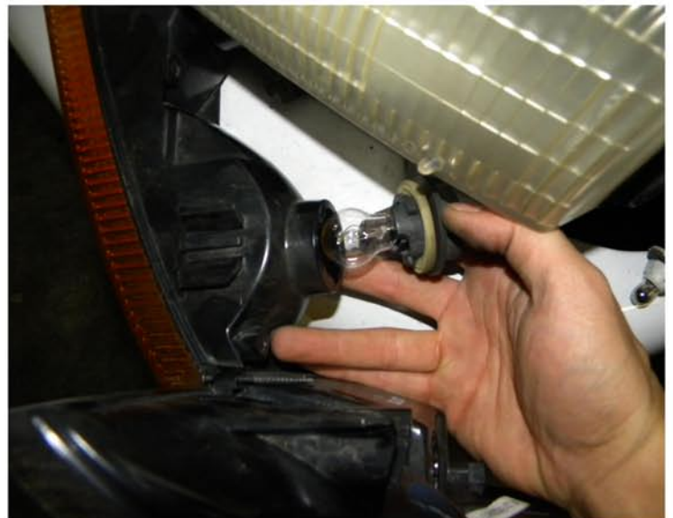
4. Unplug all socket from bumper light and remove the bumper light