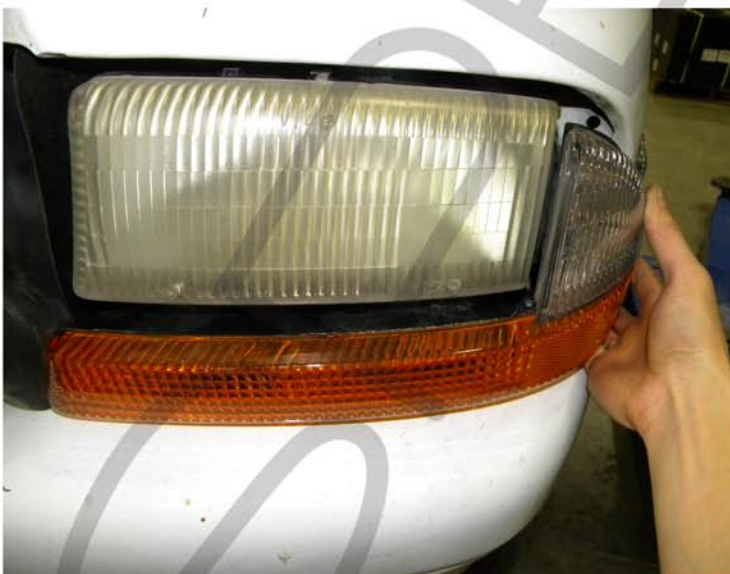
3. Remove one 10mm bolt