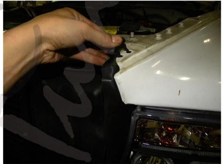
8. Put back the rubber weather shield onto fender