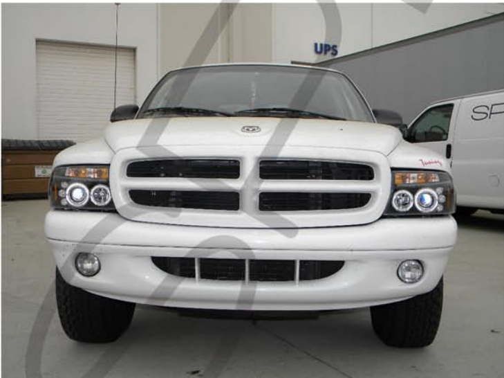
9. Please repeat the step from 1 to 8 for the opposite side