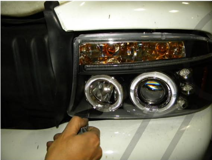
7. Put back all the harness and three 10mm headlight bolts