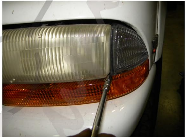
2. Unscrew one T10 Torx head screw