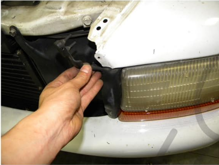
1. Remove the rubber weather seal from fender (1 plastic clip)

If you experience any difficulties that the instruction did not cover, Please seek local auto shop for advise. Please wear protection before you work on your vehicle. An assistant is helpful when removing the front bumper. Please be careful while working with the bumper or body part to avoid scratching. Do not make direct contact with the halogen bulb or the wire assembly until the unit has cooled down after use.