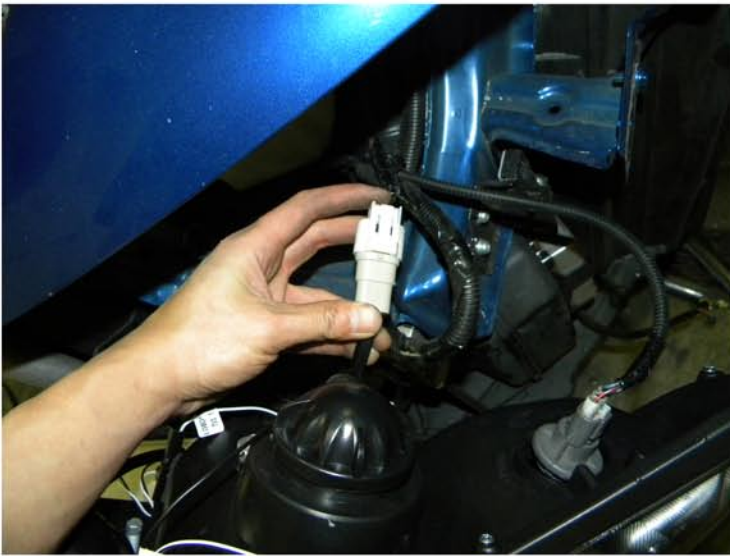
23. Connect the headlight harness to the new headlight Please see the "Halo and L.E.D installation instructions" If your headlights don't have HALO or L.E.D. You can skip this step