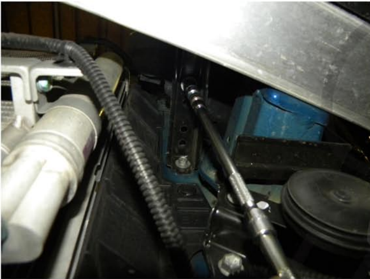
13. Remove the 10mm bolt