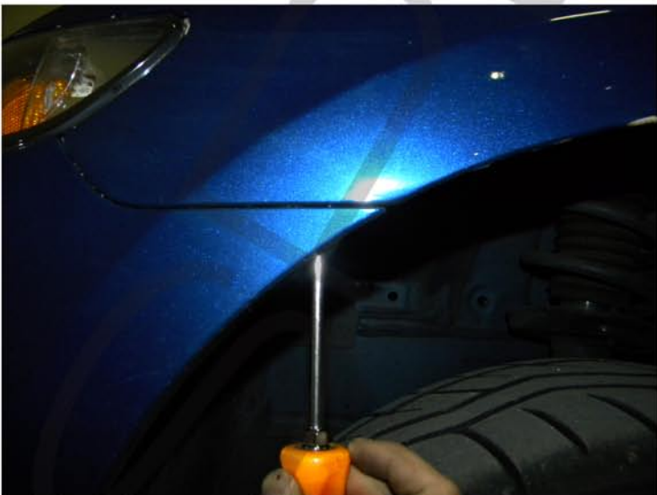
33. Tighten the phillips head screws and replace the (8) plastic clips Please repeat the steps in order from 1 to 33 for the opposite side