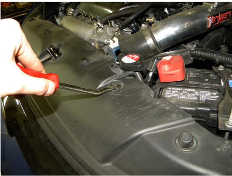
5. Remove the (4) plastic clips