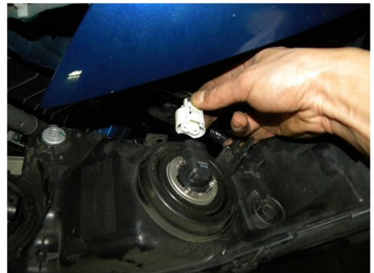
22. Disconnect the headlight harness