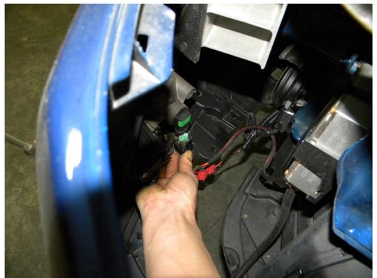
10. Disconnect the fog light harness