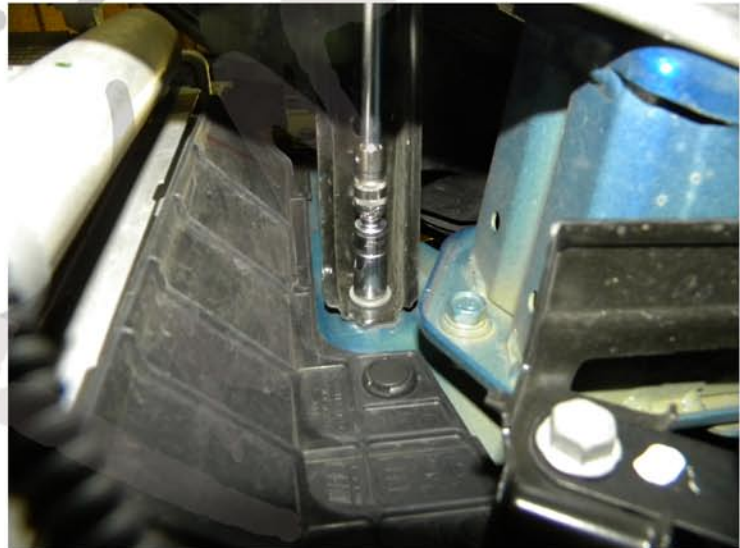
14. Remove the other 10mm bolt