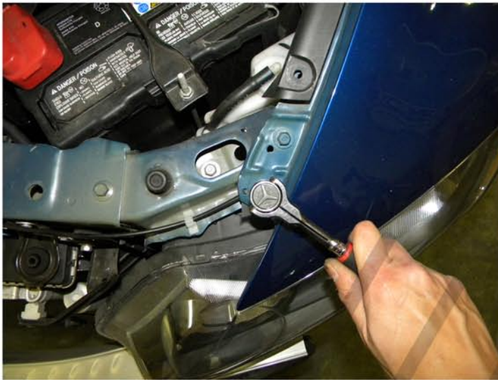
19. Remove the (9) 10mm bolts