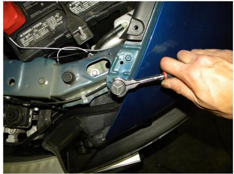
24. Tighten the (2) 10mm bolts