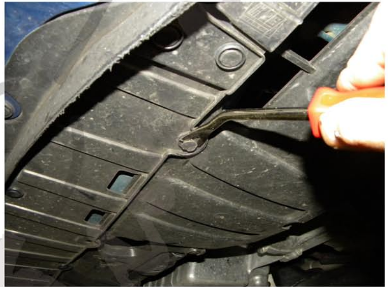
2. Remove the (8) plastic clips