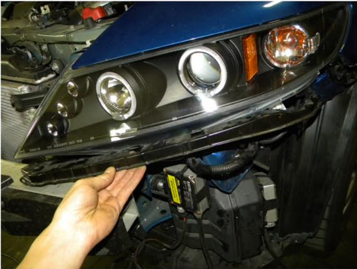
25. Replace the metal bracket