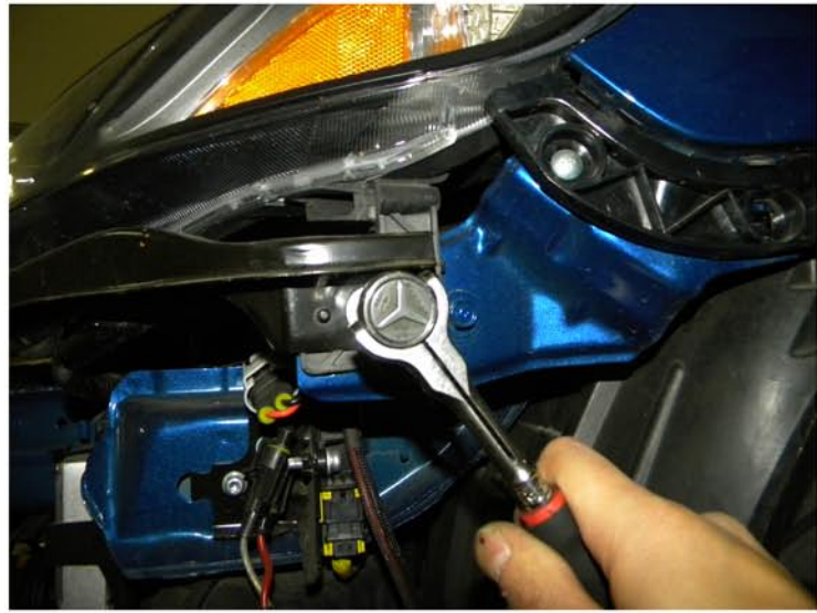
16. Remove the 10mm bolt