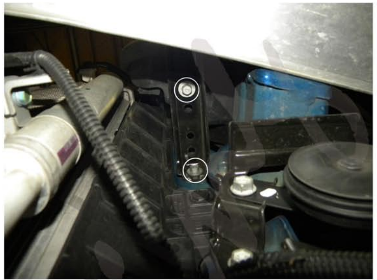
12. (2) 10mm bolts location