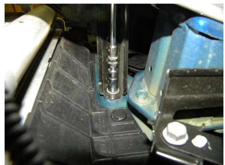
28. Tighten the 10mm bolt