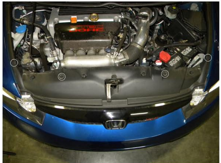
4. (4) Plastic clips location