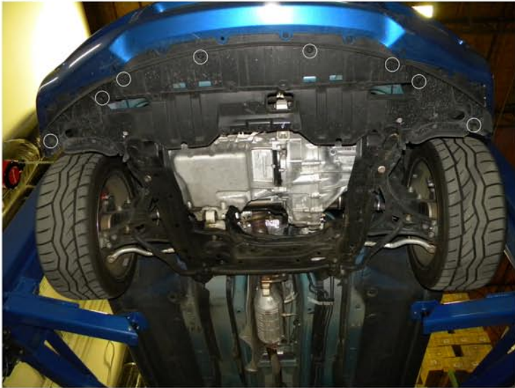
1. (8) Plastic clips location

Do not make direct contact with the halogen bulbs or the wire assembly until the unit has cooled down after use.