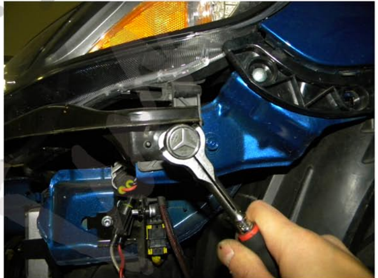
26. Tighten the 10mm bolt