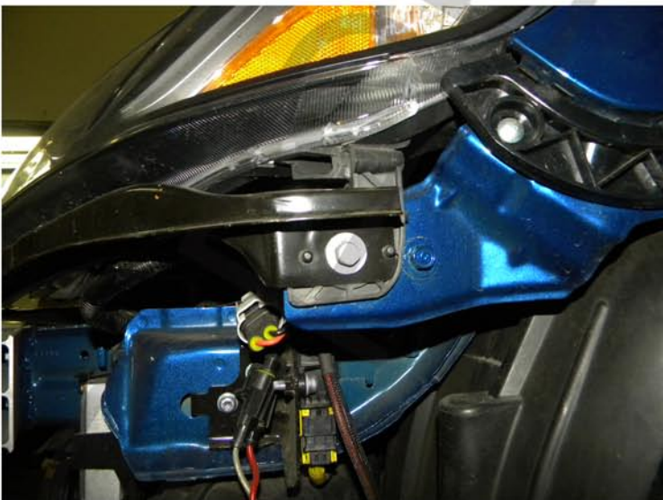
15. 10mm bolt location