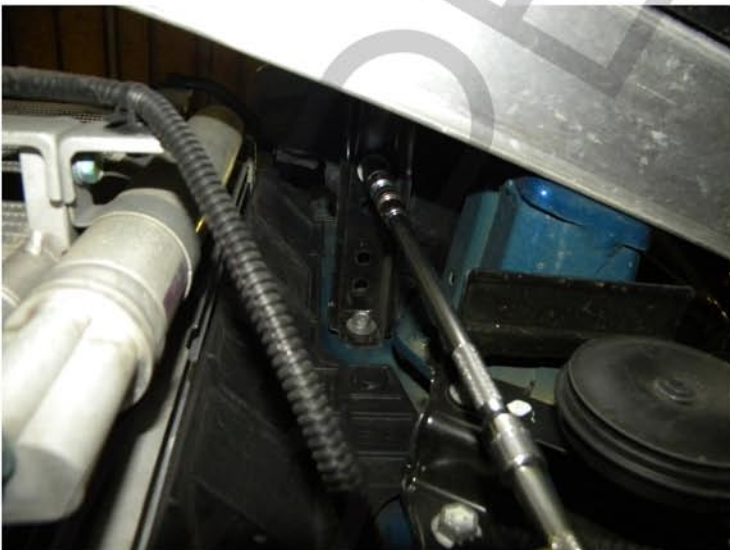
27. Tighten the 10mm bolt