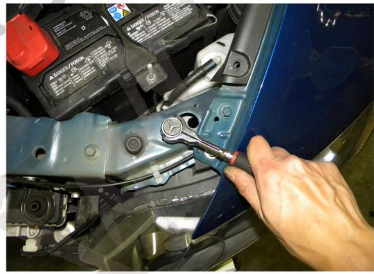
20. Remove the 10mm bolt