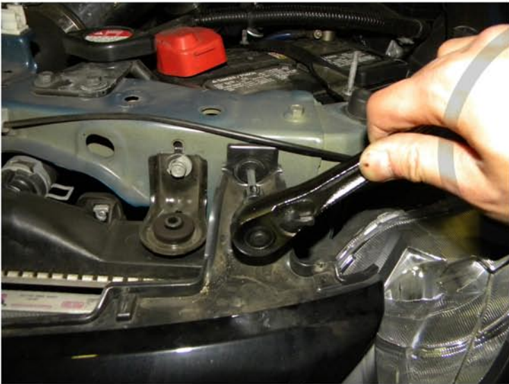
31. Tighten the 5mm allen head bolt