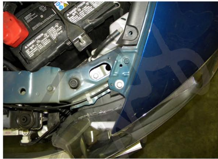
18. (2) 10mm bolts location