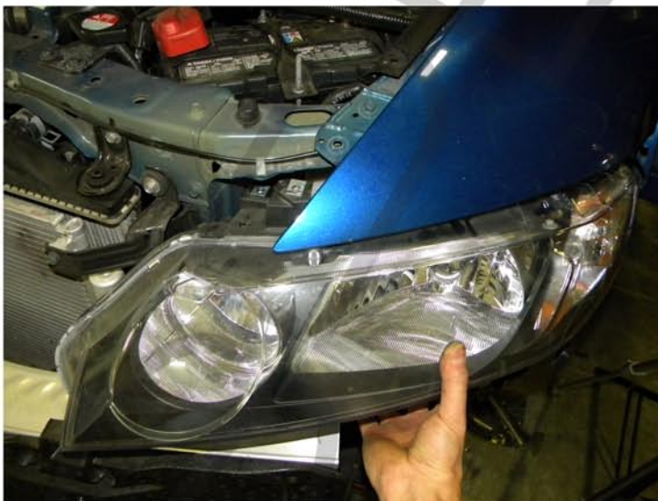
21. Remove the headlight