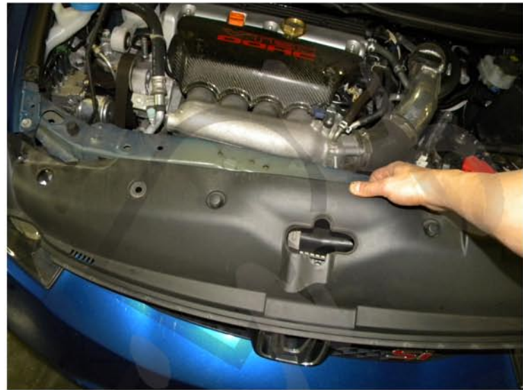
6. Remove the plastic moulding