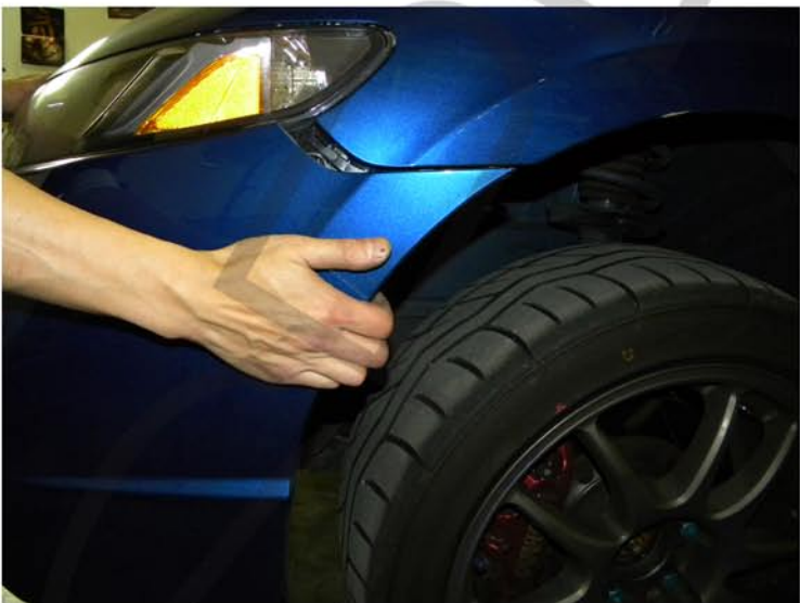
9. Tug on the sides of the front bumper