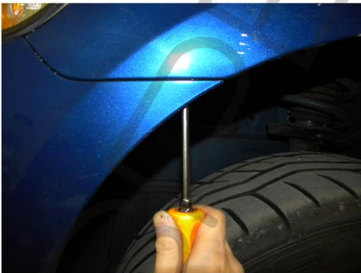
3. Remove the phillips head screw