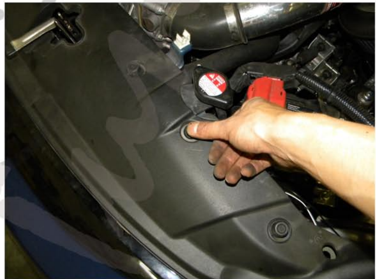
32. Replace the plastic moulding and the (4) plastic clips