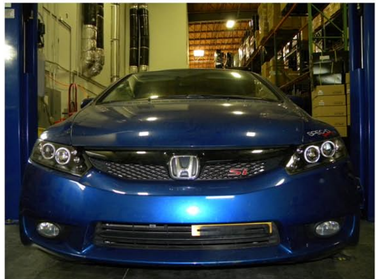
34. The installation is now complete