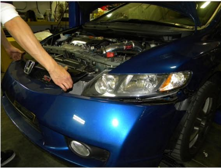
11. Remove the front bumper