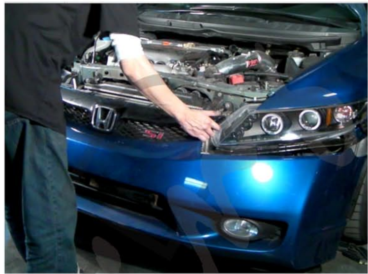
30. Replace the front bumper