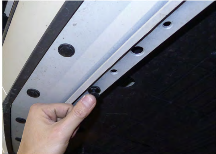
40. Replace the (6) plastic clips