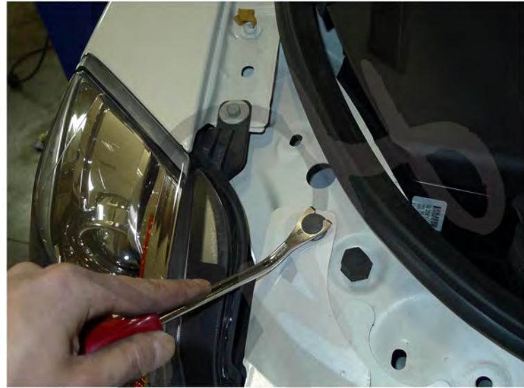
18. Remove the (2) plastic clips