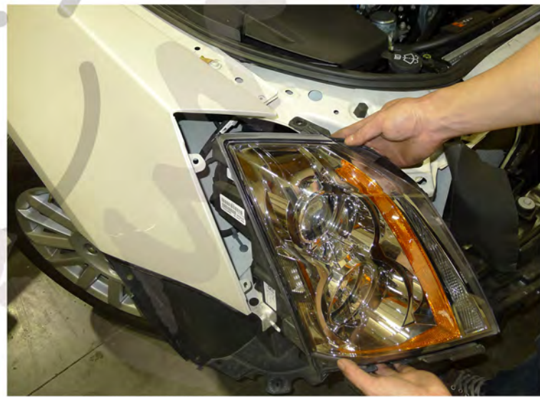
26. Remove the stock headlight