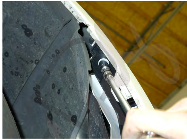
12. Remove the 10mm bolt