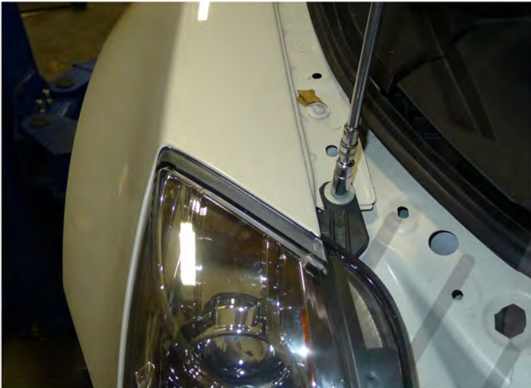
25. Remove the 10mm bolt