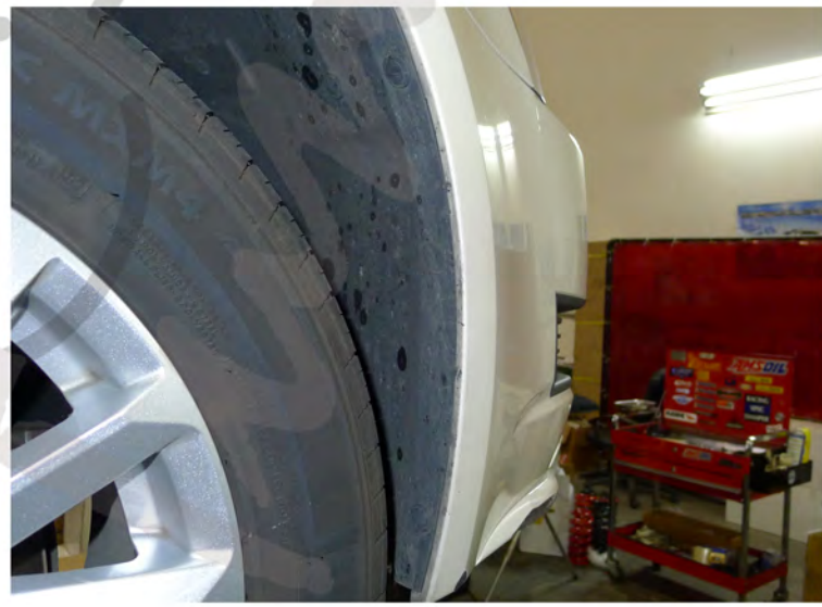
8. (2) plastic clips location