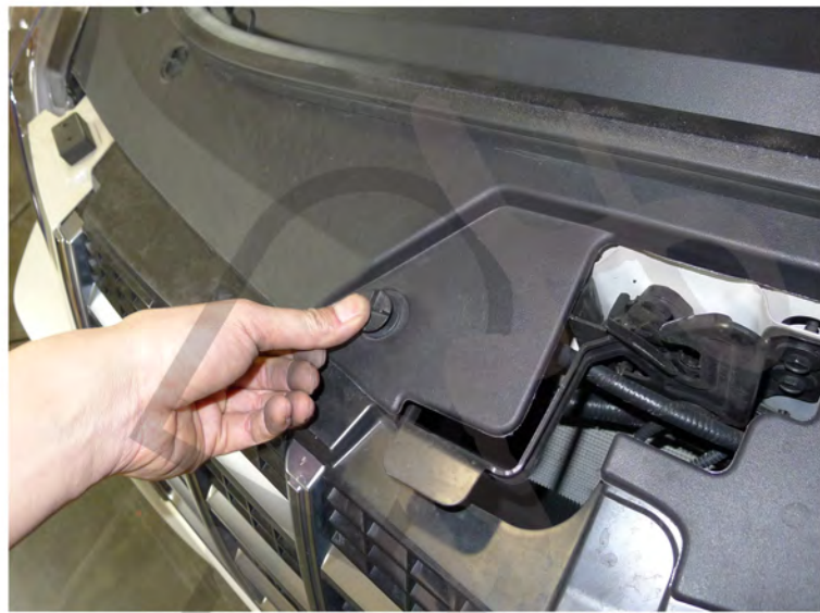
36. Replace the (4) plastic clips