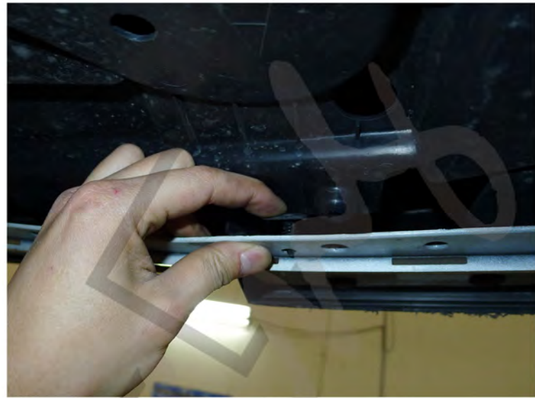
42. Prep lace the (2) plastic clips Please repeat the steps from 1 to 42 for the opposite side