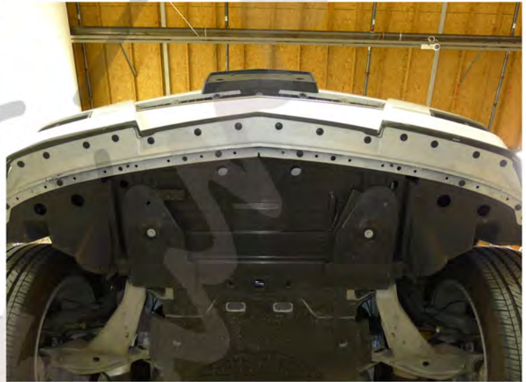
2. (6) plastic clips location