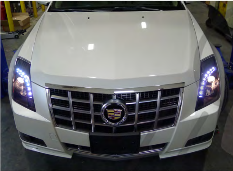
43. The installation is now complete