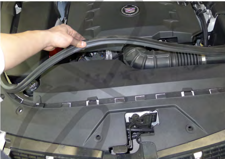
15. Remove the weather strip from the plastic cover