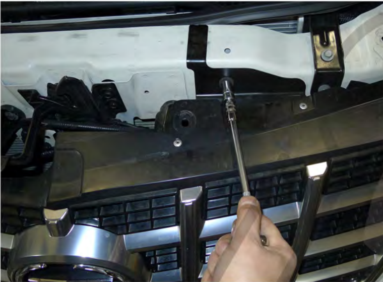
19. Remove the (2) 10mm bolts