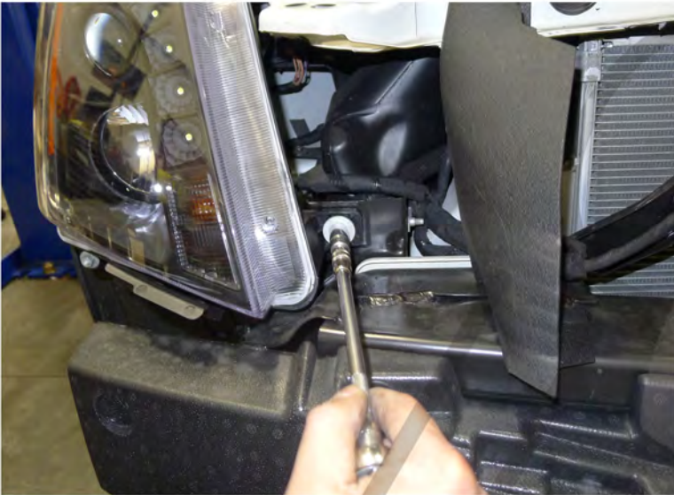
31. Tighten the 10mm bolt