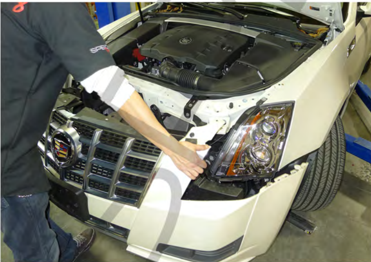
21. Remove the front bumper