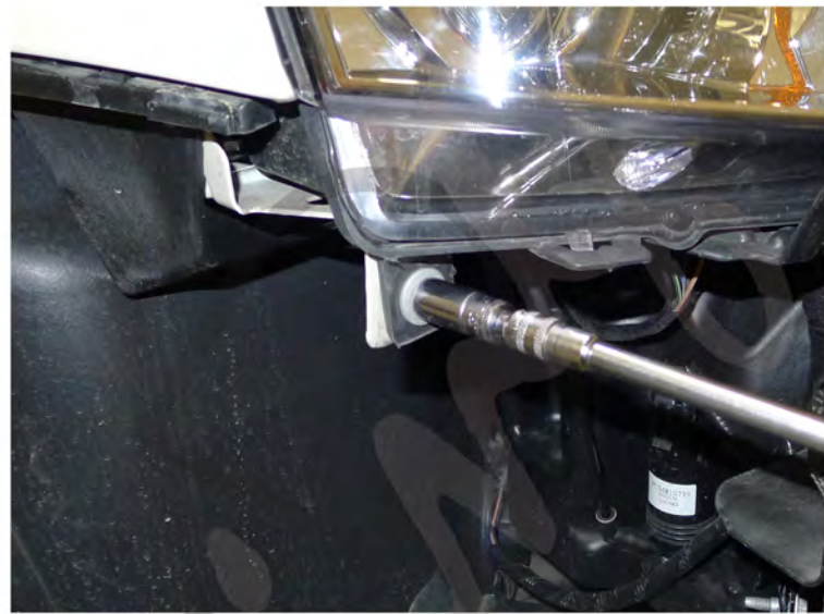
24. Remove the 10mm nut