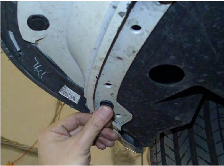
41. Replace the (6) plastic clips