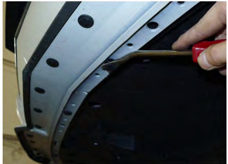
4. Remove the (6) plastic clips