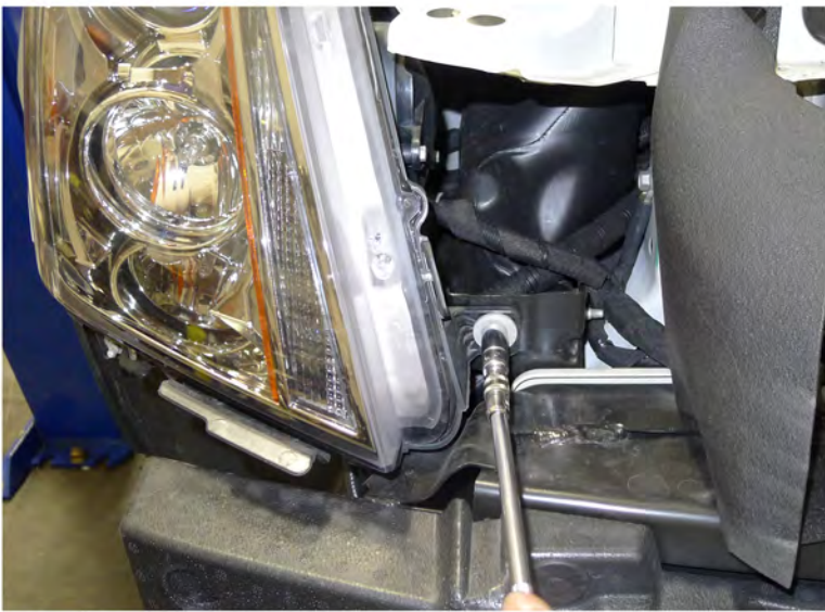
23. Remove the 10mm bolt