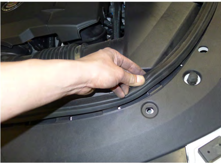
35. Replace the weathers trip