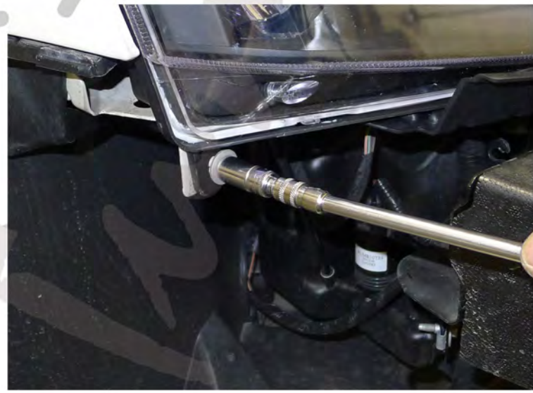
32. Tighten the 10mm nut