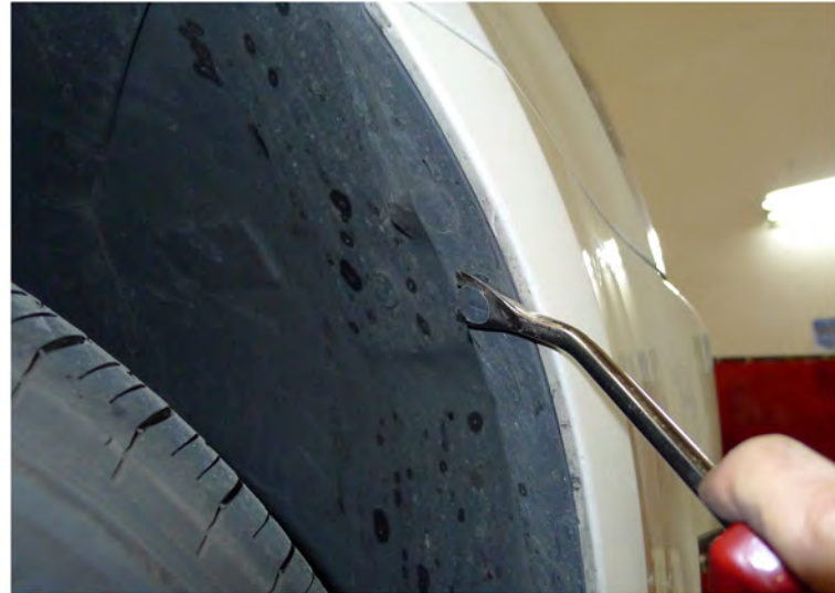
10. Remove the (2) plastic clips