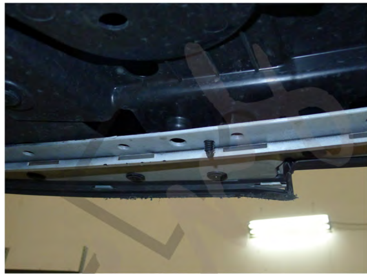
6. Remove the (2) plastic clips