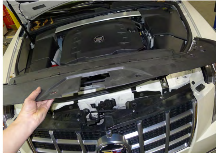
16. Remove the plastic cover