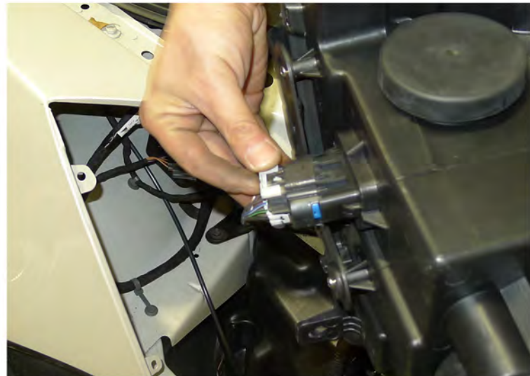
28. Connect the headlight harness to the new headlight Please see the "Halo and L.E.D installation instructions" If your headlights don't have HALO or L.E.D. you can skip it