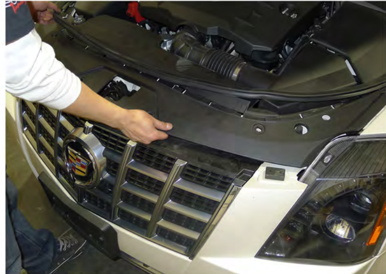
34. Replace the plastic cover