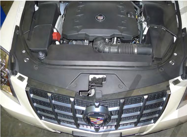
13. (6) plastic clips location