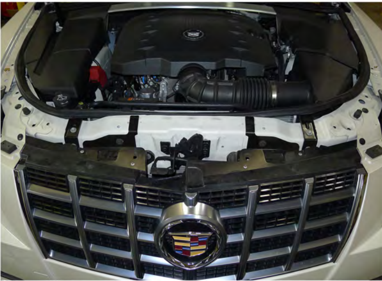
17. (2) plastic clips and the (2) 10mm bolts location