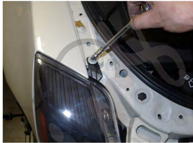
30. Tighten the 10mm bolt