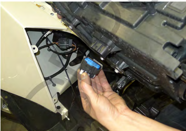
27. Disconnect the headlight harness