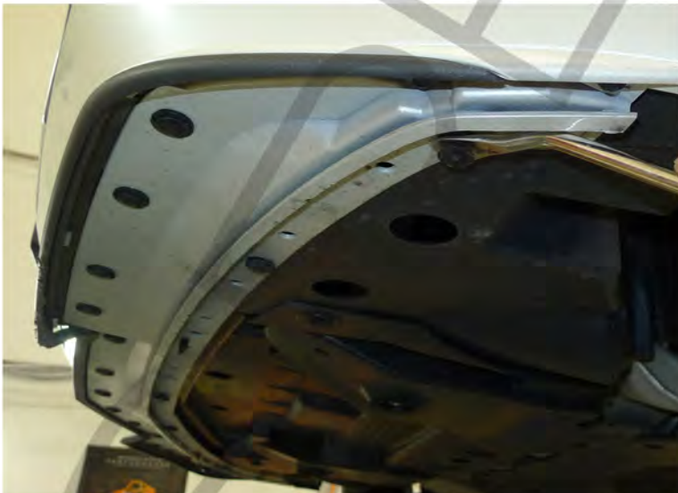
3. Remove the (6) plastic clips