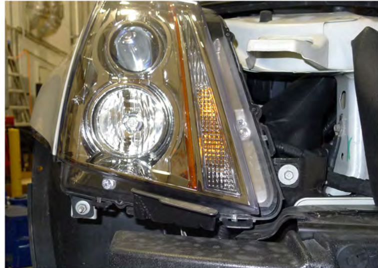
22. 10mm nut and 10mm bolt location