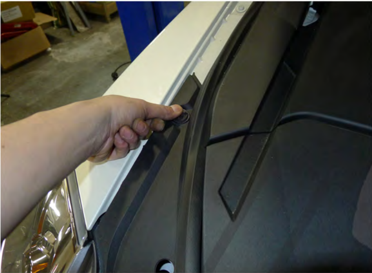
37. Replace the (6) plastic clips