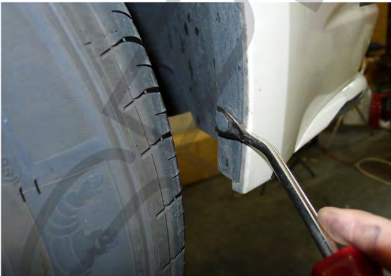
9. Remove the (2) plastic clips