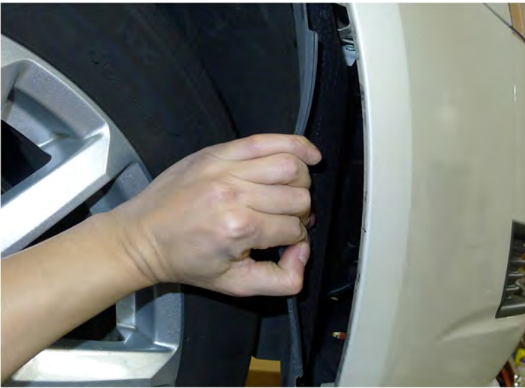
11. Pull the fender liner aside