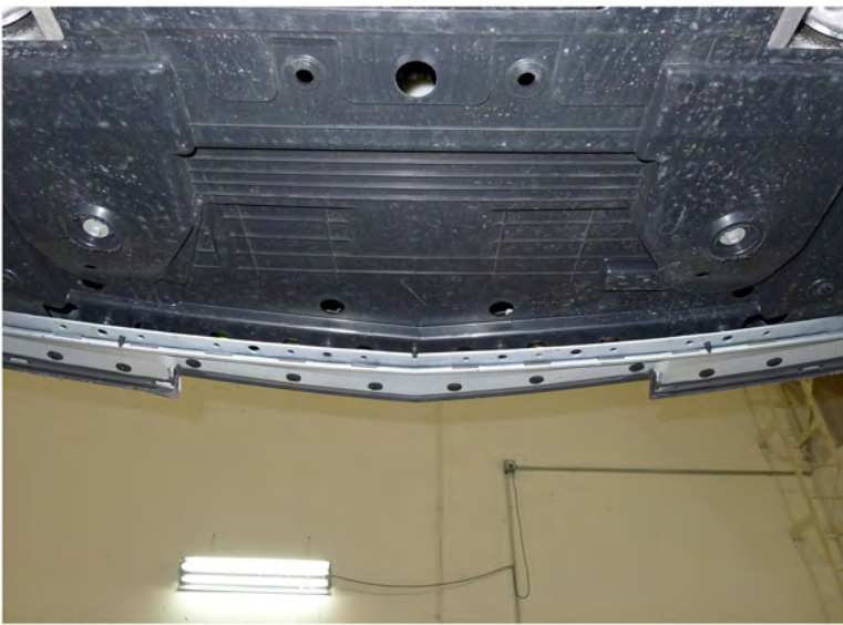
5. (2) plastic clips location