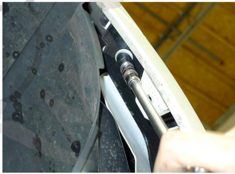
38. Tighten the 10mm bolt