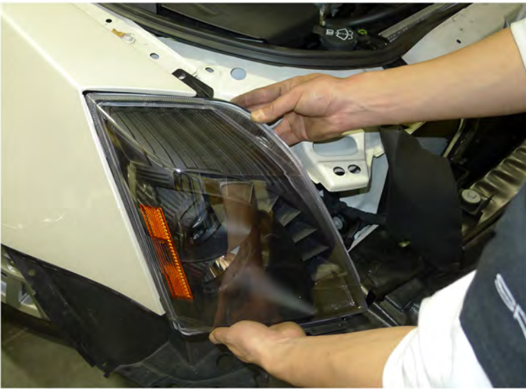
29. Place the new headlight in the stock location