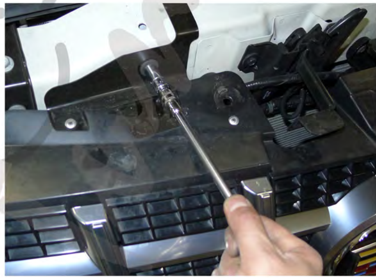
20. Remove the (2) 10mm bolts