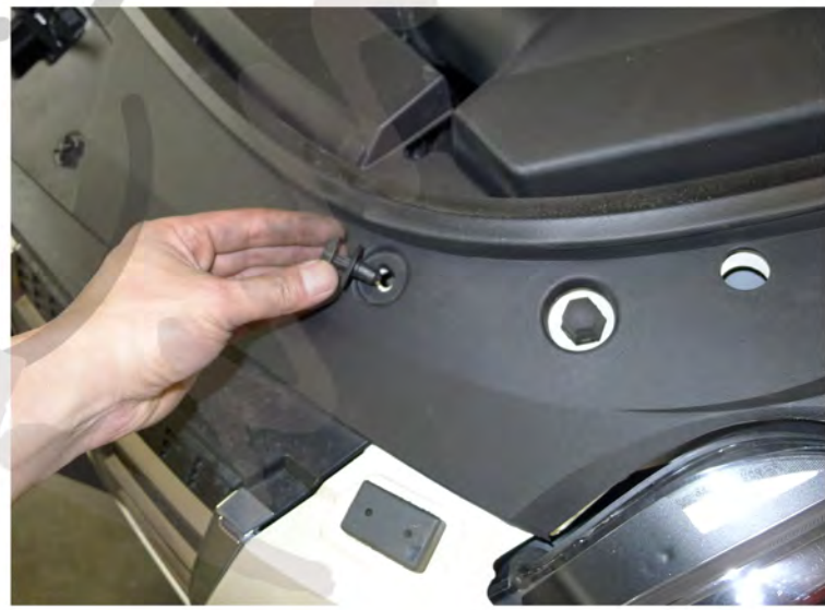
14. Remove the (6) plastic clips