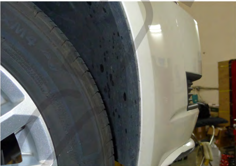
39. Replace the (2) plastic clips