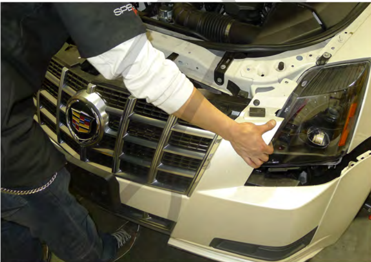
33. Replace the front bumper