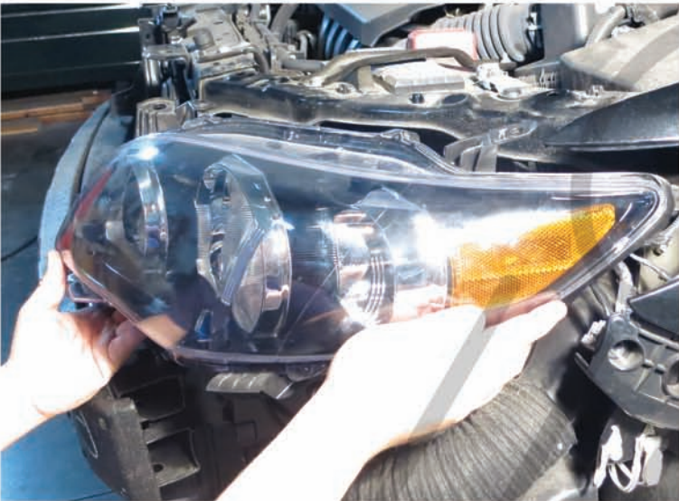
13. Remove the factory headlight