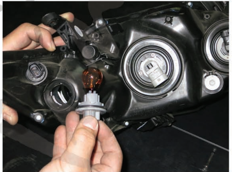
14. Remove the light socket