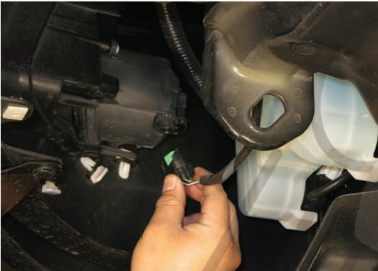
7. Disconnect the foglight harness