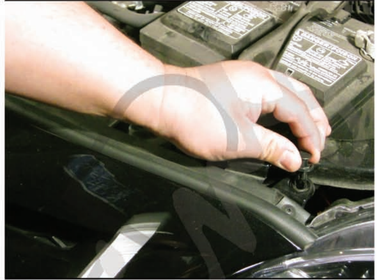
6. Remove the (3) plastic clips, (2) phillips screws, and (2) 10mm bolts