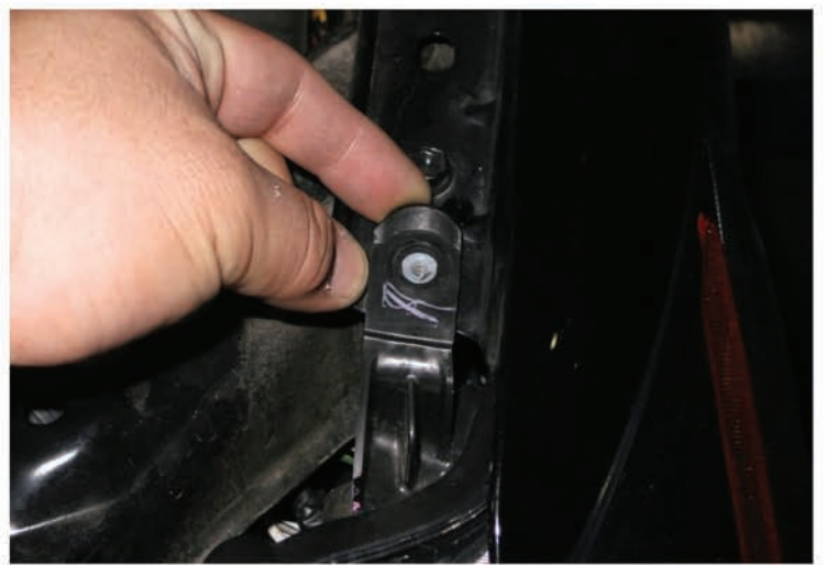
10. Release locating tab