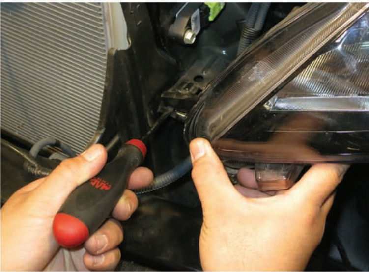
11. Release the locating tab