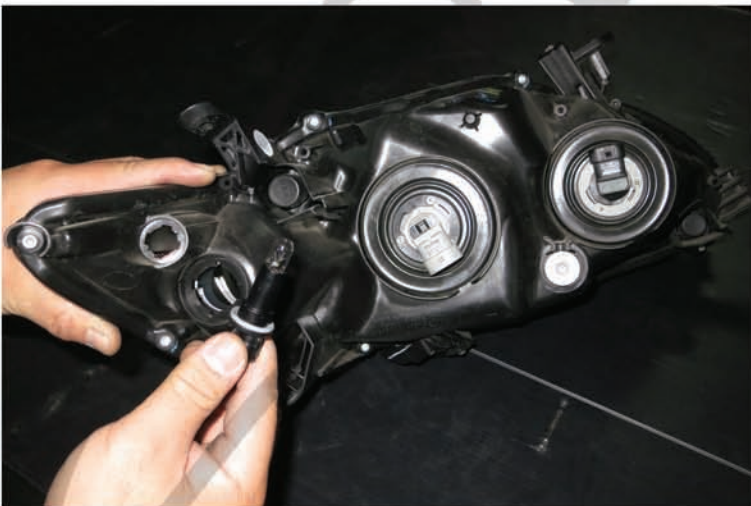
15. Remove the light socket