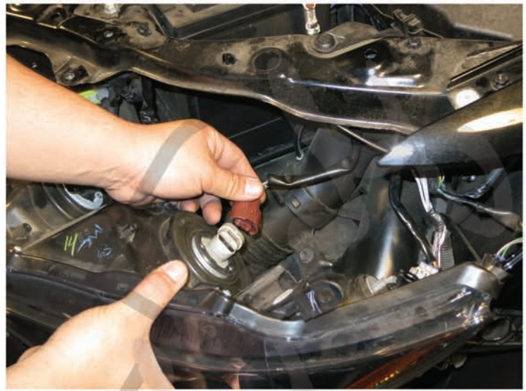
12. Disconnect the headlight harness