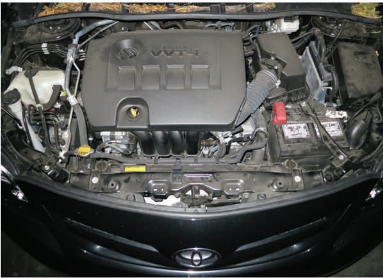
5. Remove the (3) plastic clips, (2) phillips screws, and (2) 10mm bolts