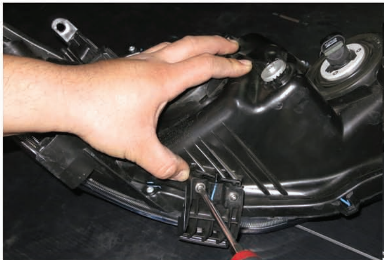
16. Plastic mounting bracket and (2) phillips head screw locations