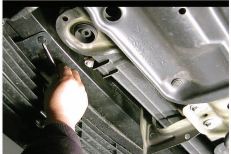
4. Remove the (4) plastic clips