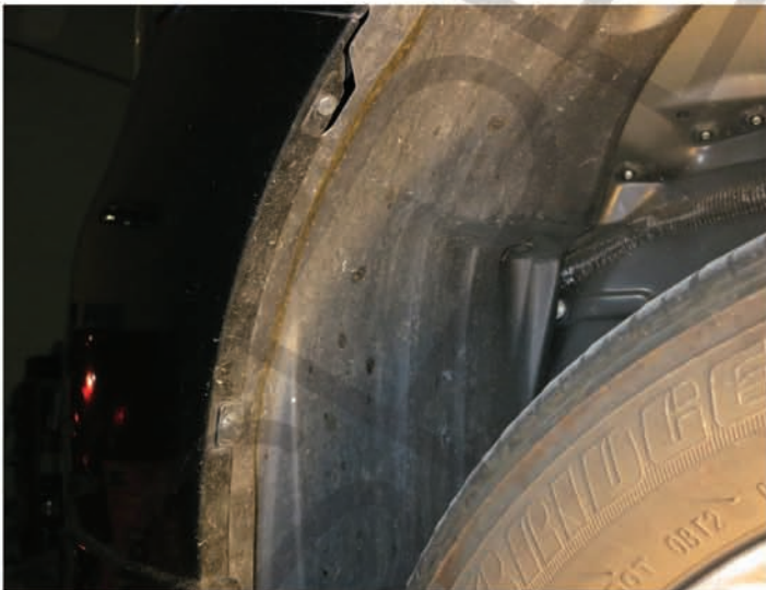
3. (2) Plastic clip locations