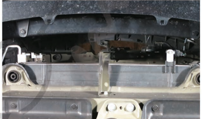
2. (2) plastic clip locations