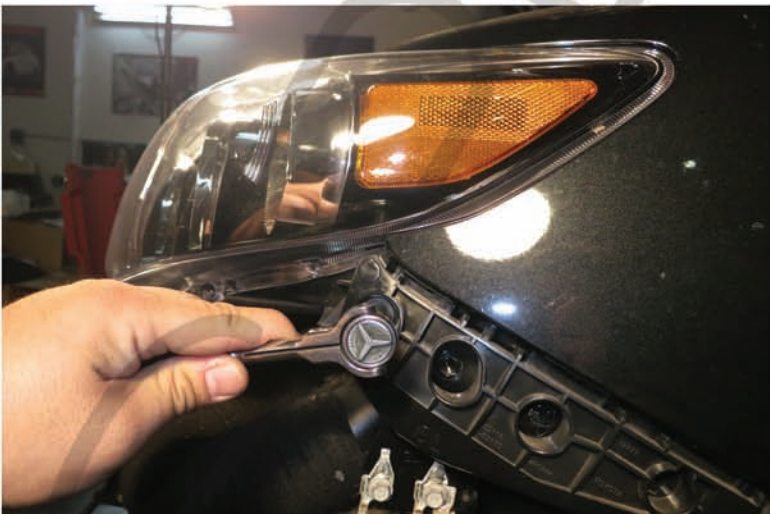
9. Remove the 10mm bolt