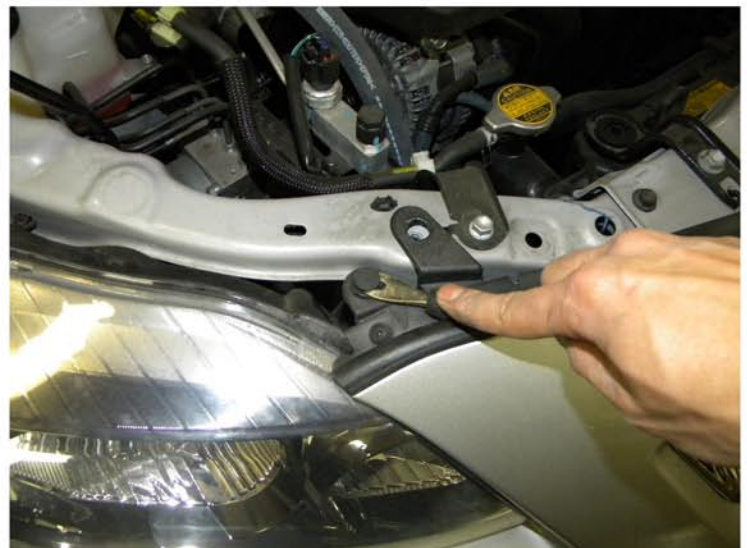
10. Remove the (9) plastic clips