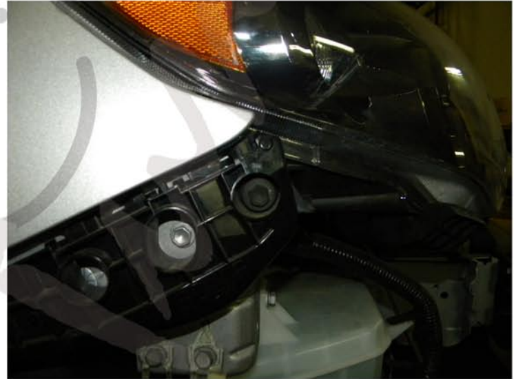
14. 10mm bolt location