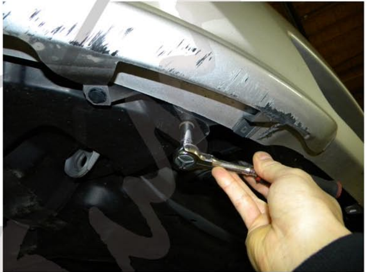
2. Remove the (4) 10mm bolts