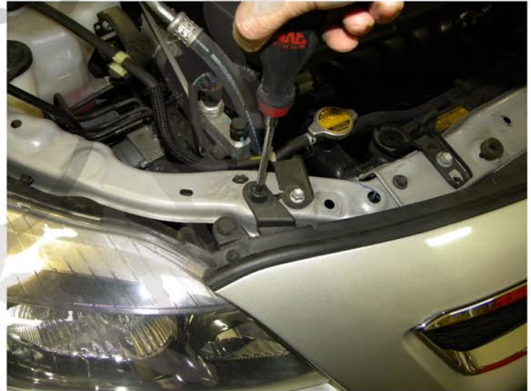
8. Remove the (4) phillips head screws