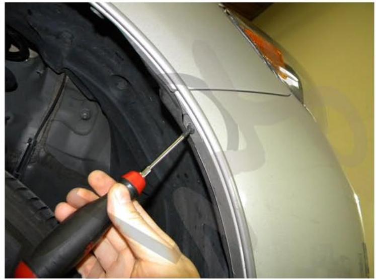
6. Remove the (2) plastic clips