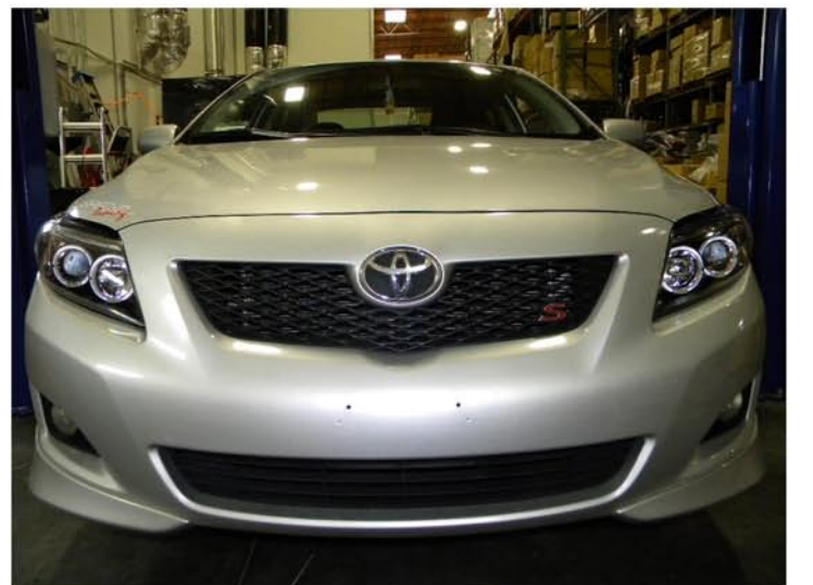
28. The installation is now complete