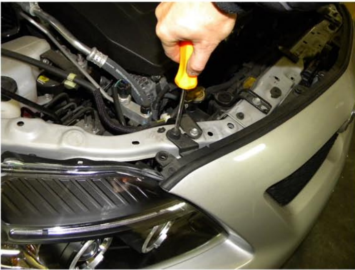
23. Tighten the (4) phillips head screws