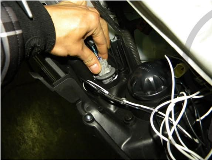
19. Connect the headlight harness to the new light

Please see the Halo and L.E.D installation instruction If your headlights don't have HALO or L.E.D. You can skip it