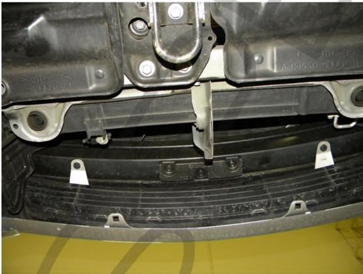
3. (2) plastic clips location