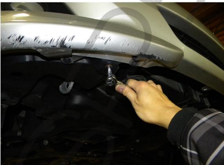
27. Tighten the (4) 10mm bolts Please repeat the step in order from 1 to 27 for the opposite side