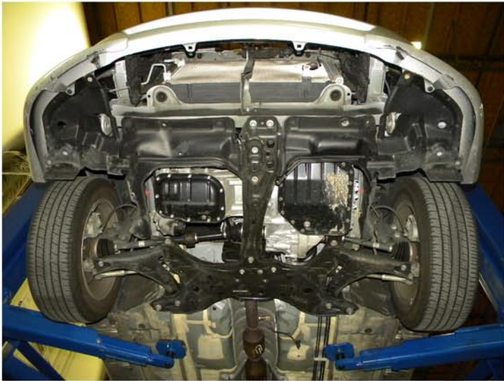
1. (4) 10mm bolts location

Do not make direct contact with the halogen bulbs or the wire assembly until the unit has cooled down after use.