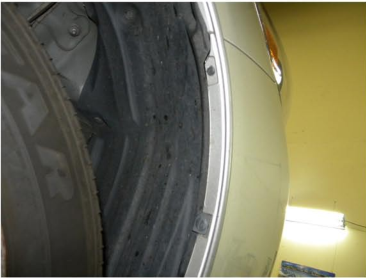
5. (2) plastic clips location