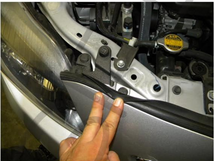
9. Plastic clips hidden under the weather strip