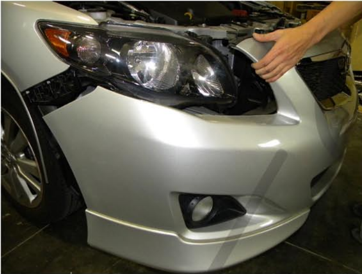
13. Remove the front bumper