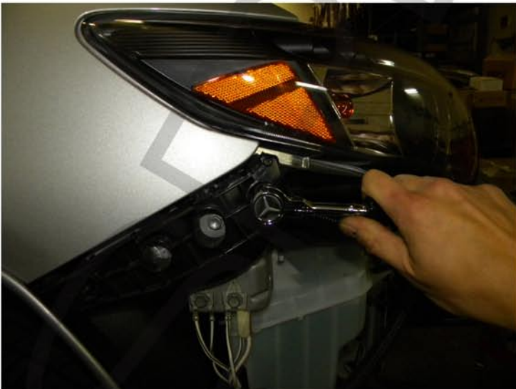
21. Tighten the 10mm bolt