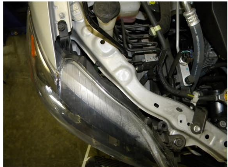
16. (2) 10mm bolts location