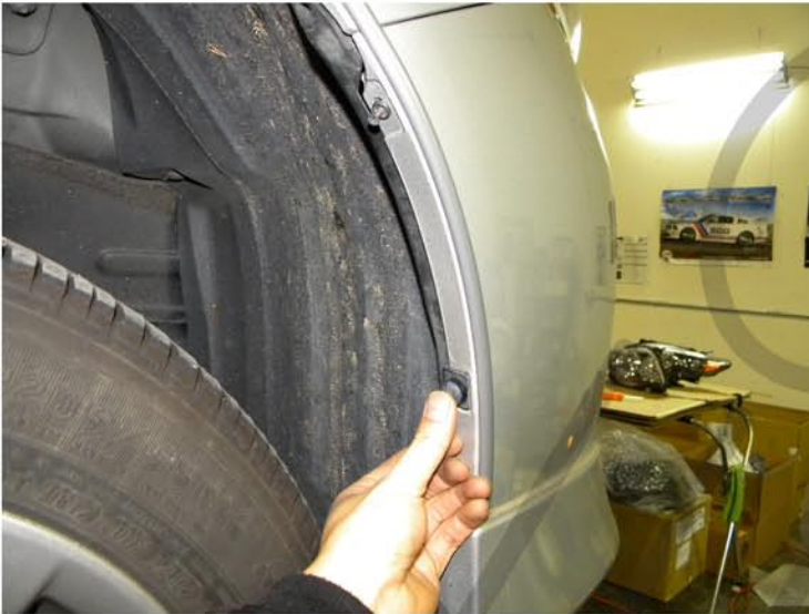
25. Replace the (2) plastic clips