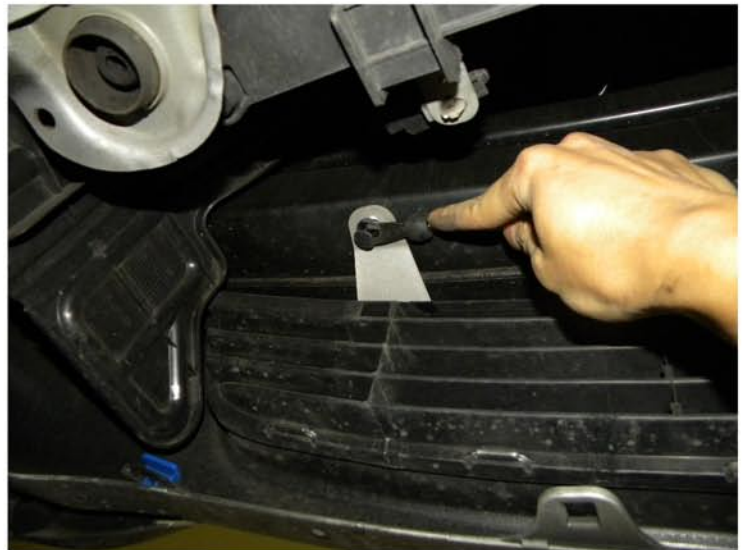
4. Remove the (2) plastic clips