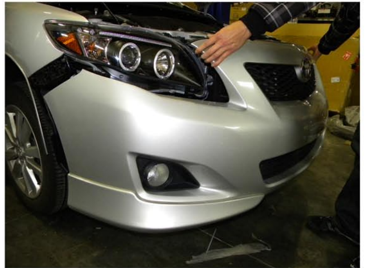
22. Replace the front bumper