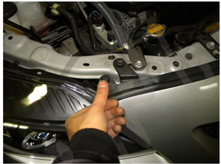
24. Replace the (9) plastic clips