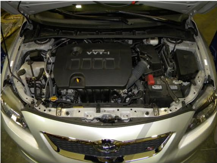
7. (4) phillips head screws location