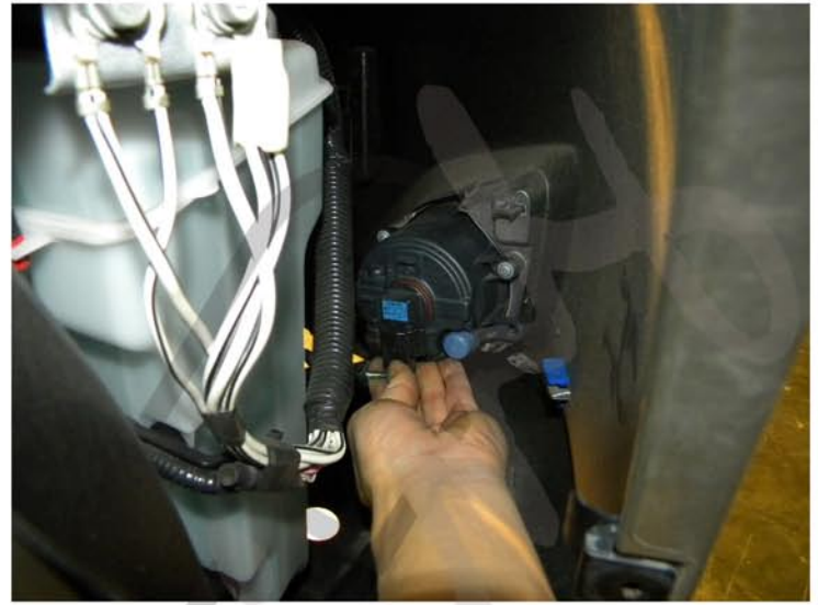
12. Disconnect the fog light harness