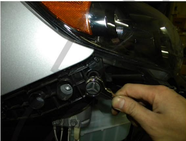
15. Remove the 10mm bolt