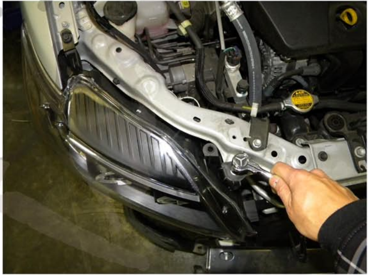
20. Tighten the (2) 10mm bolts

Please see the Halo and L.E.D installation instruction If your headlights don't have HALO or L.E.D. You can skip it