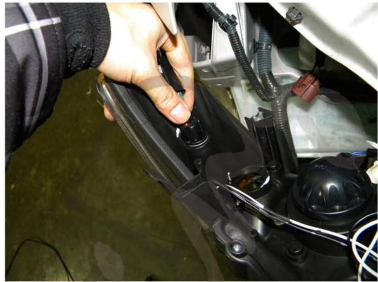
18. Disconnect the headlight harness and plug in to the new headlight