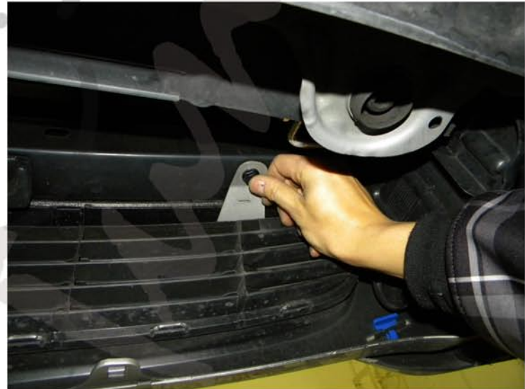
26. Replace the (2) plastic clips