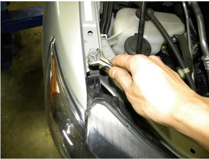
17. Remove the (2) 10mm bolts