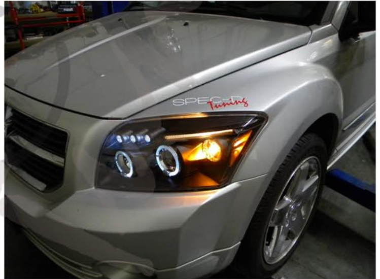
20. The installation is now complete