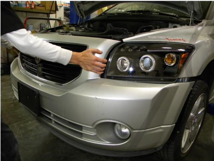
13. Install the front bumper