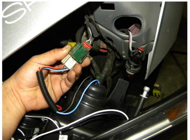
10. Connect all the headlight harnesses

Please see the Halo and L.E.D installation instruction If your headlights don't have HALO or L.E.D. You can skip it