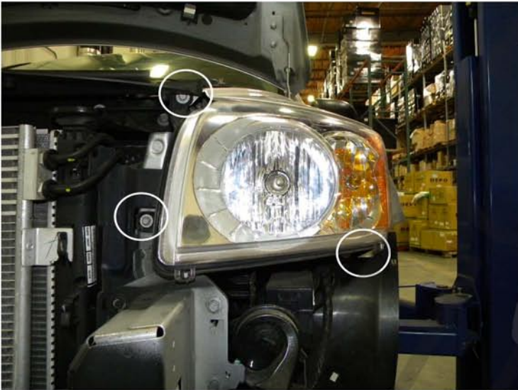
7. Remove three 10mm headlight bolts