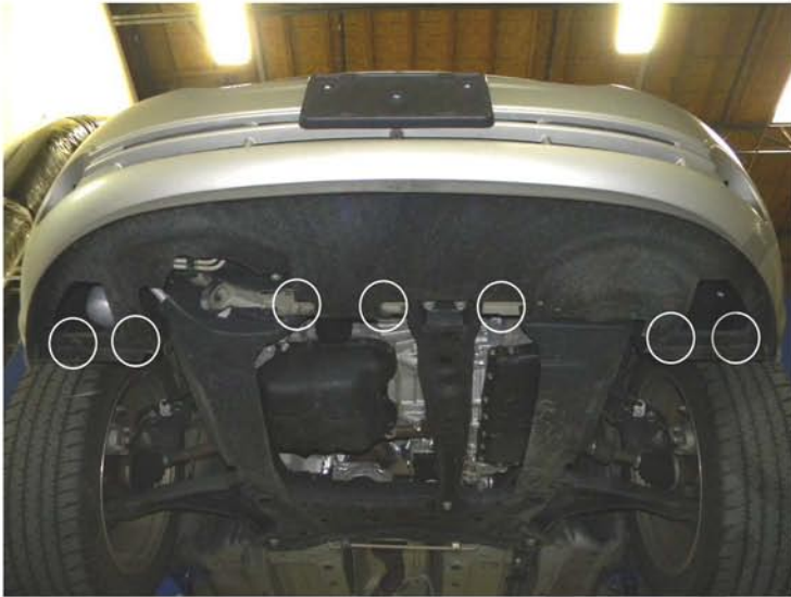
1. Remove four clips and three 10mm bolts

If you experience any difficulties that the instruction did not cover, Please seek local auto shop for advise. Please wear protection before you work on your vehicle. An assistant is helpful when removing the front bumper. Please be careful while working with the bumper or body part to avoid scratching. Do not make direct contact with the halogen bulb or the wire assembly until the unit has cooled down after use.