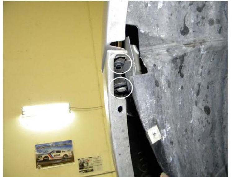
4. Remove one 7mm bolt and one clip from inside of the bumper