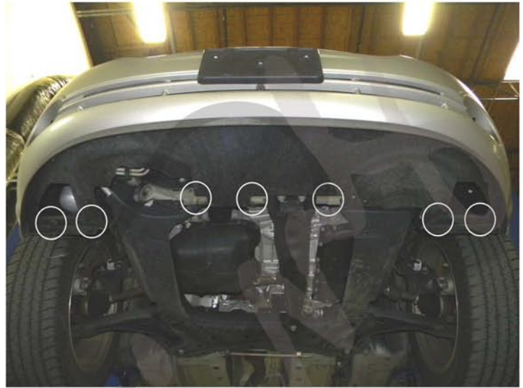
18. Install four clips and three 10mm bolts