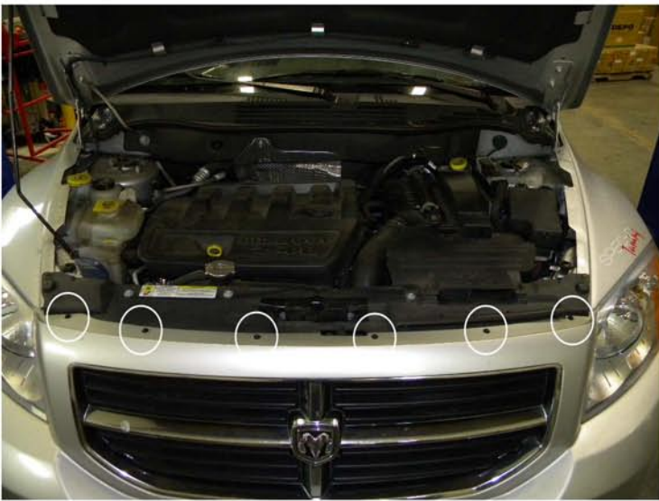
5. Remove six T25 bolts