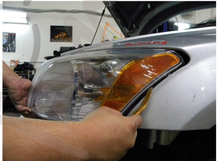
8. Pull out the headlight