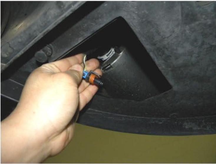
17. Connect the fog light harness