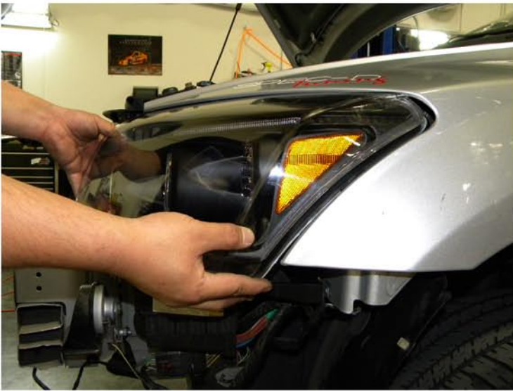
11. Install the projector headlight back to original location