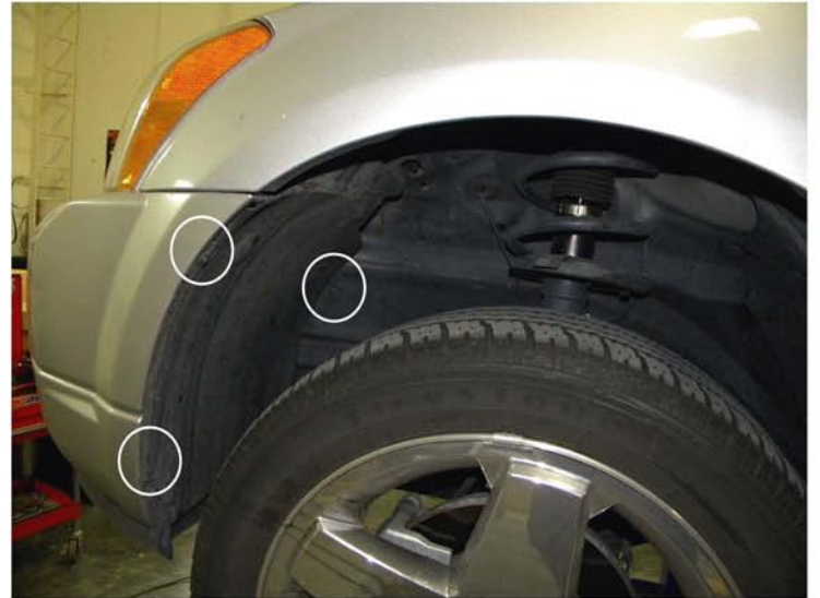
16. Install one clip and two 7mm bolts