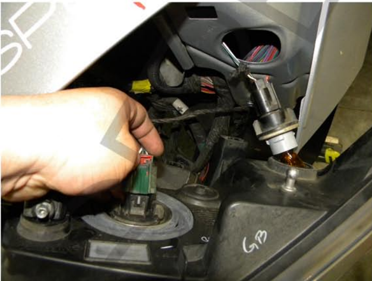
9. Disconnect all headlight harnesses then remove the headlight