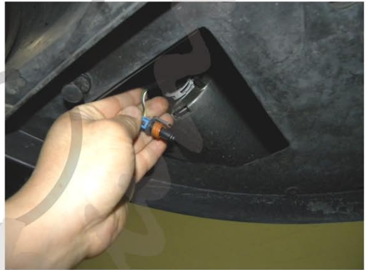
2. Disconnect the fog light harness