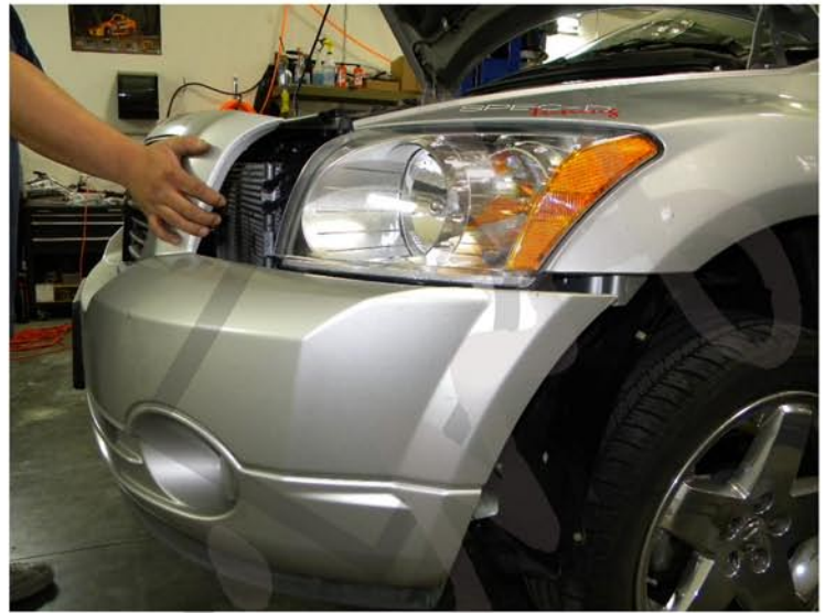
6. Remove the front bumper