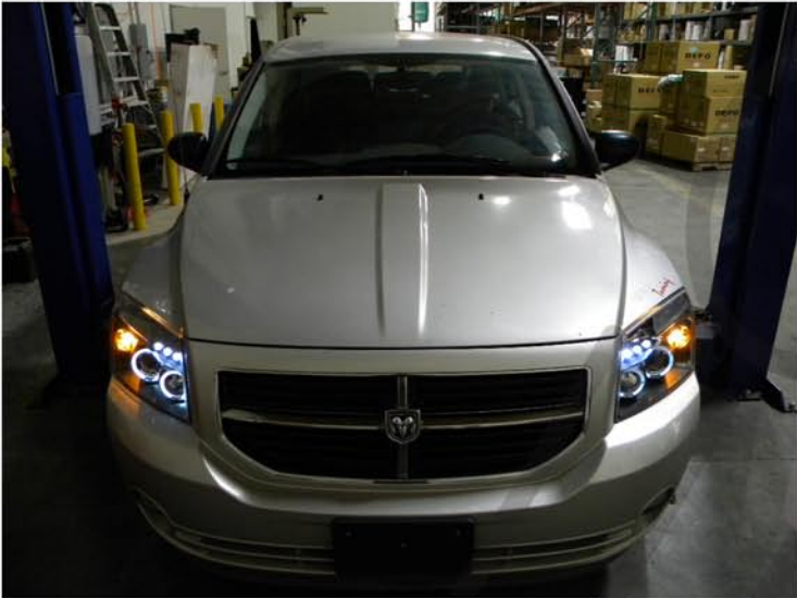
19. Please repeat the steps from 1 to 19 for the opposite side