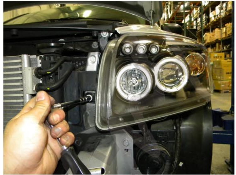
12. Install three 10mm headlight bolts