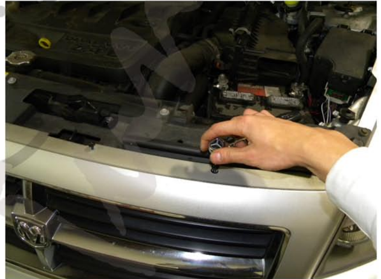
14. Install six T25 bolts