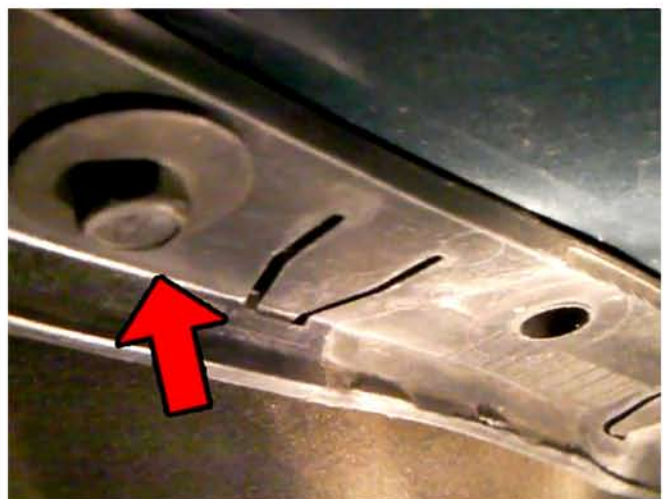
16. Install 1 bolt which is behind the plastic cover