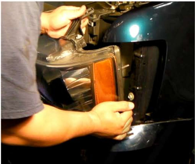
13. Install the new headlight to the original spot