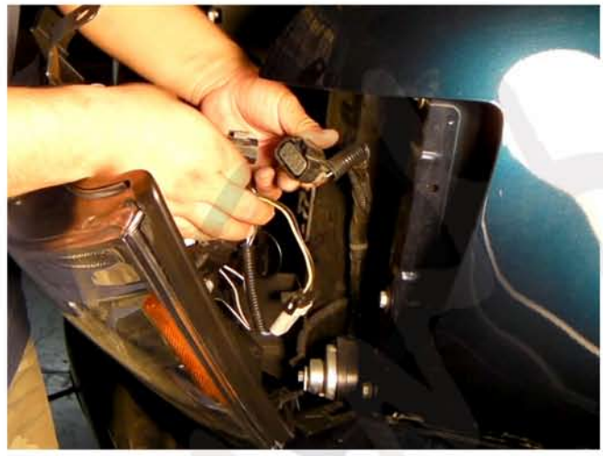
12. Connect all the connectors with vehicle Please see the "Halo and L.E.D installation instructions"