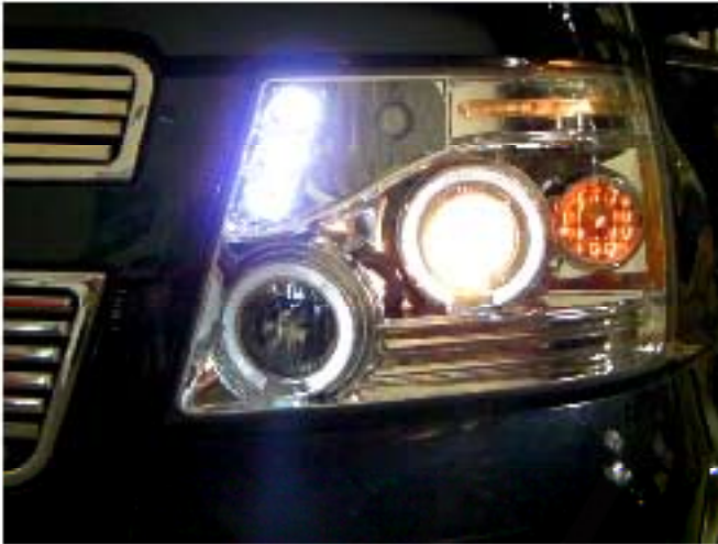
19. The installation now is complete (please repeat the picture order from 1 to 18 for the opposite side)