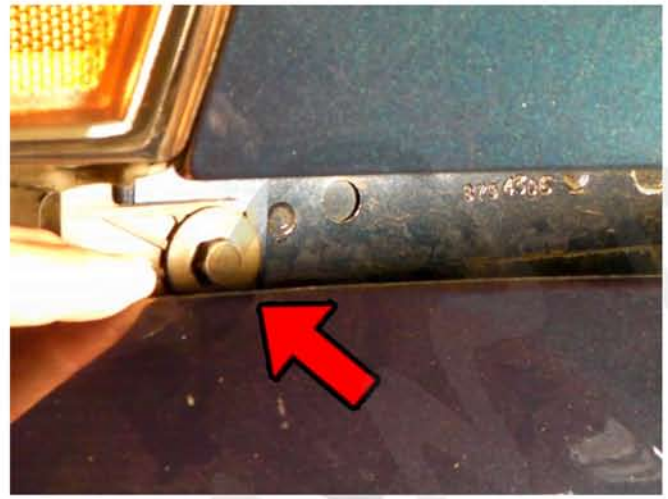
6. There is one screw need to be remove which hidden in the front bumper