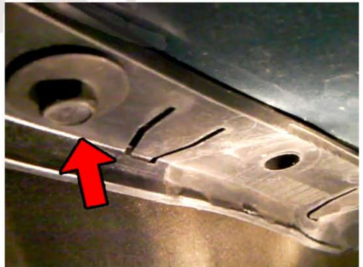
4. There is one bolt need to be remove which is behind the plastic cover