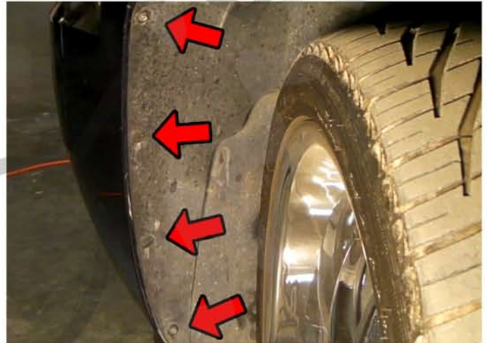
2. Under the wall wheel , there are 2 screws and 2 clips need to be removed