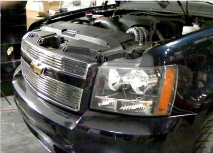
1. Open the hood first

If you experience any difficulties that the instruction did not cover, Please seek local auto shop for advise. Please wear protection before you work on your vehicle. An assistant is helpful when removing the front bumper. Please be careful while working with the bumper or body part to avoid scratching. Do not make direct contact with the halogen bulb or the wire assembly until the unit has cooled down after use.