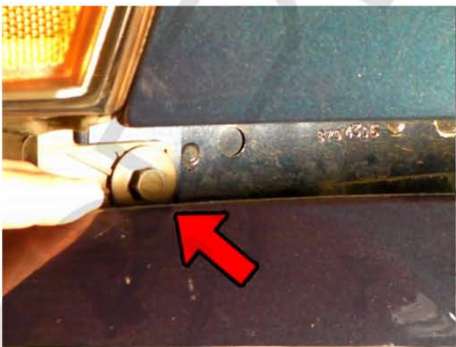
15. Install one screw which hidden in the front bumper