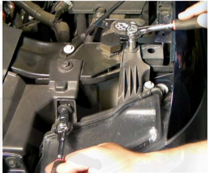
14. Install the two screws from the top of the headlight to fasten the new headlight