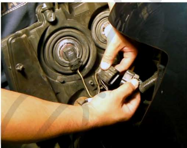
9. Disconnect the hardness from headlights