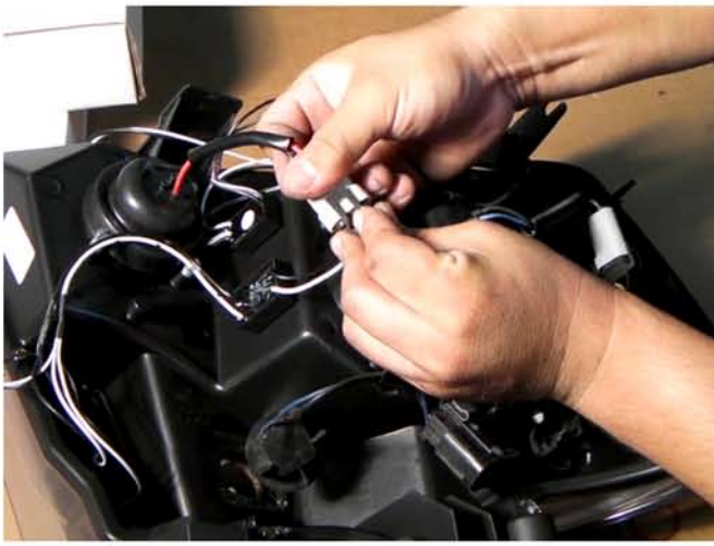
11. Connect with the new headlight harness