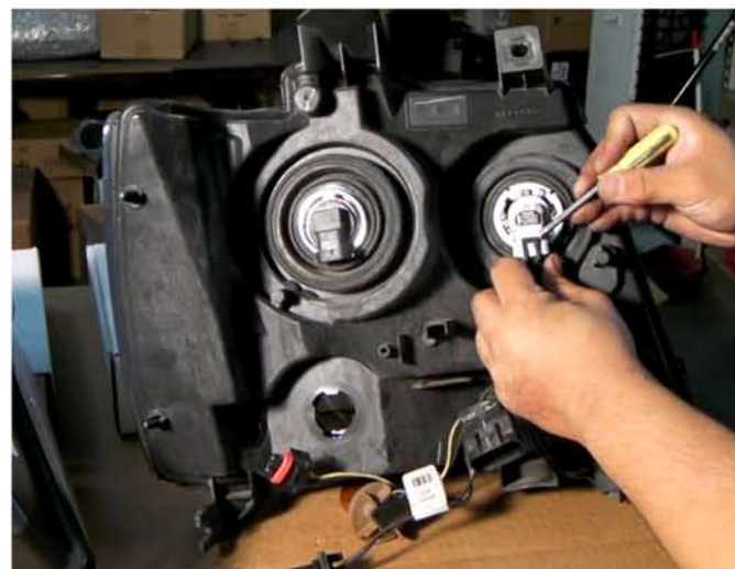
10. Take out all original headlight harness from headlight and signal light and replace with new headlight harness