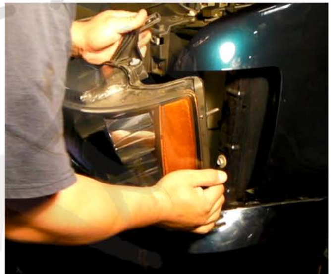
8. Gently pull out the headlights