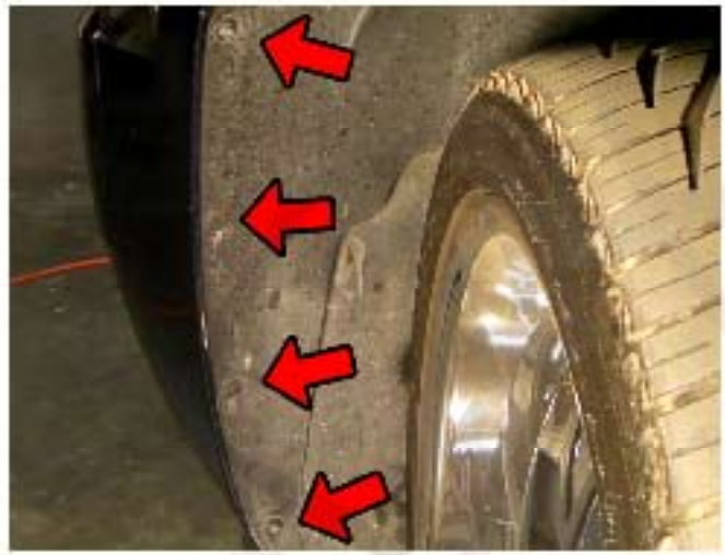
18. Install the 2 screws and 2 clips, under the wall wheel