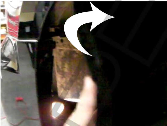
3. After remove 4 clips, pull out the plastic cover slightly