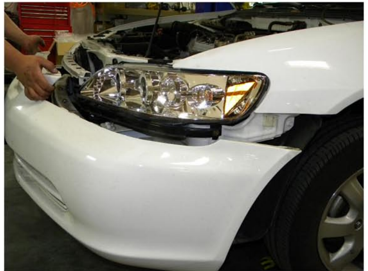
16. Install the front bumper

Please see the Halo and L.E.D installation instruction If your headlights don't have HALO or L.E.D. You can skip it