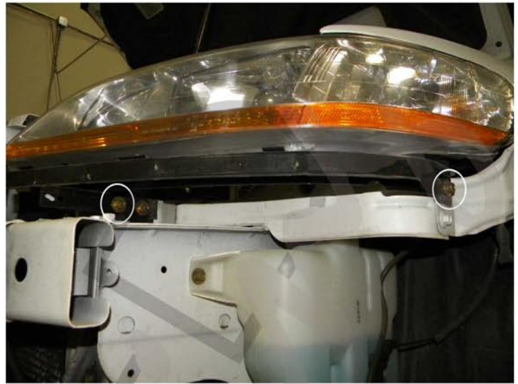
6. Remove three 10mm bolts, then remove the bracket