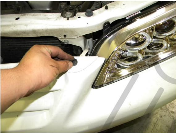
19. Install two clips