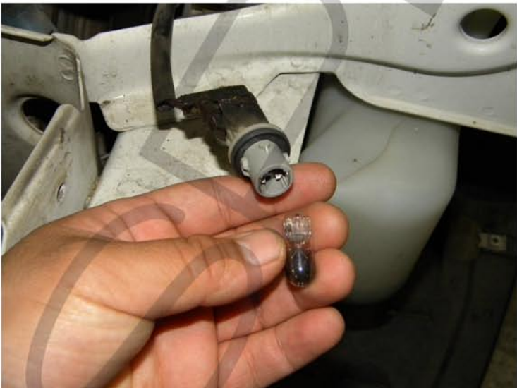
9. Remove driving light light bulb from the car