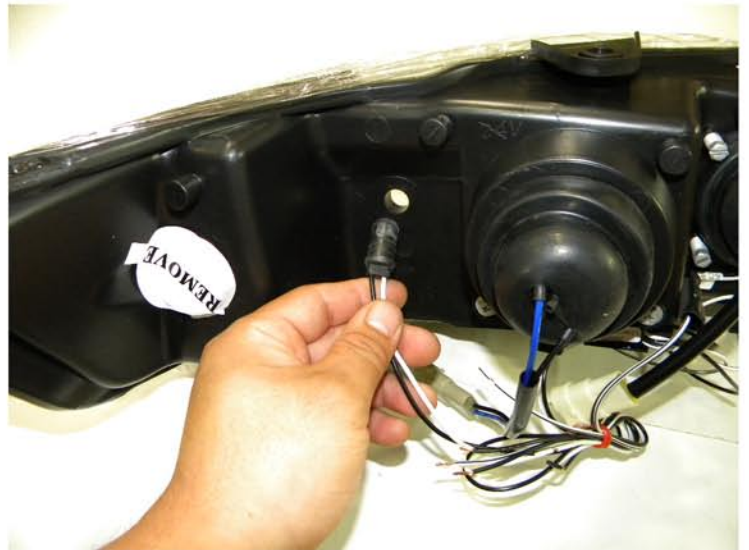
10. Install the light bulb to the NEW projector headlight