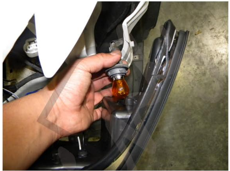
12. Plug back socket, install the new projector headlight