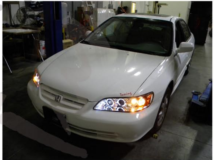
20. Please repeat the step from 1 to 19 for the opposite side