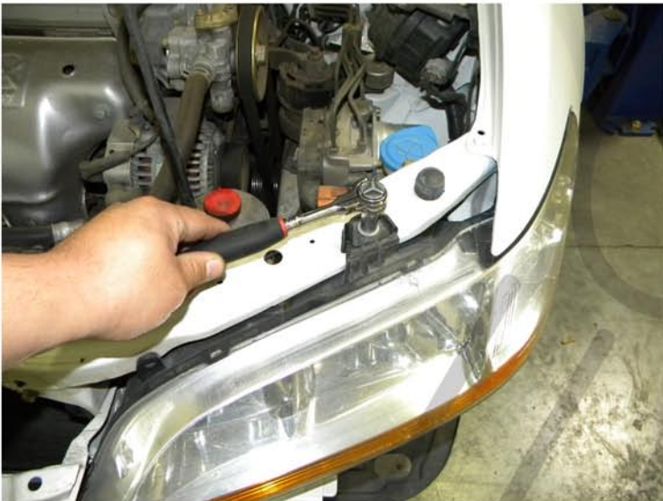
7. Remove one 10mm headlight bolt