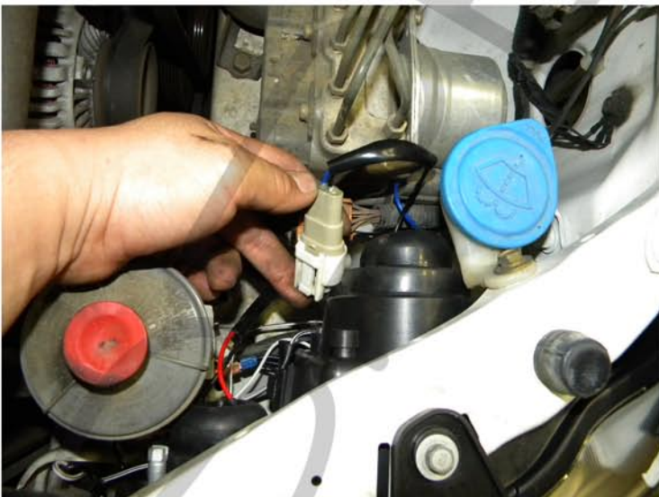
15. Connect the headlight harness