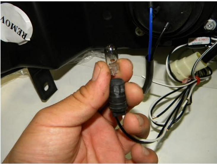
11. Once plugged in, place back into the same location