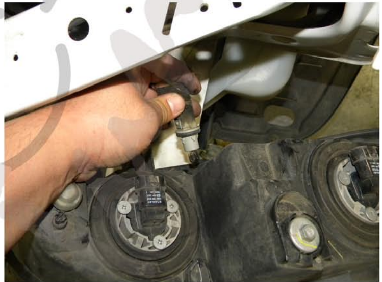
8. Disconnect all harness from the OEM headlight