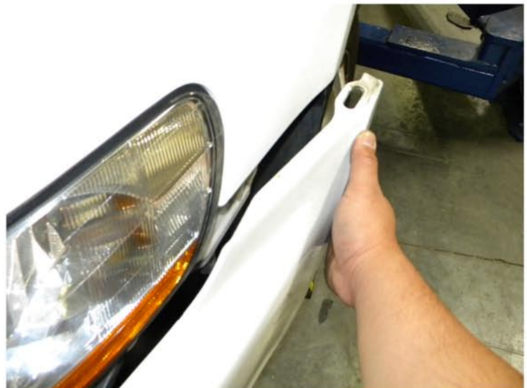
4. Pull out the front bumper from the side