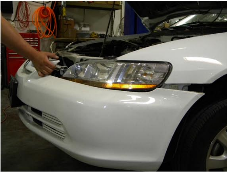
5. Remove the front bumper