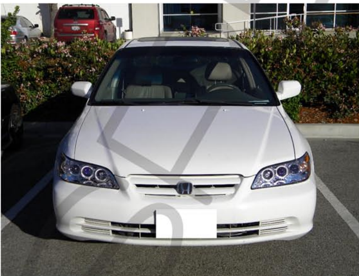
21. The installation is now complete