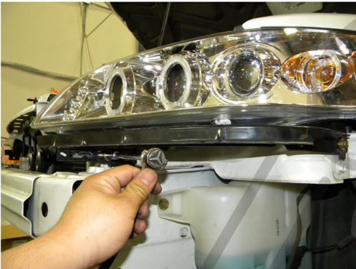
13. Install one 10mm headlight bolt