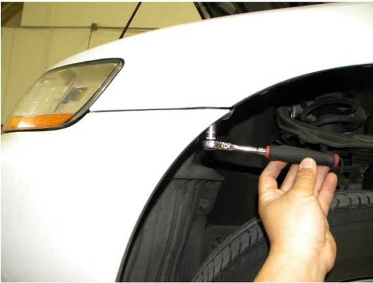
17. Install one 10mm bolt