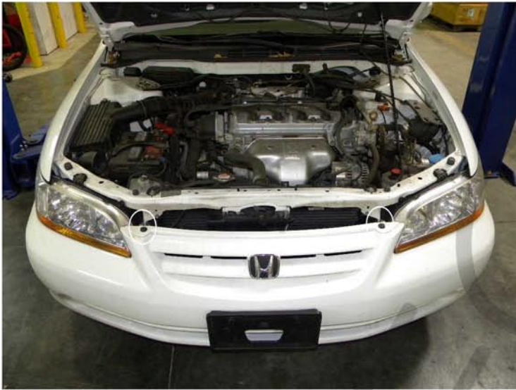
1. Remove two clips

If you experience any difficulties that the instruction did not cover, Please seek local auto shop for advise. Please wear protection before you work on your vehicle. An assistant is helpful when removing the front bumper. Please be careful while working with the bumper or body part to avoid scratching. Do not make direct contact with the halogen bulb or the wire assembly until the unit has cooled down after use.