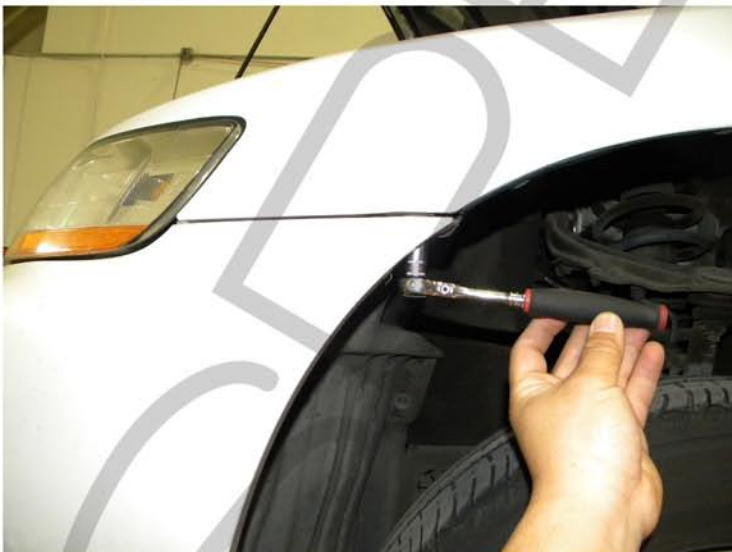
3. Remove one 10mm bolt