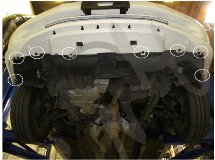
18. Install six clips and two 10mm bolts