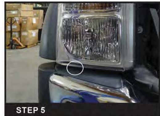
Remove the 10mm headlight bolt at the bottom of the headlight