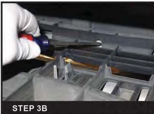
Press down the five clips on the bottom of the front grille