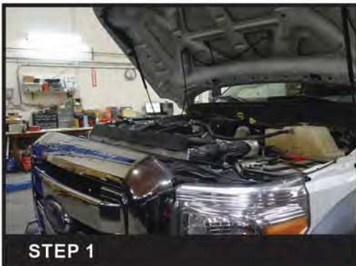
Raise the hood