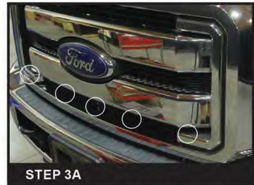
Press down the five clips on the bottom of the front grille