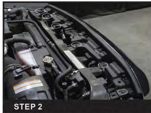
Remove the two fasteners and the four 10mm bolts on the top of the front grille