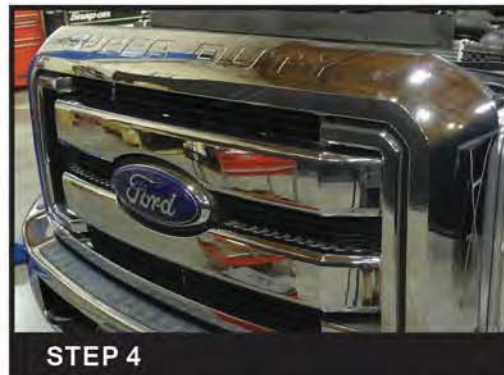
Remove the front grille