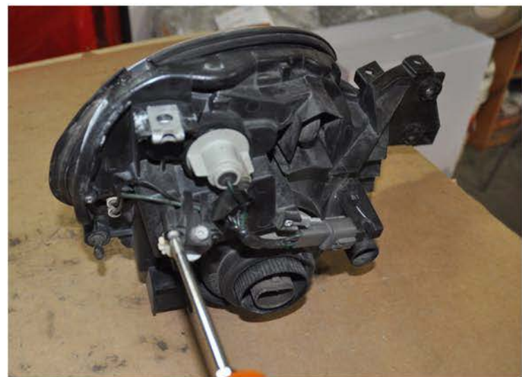
10. Disconnect the headlight harness