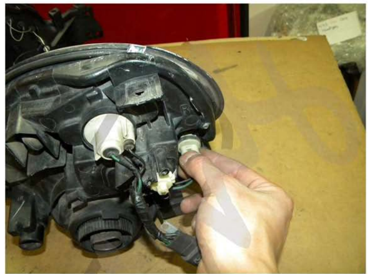
12. Remove the headlight harness