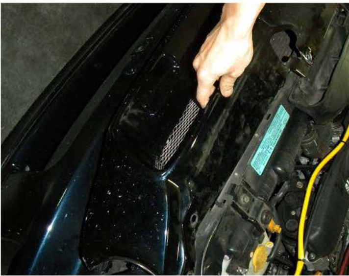
5. Remove the front grill