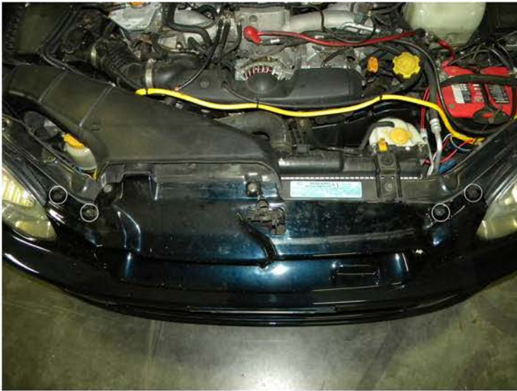
1. (4) plastic clips location