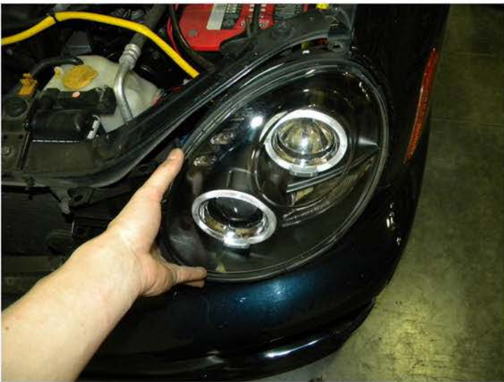
17. Place the new headlight in the stock location