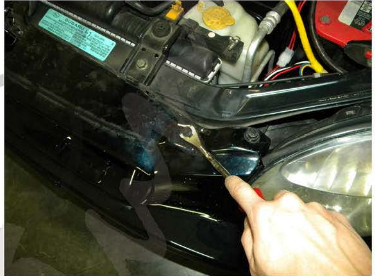
2. Remove the (4) plastic clips