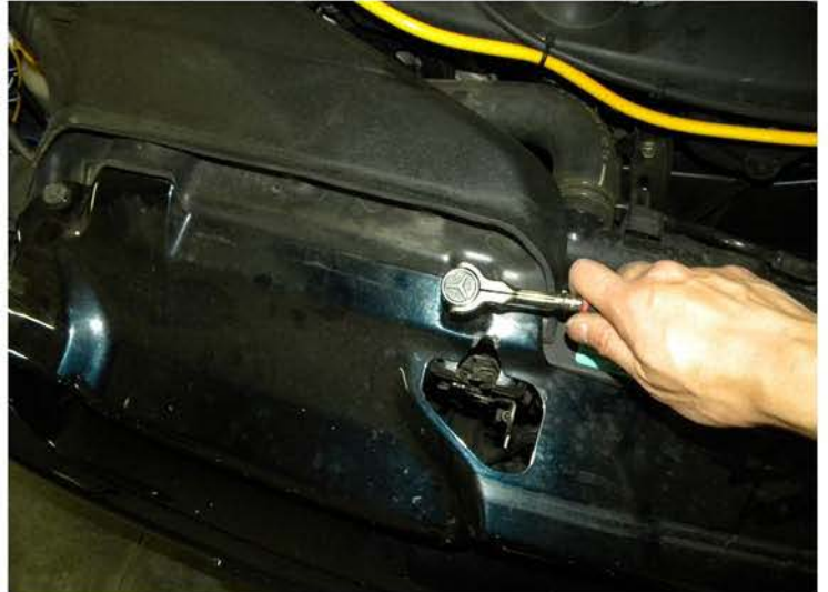
22. Tighten the (2) 10mm bolts