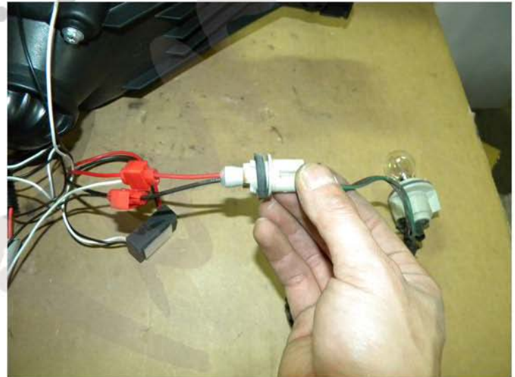
14. Connect the headlight harness to the new light