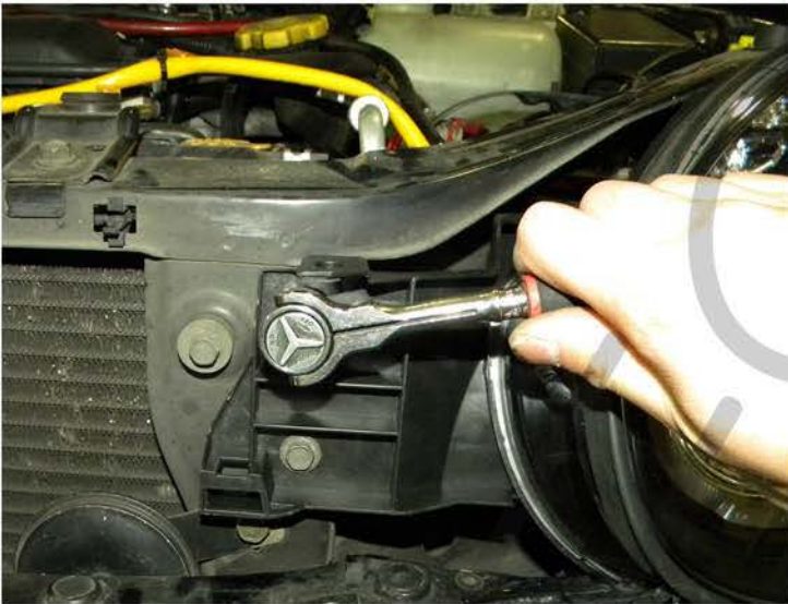
19. Tighten the (2) 10mm bolts