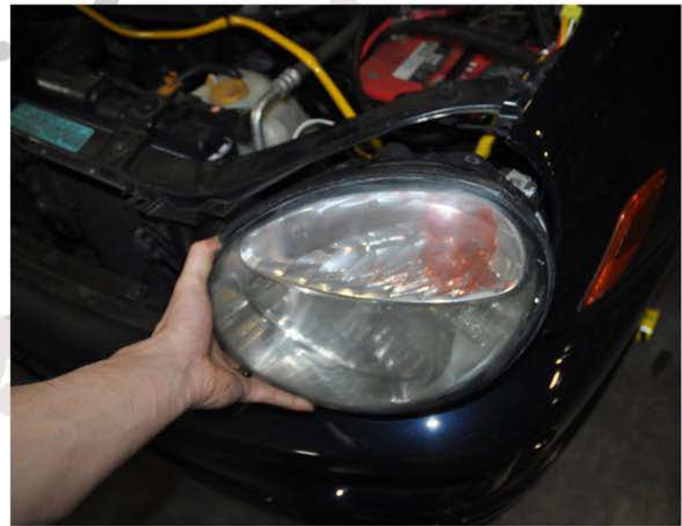
8. Remove the headlight