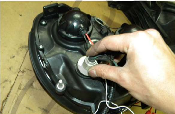
15. Connect the light socket in the new light Please see the "Halo and L.E.D installation instructions" If your headlights don't have HALO or L.E.D. You can skip this step