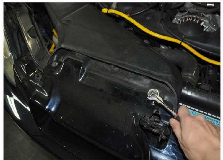
4. Remove the (2) 10mm bolts