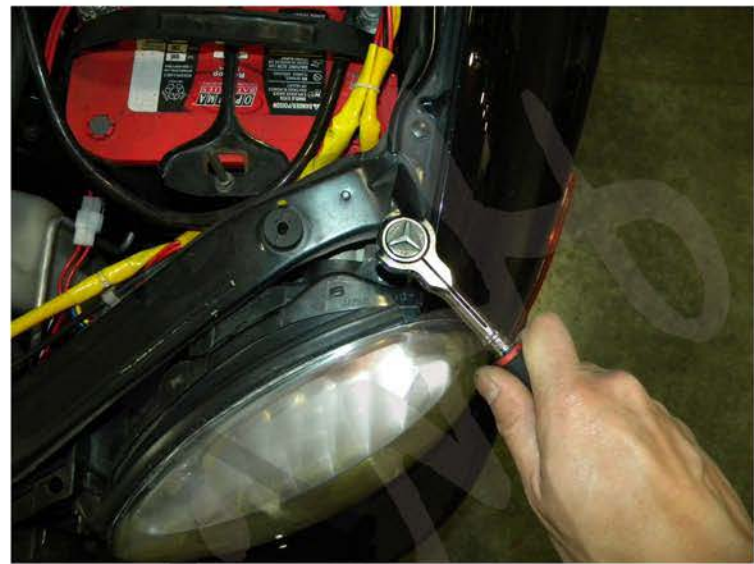
6. Remove the 10mm bolt