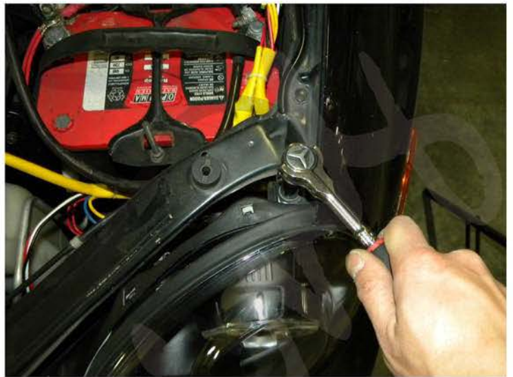
18. Tighten the 10mm bolt