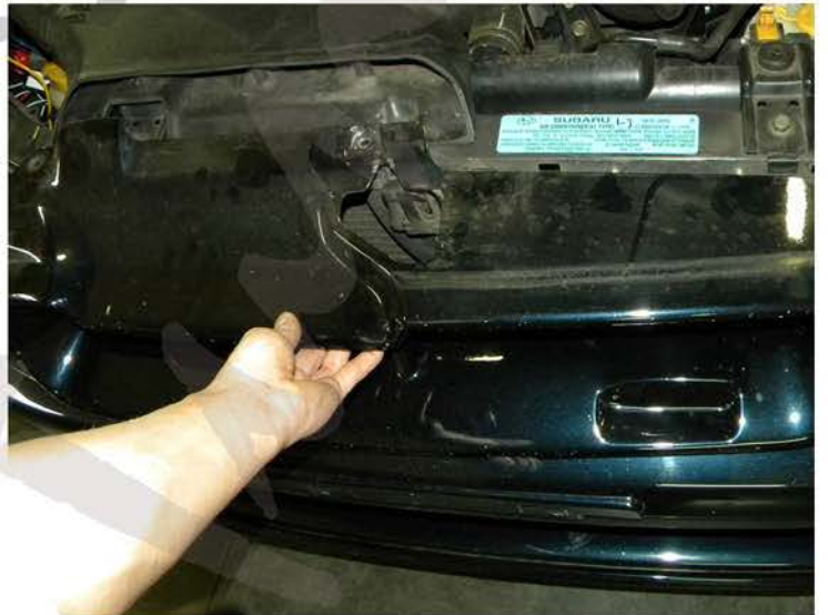
20. Replace the front grill