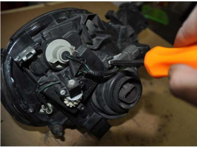
11. Remove the phillips head screw