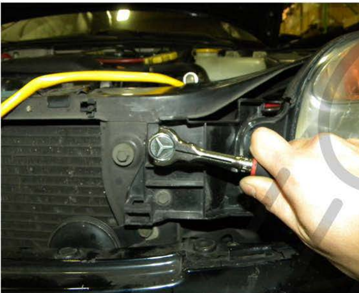
7. Remove the (2) 10mm bolts