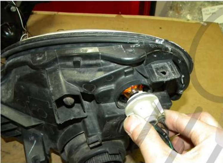
13. Remove the headlight harness