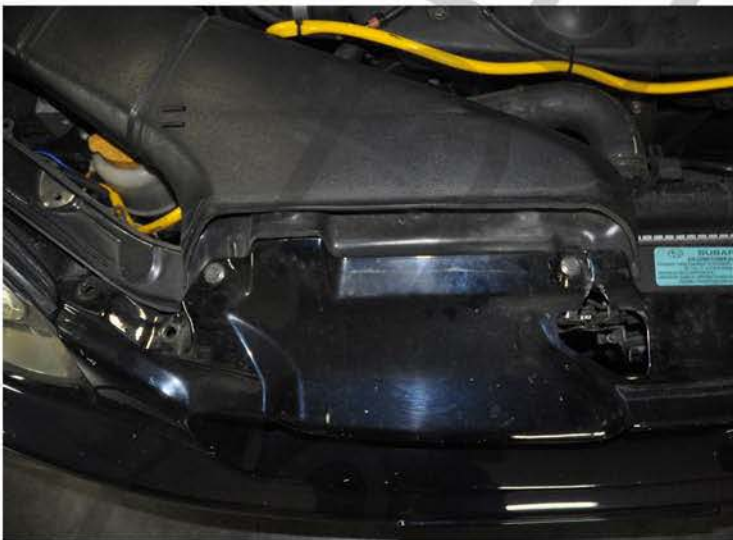
3. (2) 10mm bolts location