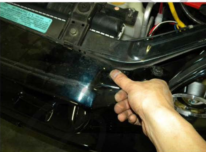
21. Replace the (4) plastic clips