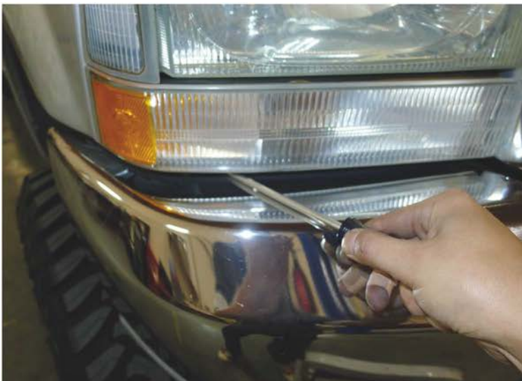
3. Remove the (2) phillips head screws