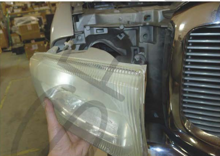
10. Remove the headlight