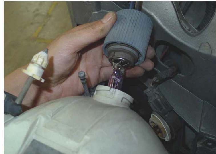
10. Remove the headlight bulb and harness