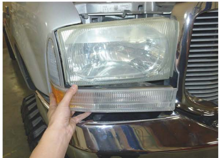
4. Remove the bumper corner light