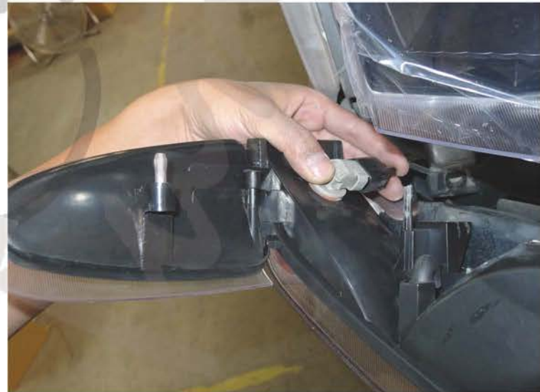
14. Install the light socket into the bumper corner light