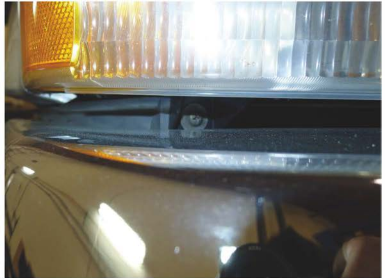
2. Phillips head screw location