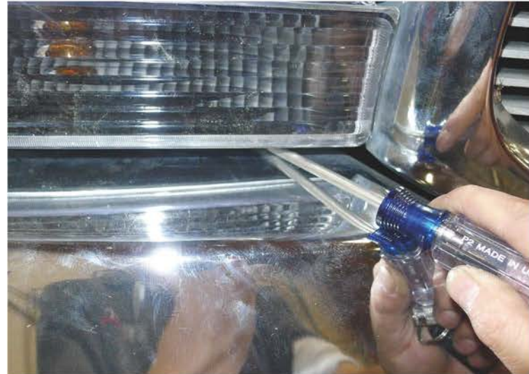
16. Tighten the (2) phillips screws