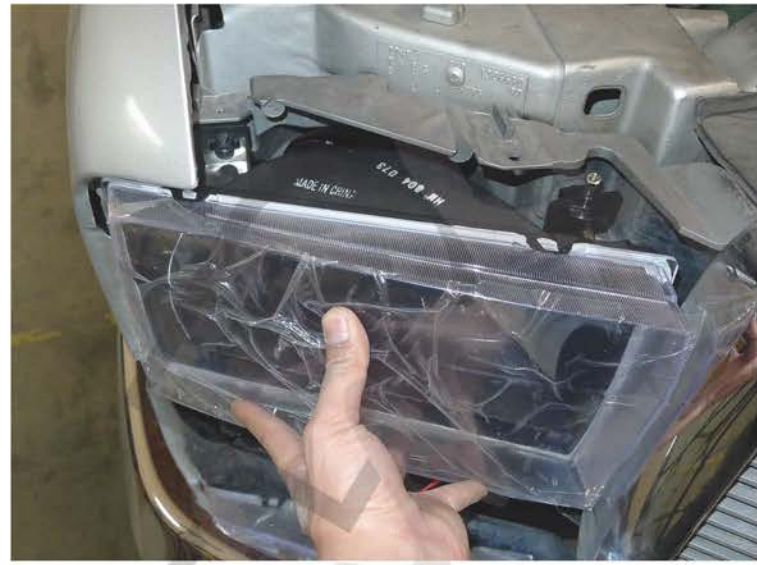
12. Place the new headlight in the stock location