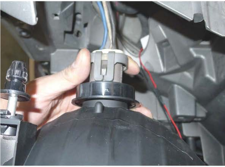
11. Install the headlight bulb and connect the headlight harness to the new headlight Please see the "HALO and L. E. D. head lights installation instructions" If your head lights don't have HALO and L.E.D. You can skip the installation instruction.