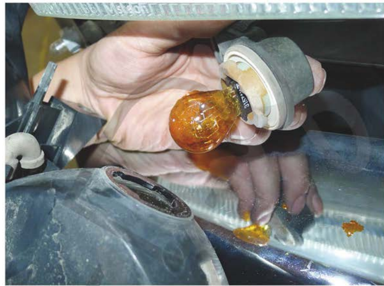
6. Remove the light socket