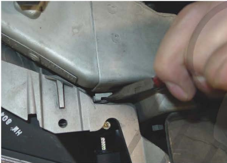
13. Install the light sockets