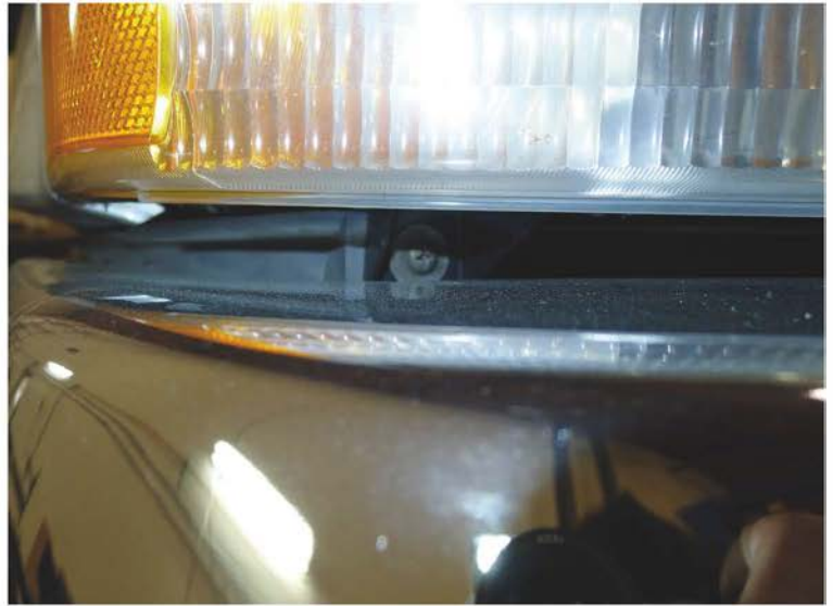
2. Phillips head screw location