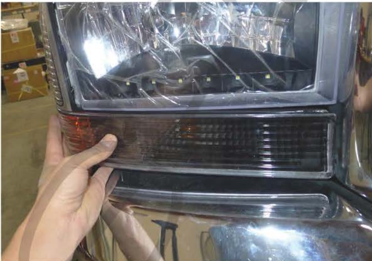
15. Place the bumper corner light into the stock loaction