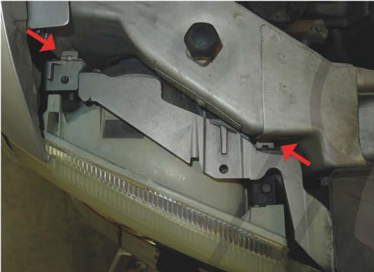
8. (2) metal retaining clip location