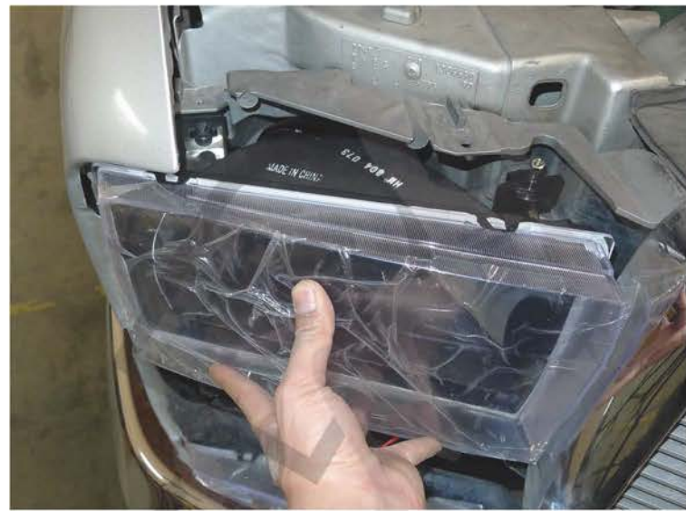
12. Place the new headlight in the stock location