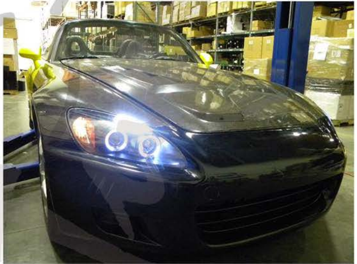
50. . The installation is now complete