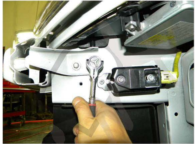
12. Unscrew the (4) 10mm bolts