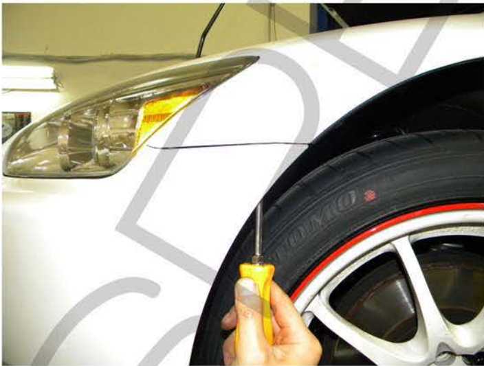
45. Replace and tighten the phillips head screw in the wheelwell