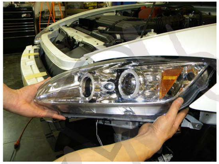
36. Place the new light into the proper location