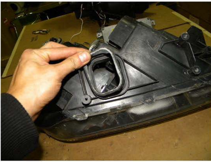
29. Remove the foam grommet