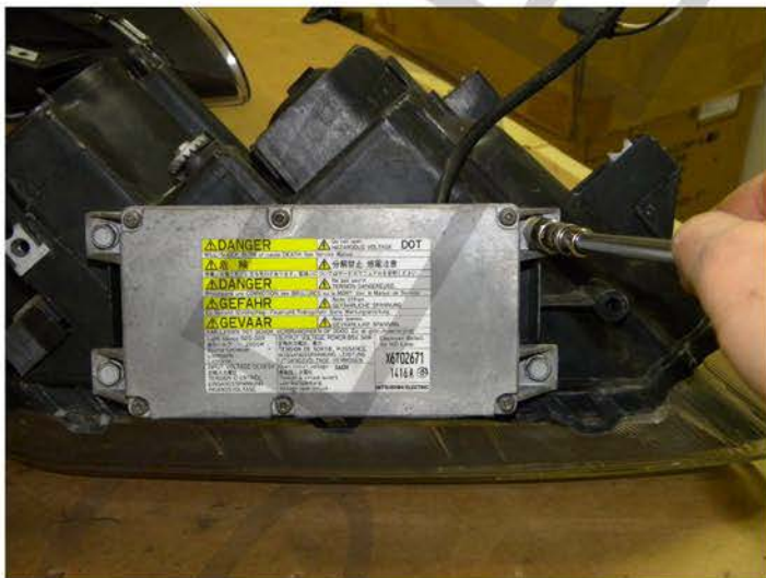
27. Remove the (4) 10mm bolts