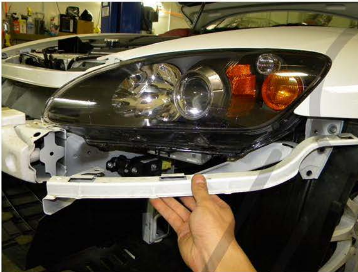
12. Remove the bracket