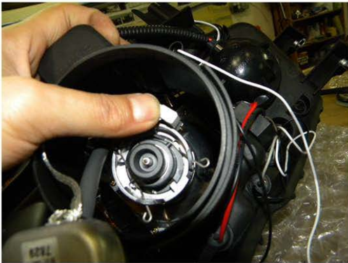
31. Connect the ground connector on the new headlight