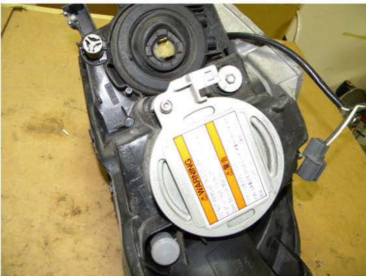
21. Screw location

Please see the "Halo and L.E.D installation instructions" If your headlights don't have HALO or L.E.D. You can skip this step