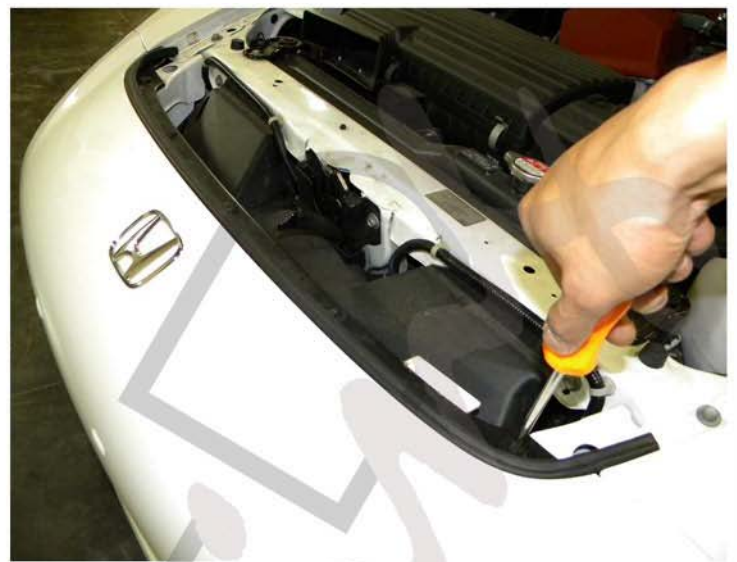
6. Remove the (5) Phillips head screws