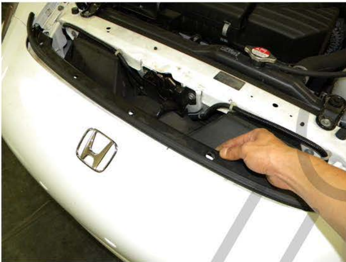
43. Replace the bracket