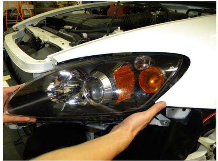
18. Remove the metal headlight bracket