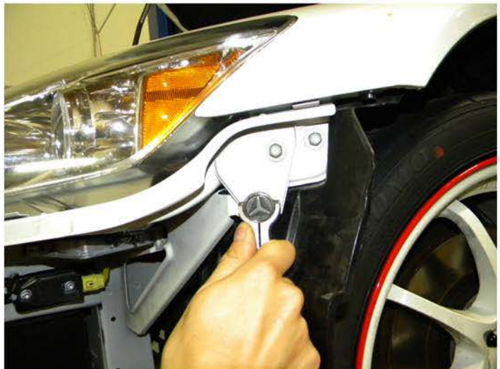
40. Replace the bracket under the headlight and tighten the (4) 10mm bolts