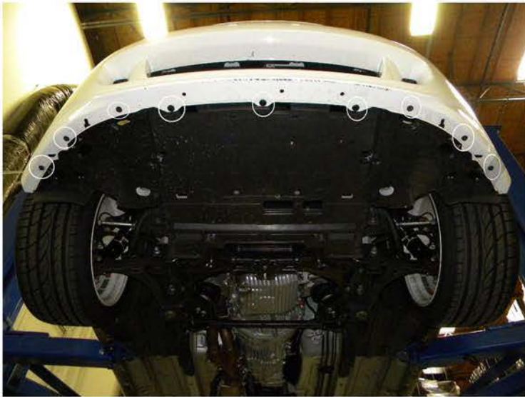
1. Bottom of the front bumper