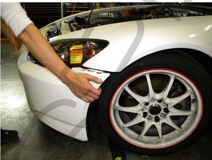
9. Unlatch the sides of the bumper