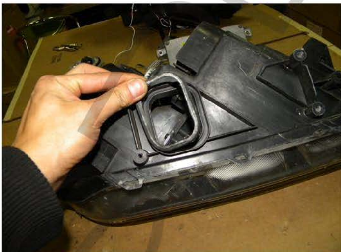
33. Place the foam grommet on the new headlight