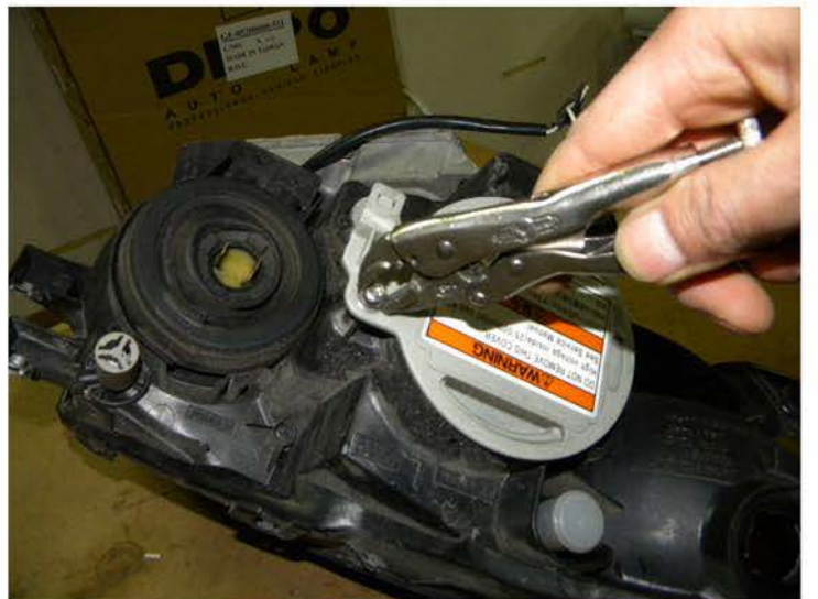
22. Remove the screw

Please see the "Halo and L.E.D installation instructions" If your headlights don't have HALO or L.E.D. You can skip this step