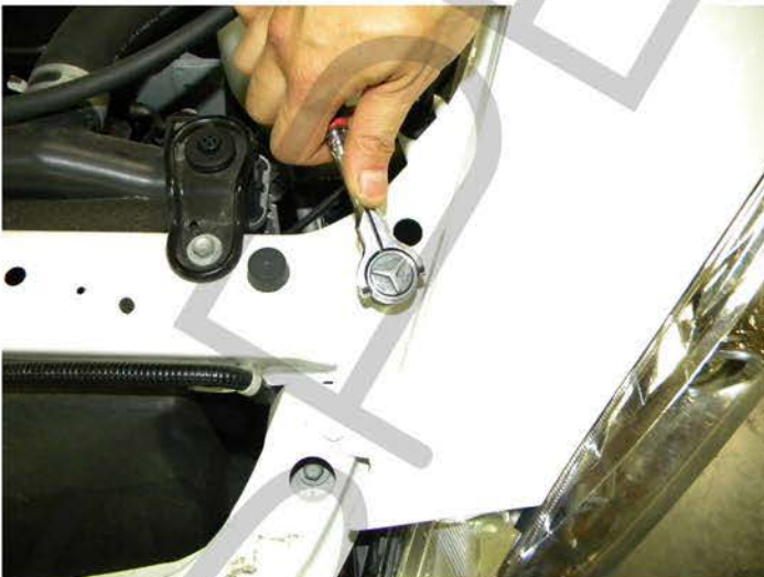
39. Tighten the (2) 10mm bolts located on the top side