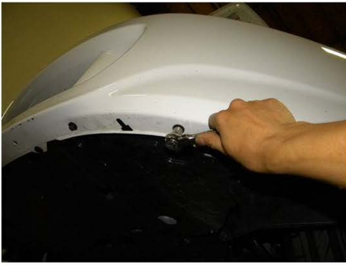
47. Replace the (3) clips and the (6) 10mm bolt on the bottom of the front bumper