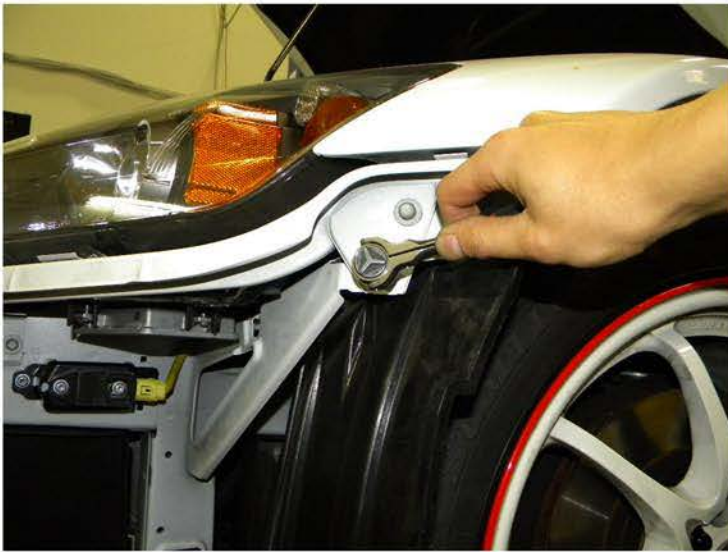
11. Unscrew the (4) 10mm bolts