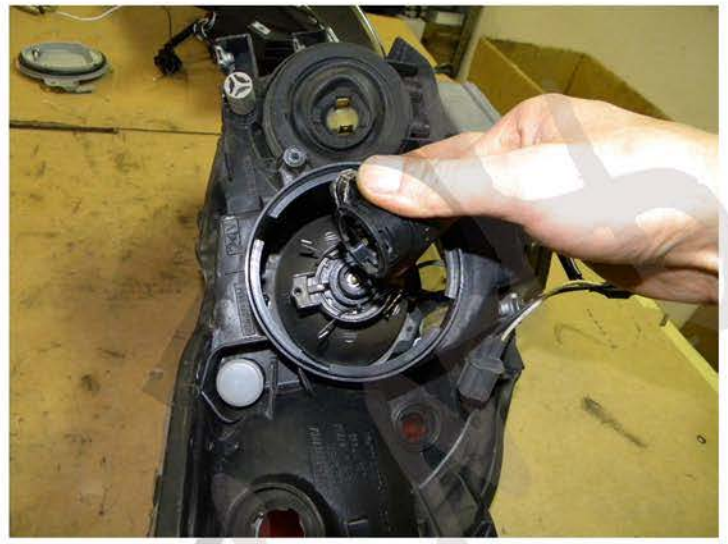
24. Remove the HID light socket