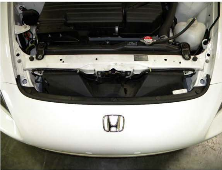
5. Top of the front bumper