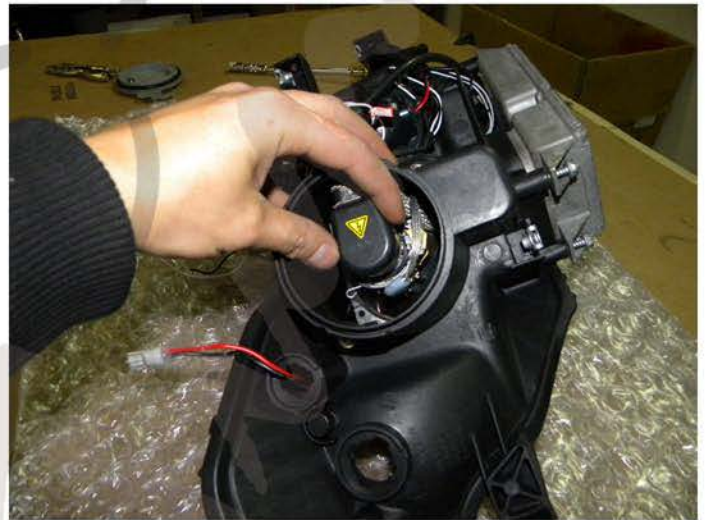
32. Connect the HID socket to the HID bulb