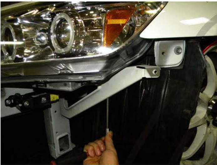
37. Replace and tighten the 10mm bolt located underneath the headlight housing