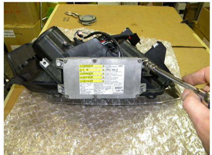
34. Place the ballast on the new headlight ,and tighten the (4) 10mm bolts