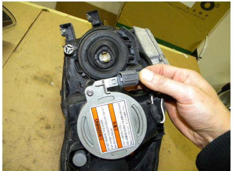
20. Remove the connector