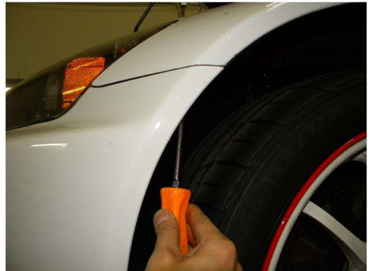
4. Remove the phillips head screw from the wheel well