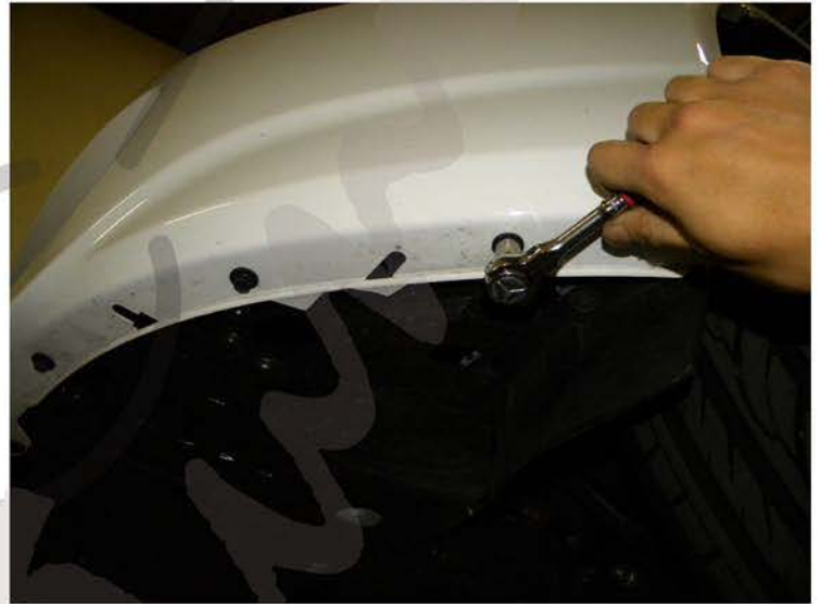
2. Remove the (6) 10mm bolts