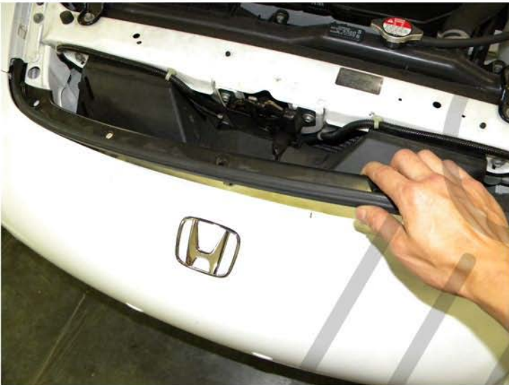
7. Remove the bracket