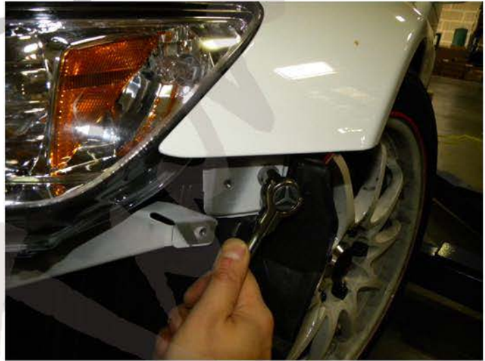
38. Replace and tighten the 10mm bolt located on the side of the housing