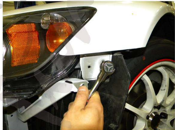
13. Remove the 10mm bolt located on the side of the headlight housing