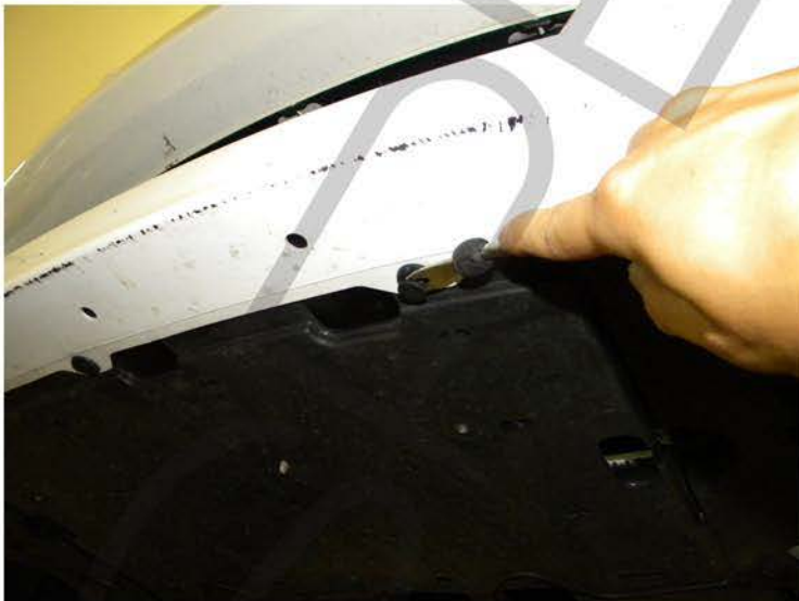
3. Remove the (3) clips