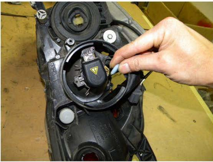
23. Remove the ground wire