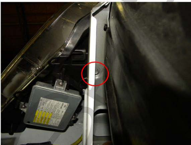
15. Location of the 10mm bolt under the headlight housing