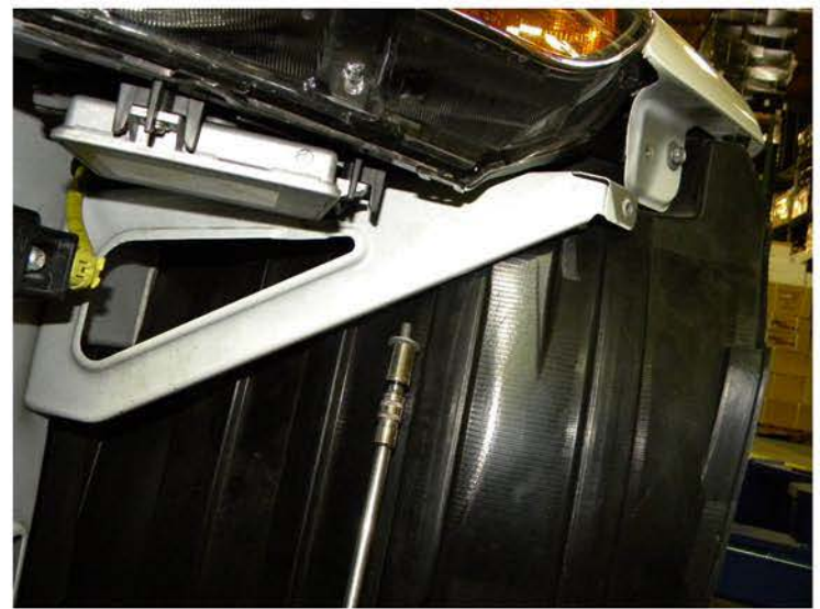
16. Remove the 10mm bolt located under the headlight housing