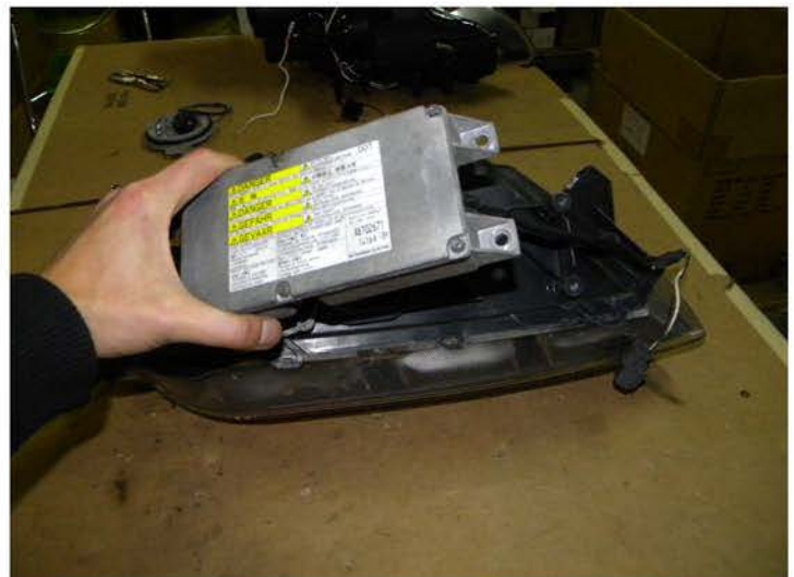
28. Remove the ballast assembly