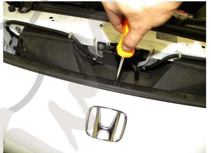
44. Secure the (5) phillips head screws