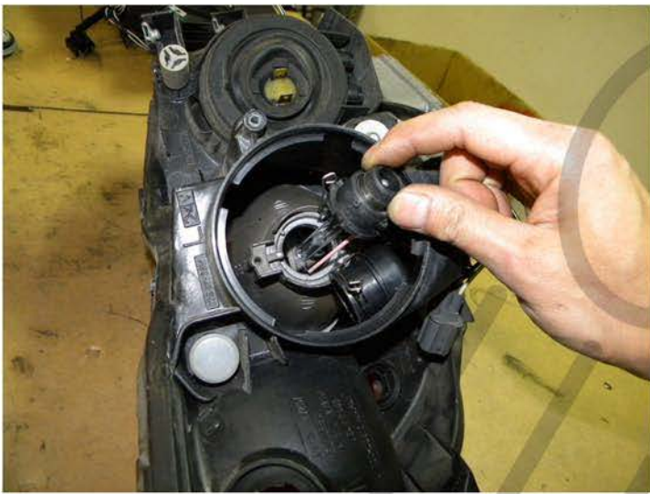
25. Remove the HID bulb