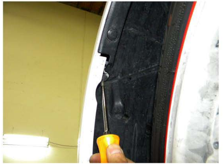
46. Replace and tighten the phillips head screws in the wheelwell