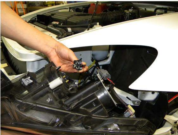
19. Remove the wiring harness and the sockets from the headlight housing