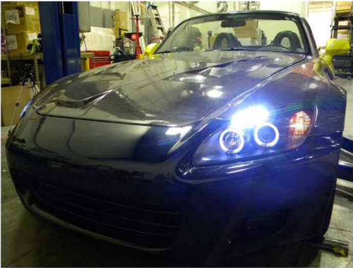
49. Please repeat the steps in order from 1 to 48 for the opposite side