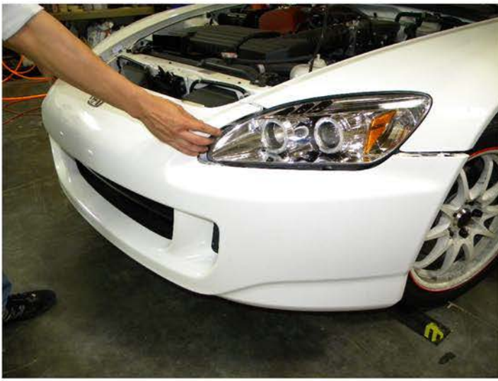
41. Replace the front bumper