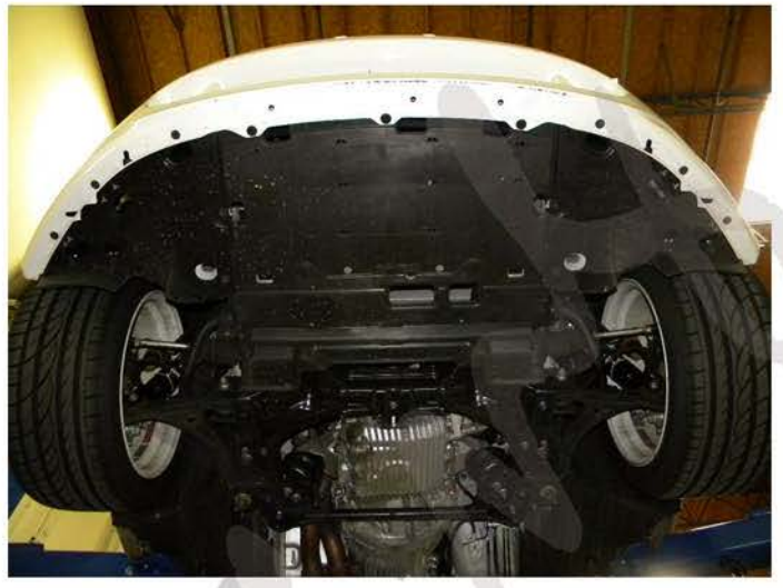
48. Replace the (3) clips and the (6) 10mm bolts on the bottom of the front bumper