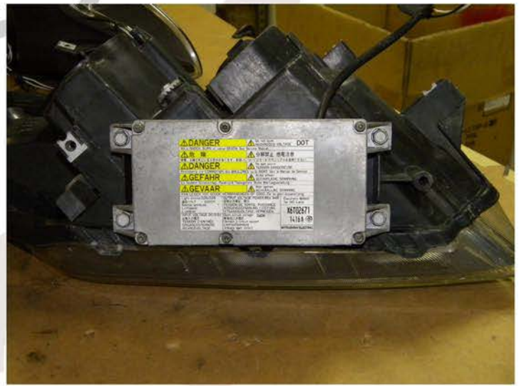
26. (4) 10mm bolts location