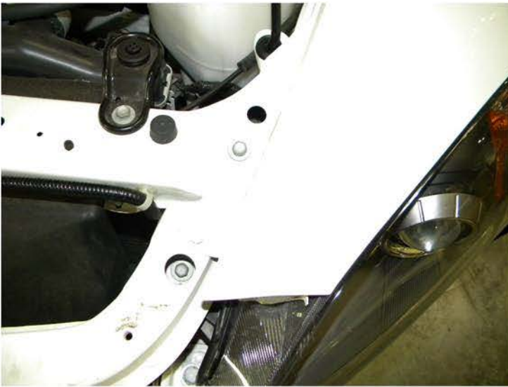
17. Location of the (2) 10mm bolts are towards the top side of the headlight