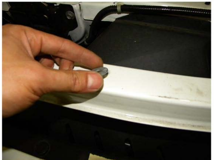
10. Remove the (5) washers