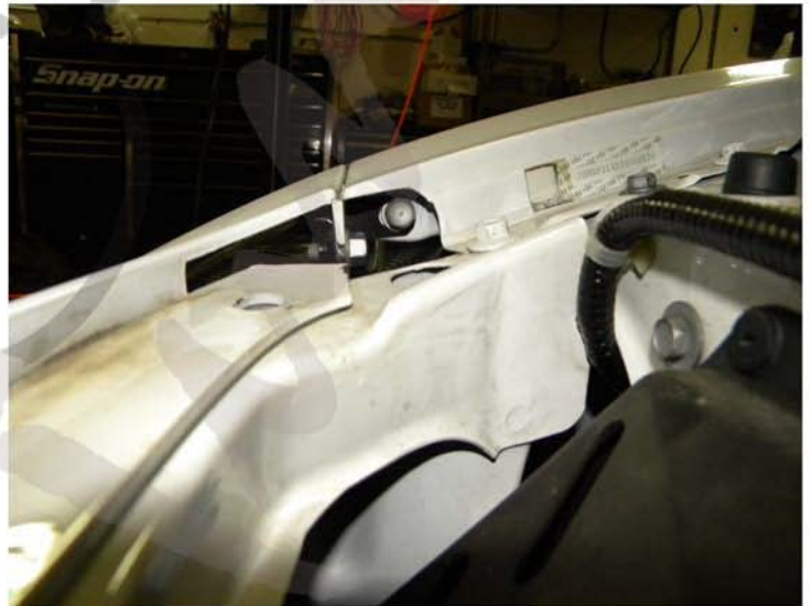
8. 10mm bolt location