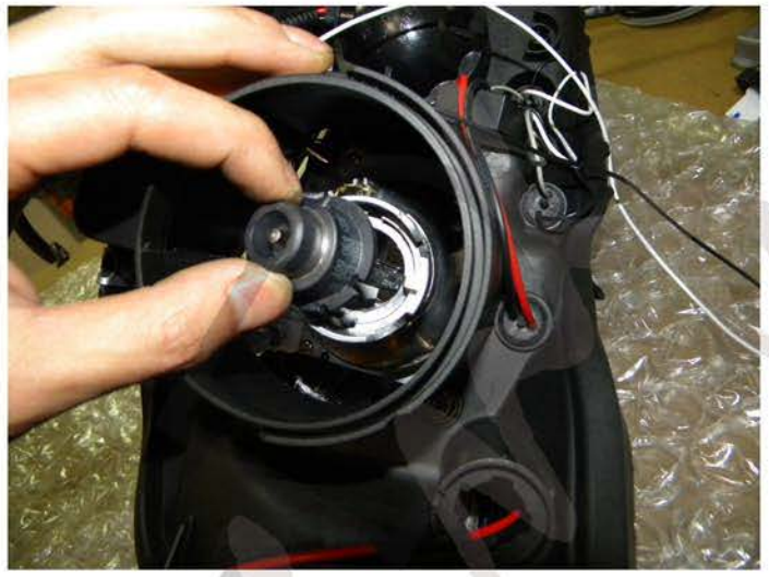
30. Place and secure the HID bulb in the new headlight